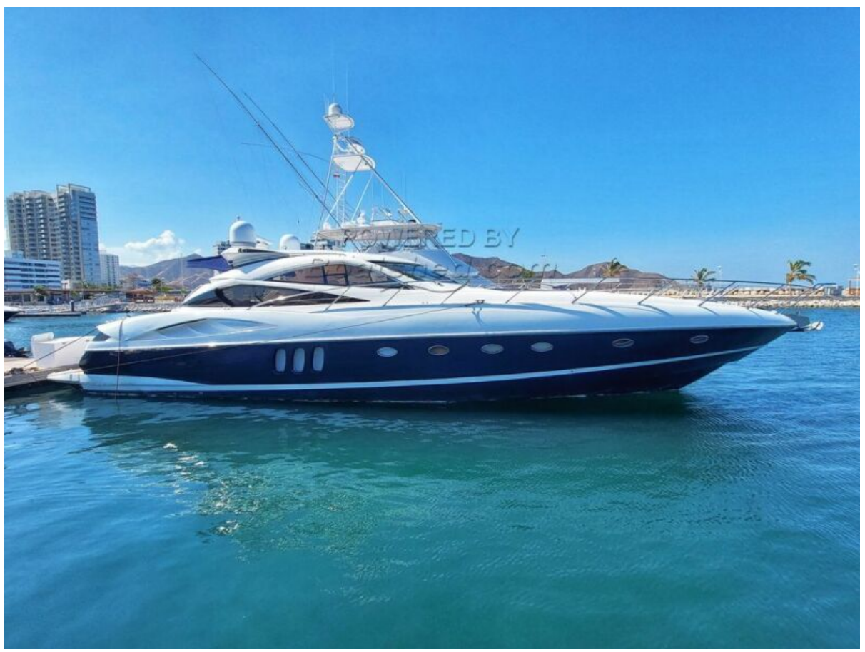
Main Photo 0