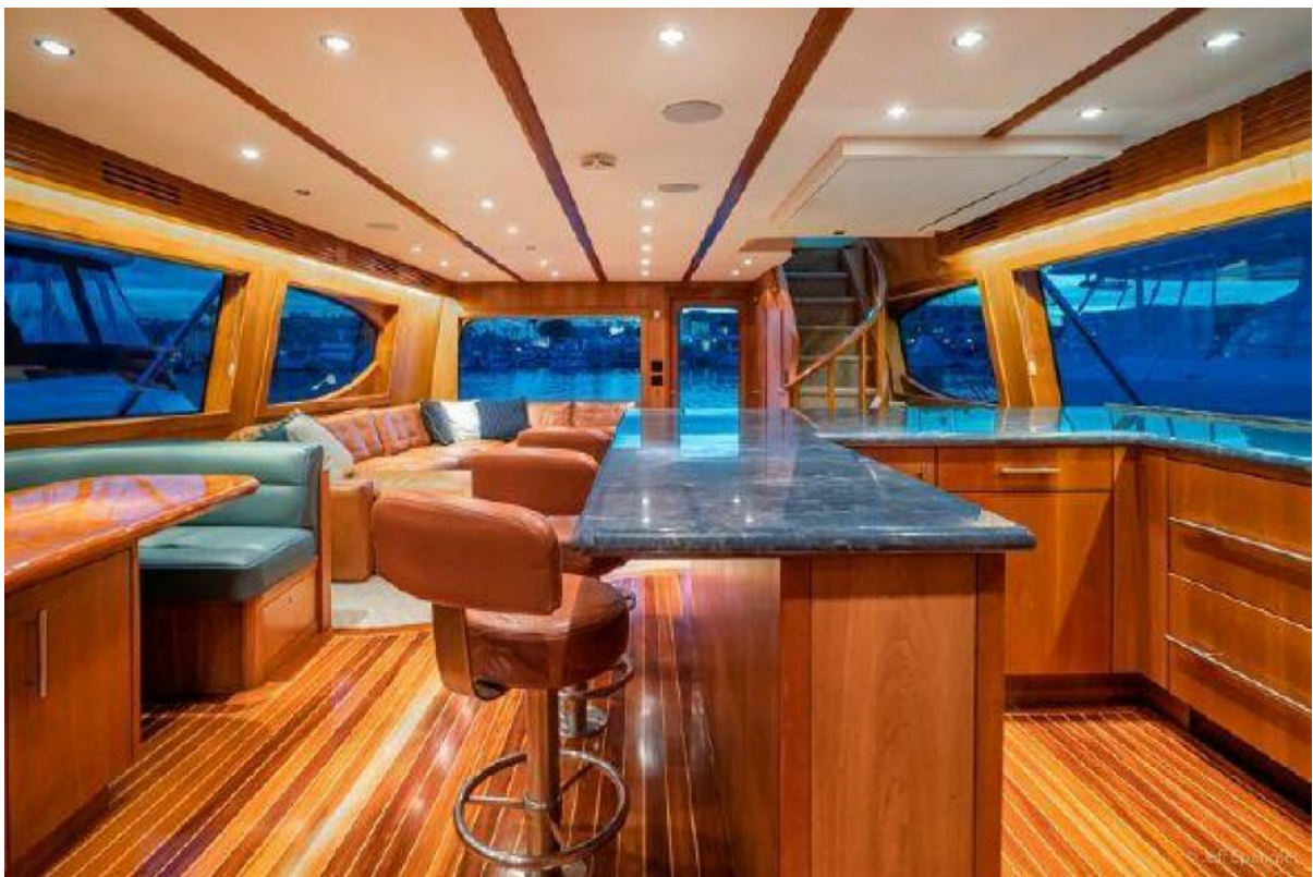
2008 77 Enclosed Bridge "Desperado" -Galley