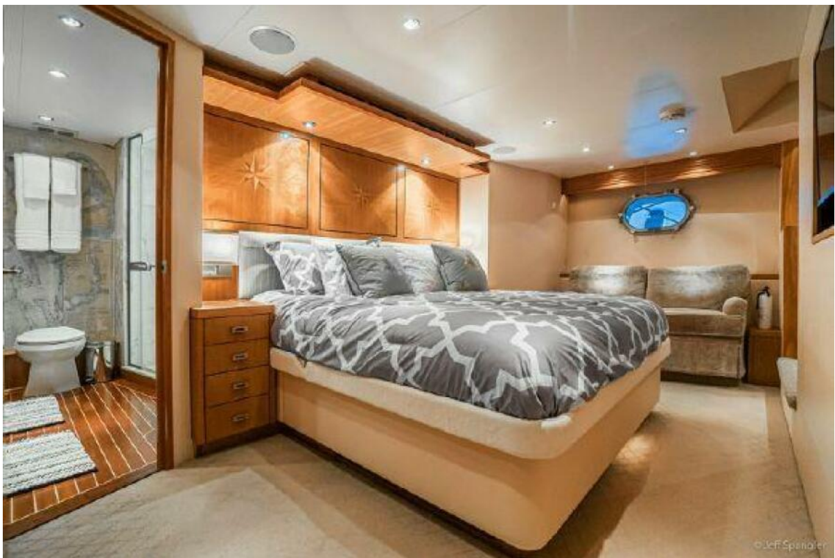
2008 77 Enclosed Bridge "Desperado"-Master Stateroom