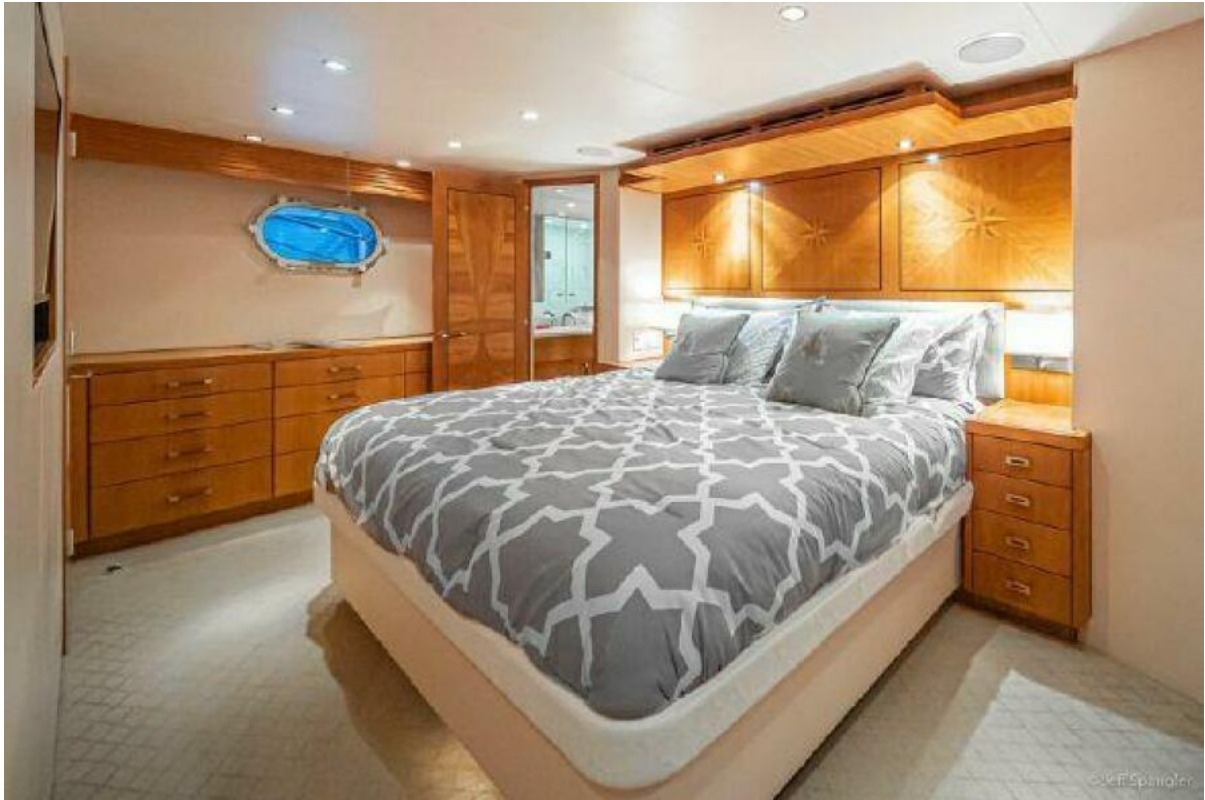
2008 77 Enclosed Bridge "Desperado"-Master Stateroom