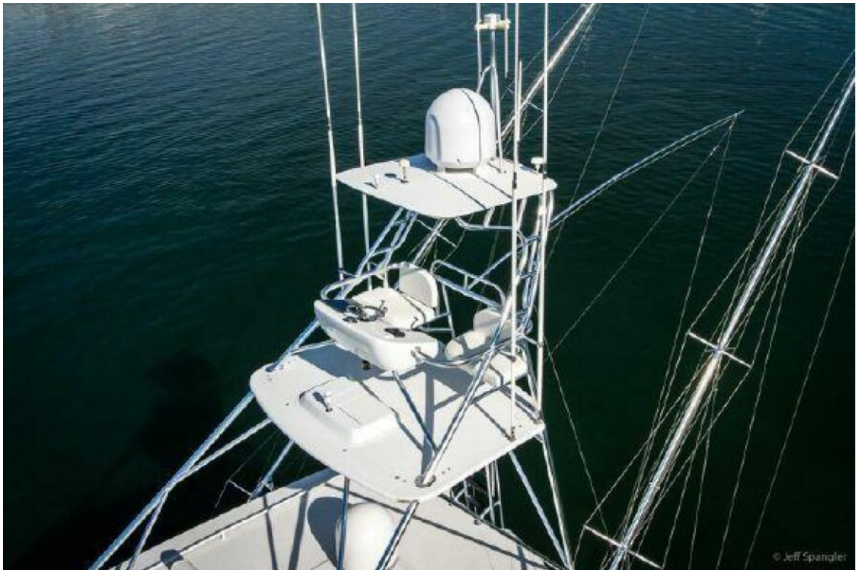
2008 77 Enclosed Bridge-"Desperado"-Fly Bridge