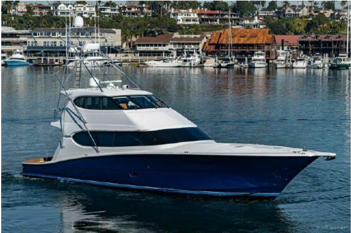
2008 Hatteras 77 Enclosed Bridge "Desperado"