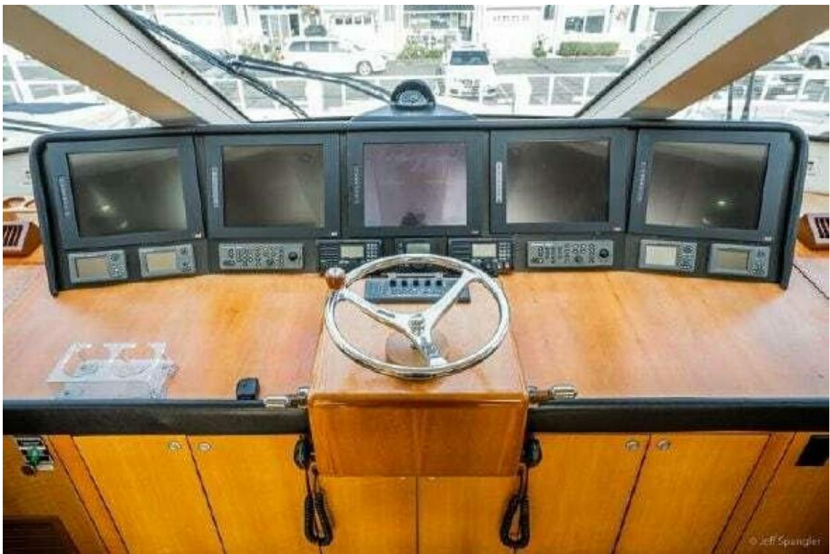
2008 77 Enclosed Bridge "Desperado"-Helm"