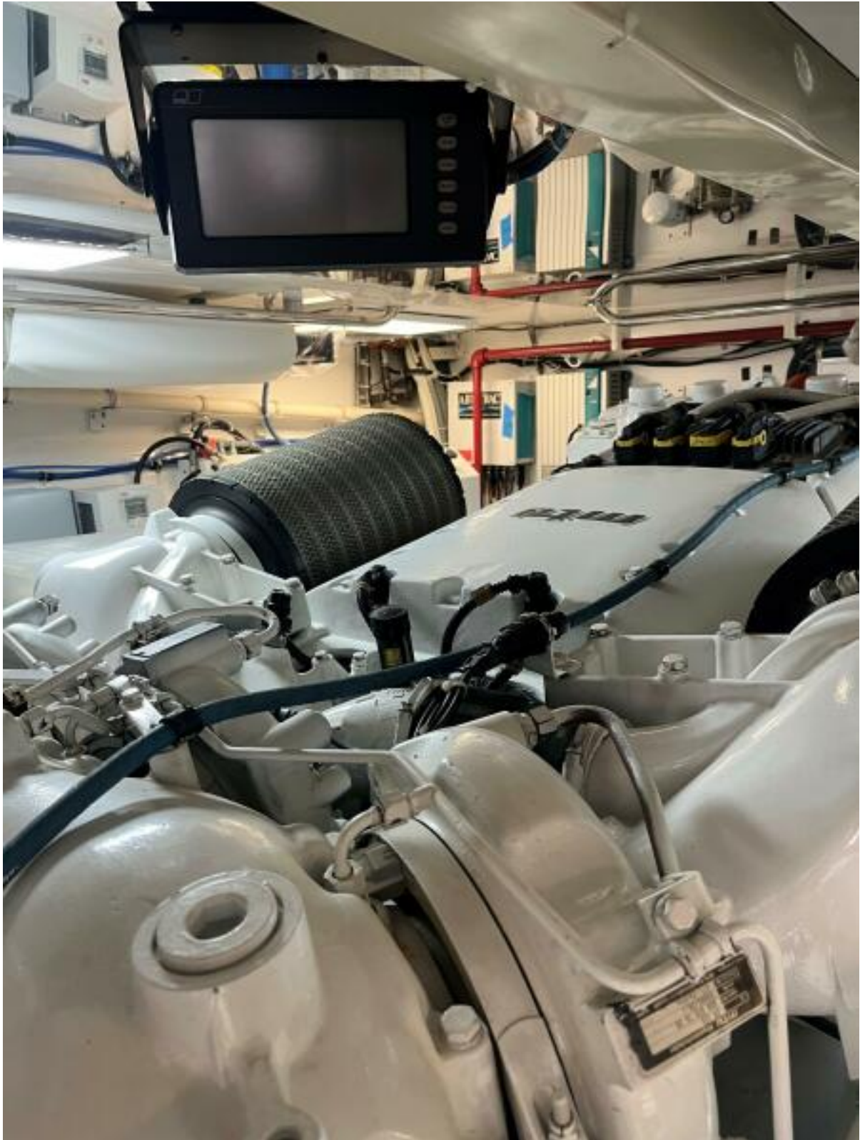
2008 77 Enclosed Bridge "Desperado"-Engine Room"