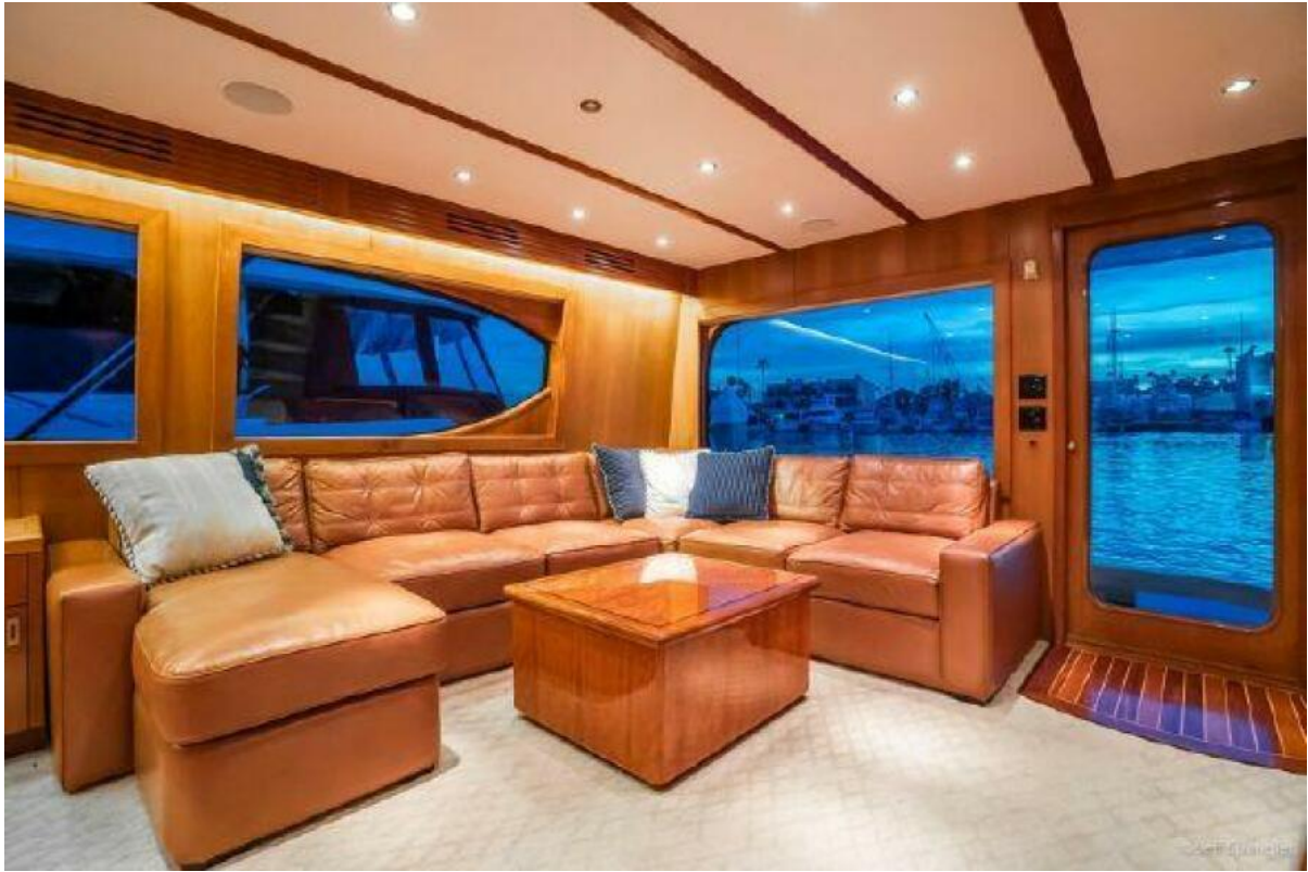
2008 Hatteras 77 Enclosed Bridge "Desperado"-Salon'