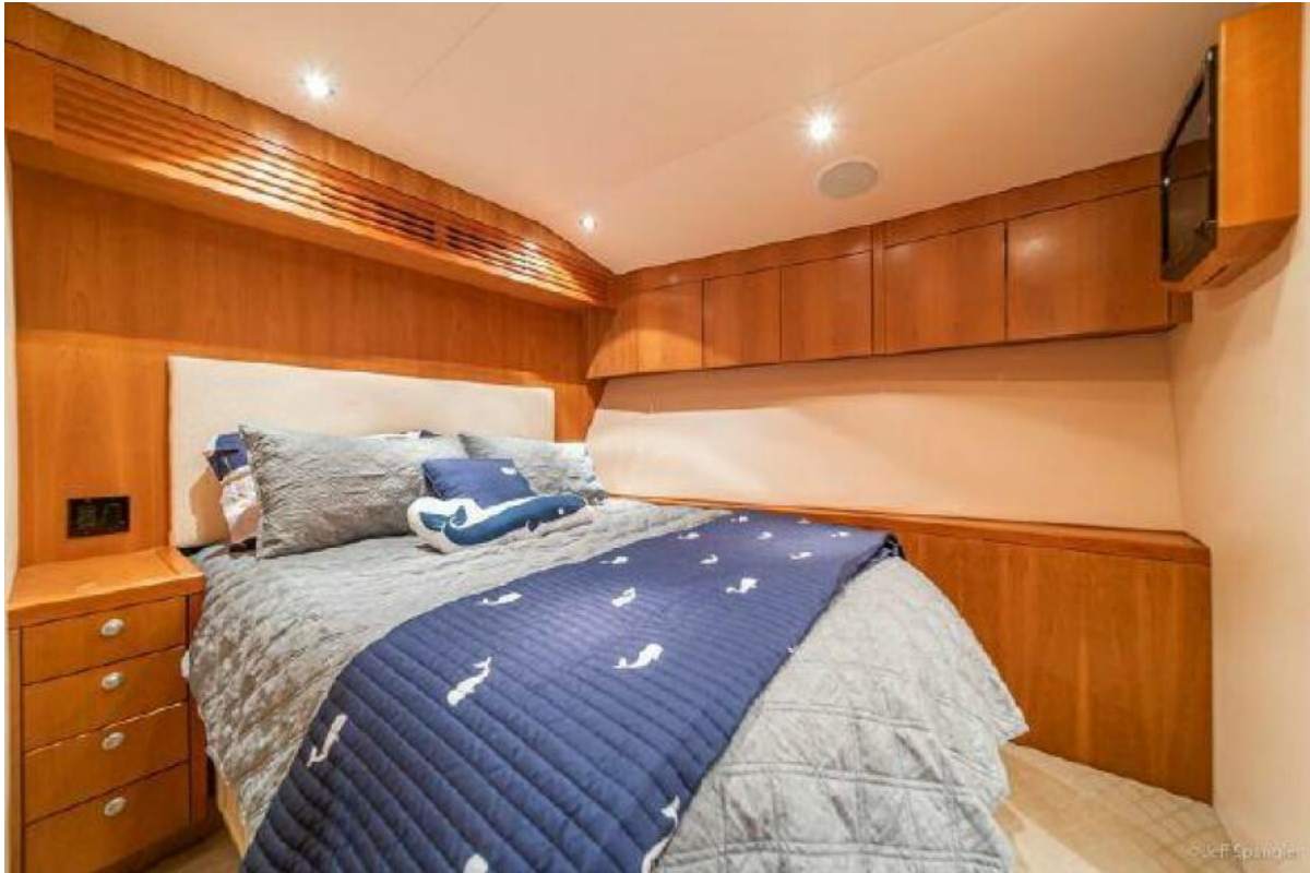
2008 77 Enclosed Bridge-"Desperado"-Guest Stateroom