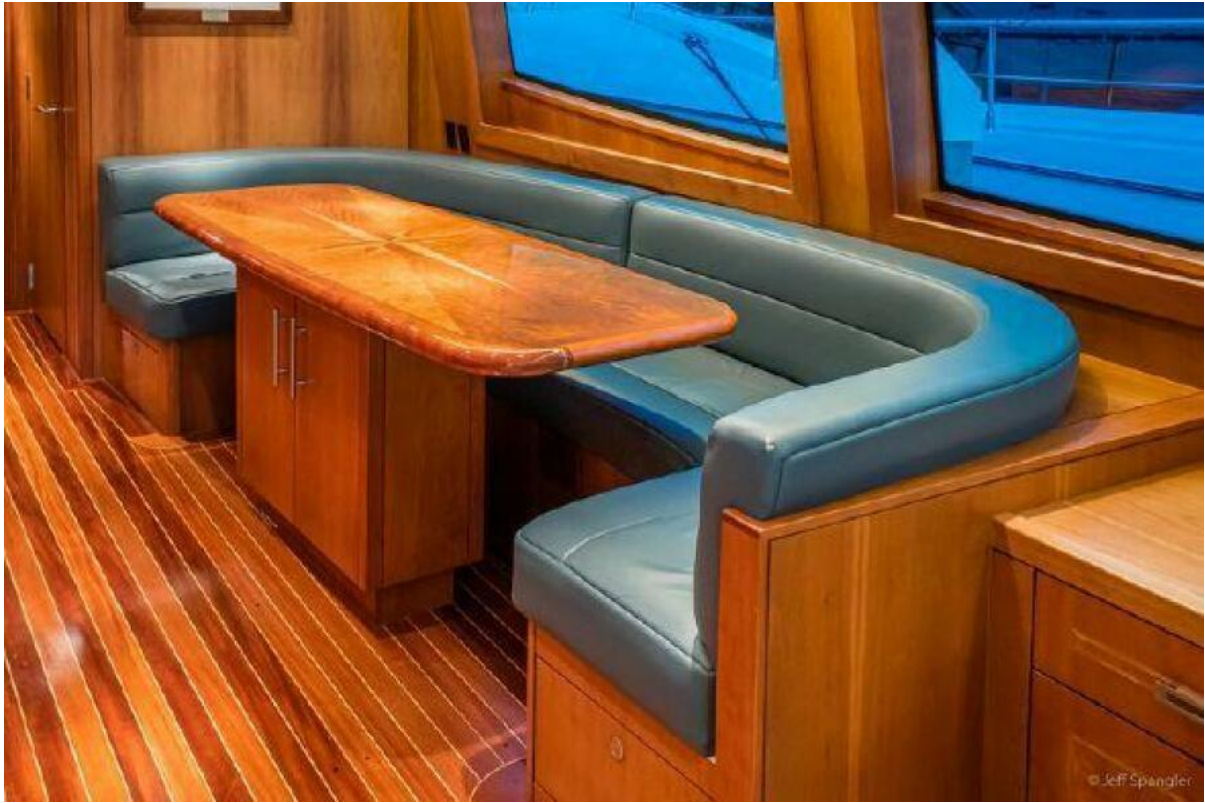
2008 77 Enclosed Bridge "Desperado"-Dinette