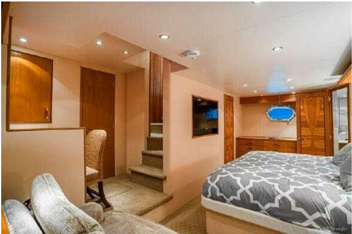
2008 77 Enclosed Bridge "Desperado"-Master Stateroom