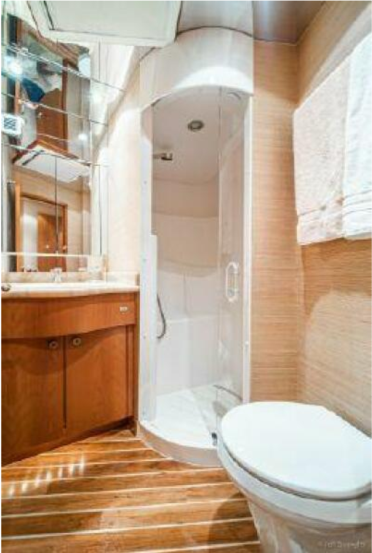
2008 77 Enclosed Bridge "Desperado"-Guest Stateroom Head 2