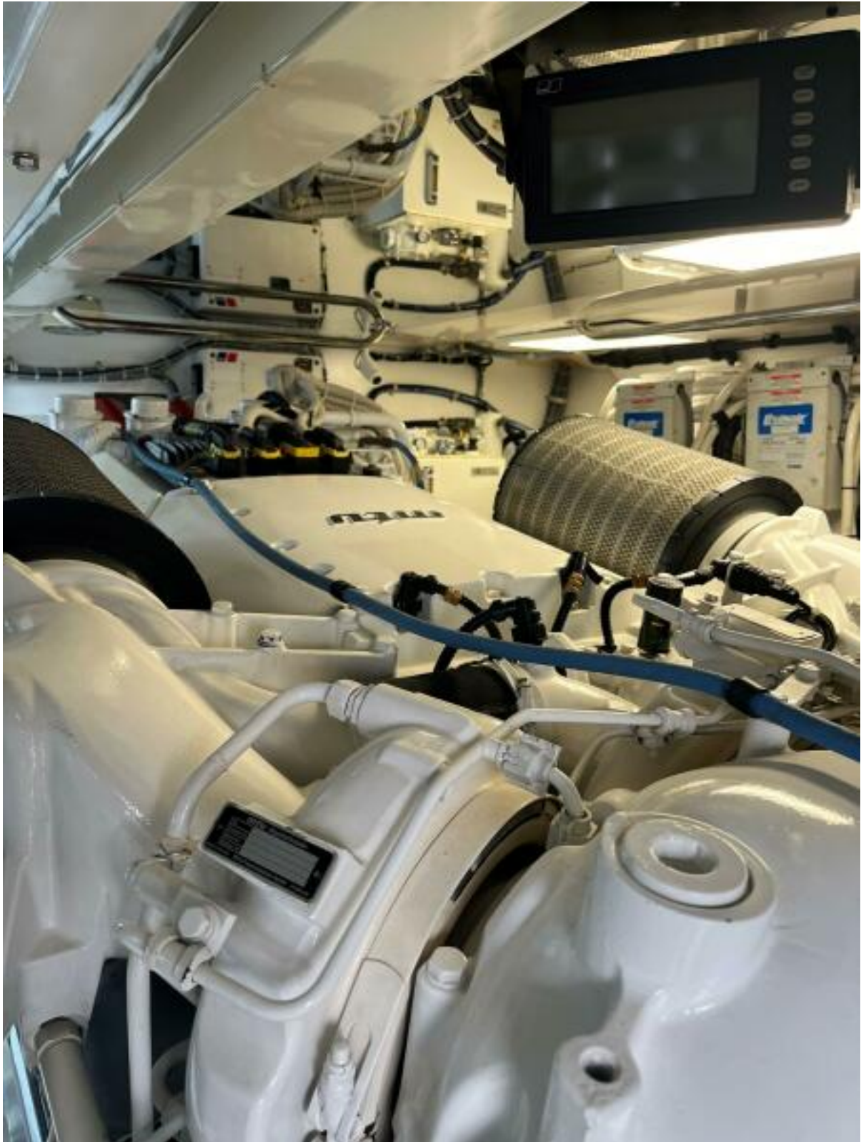
2008 77 Enclosed Bridge "Desperado"-Engine Room