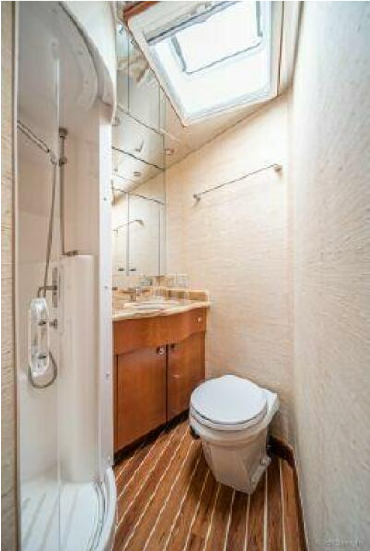
2008 77 Enclosed Bridge "Desperado" -Port State Head 2