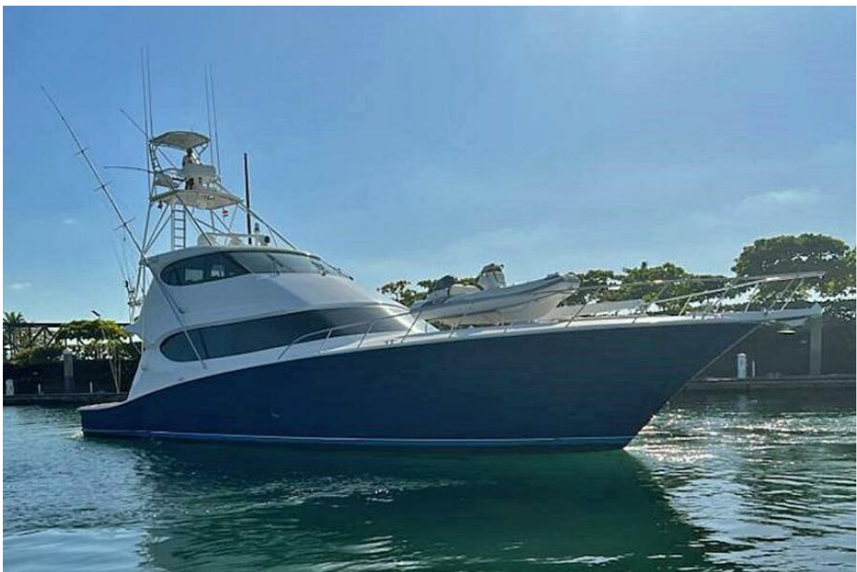
2008 Hatteras 77 Enclosed Bridge "Desperado"-Profile