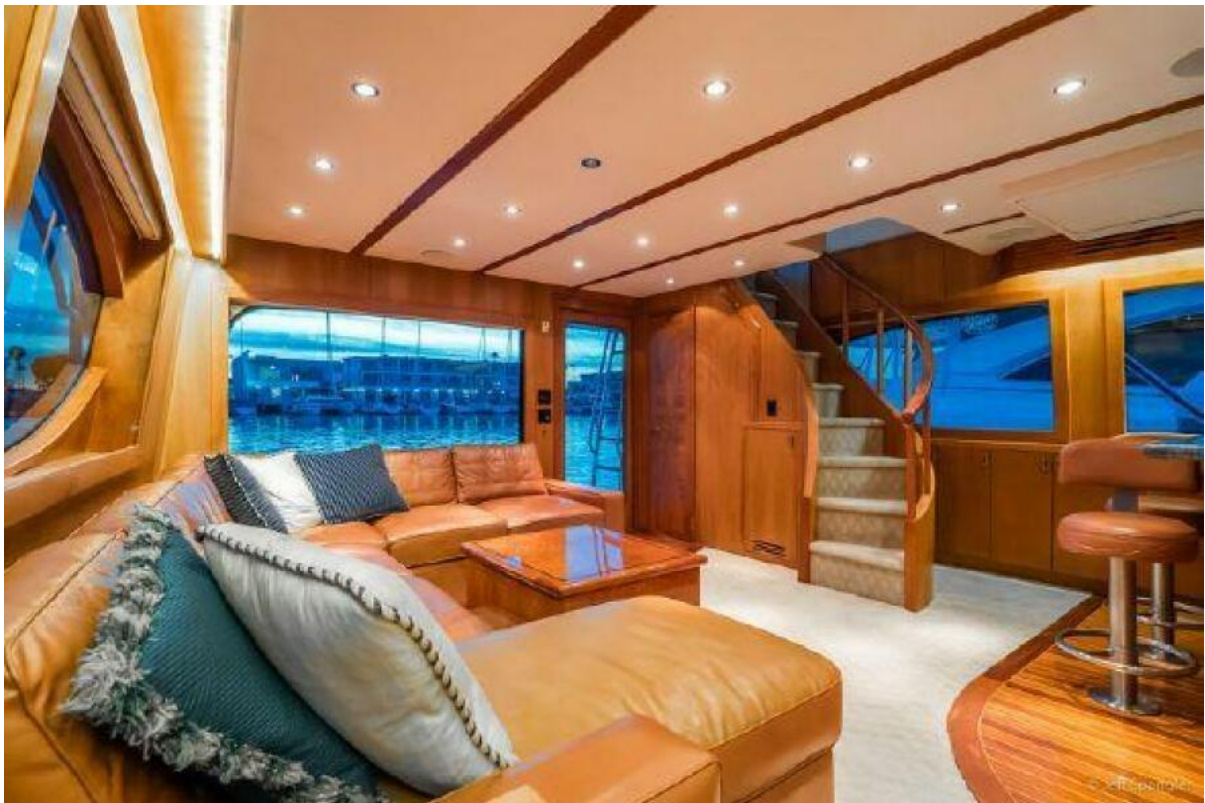
2008 Hatteras 77 Enclosed Bridge "Desperado"-Galley