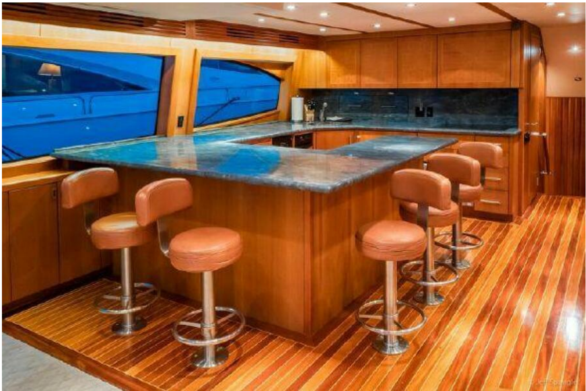
2008 77 Enclosed Bridge "Desperado"-Galley