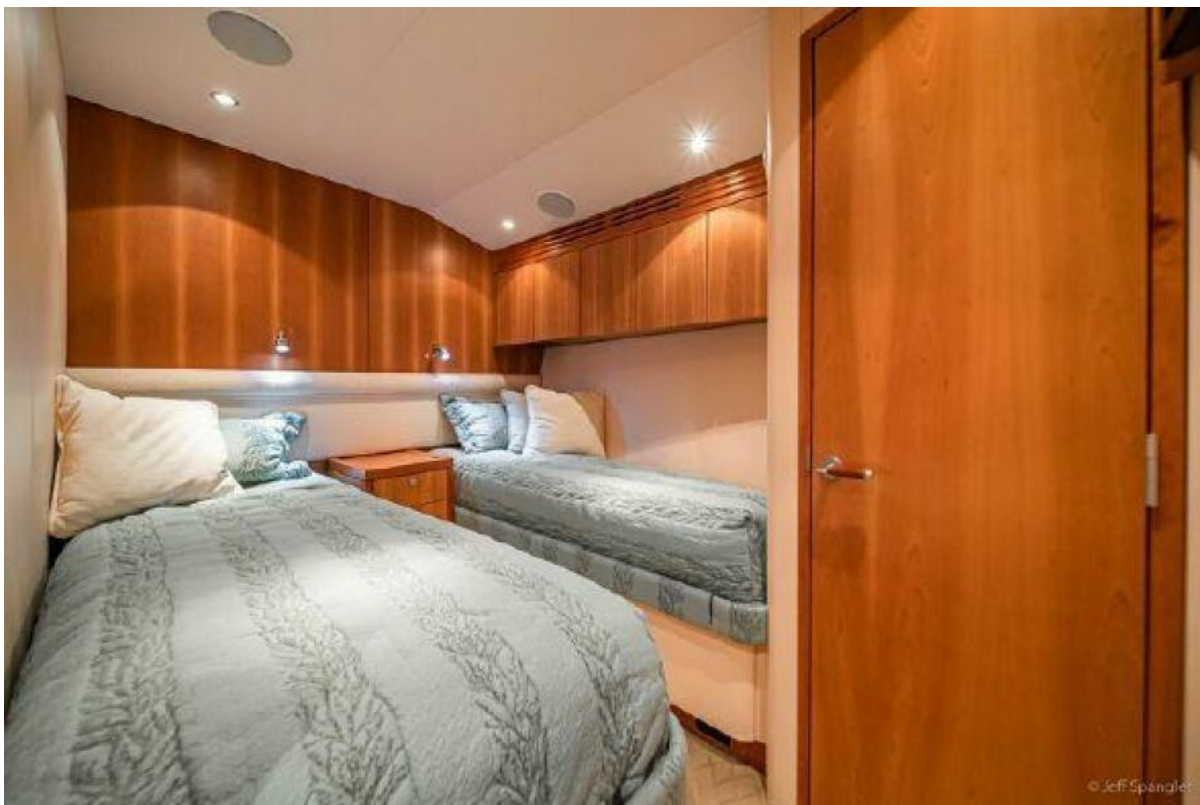
2008 77 Enclosed Bridge "Desperado" -Port State Guest Room