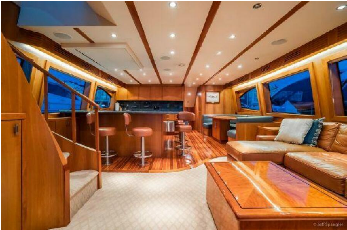
2008 77 Enclosed Bridge -"Desperado"-Galley