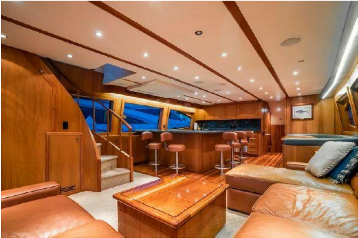
2008 Hatteras 77 Enclosed Bridge "Desperado"-Galley'