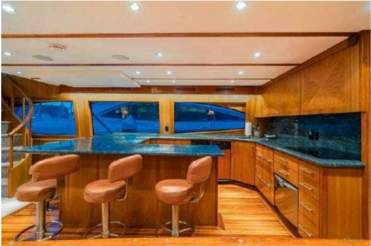
2008 77 Enclosed Bridge "Desperado"-Galley