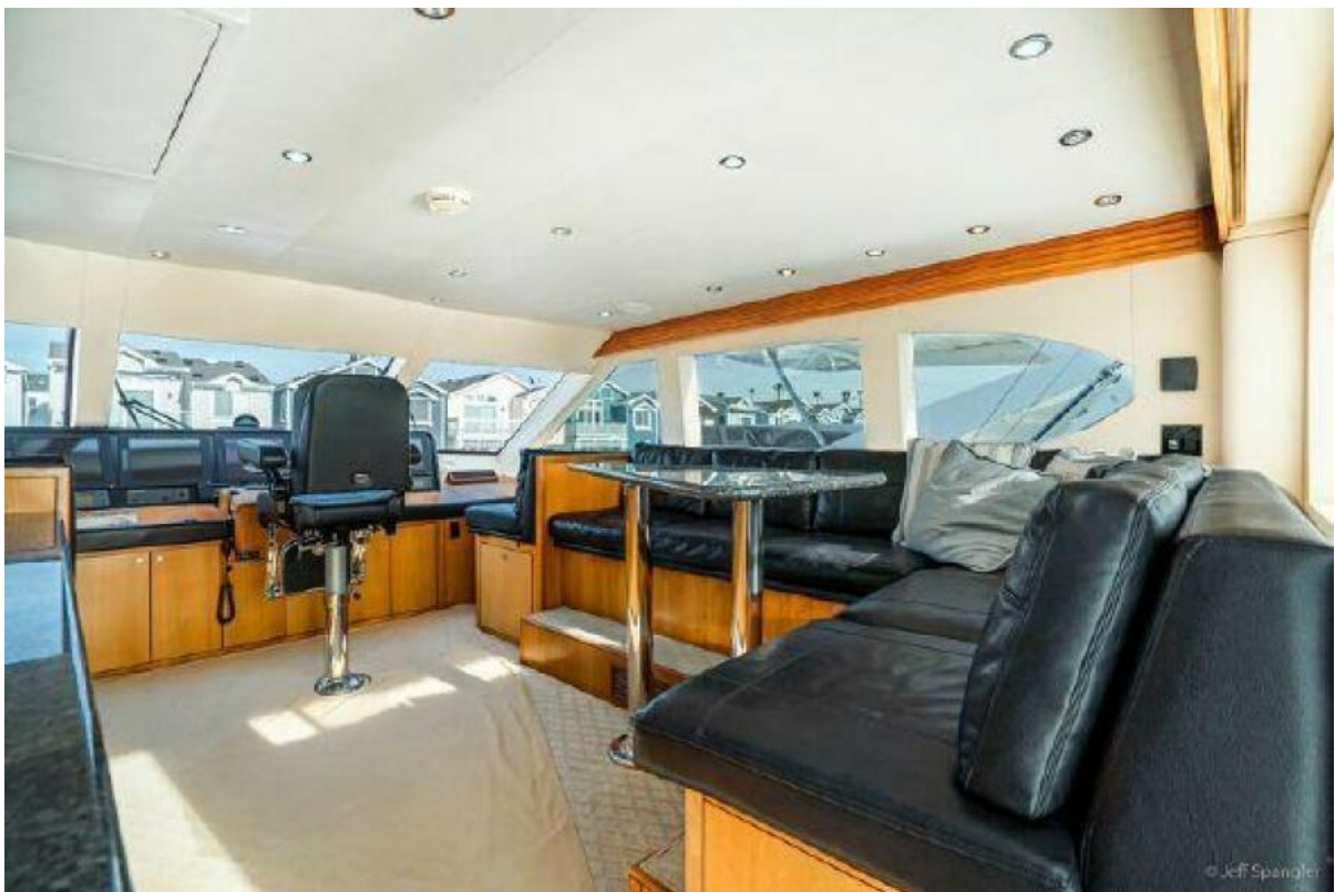
2008 77 Enclosed Bridge "Desperado"-Helm