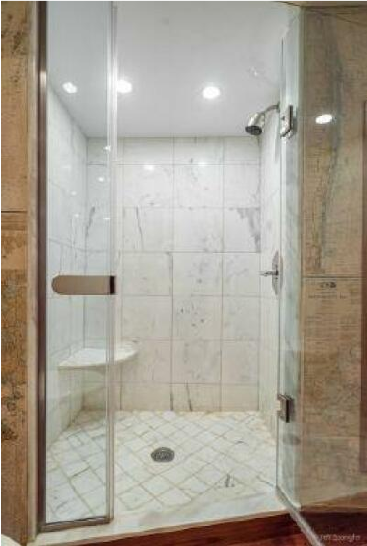
2008 77 Enclosed Bridge "Desperado"-Guest Head