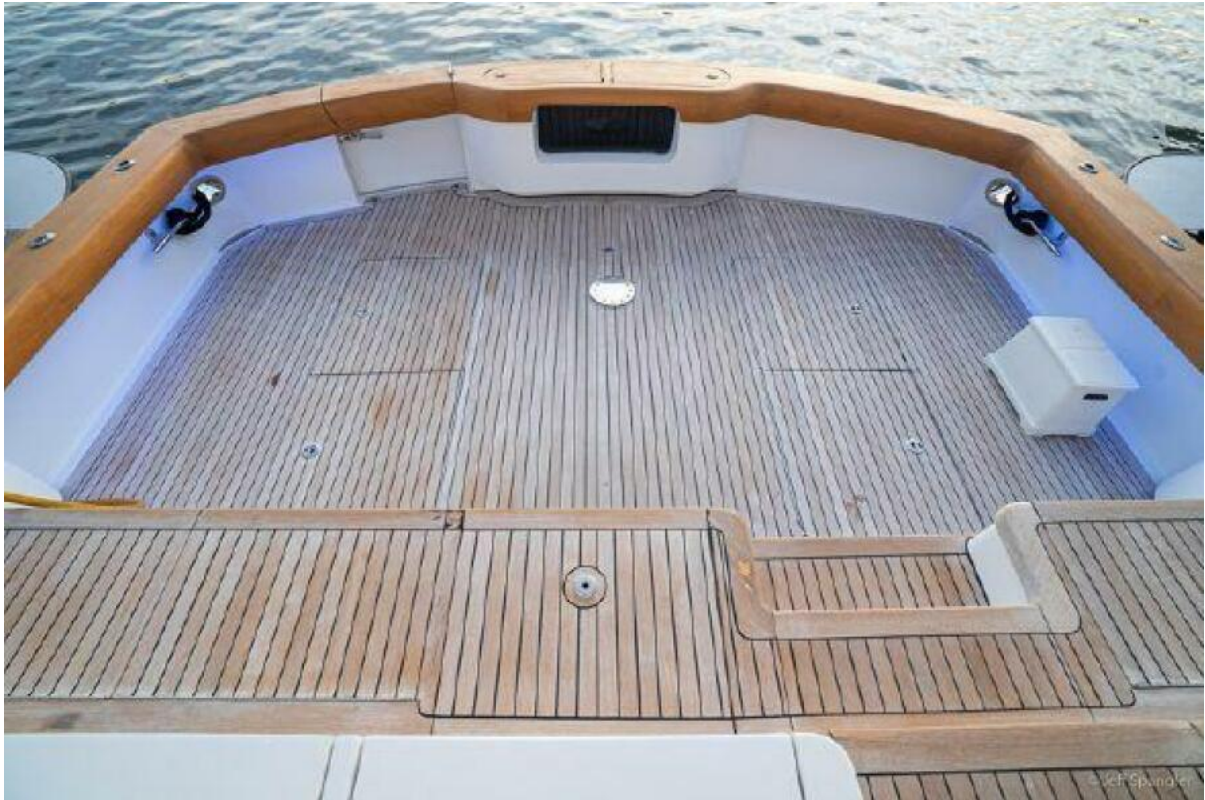
2008 77 Enclosed Bridge "Desperado"-Cockpit