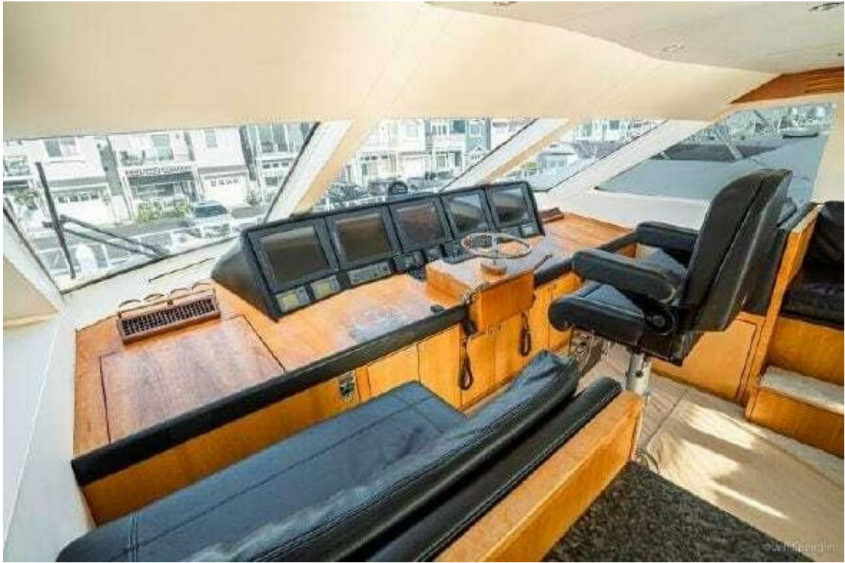
2008 77 Enclosed Bridge "Desperado"-Helm