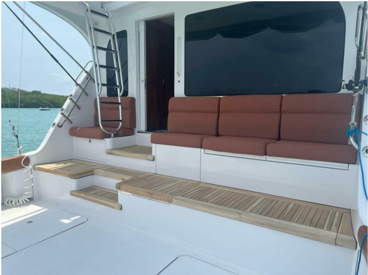
2008 77 Enclosed Bridge "Deperado"-Cockpit Seating