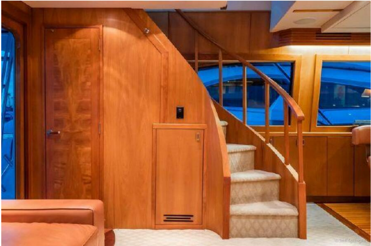
2008 77 Enclosed Bridge "Desperado"-Stairway