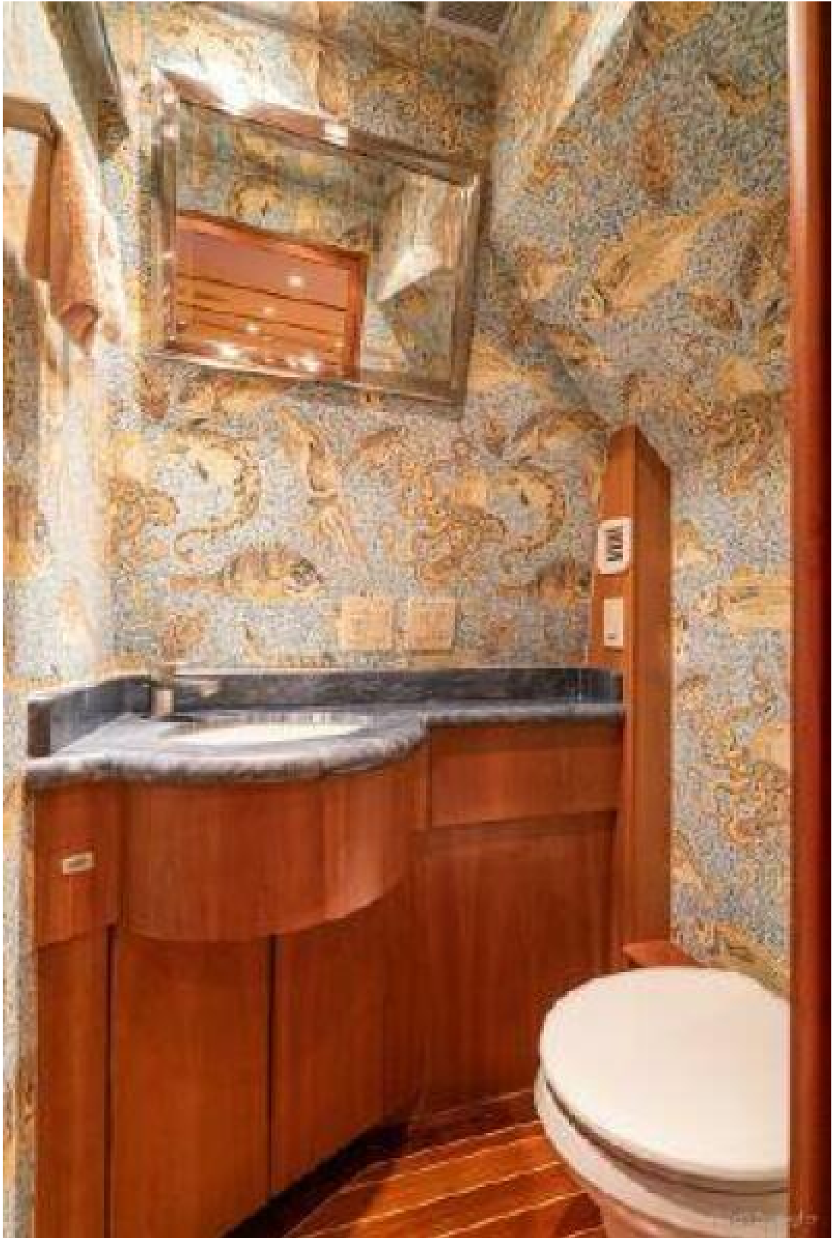
2008 77 Enclosed Bridge "Desperado"-Master Head