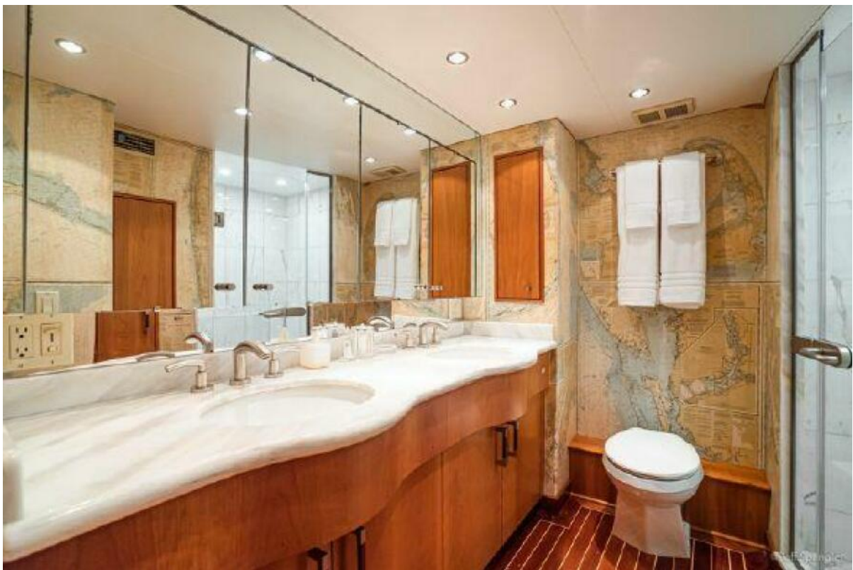
2008 77 Enclosed Bridge "Desperado"-Master Head