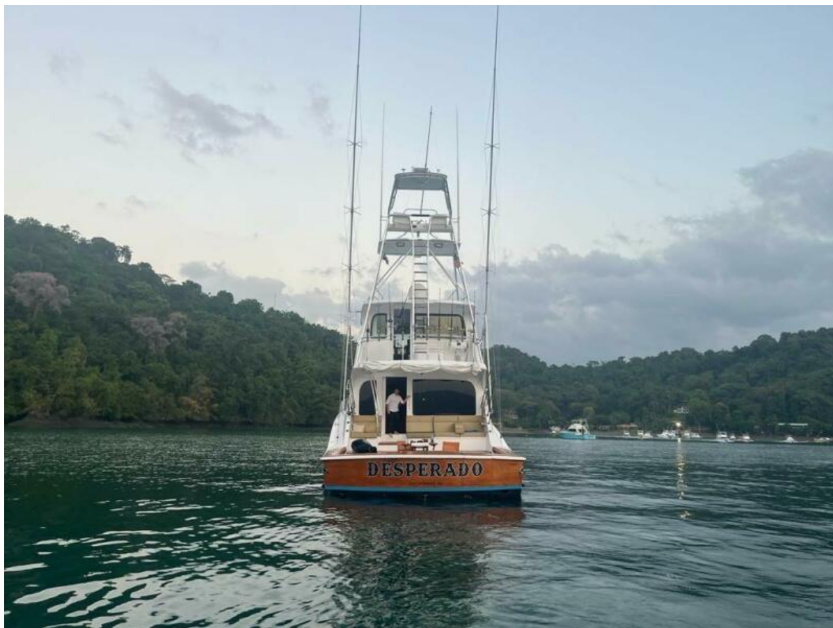
2008 77 Enclosed Bridge "Desperado"-Aft View