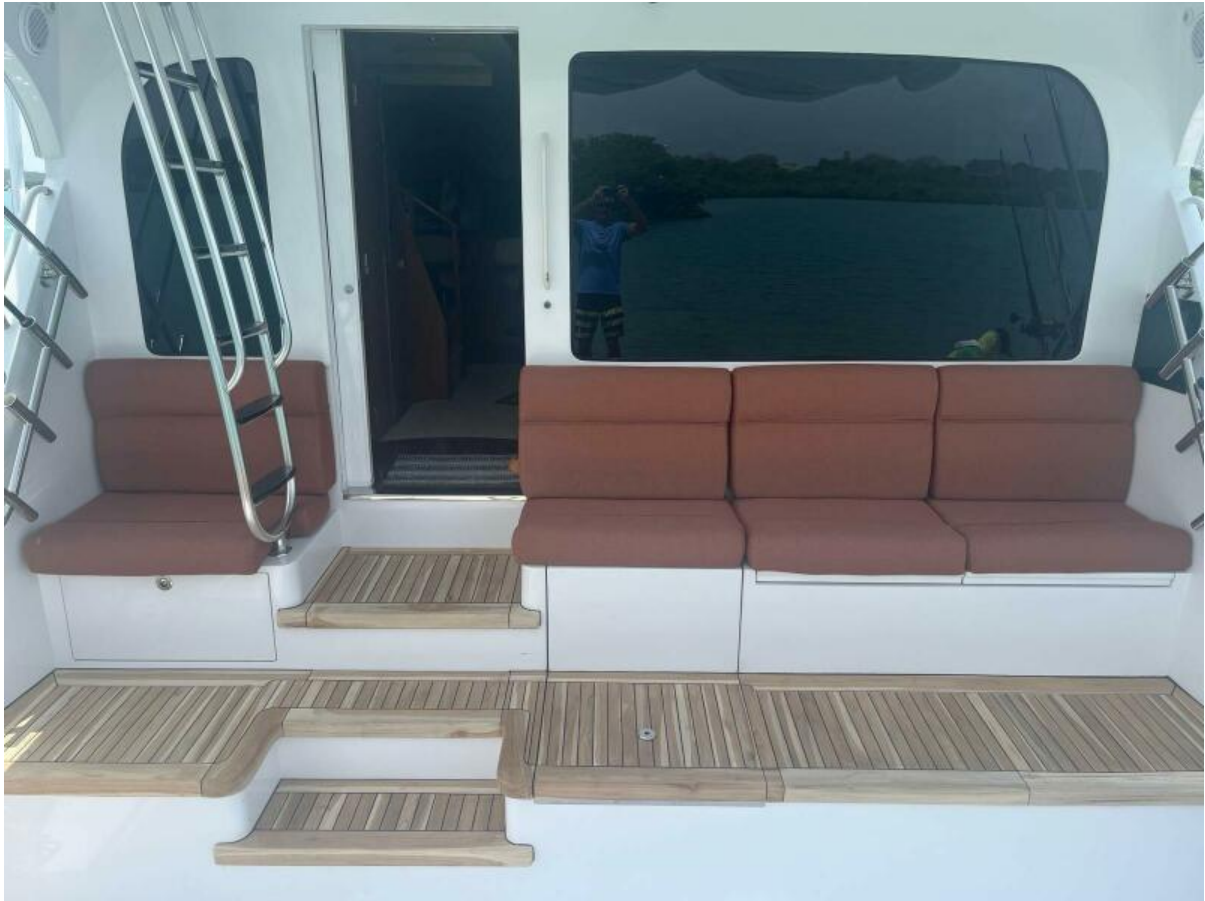
2008 77 Enclosed Bridge "Desperado-Cockpit Seating"