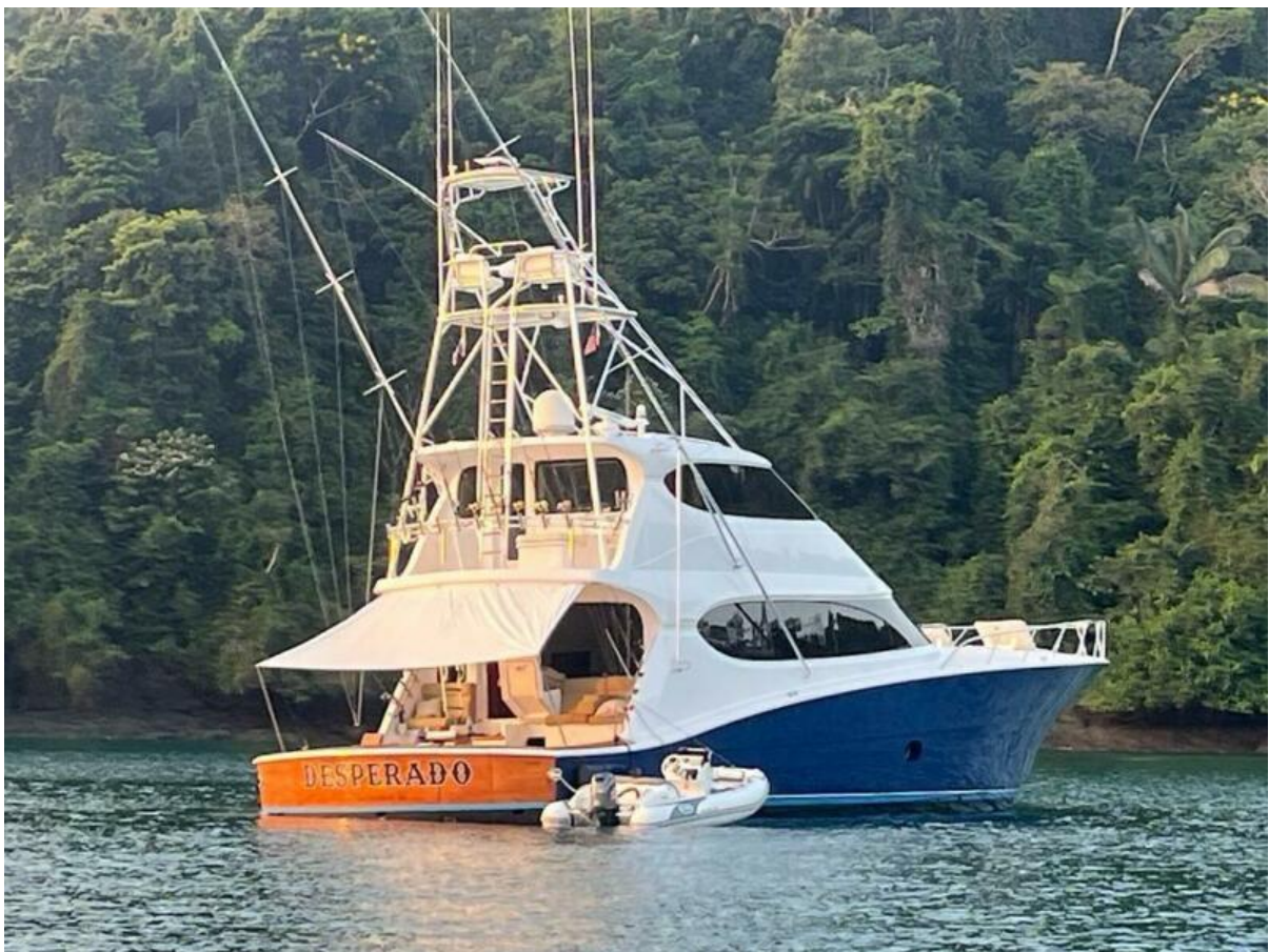
2008 Hatteras 77 Enclosed Bridge "Desperado"-Profile View