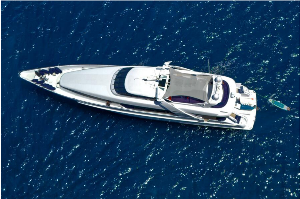
Moonraker God's Eye