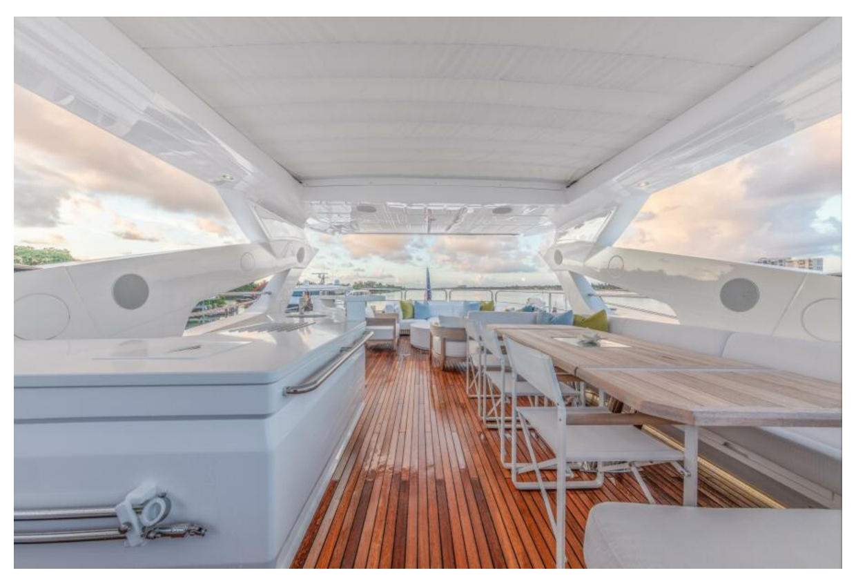
S-CAPE 95' Sunseeker 2017/2022 Fly Bridge