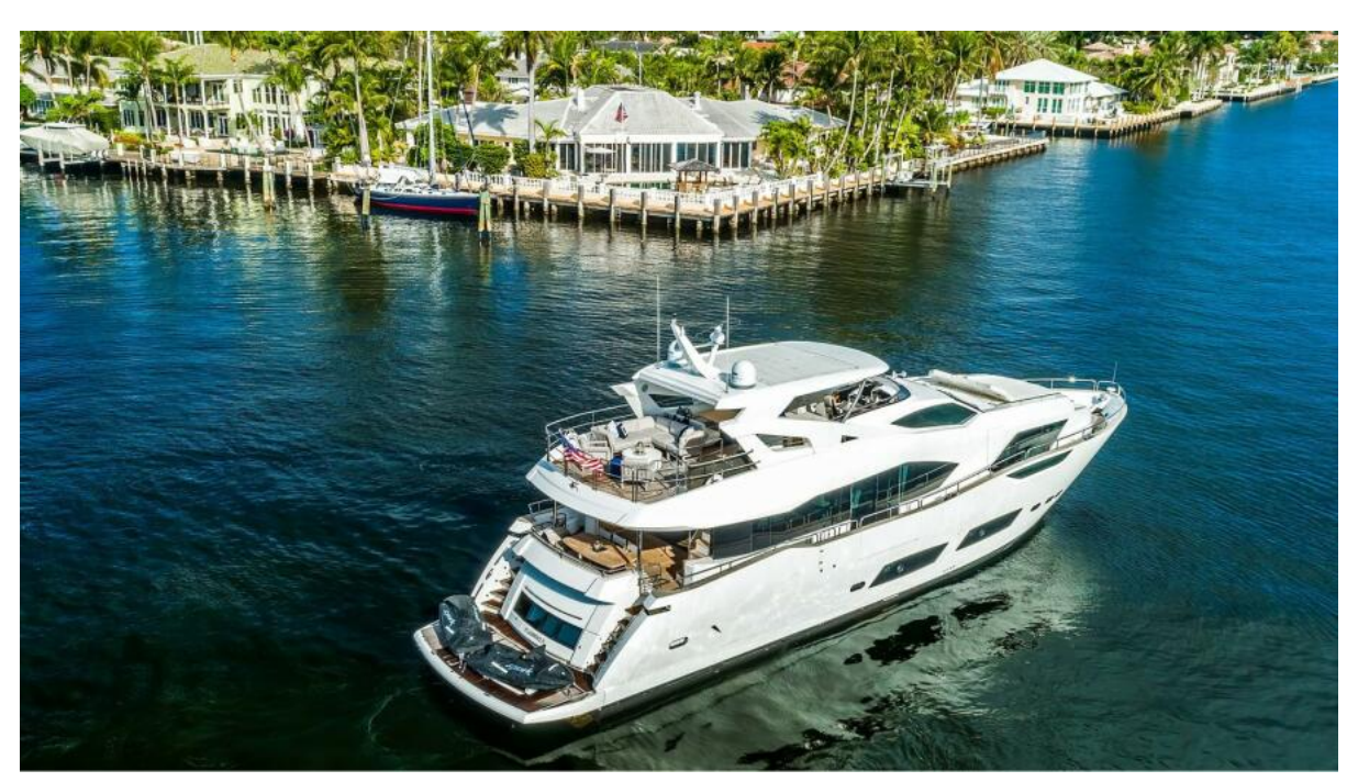
S-CAPE 95' Sunseeker 2017/2022