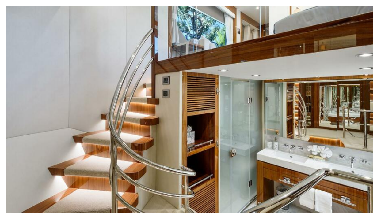
S-CAPE 95' Sunseeker 2017/2022 Master Split Level Stairway