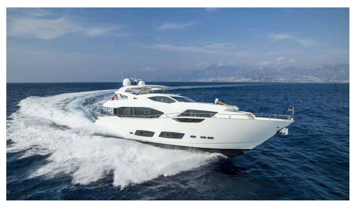
S-CAPE 95' Sunseeker 2017/2022