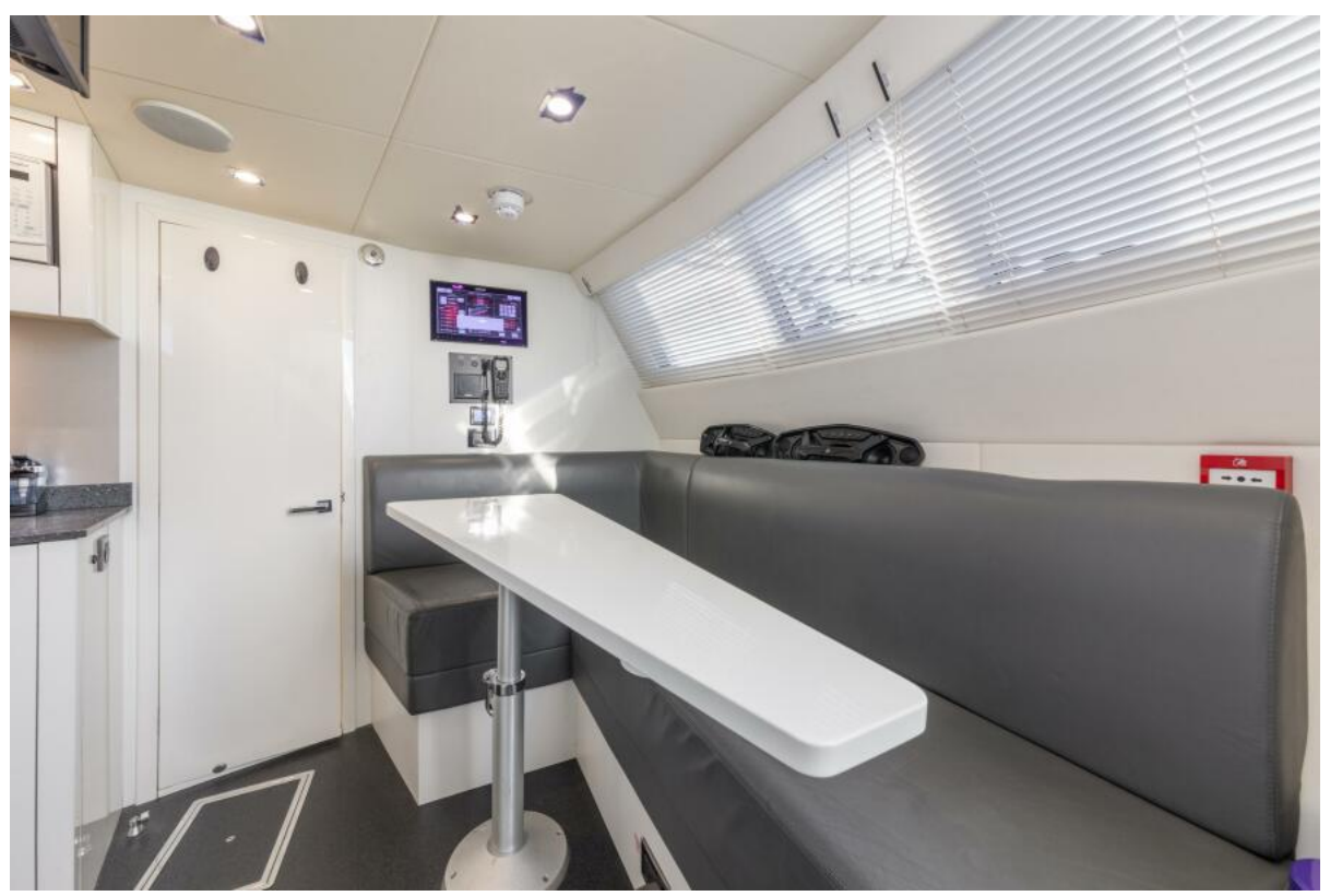
S-CAPE 95' Sunseeker 2017/2022 Crew Quarters