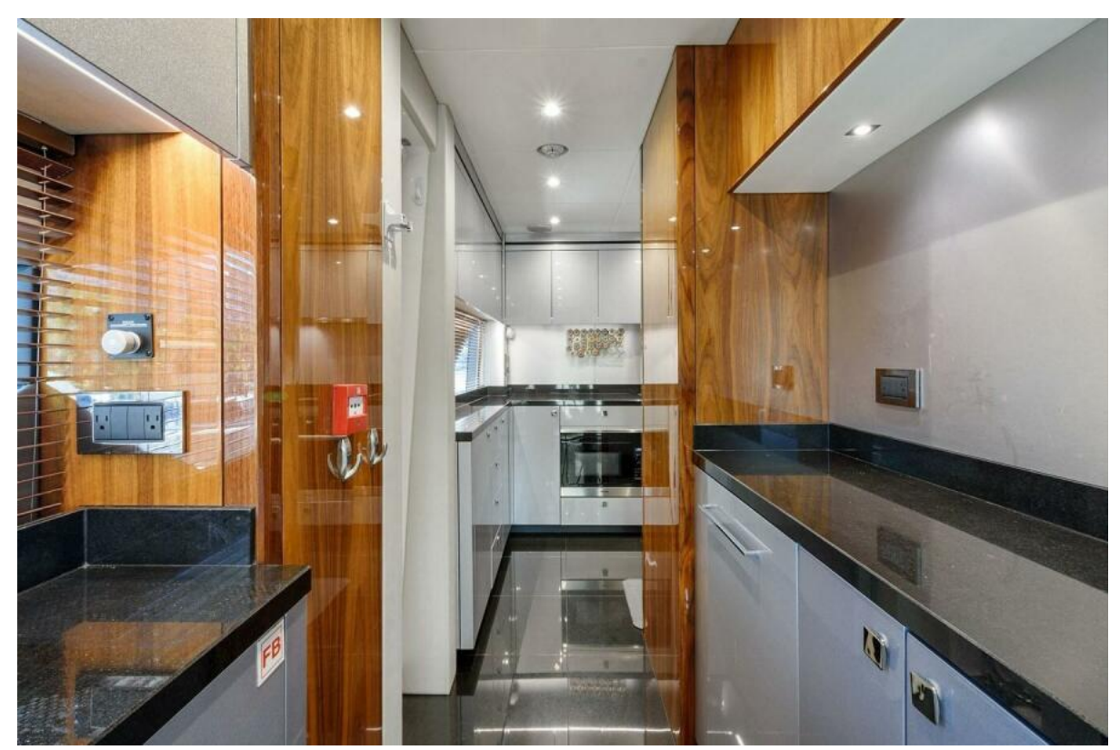
S-CAPE 95' Sunseeker 2017/2022 Stew Pantry