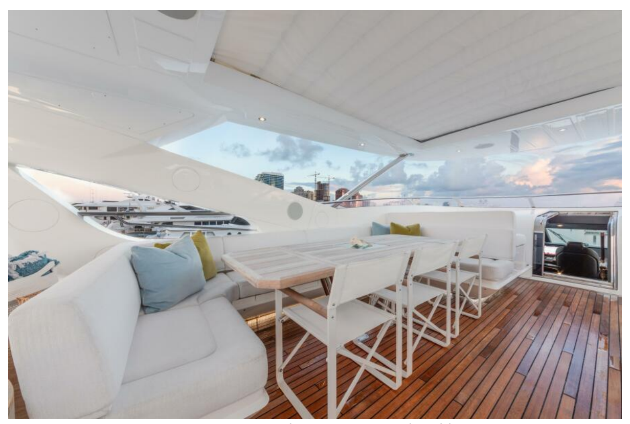
S-CAPE 95' Sunseeker 2017/2022 Fly Bridge