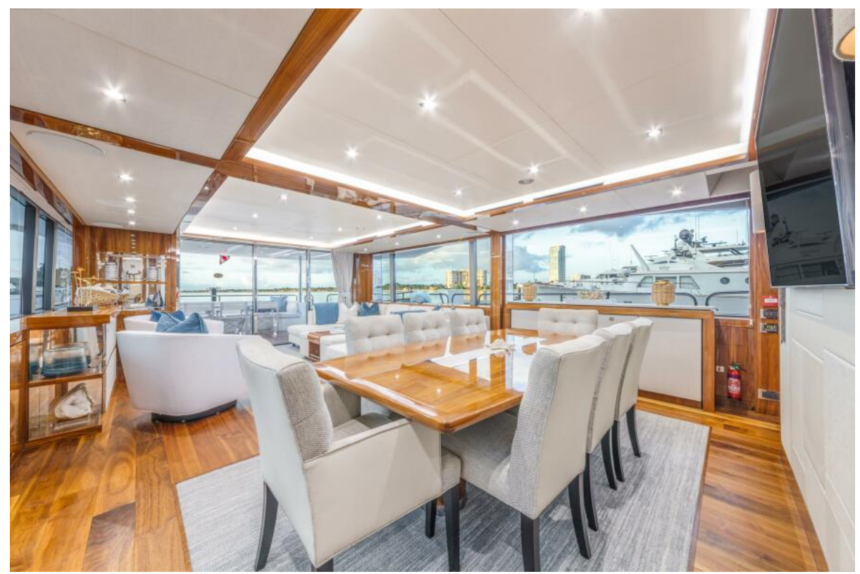
S-CAPE 95' Sunseeker 2017/2022 Main Salon Dining Area