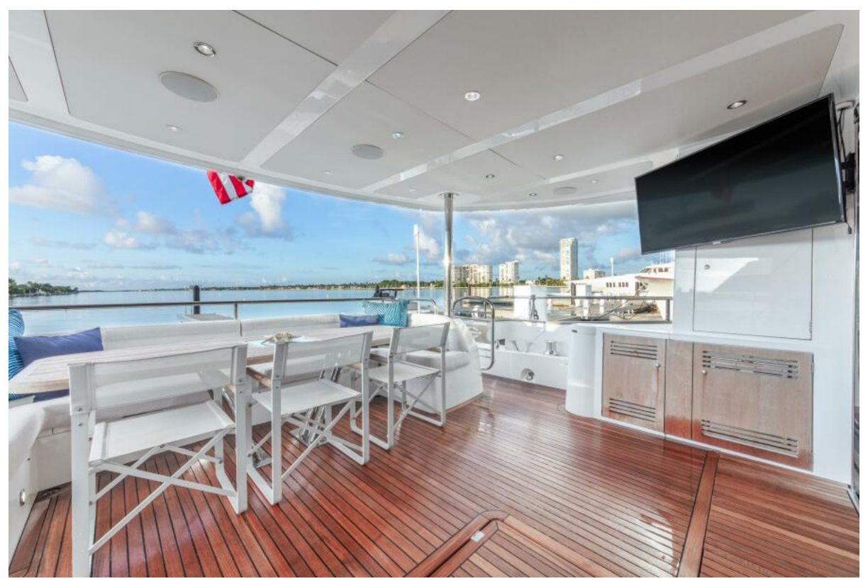
S-CAPE 95' Sunseeker 2017/2022 Aft Deck