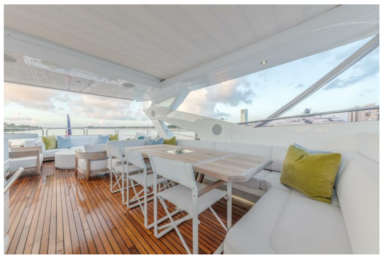
S-CAPE 95' Sunseeker 2017/2022 Fly Bridge