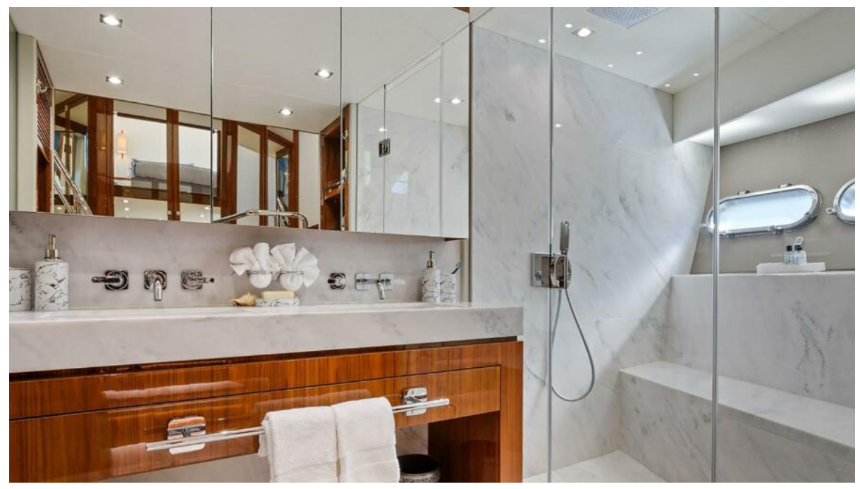
S-CAPE 95' Sunseeker 2017/2022 Master Ensuite