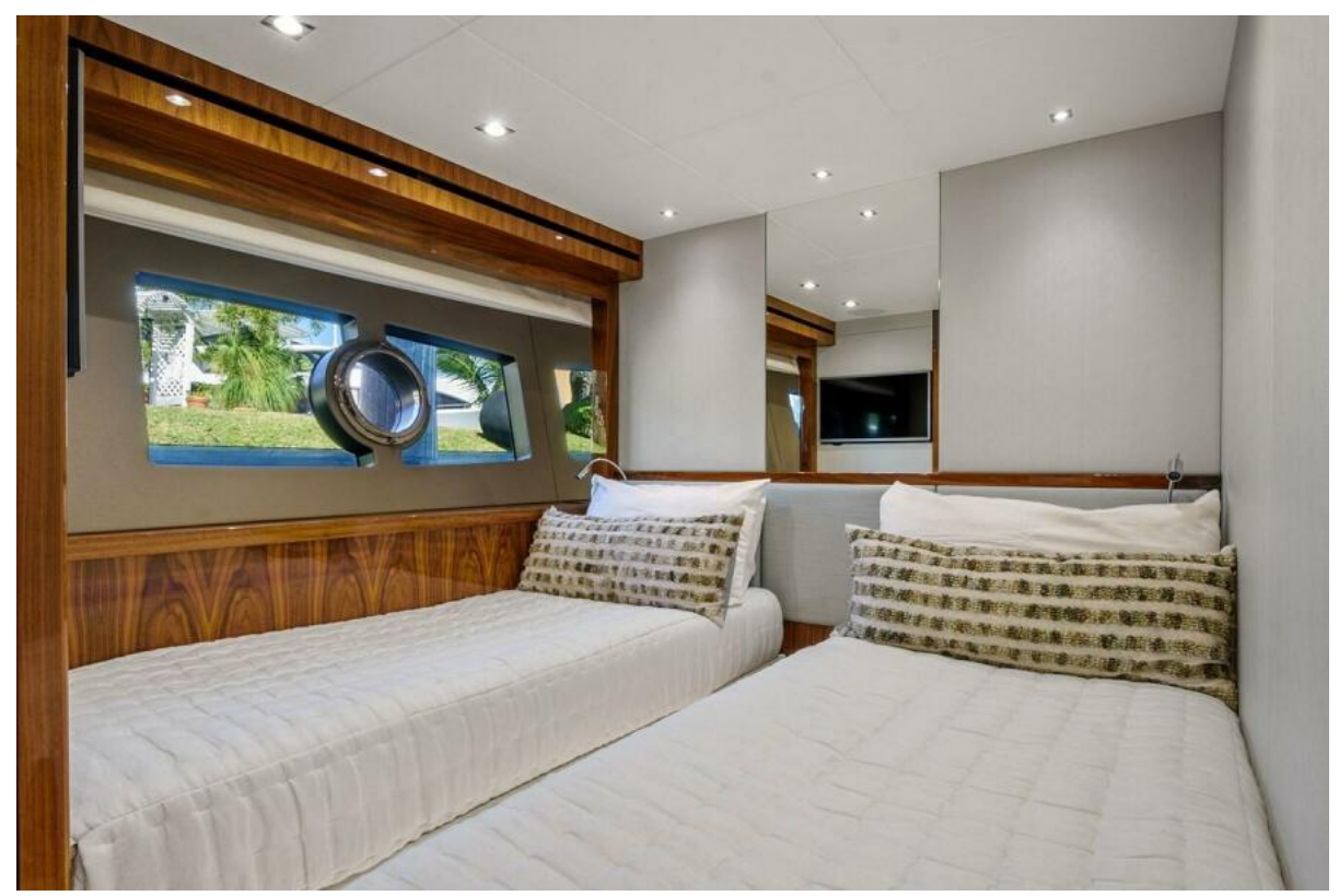
S-CAPE 95' Sunseeker 2017/2022 Twin Guest Ensuite