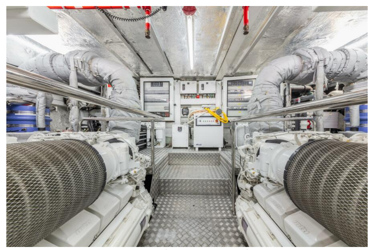
S-CAPE 95' Sunseeker 2017/2022 Engine Room