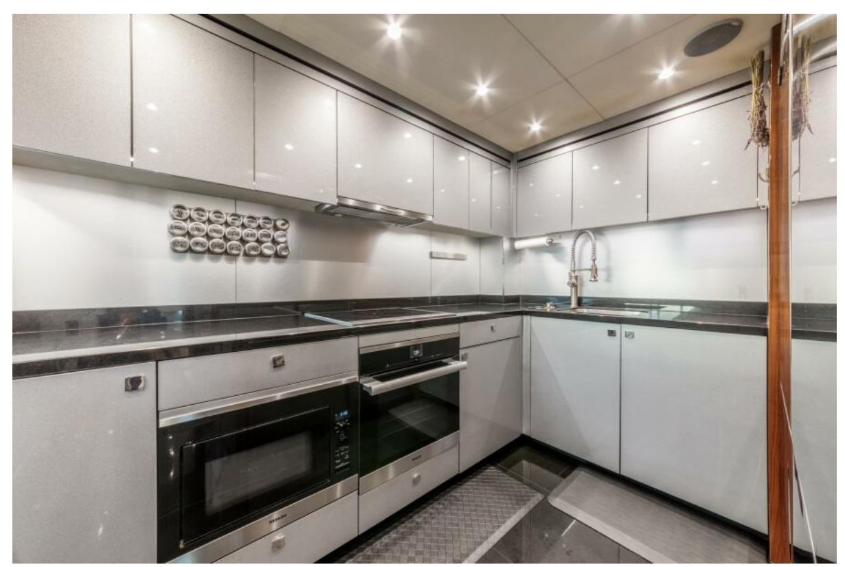
S-CAPE 95' Sunseeker 2017/2022 Galley