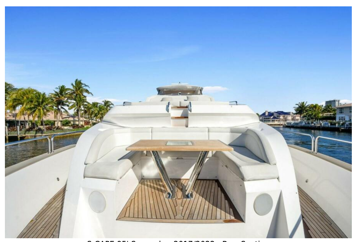
S-CAPE 95' Sunseeker 2017/2022 Bow Seating