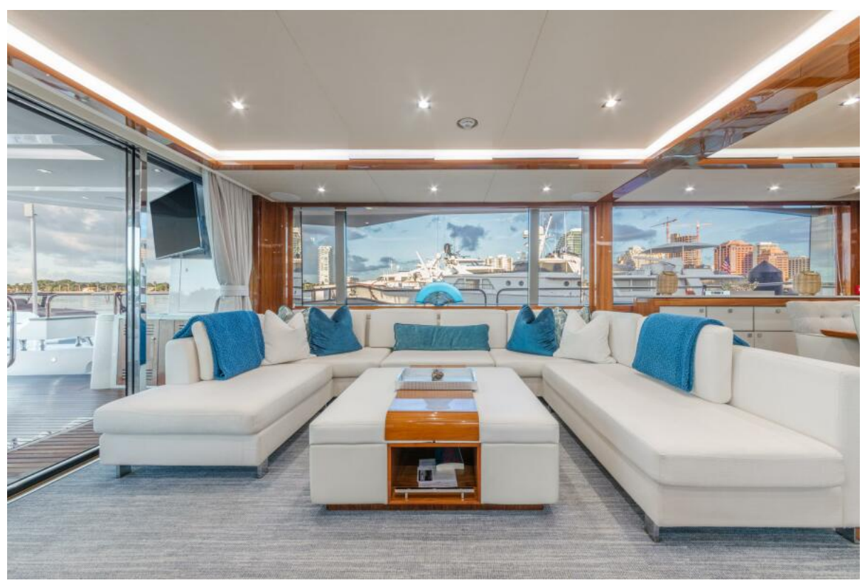
S-CAPE 95' Sunseeker 2017/2022 Main Salon