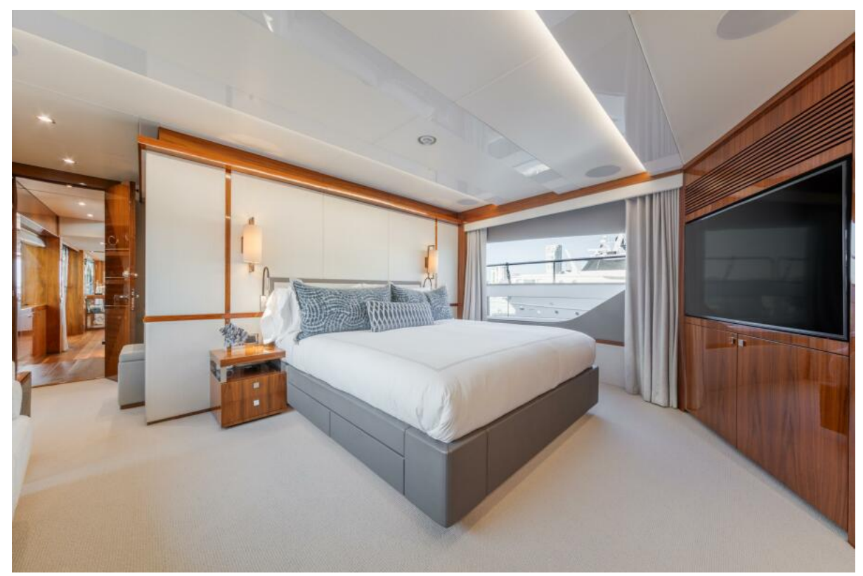
S-CAPE 95' Sunseeker 2017/2022 Master Stateroom