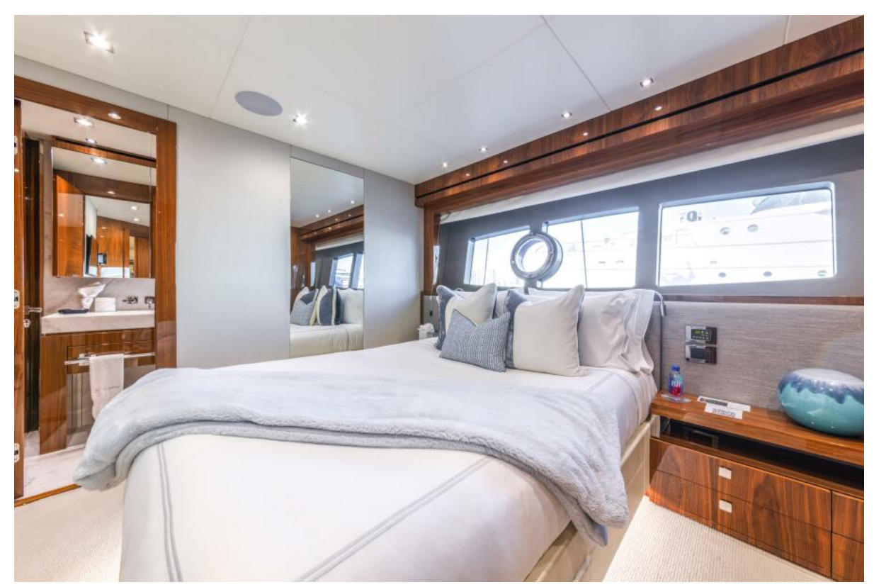
S-CAPE 95' Sunseeker 2017/2022 VIP Stateroom