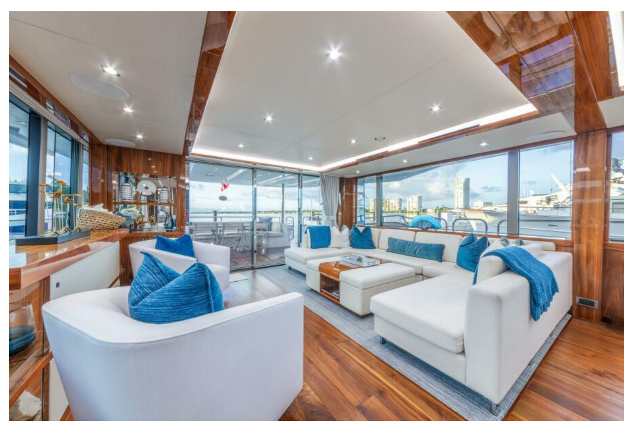
S-CAPE 95' Sunseeker 2017/2022 Main Salon