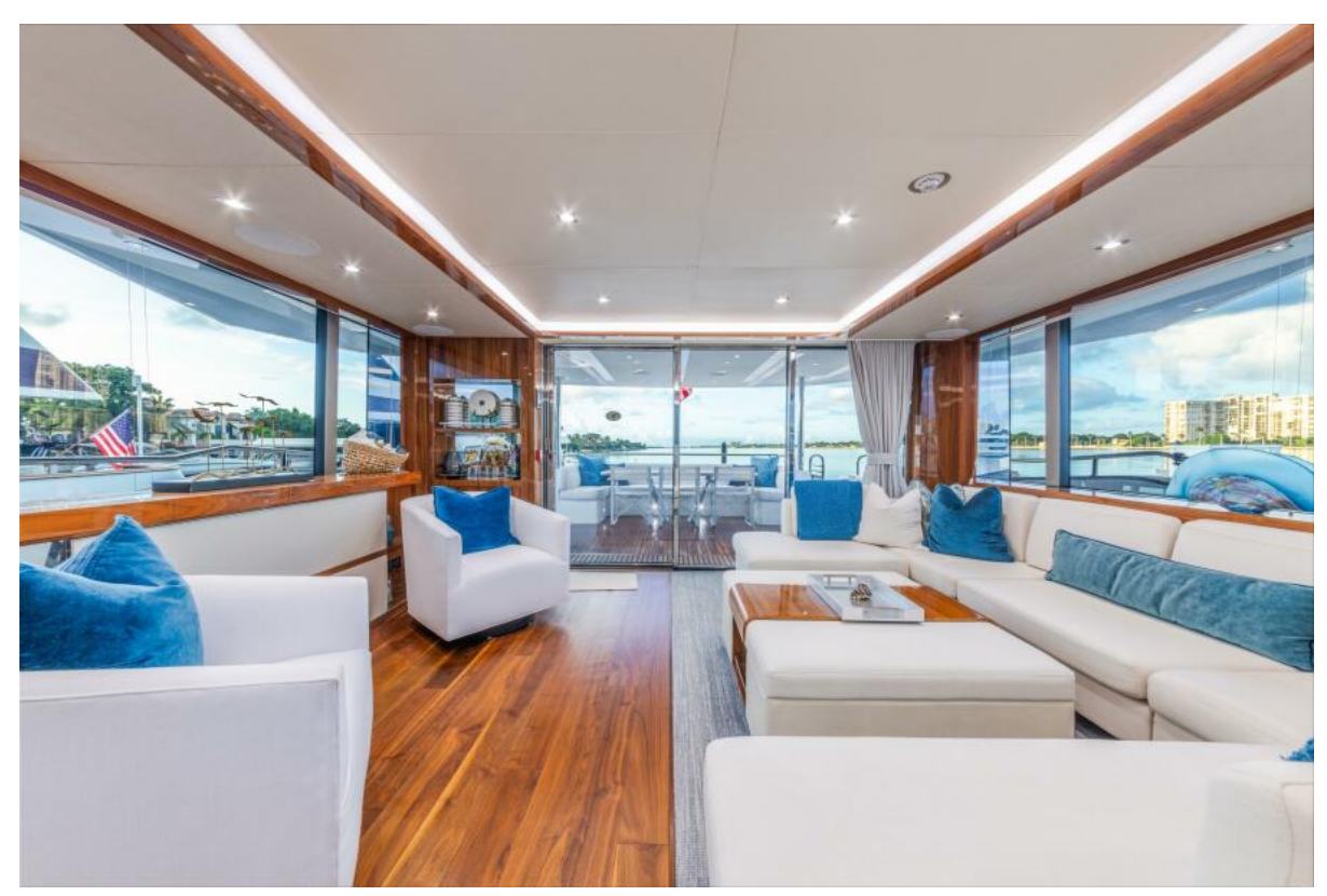
S-CAPE 95' Sunseeker 2017/2022 Main Salon