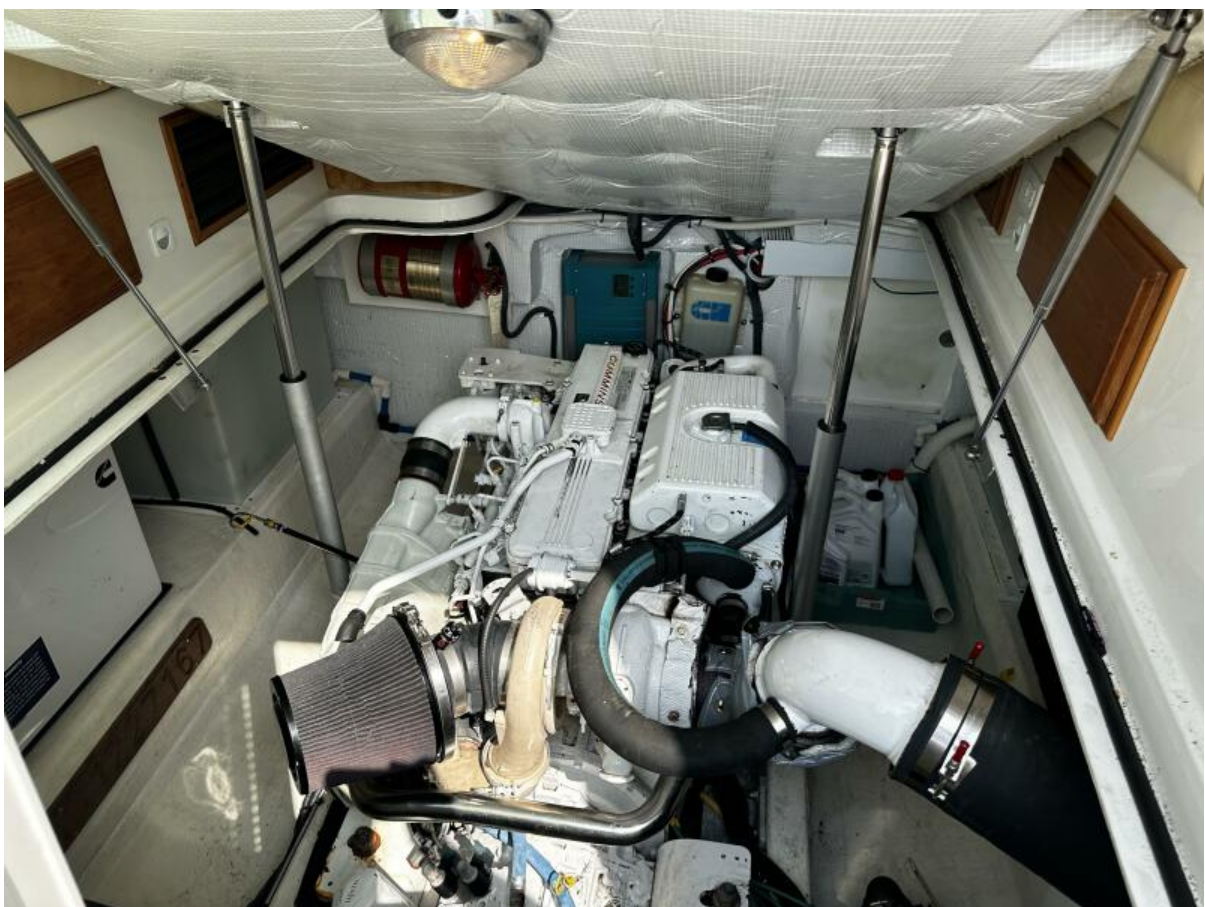
Engine 2010 Back Cove 37 Engine. For Sale Central Agent Northstar Yacht Sales