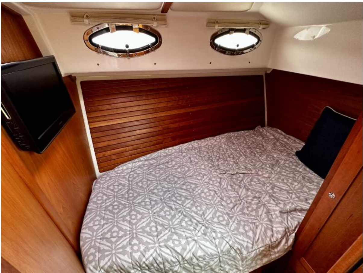
Guest Stateroom 2010 Back Cove 37 Guest Cabine. For Sale Central Agent Northstar Yacht Sales