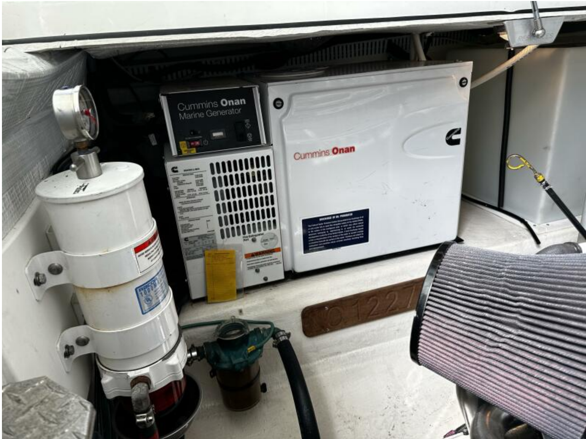
Gen Set 2010 Back Cove 37 Gen-Set. For Sale Central Agent Northstar Yacht Sales