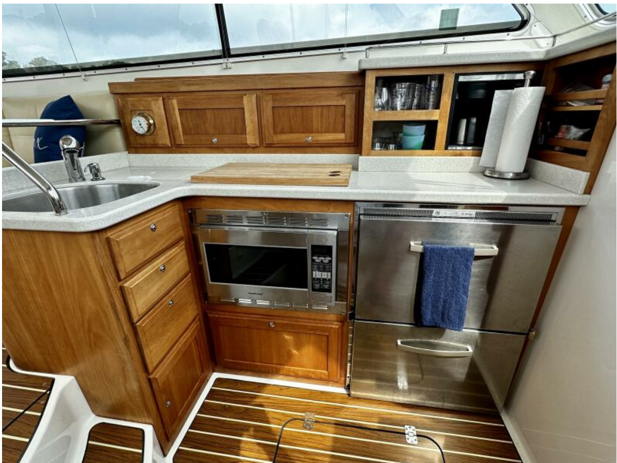
Galley 2010 Back Cove 37 Galley. For Sale Central Agent Northstar Yacht Sales