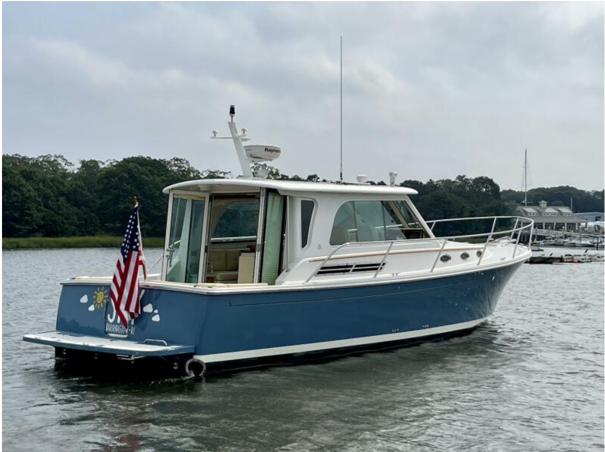
Stb Qtr 2010 Back Cove 37 Starboard Quarter. For Sale Central Agent Northstar Yacht Sales