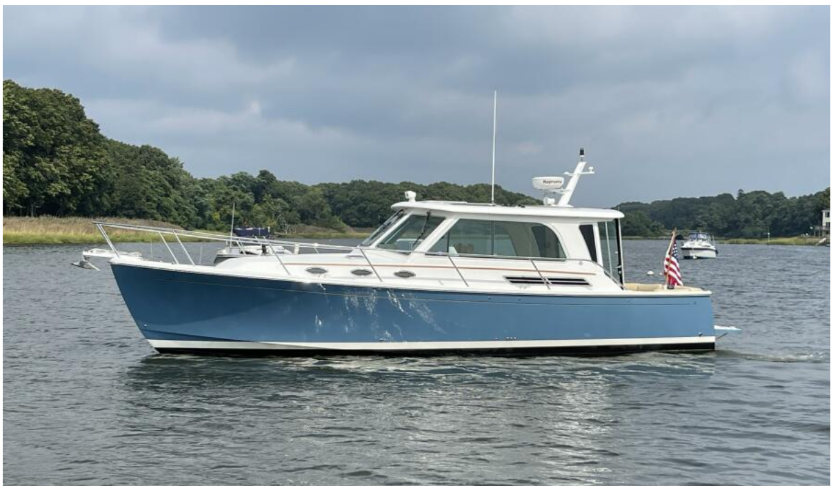
Profile Port Side 2010 Back Cove 37 Port Side Profile. For Sale Central Agent Northstar Yacht Sales