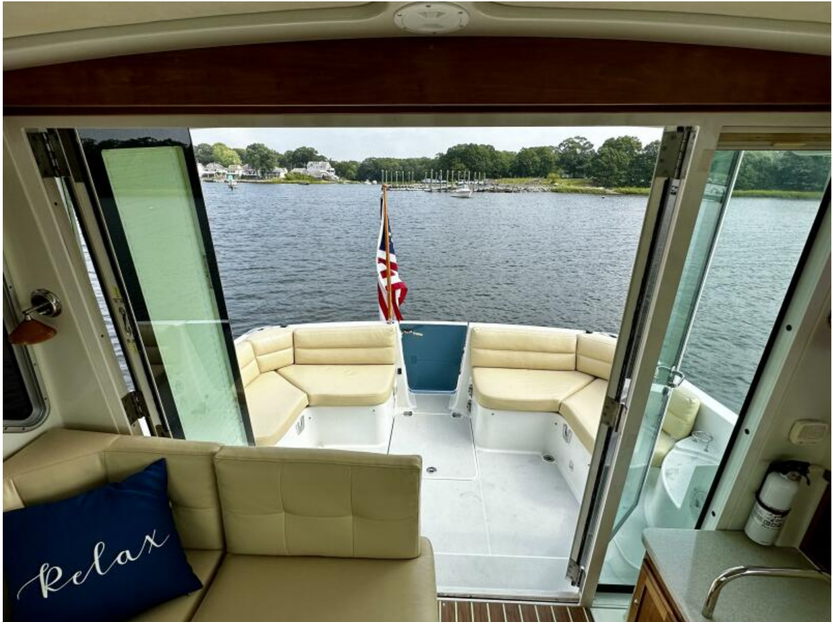
Salon Door 2010 Back Cove 37 Salon door to cockpit. For Sale Central Agent Northstar Yacht Sales