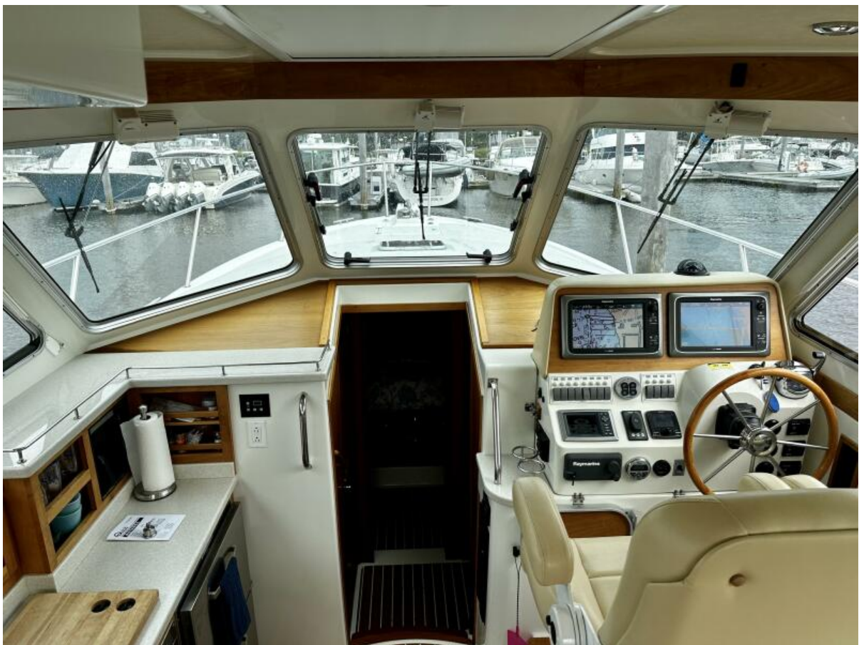
Helm View 2010 Back Cove 37 Helm View. For Sale Central Agent Northstar Yacht Sales