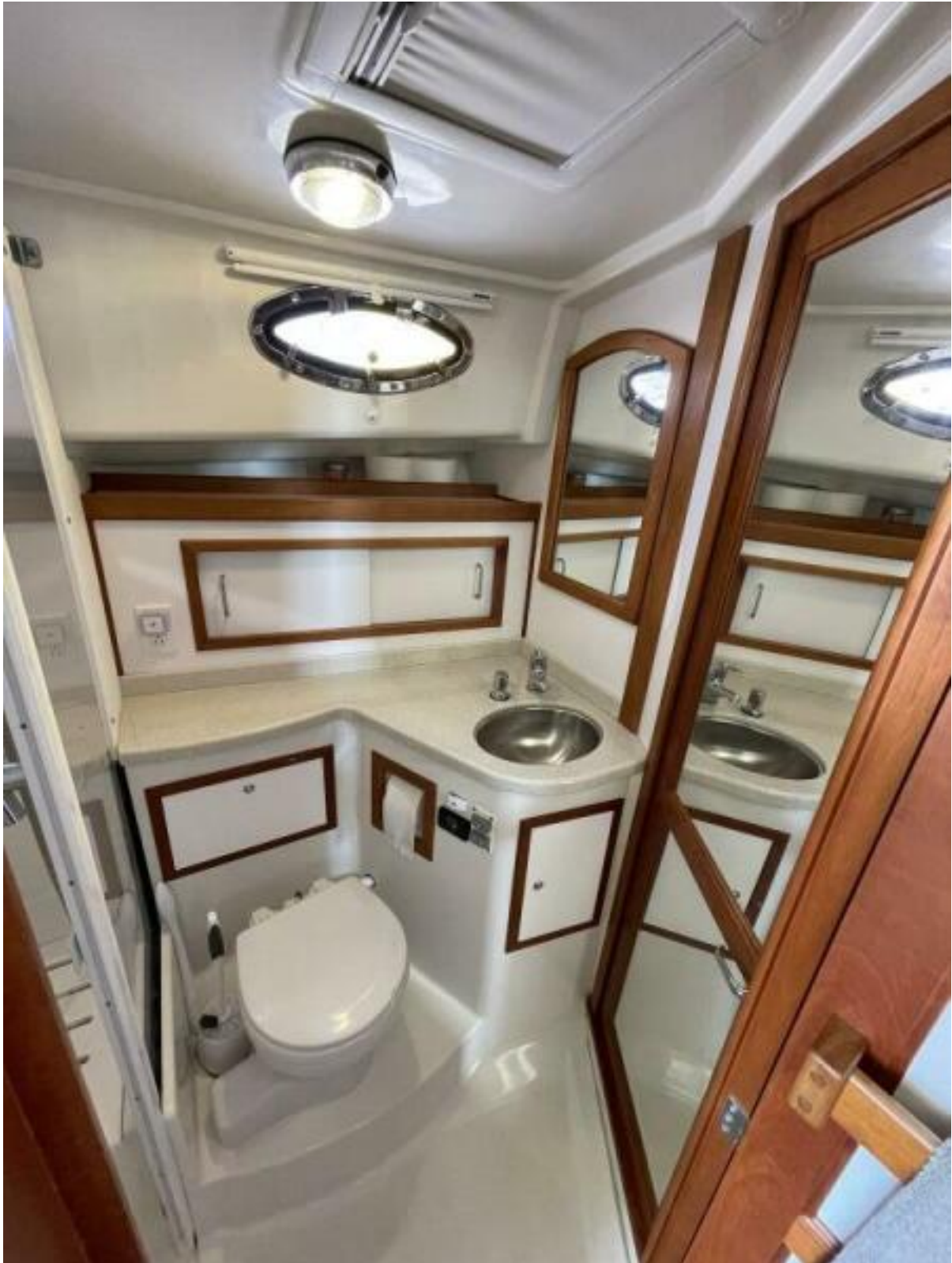
Head and Vanity 2010 Back Cove 37 Head and Vanityr. For Sale Central Agent Northstar Yacht Sales