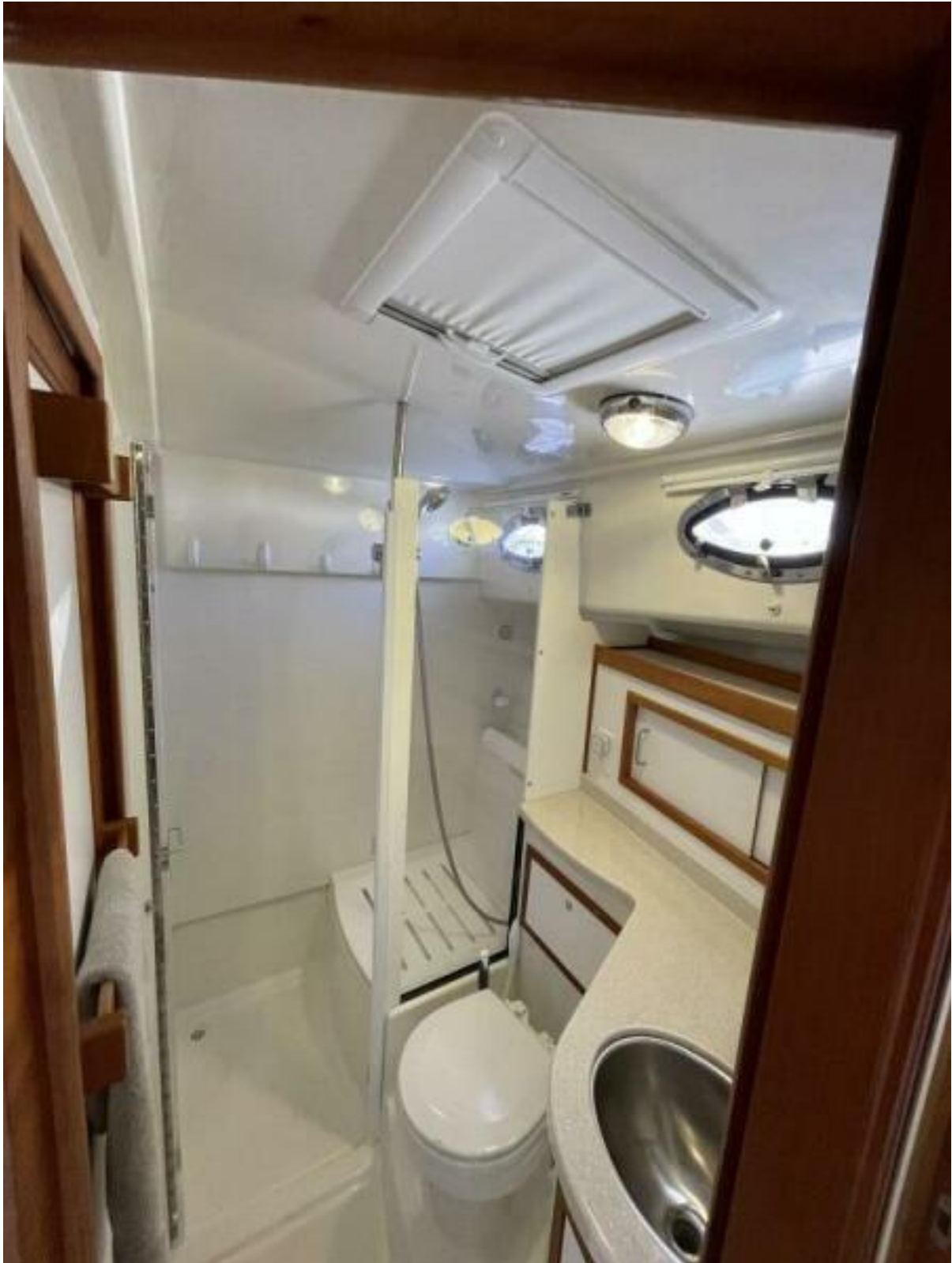
Head and Shower 2010 Back Cove 37 Head and Shower. For Sale Central Agent Northstar Yacht Sales