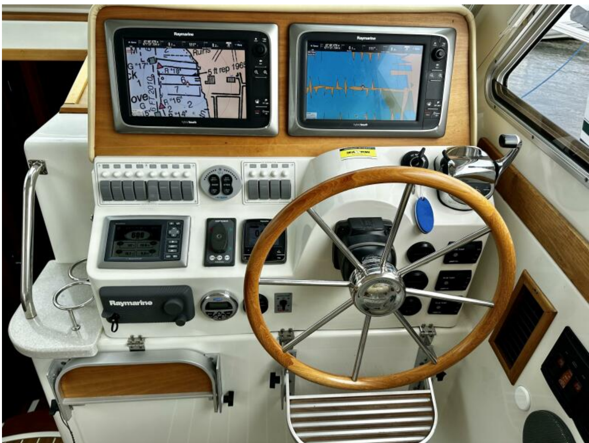
Helm Electronics 2010 Back Cove 37 Helm Electronics. For Sale Central Agent Northstar Yacht Sales