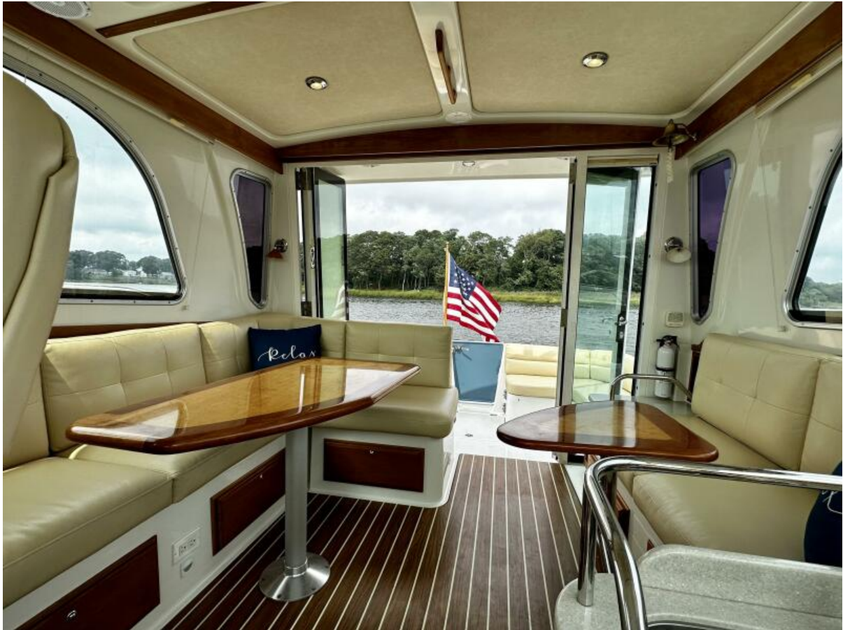
Salon Looking Aft 2010 Back Cove 37 Salon Looking Aft. For Sale Central Agent Northstar Yacht Sales