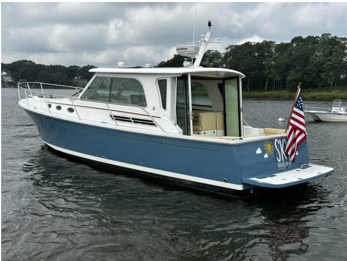
Port Qtr 2010 Back Cove 37 Port Quarter. For Sale Central Agent Northstar Yacht Sales