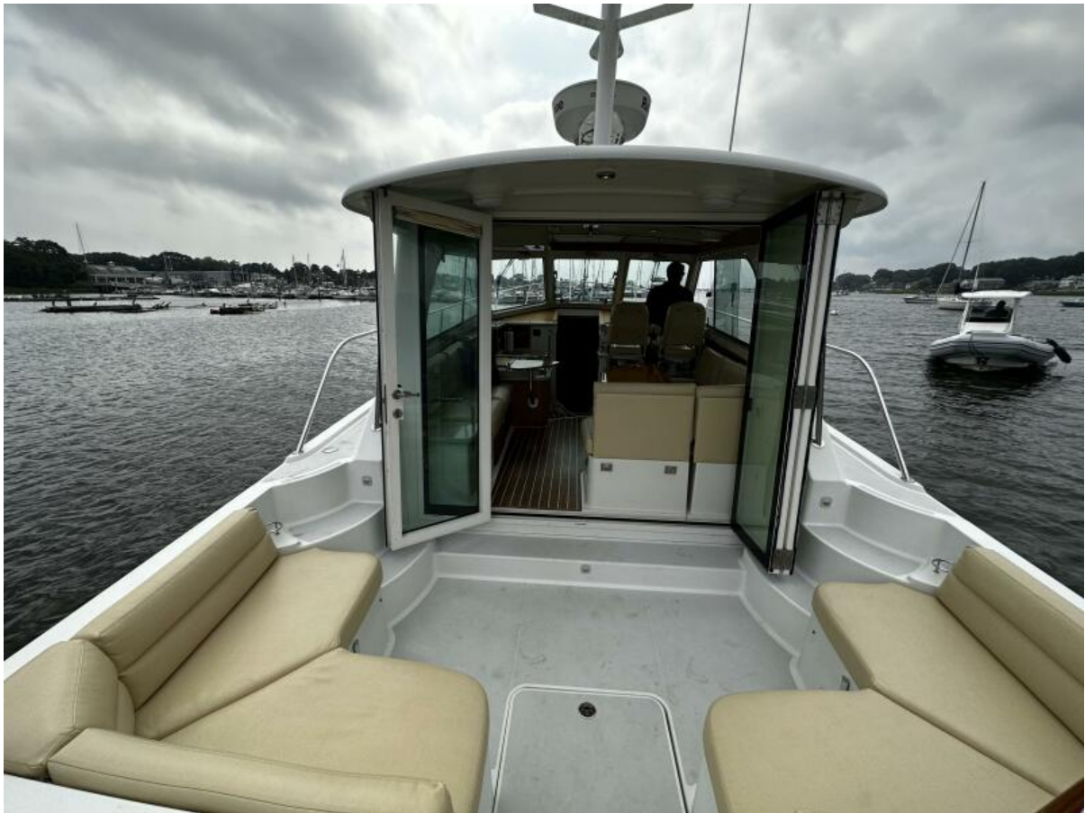
Cockpit 2010 Back Cove 37 Cockpit. For Sale Central Agent Northstar Yacht Sales