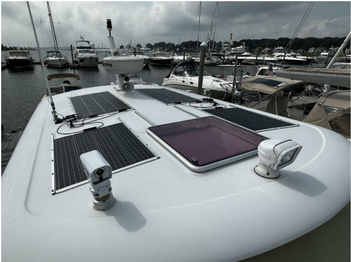
Hardtop Equipment 2010 Back Cove 37 Hardtop with solar panels. For Sale Central Agent Northstar Yacht Sales