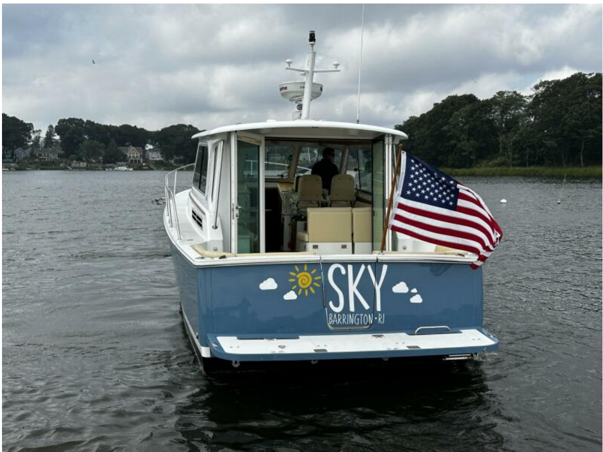
Transom 2010 Back Cove 37 Transom. For Sale Central Agent Northstar Yacht Sales