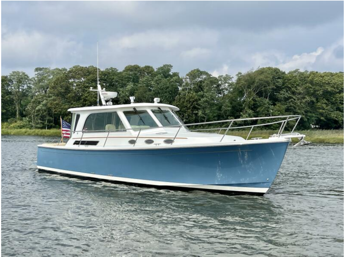
Profile 2010 Back Cove 37 Starboard Profile. For Sale Central Agent Northstar Yacht Sales