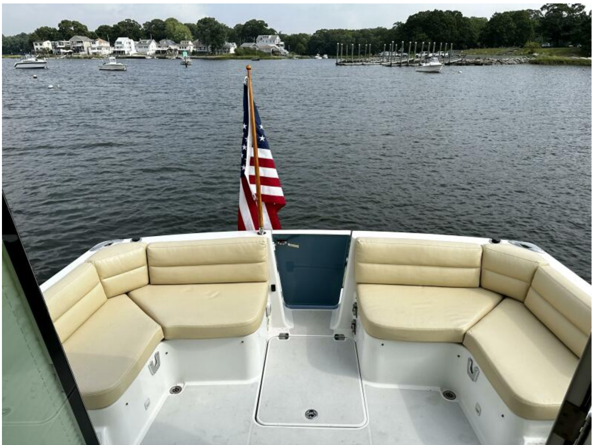
Cockpit Seating 2010 Back Cove 37 Cockpit Seating. For Sale Central Agent Northstar Yacht Sales