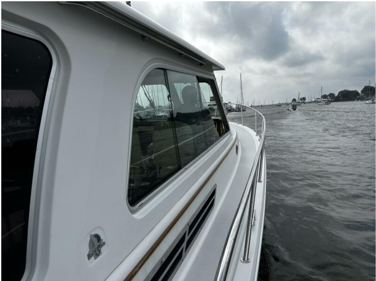
Side Deck 2010 Back Cove 37 Side Deck. For Sale Central Agent Northstar Yacht Sales