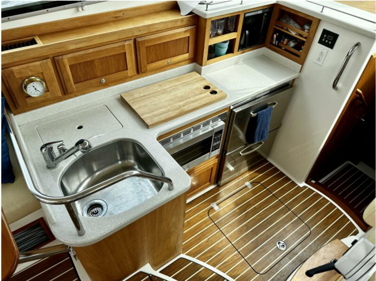
Galley Top View 2010 Back Cove 37 Galley Top View. For Sale Central Agent Northstar Yacht Sales