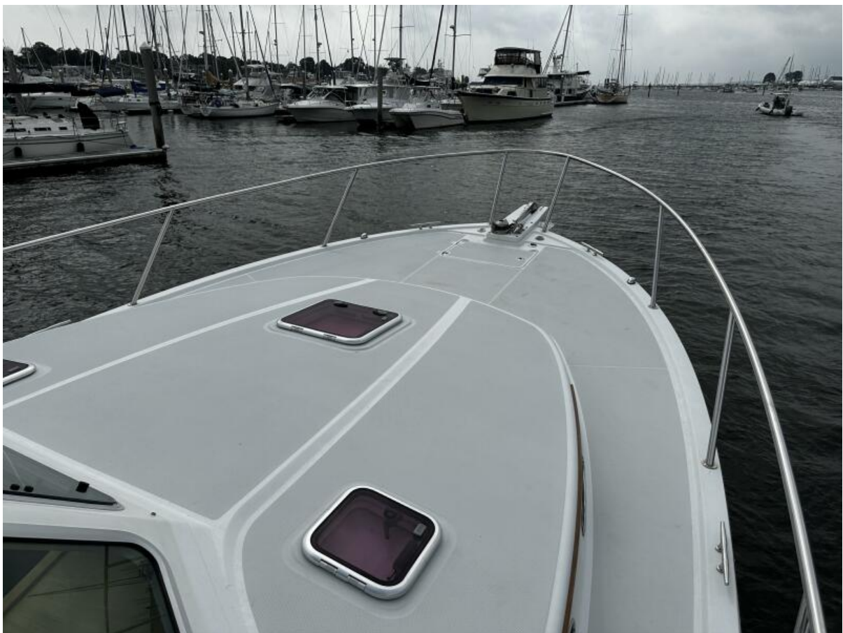
Deck Forward 2010 Back Cove 37 Fore Deck. For Sale Central Agent Northstar Yacht Sales