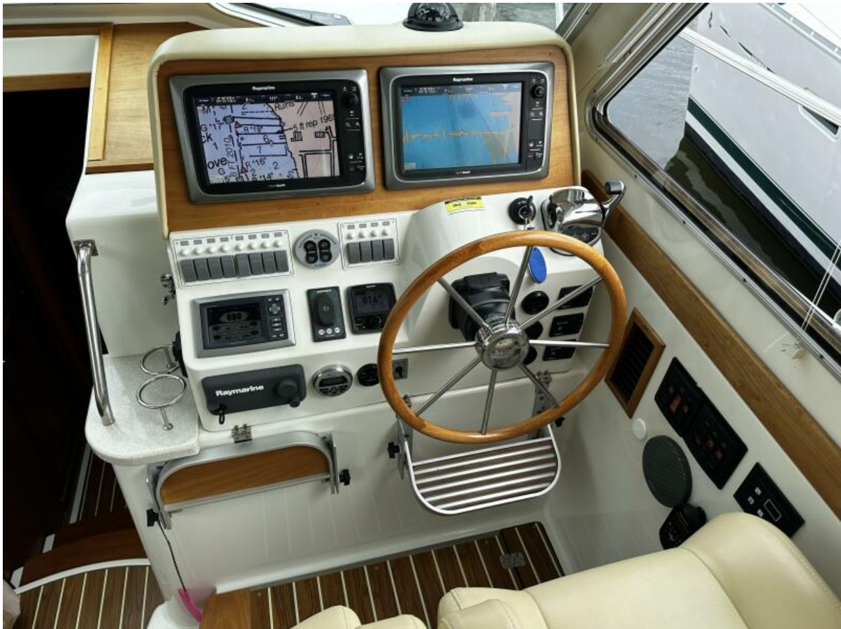
Helm 2010 Back Cove 37 Helm. For Sale Central Agent Northstar Yacht Sales