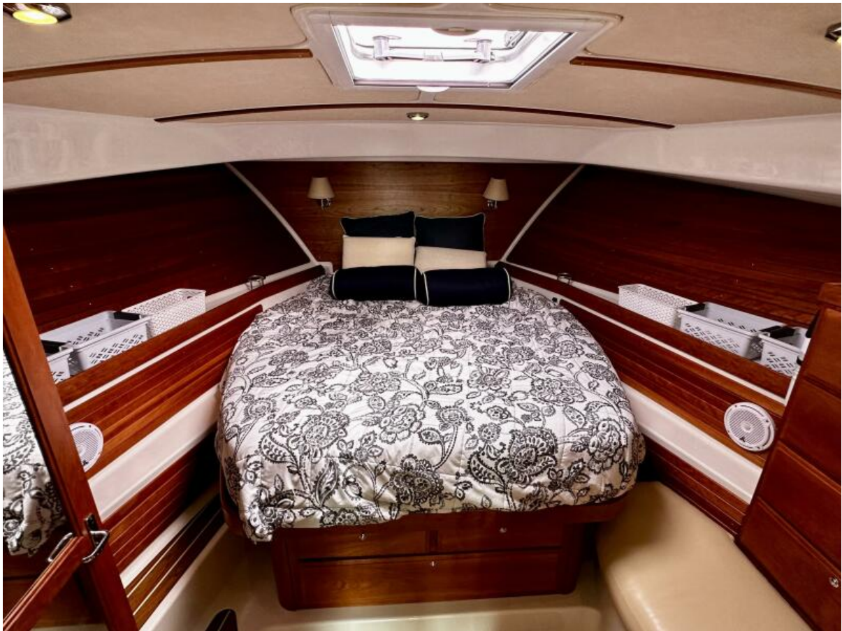
Owners Berth 2010 Back Cove 37 Owner's Berth. For Sale Central Agent Northstar Yacht Sales