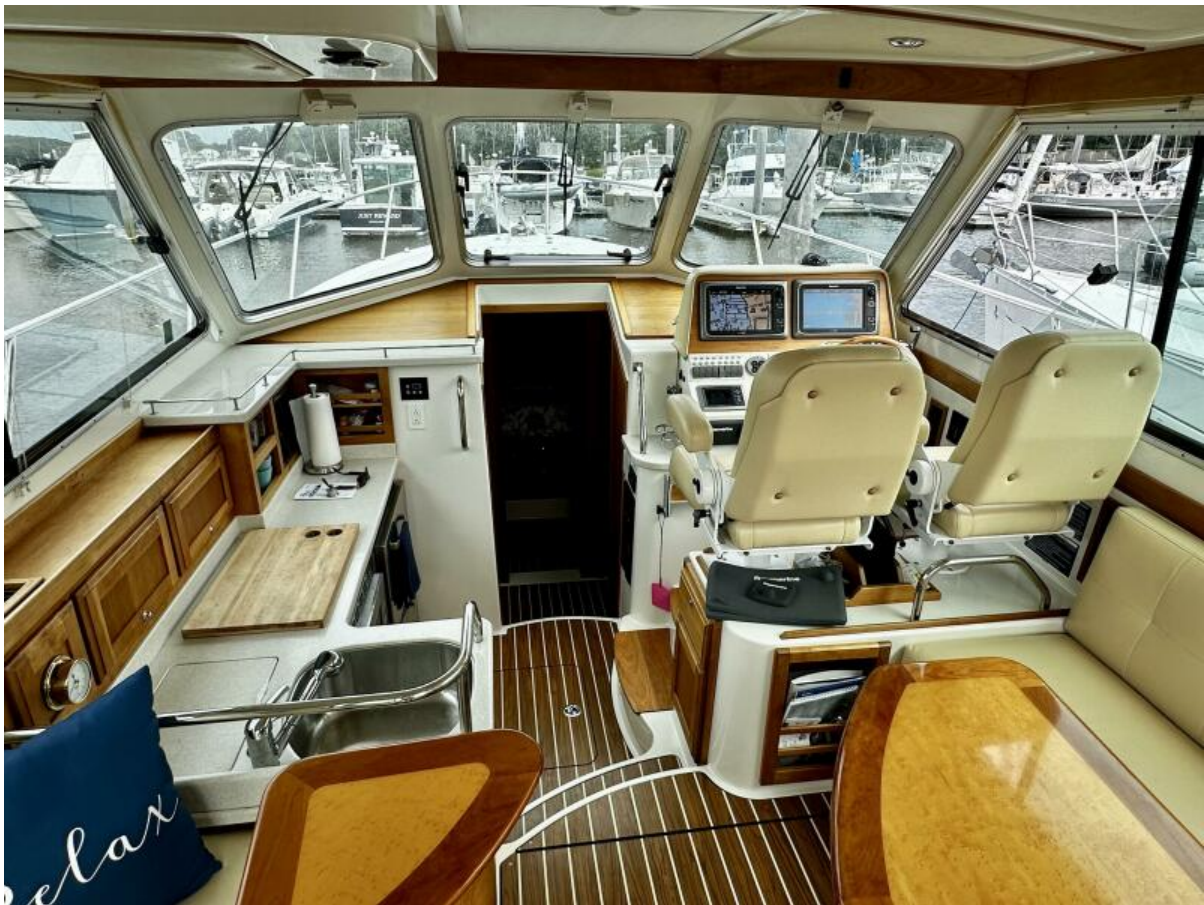
Salon Looking FWD 2010 Back Cove 37 Salon looking forward. For Sale Central Agent Northstar Yacht Sales