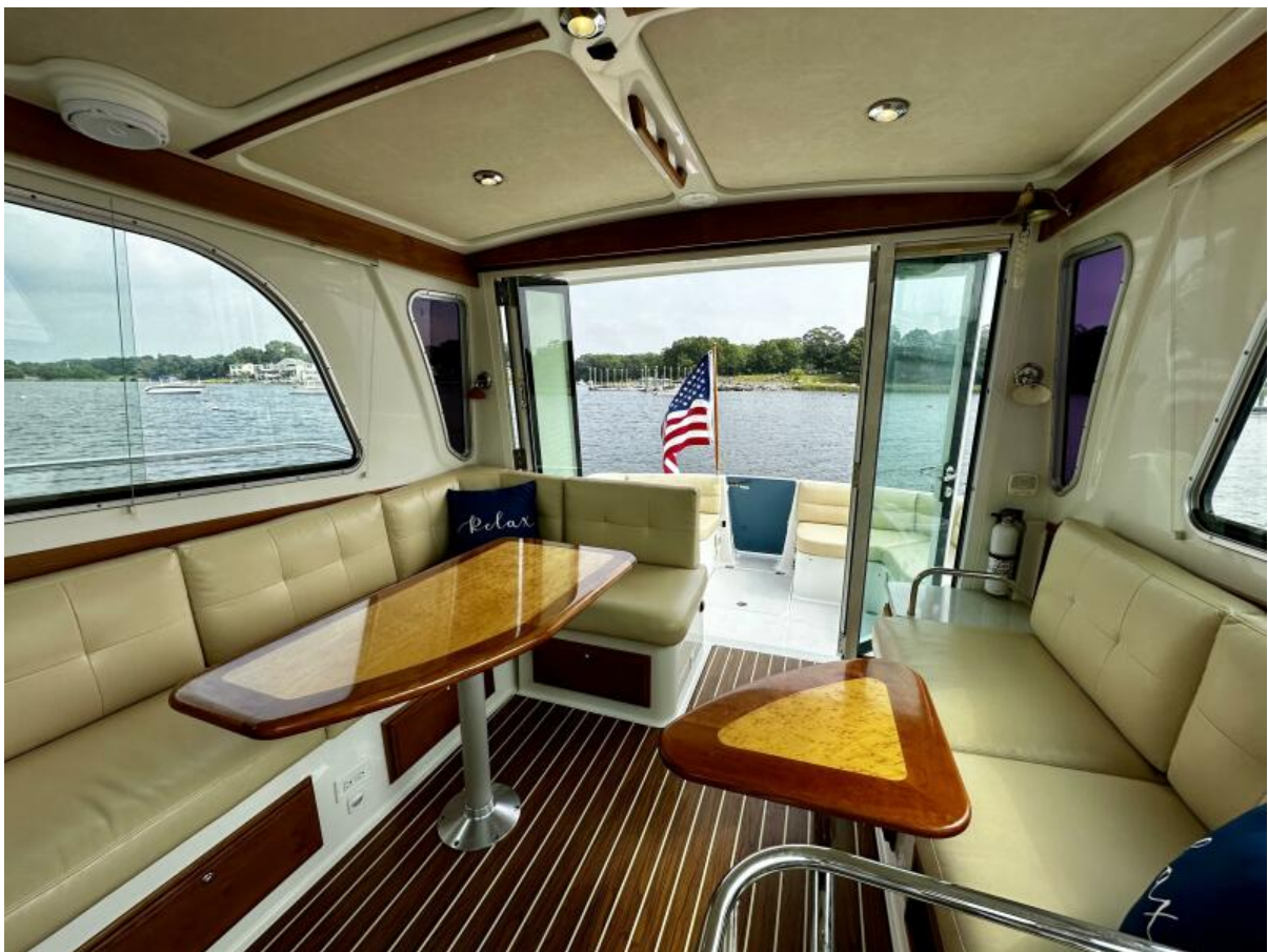
Salon 2010 Back Cove 37 Salon. For Sale Central Agent Northstar Yacht Sales