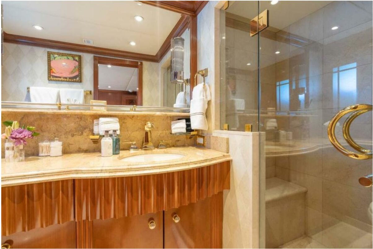
Port Guest Ensuite