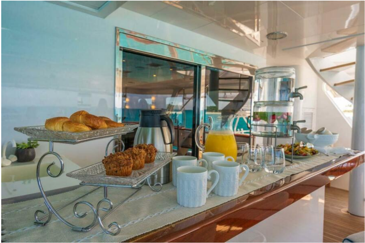
Aft Deck Bar