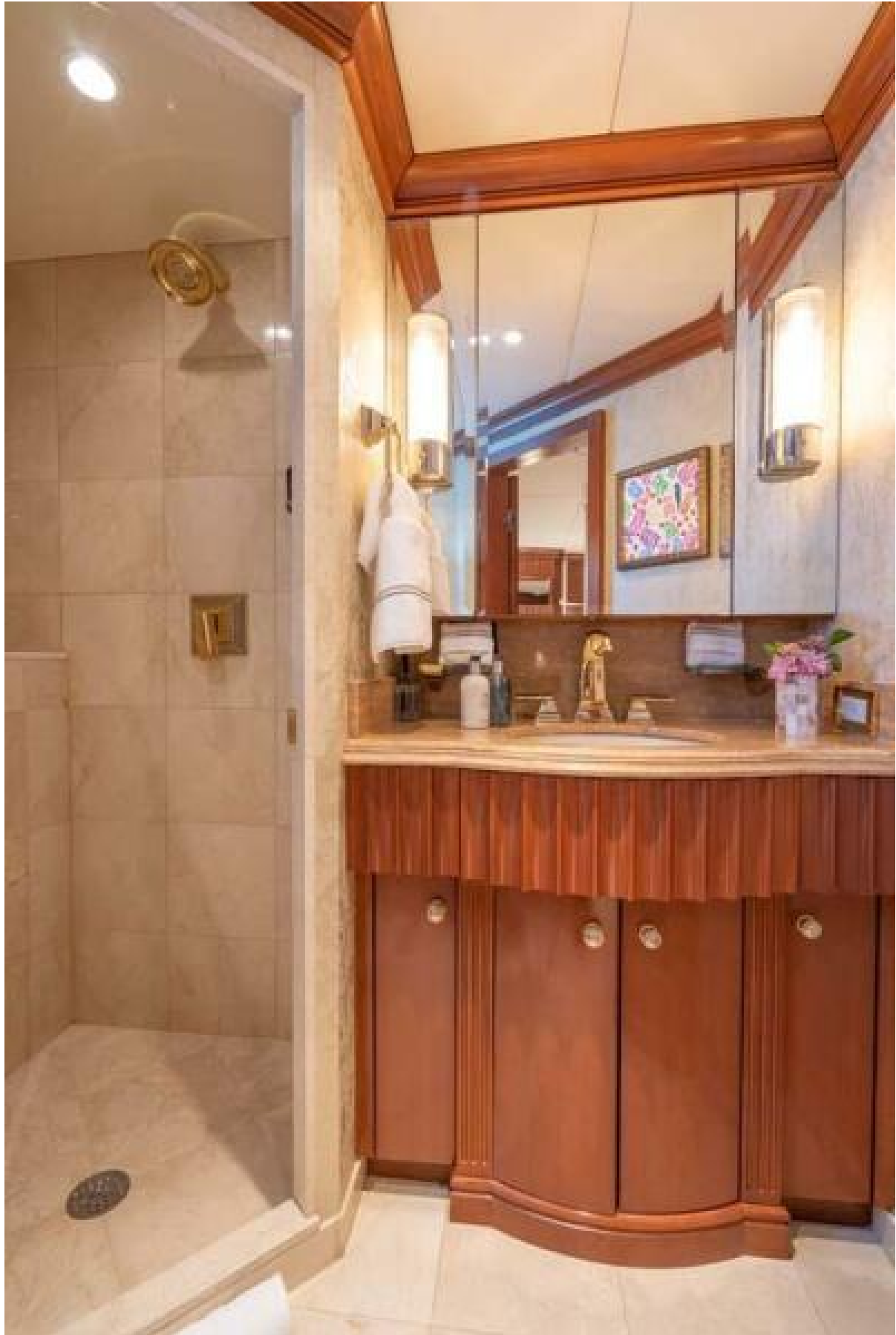
Twin Guest Ensuite