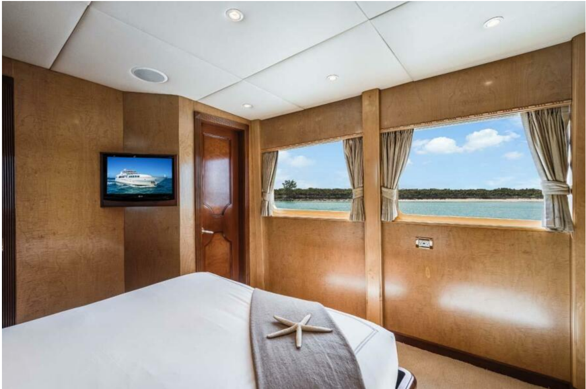
On Deck VIP Stateroom