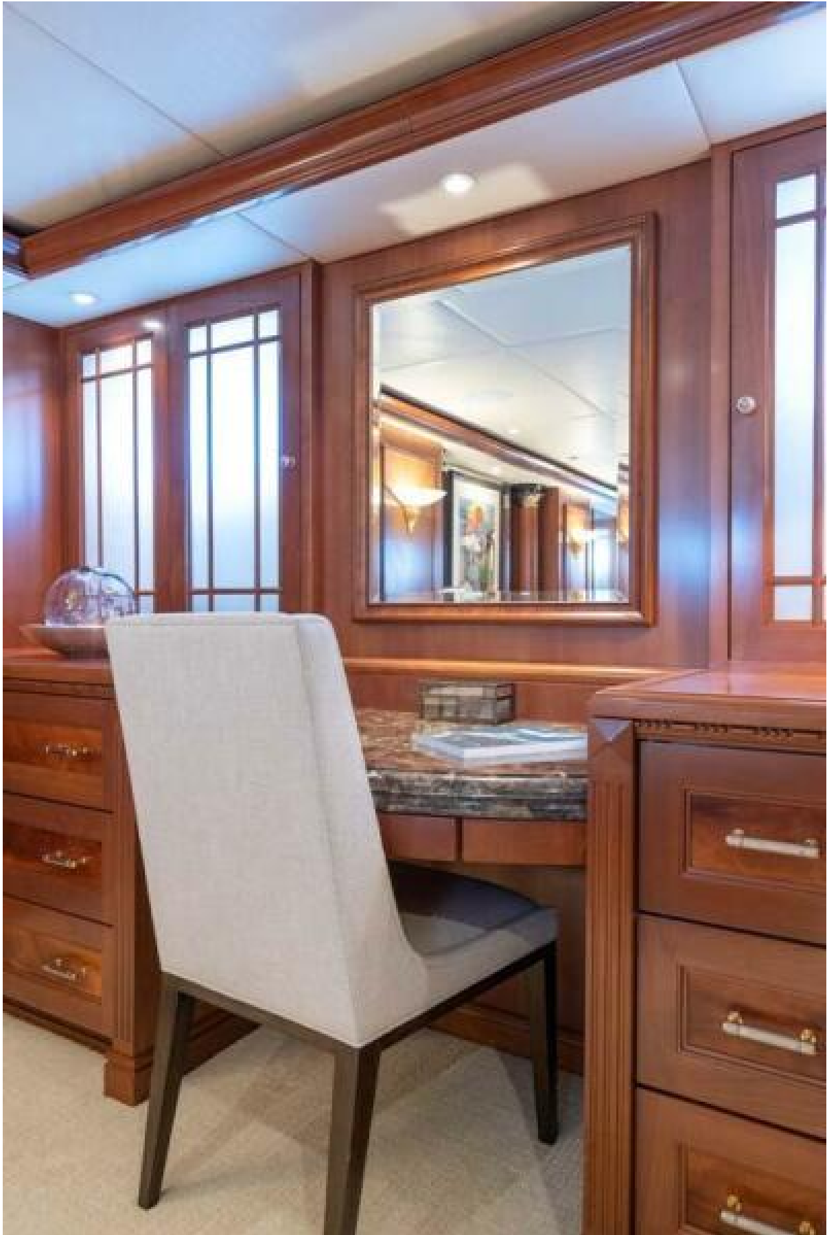
Desk in Owner Stateroom