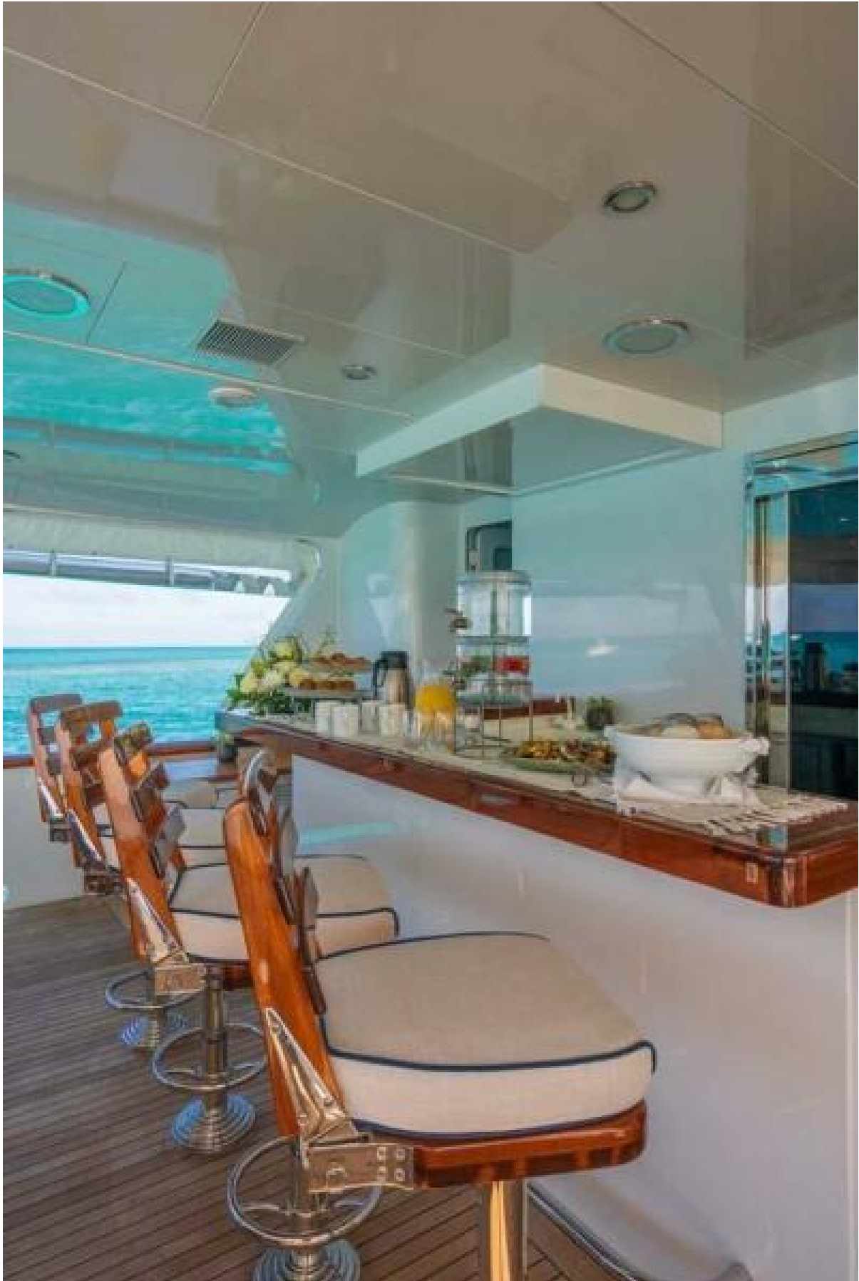
Aft Deck Bar