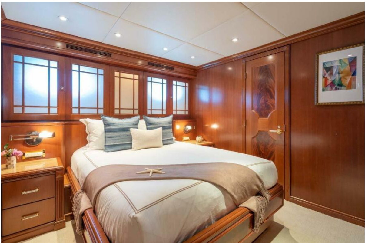
Port Guest Stateroom