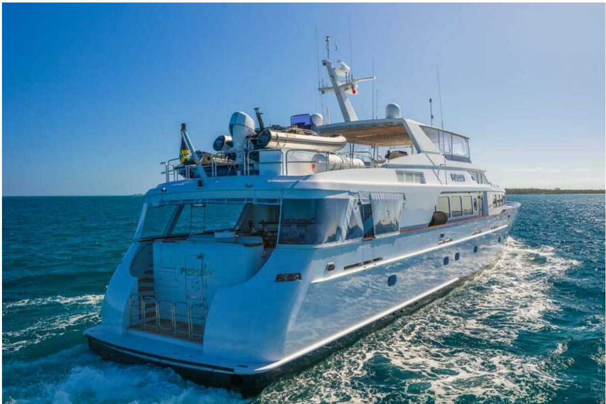
Starboard Stern Profile