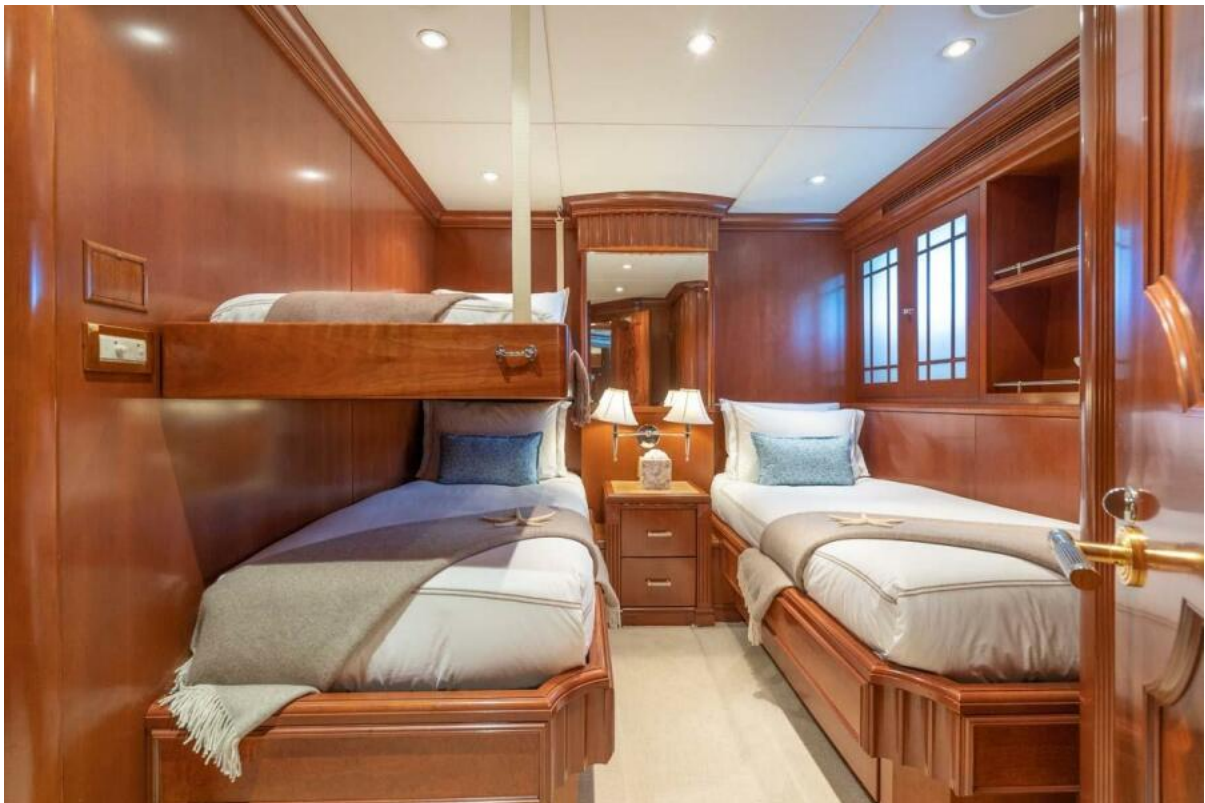
Twin Guest Stateroom Showing Pullman