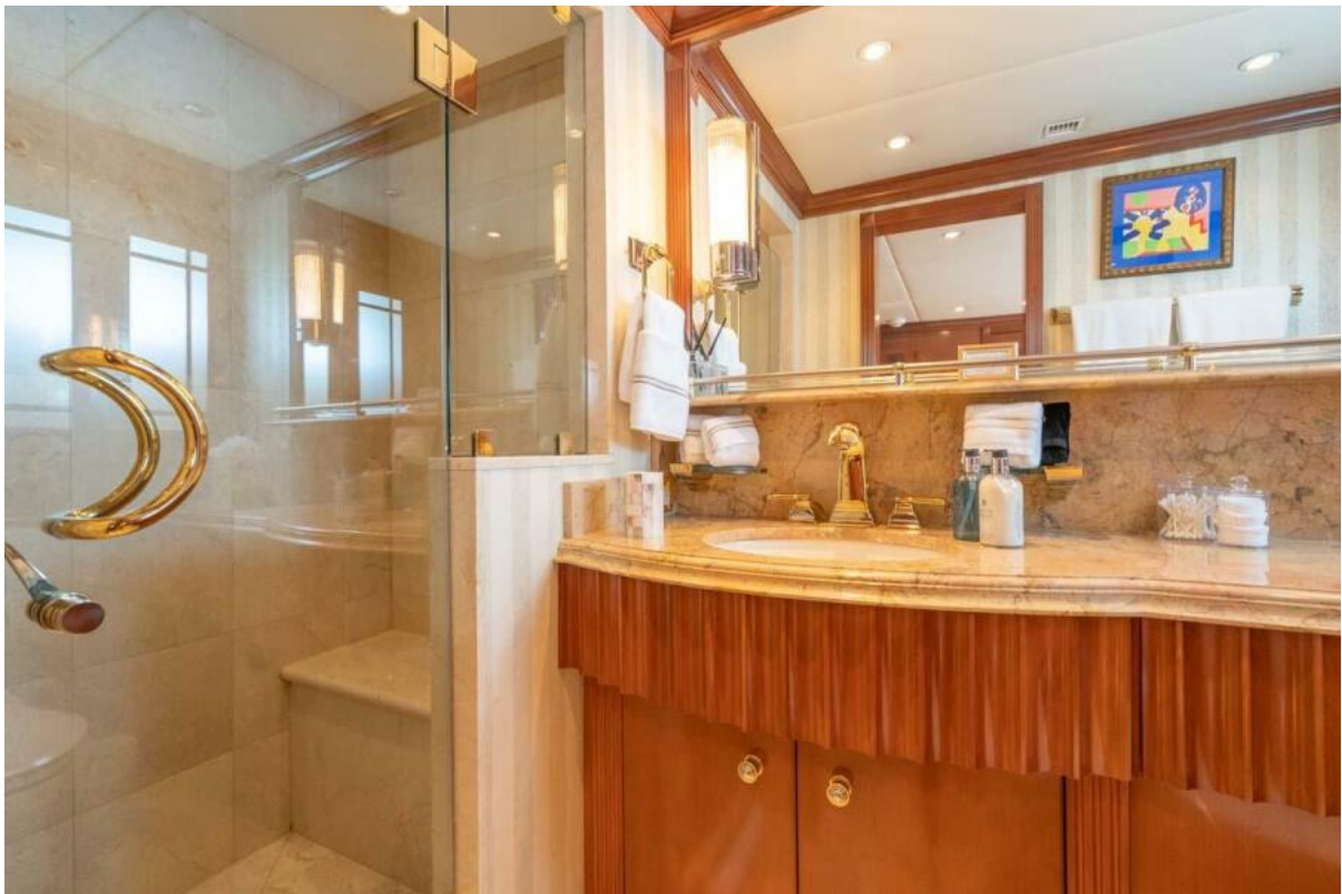
Starboard Guest Stateroom