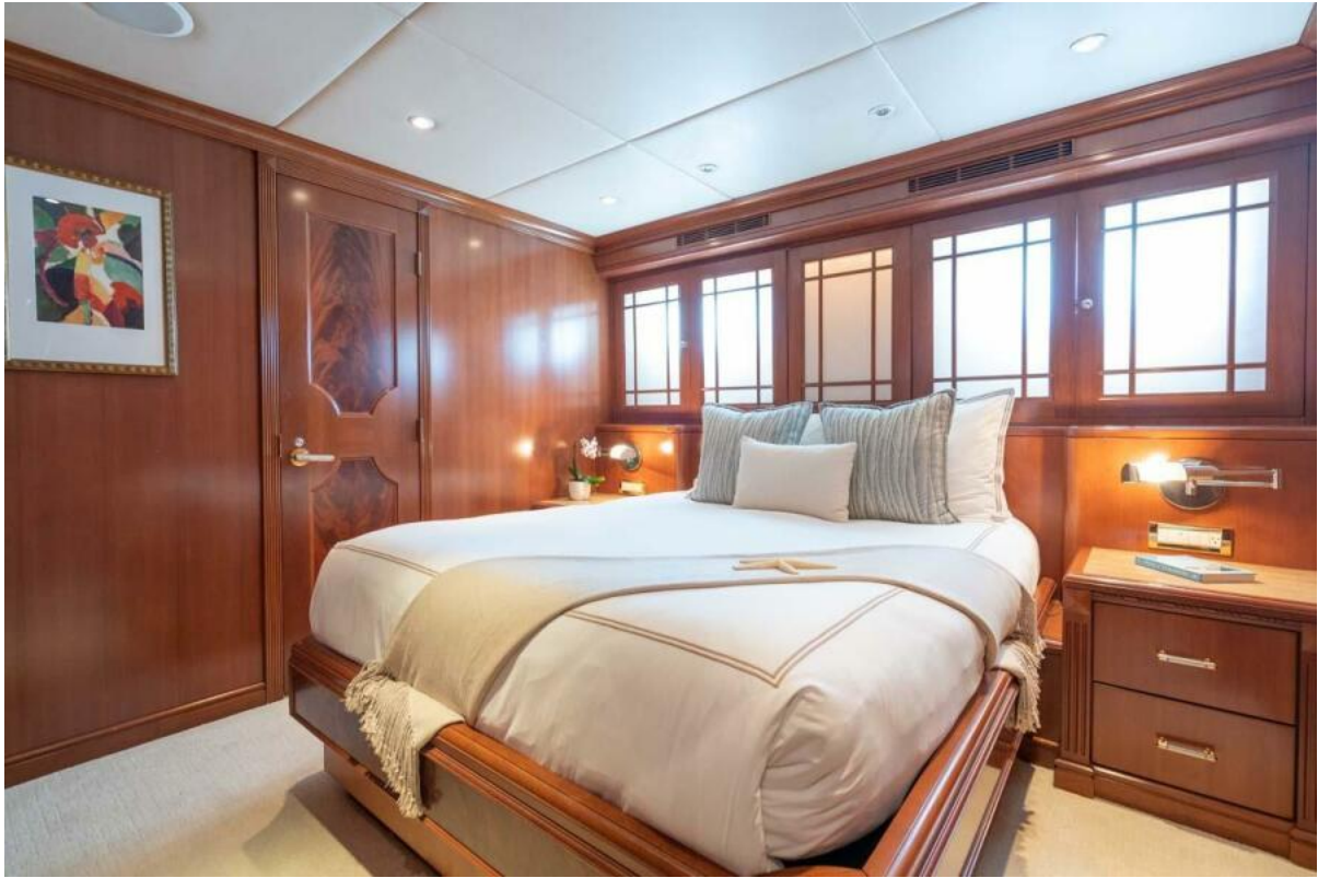
Starboard Guest Stateroom