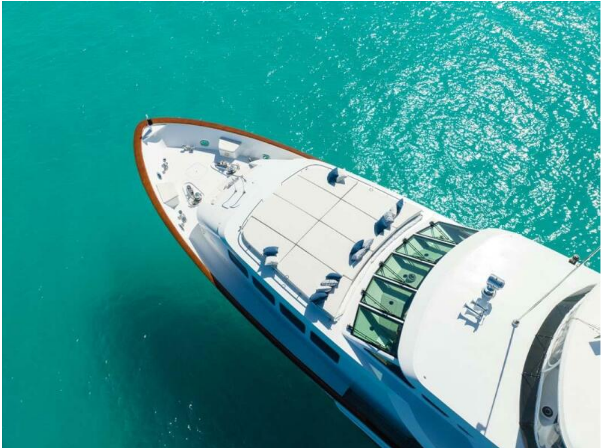
Aerial Foredeck with Huge Bunny Pad