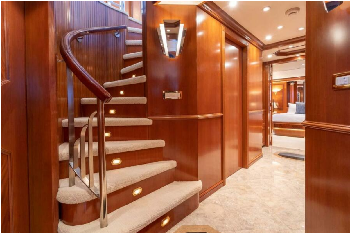
Lower Foyer and Owner Stateroom Entrance