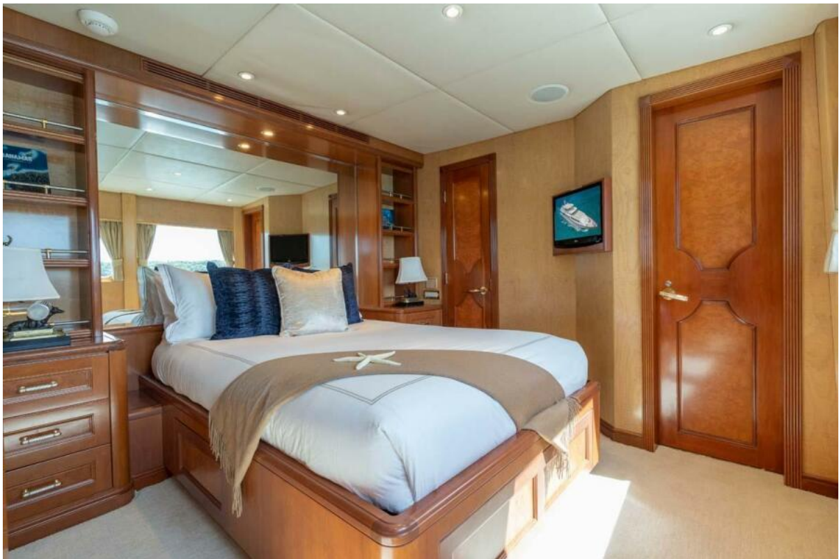
On Deck VIP Stateroom