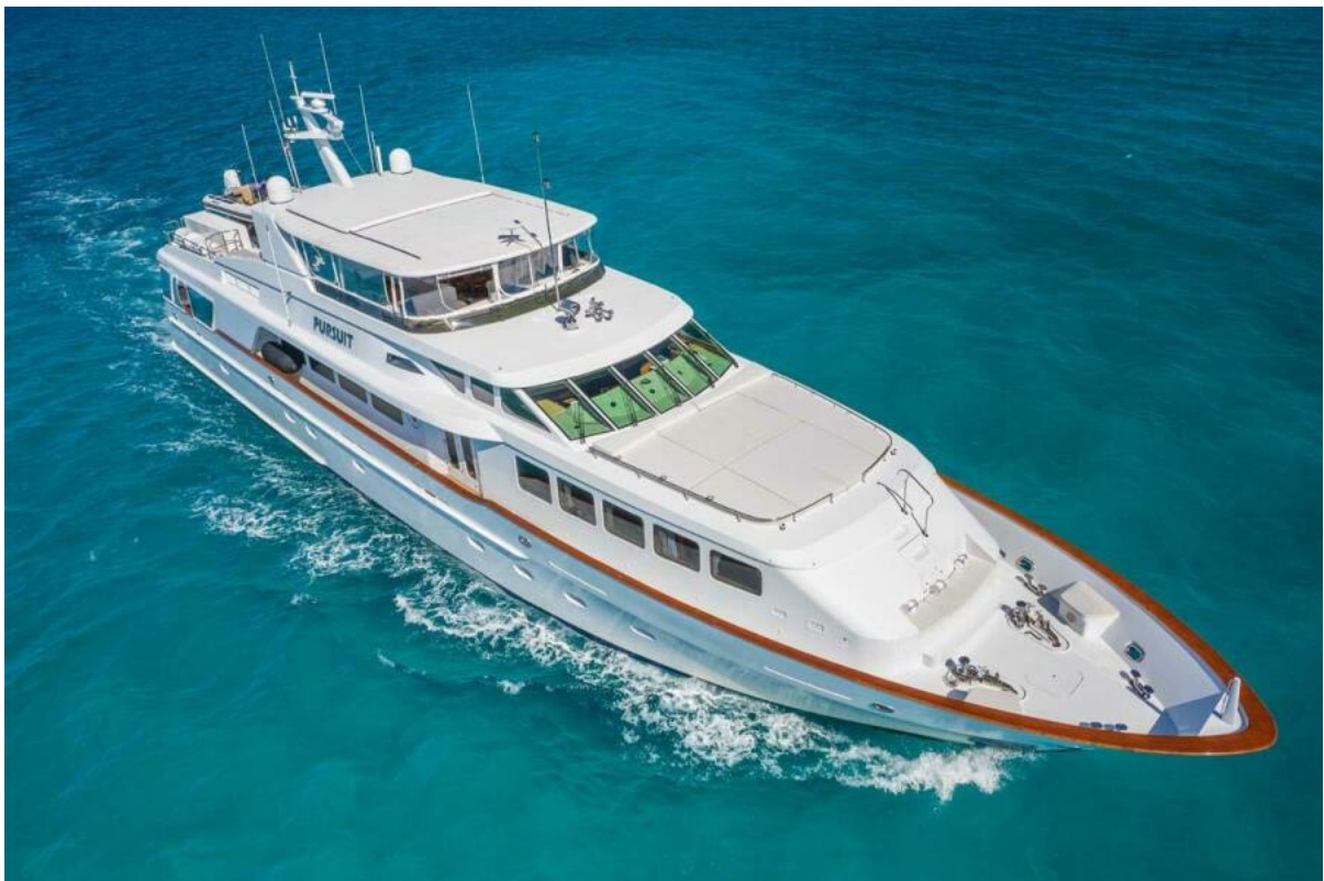
Starboard Bow Profile