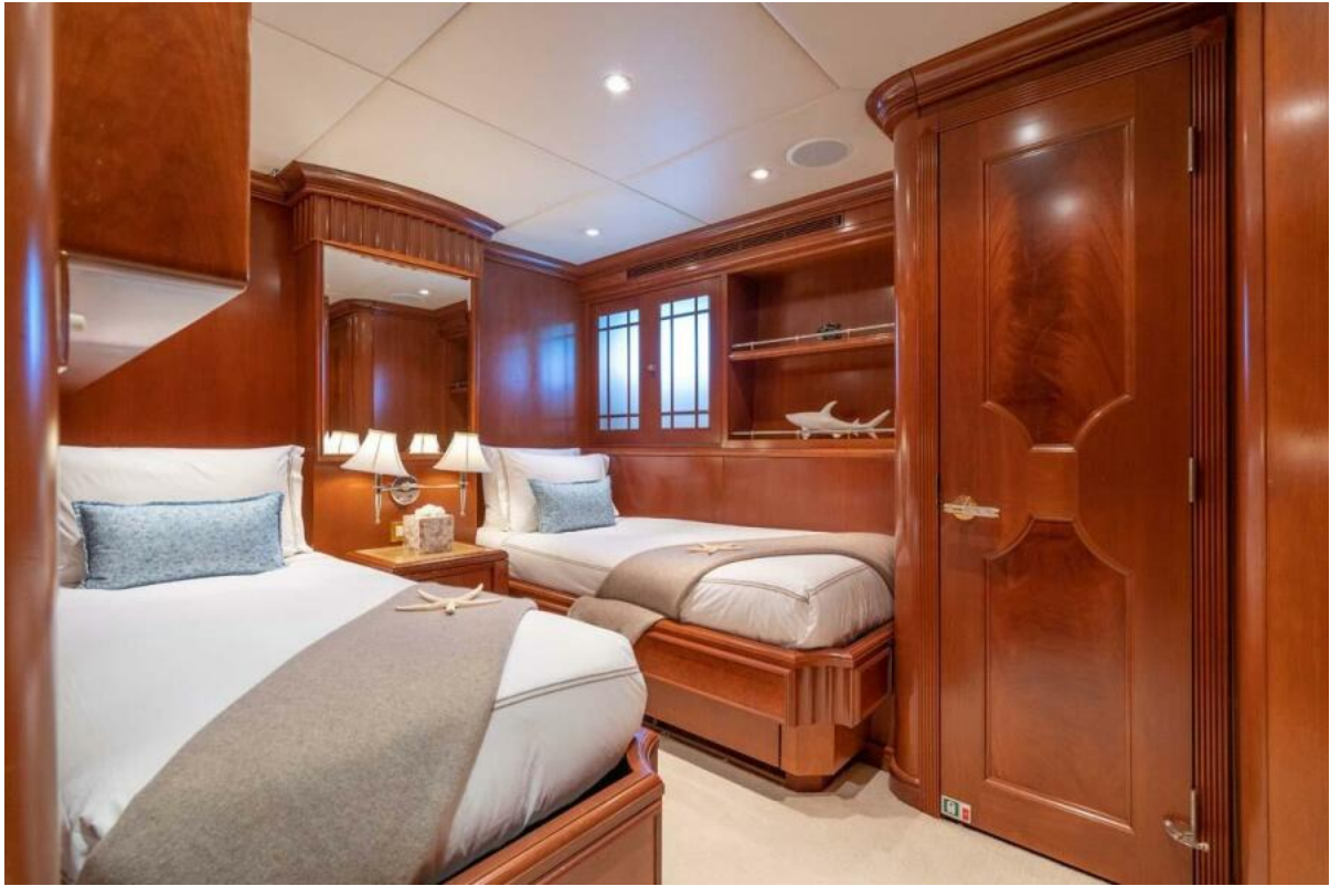
Twin Guest Stateroom