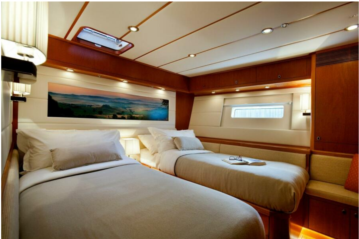
28_SELENA_Swan 105_8Guest Twin (4)