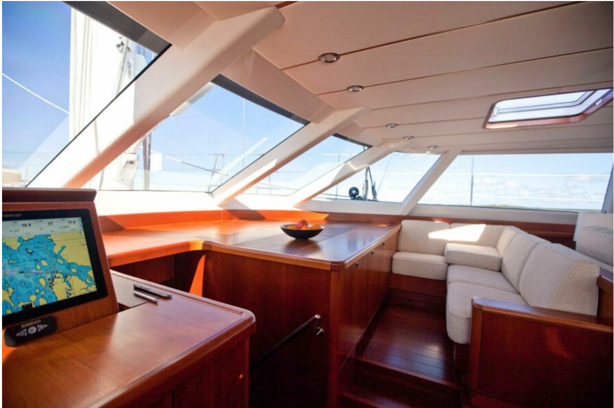
19_SELENA_Swan 105_5Salon (16)