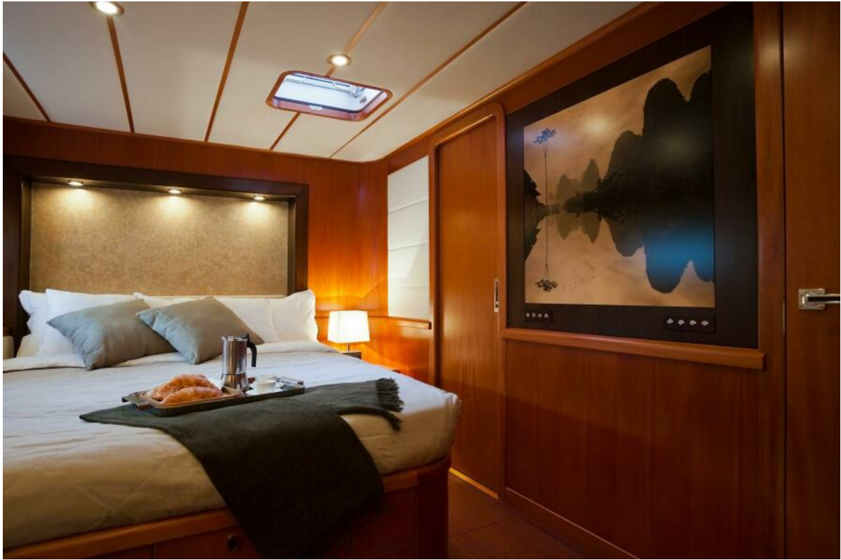
27b_SELENA_Swan 105_7Guest Double (8)