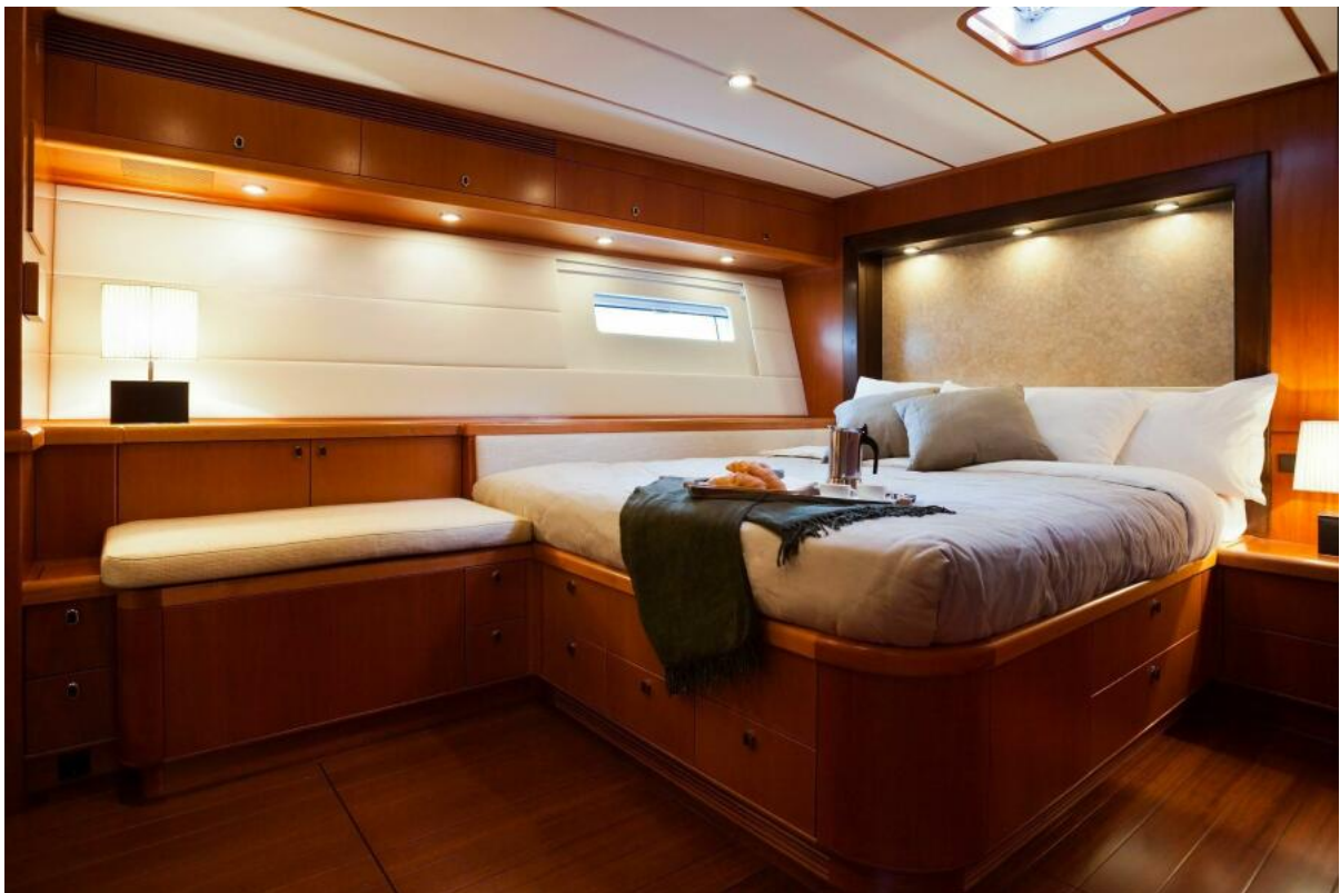
27_SELENA_Swan 105_7Guest Double (1)