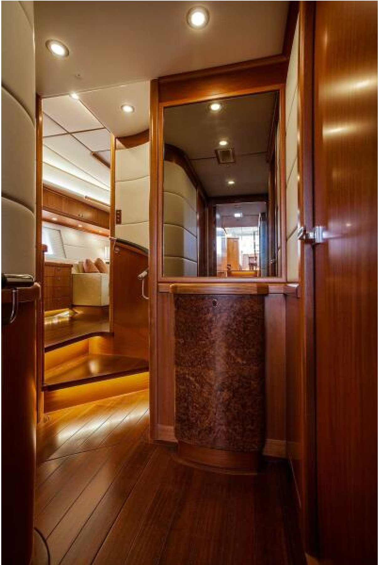
20a_SELENA_Swan 105_5Salon (15)