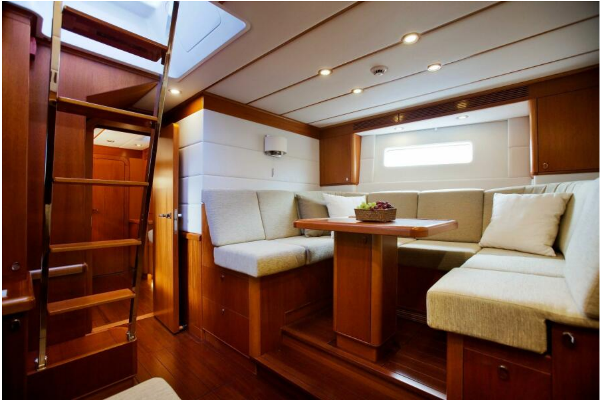
29_SELENA_Swan 105_9Crew (6)