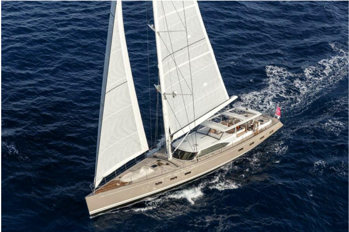
40_SELENA_Swan 105_1Aerial (2)