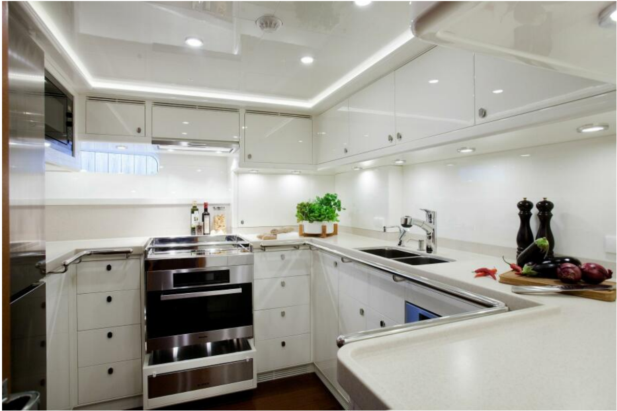
32_SELENA_Swan 105_10Galley (1)