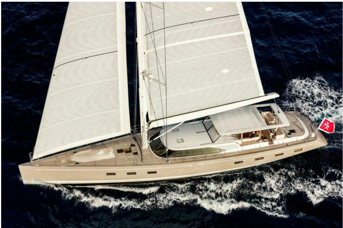
02_SELENA_Swan 105_1Aerial (4)