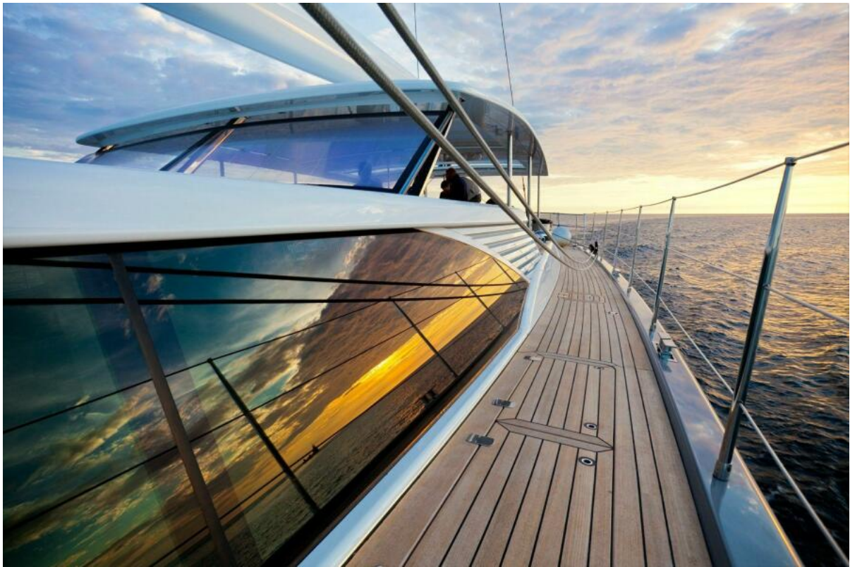
06_SELENA_Swan 105_2Deck (5)