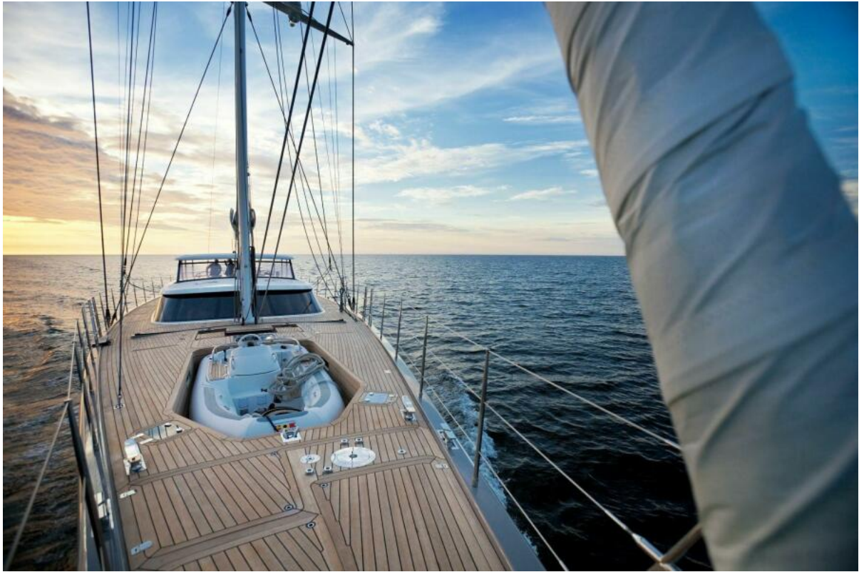
04_SELENA_Swan 105_2Deck (4)