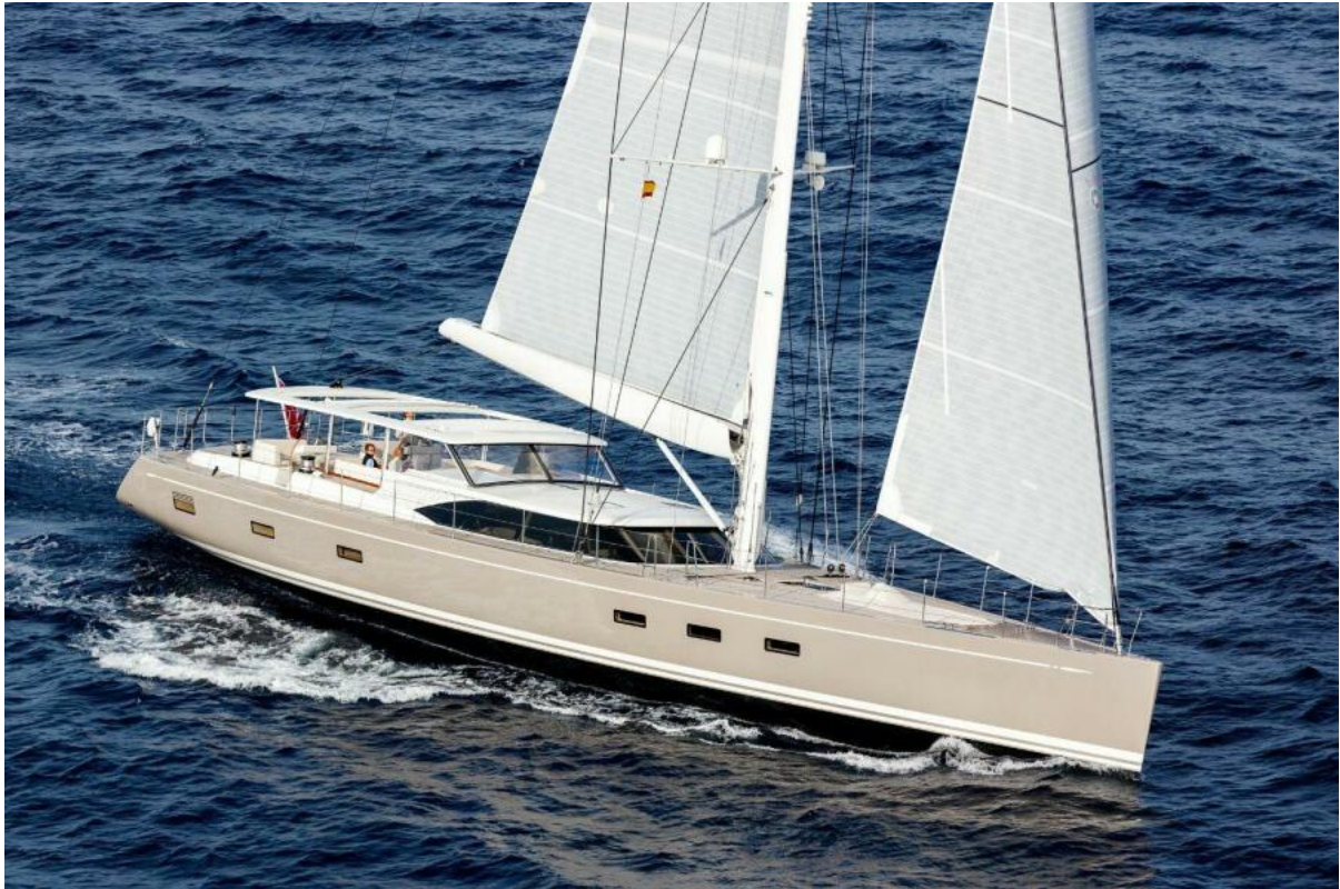
01_SELENA_Swan 105_1Aerial (5)