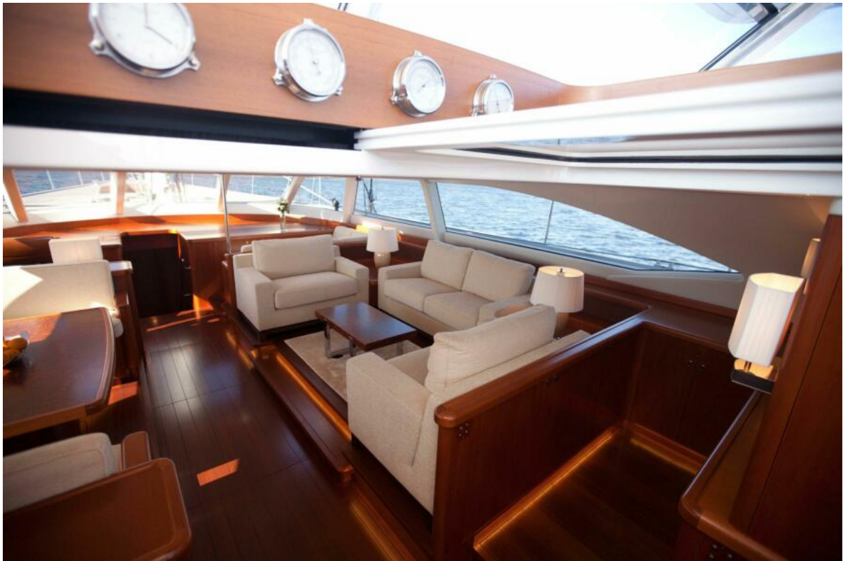
14b_SELENA_Swan 105_5Salon (20)