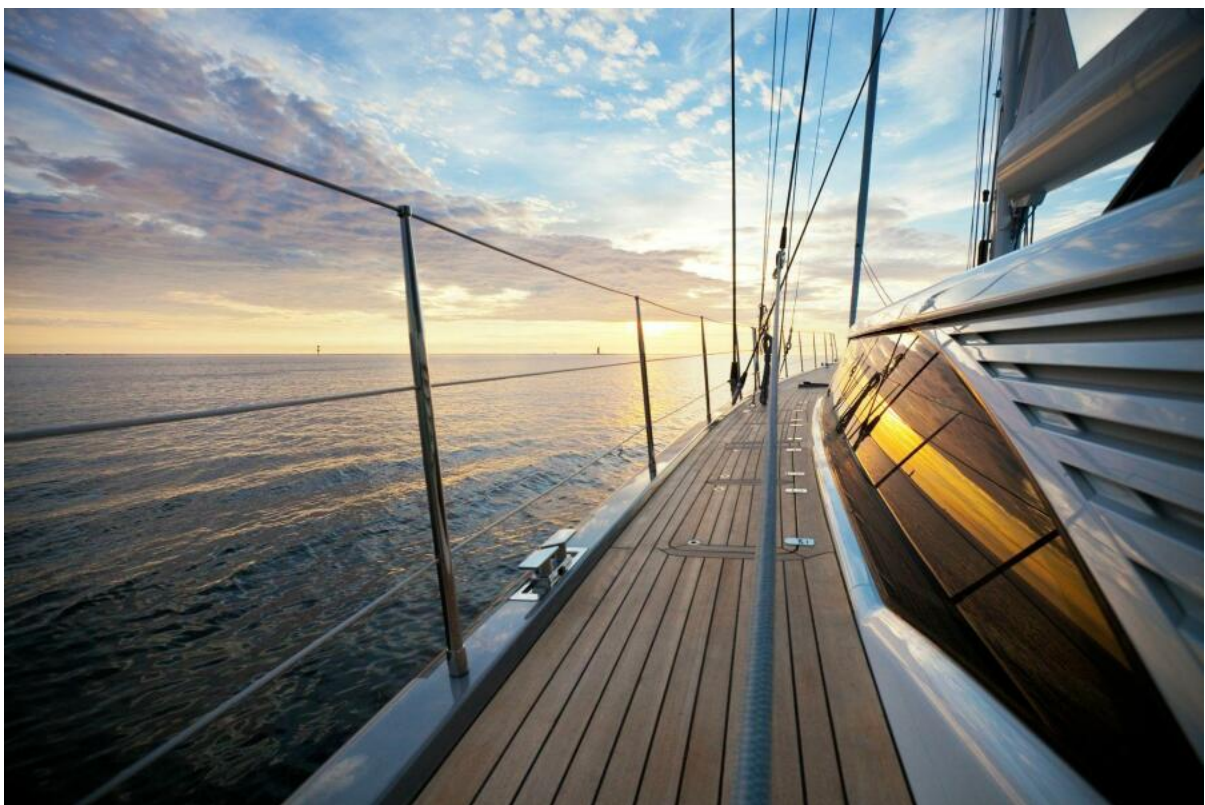
07_SELENA_Swan 105_2Deck (1)