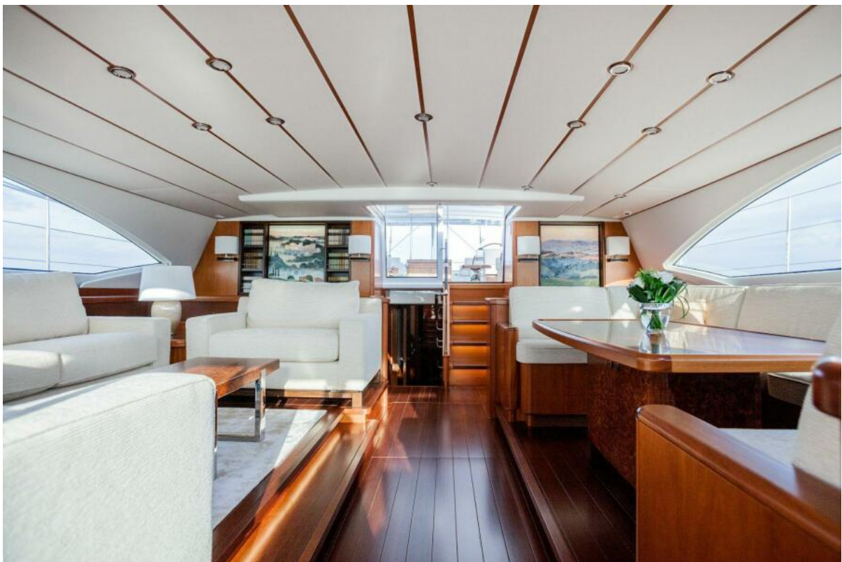
15_SELENA_Swan 105_5Salon (1)