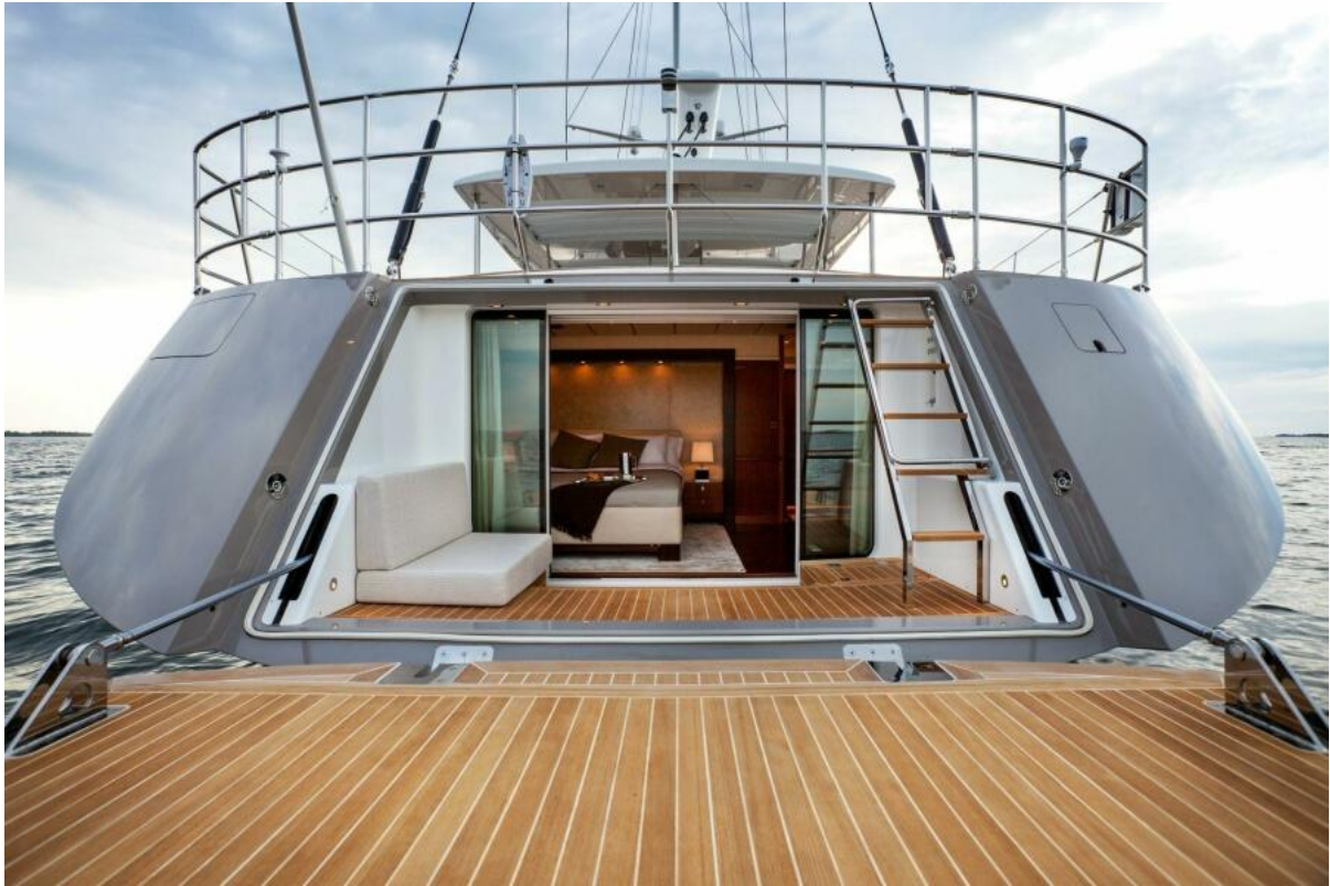
25_SELENA_Swan 105_4swim Platform (4)