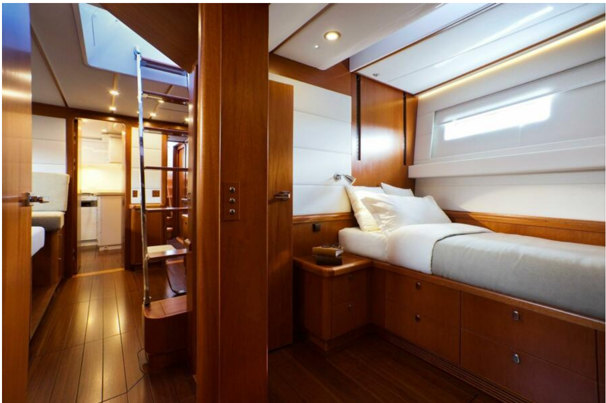
30_SELENA_Swan 105_9Crew (9)