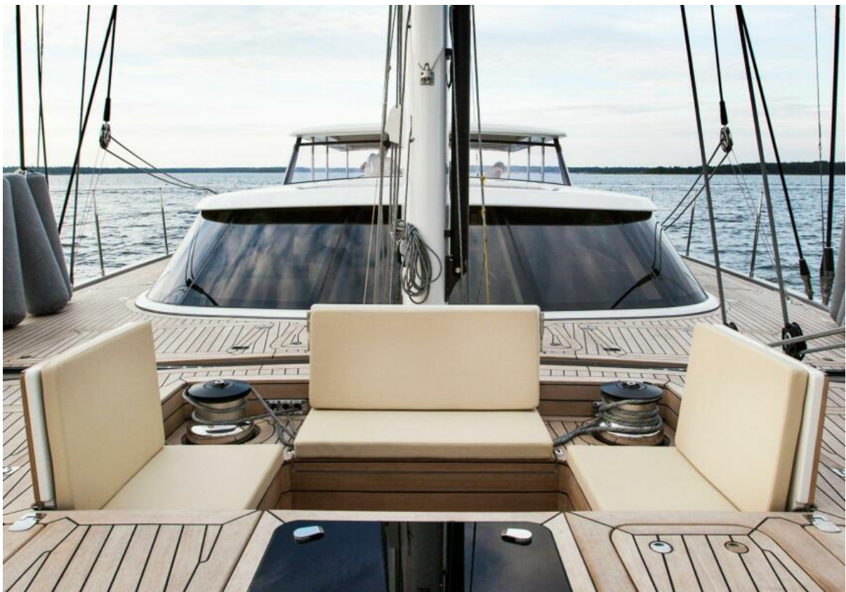
05_SELENA_Swan 105_2deck (4a)