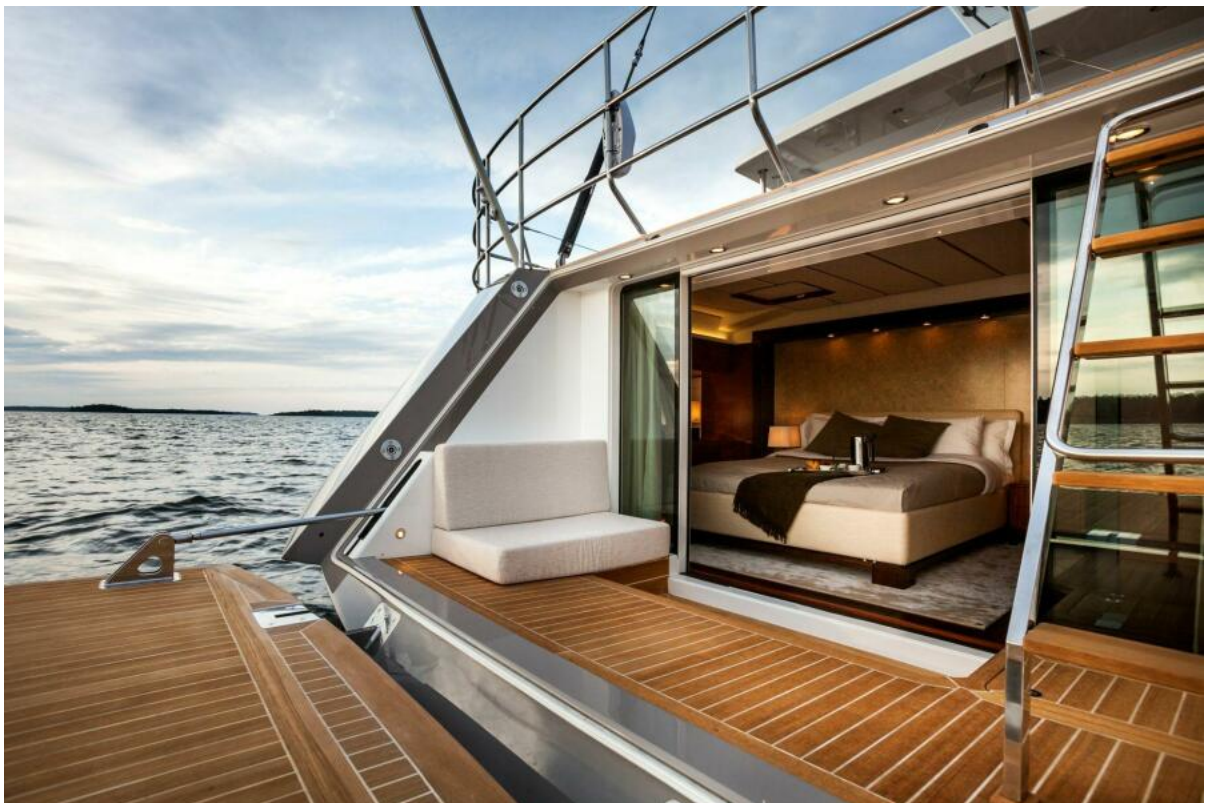
24_SELENA_Swan 105_4swim Platform (6)