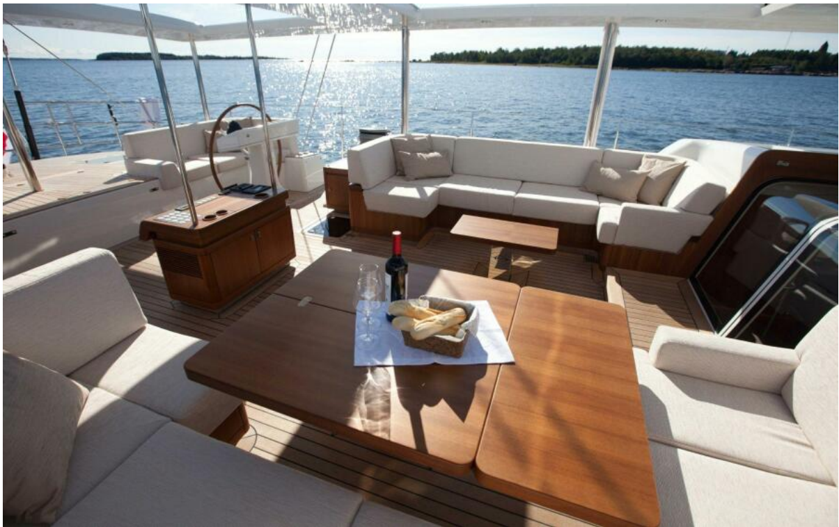
09_SELENA_Swan 105_3cockpit (3)