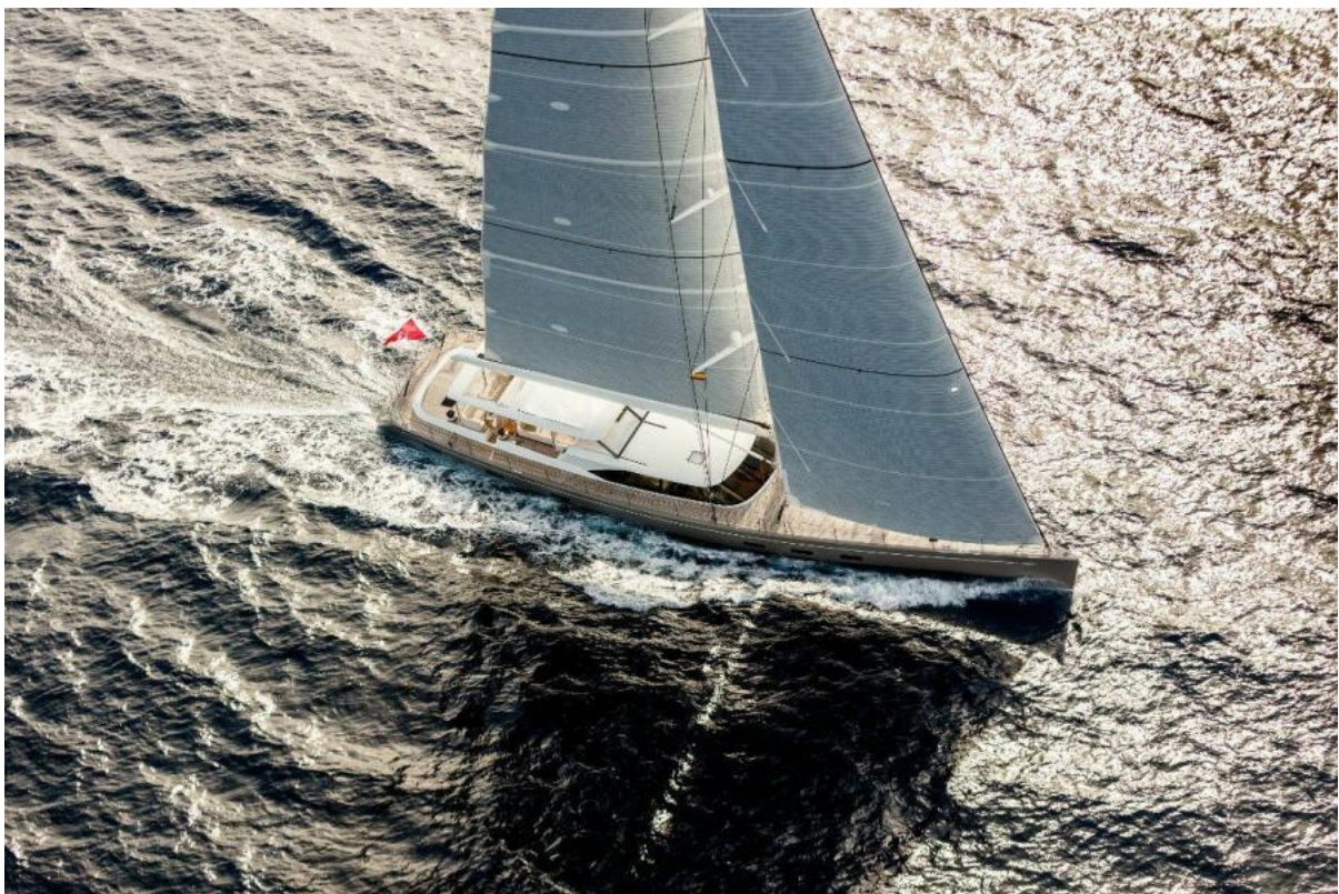
SELENA_Swan 105_1Aerial (1)