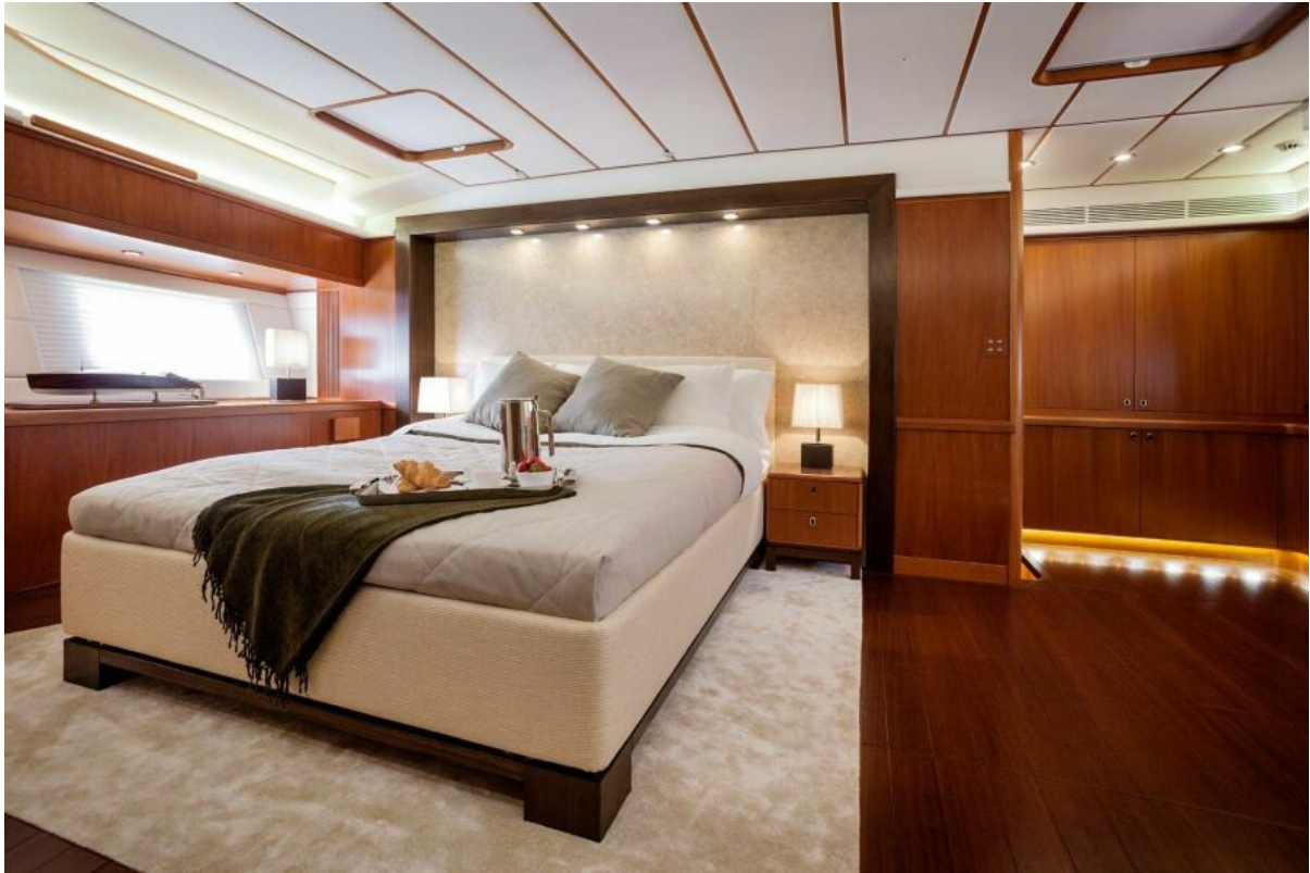
21a_SELENA_Swan 105_6Master (6)