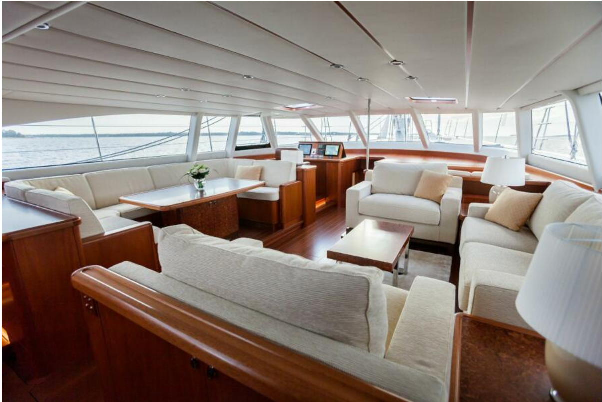
16_SELENA_Swan 105_5Salon (3)