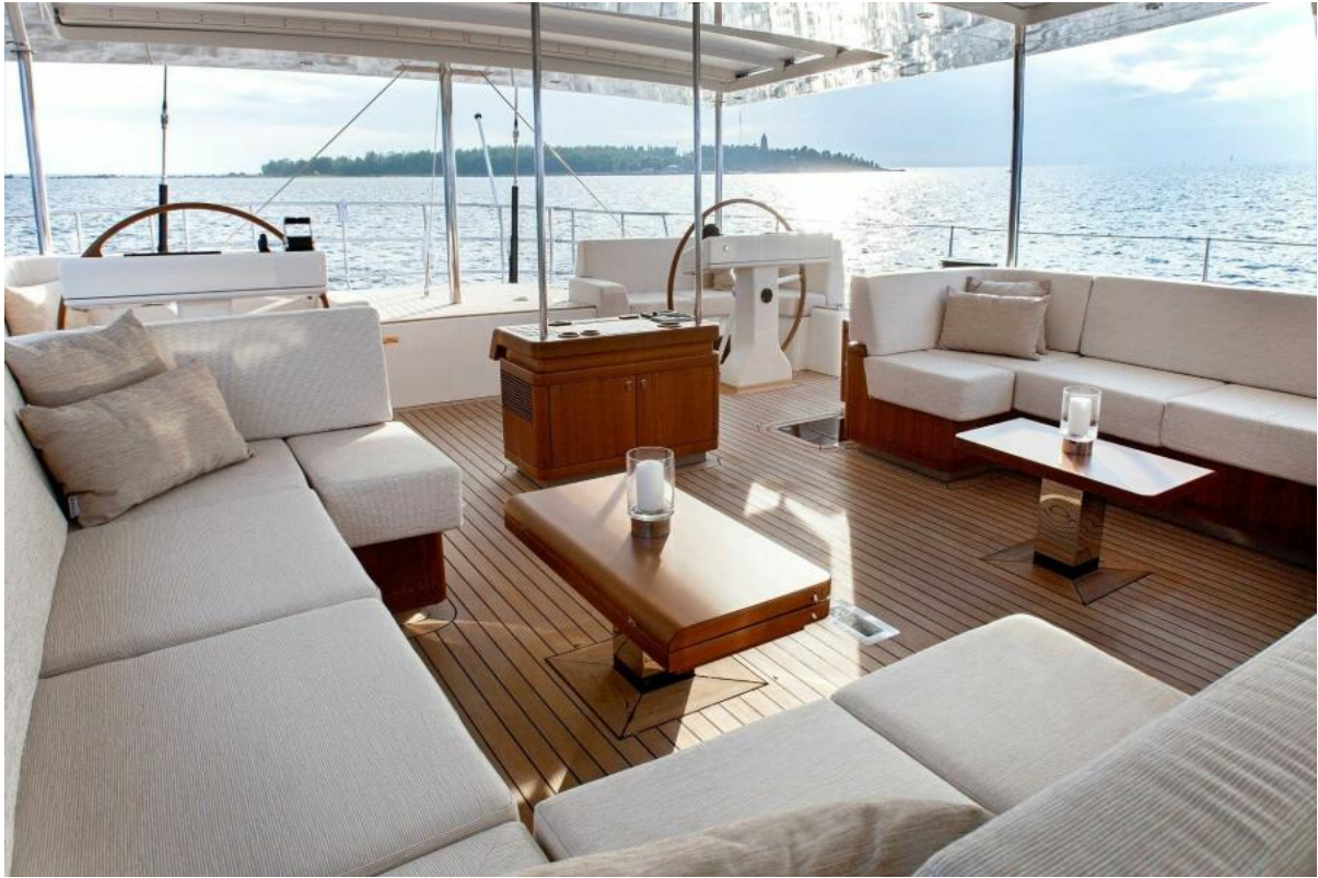
08_SELENA_Swan 105_3cockpit (1)