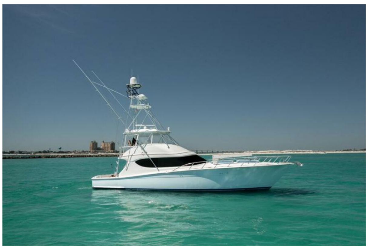
2016 Hatteras GT60 KNOT ON CALL STBD Profile