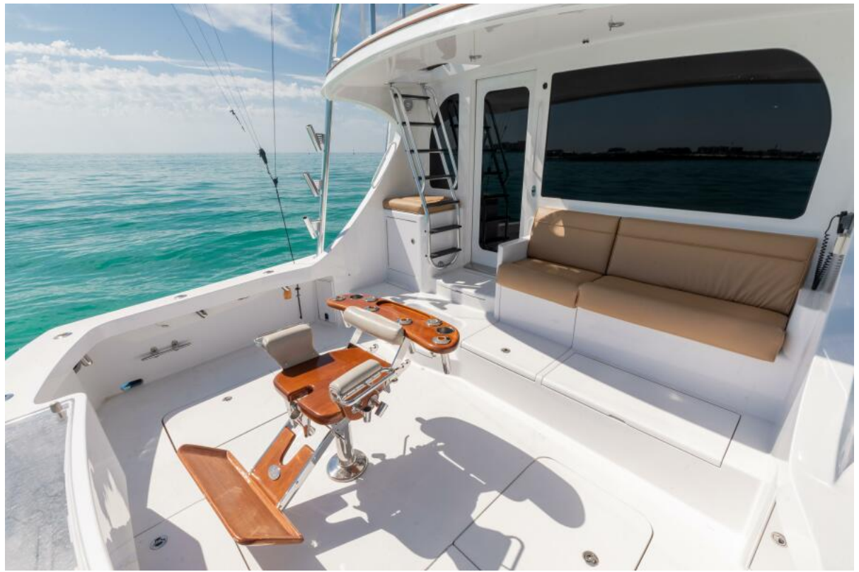
2016 Hatteras GT60 KNOT ON CALL Cockpit 1