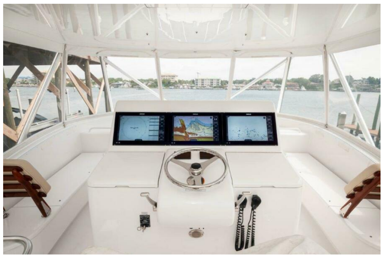
2016 Hatteras GT60 KNOT ON CALL Helm 2