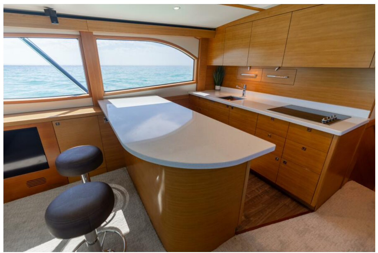
2016 Hatteras GT60 KNOT ON CALL Galley 1