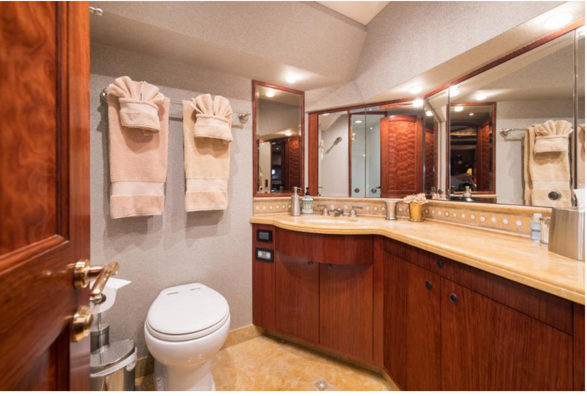
VIP LOWER DECK GUEST ENSUITE