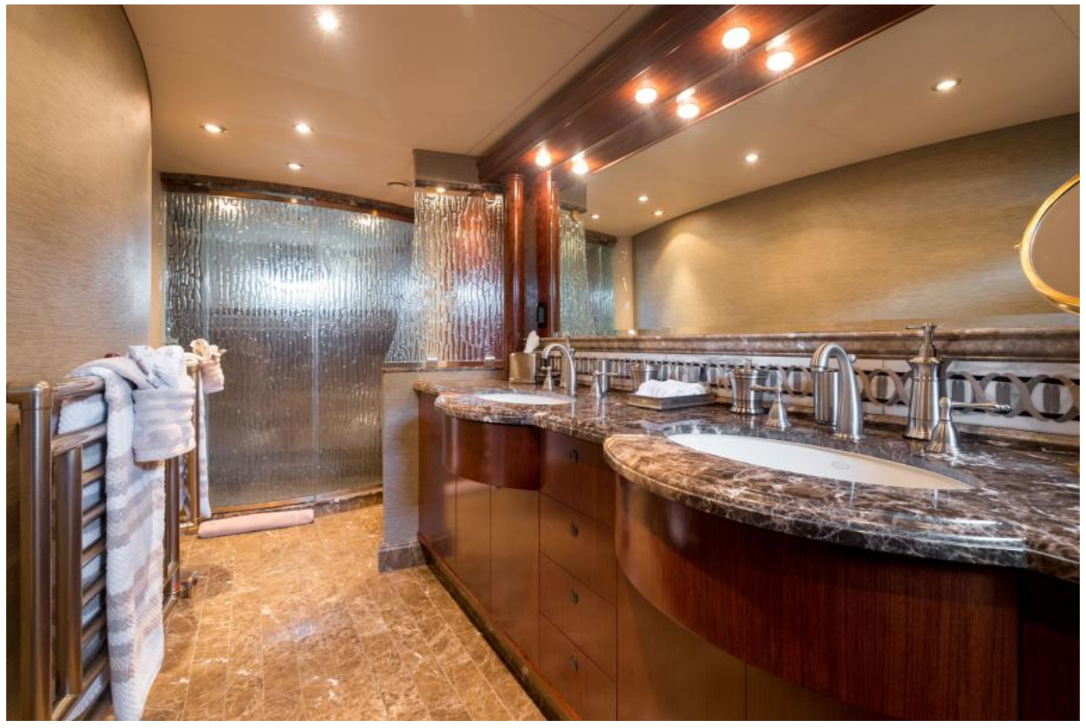
LOWER DECK MASTER ENSUITE