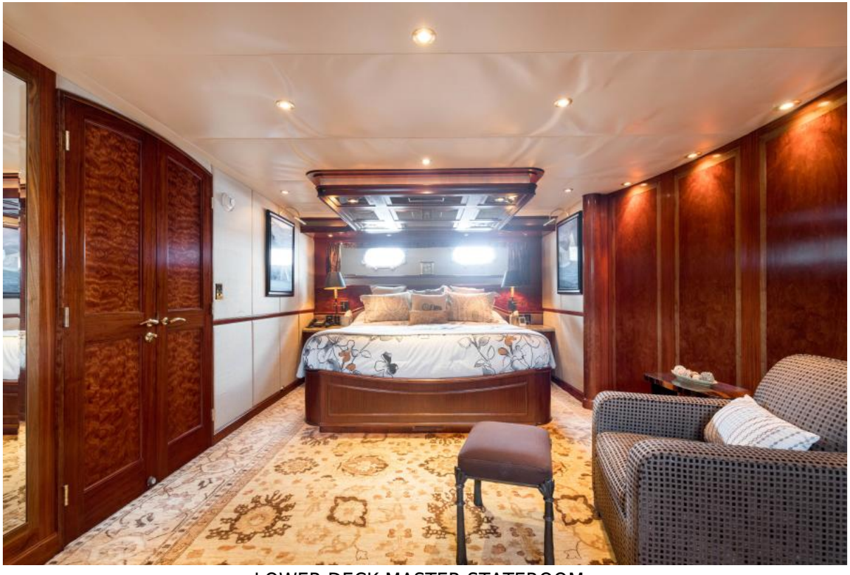
LOWER DECK MASTER STATEROOM