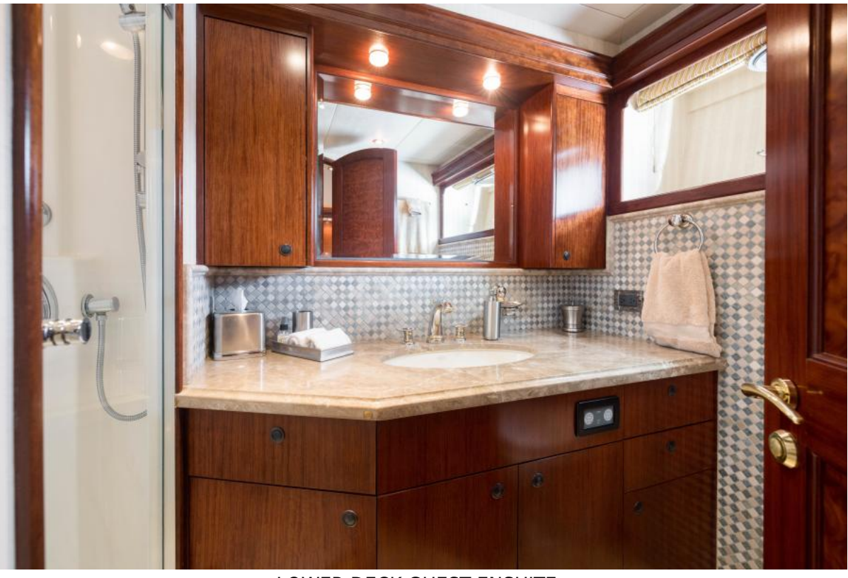
LOWER DECK GUEST ENSUITE