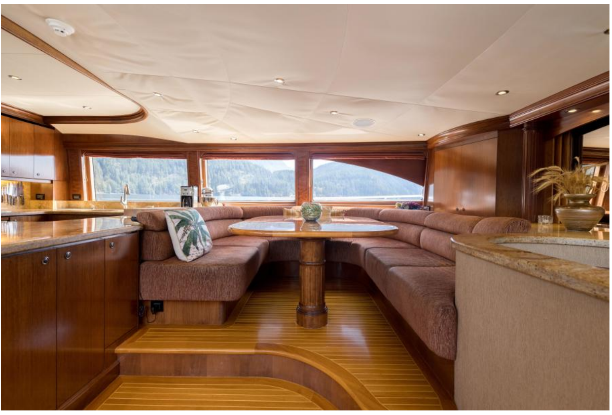
MAIN DECK GALLEY SEATING