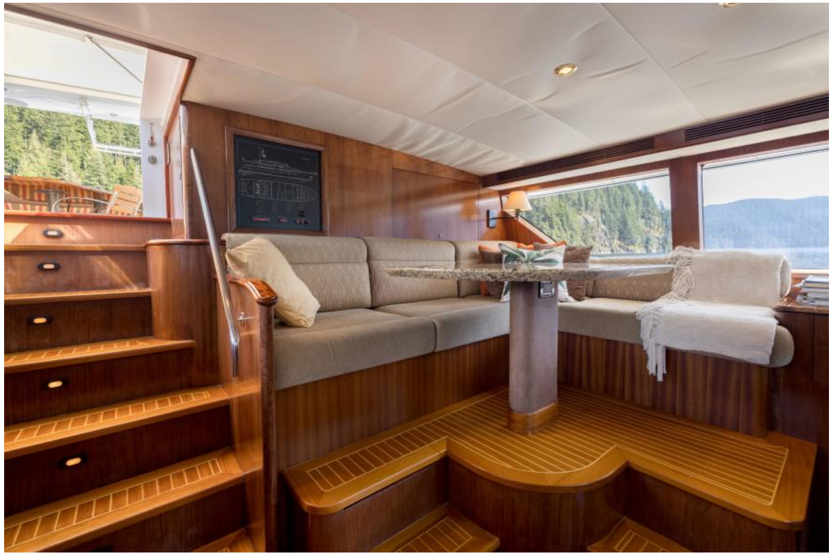
BRIDGE DECK PILOTHOUSE SEATING