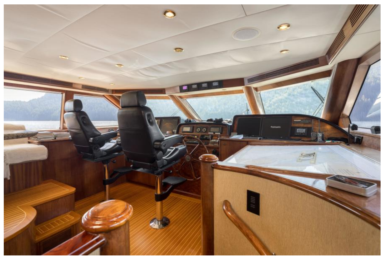
BRIDGE DECK PILOTHOUSE