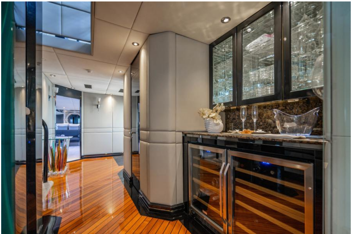
FOYER WINE BAR