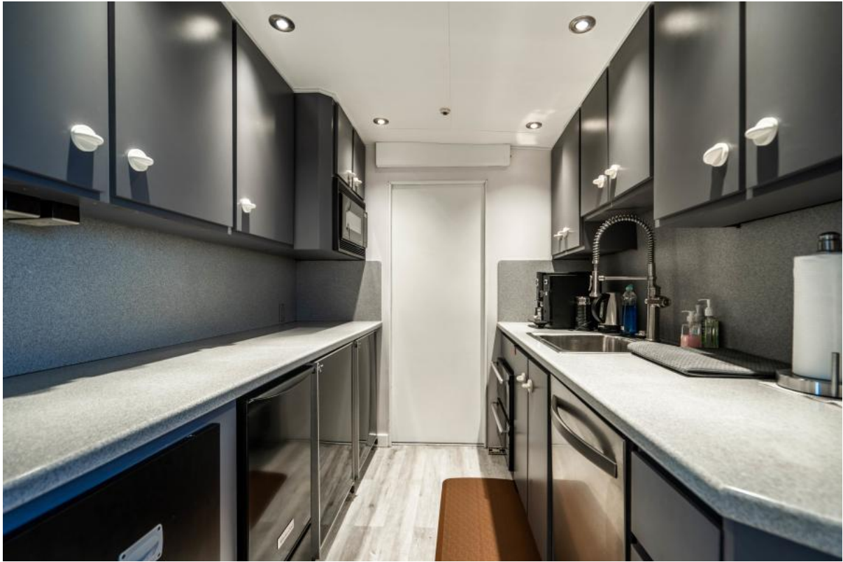
MAIN DECK STEW PANTRY