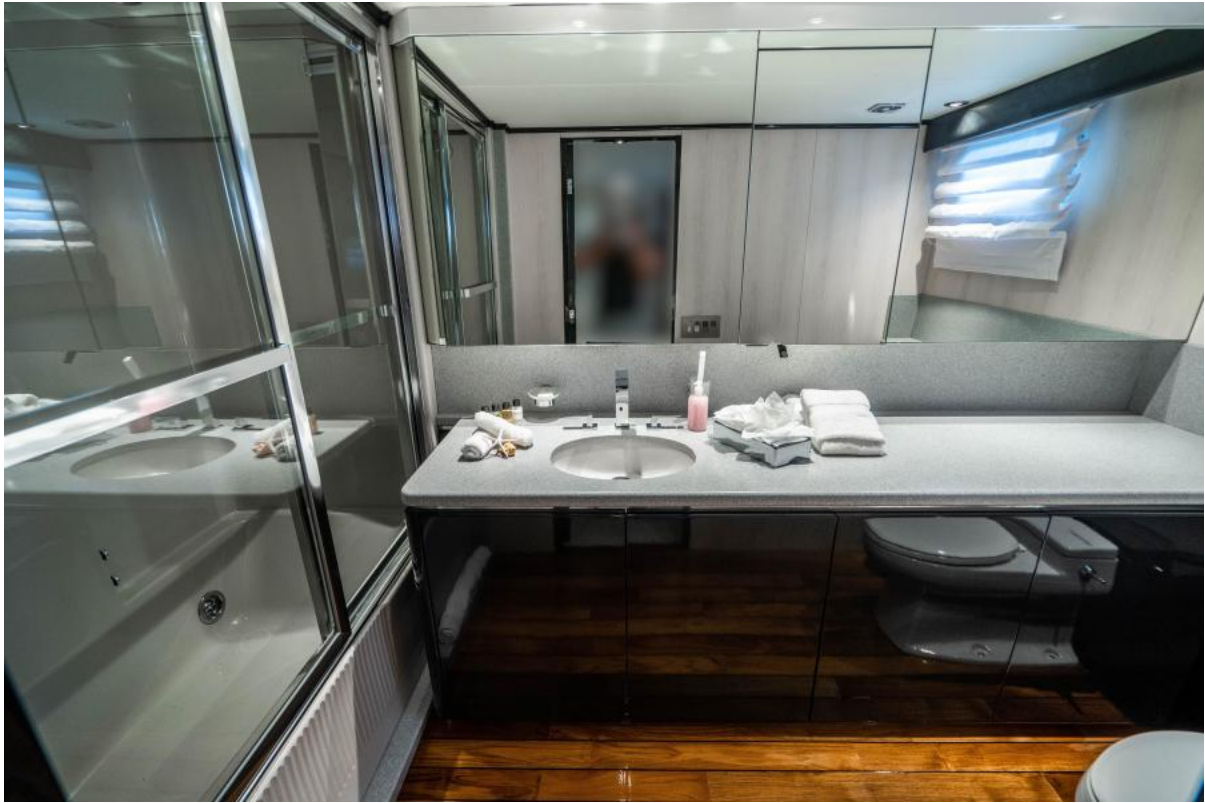
GUEST STATEROOM HEAD