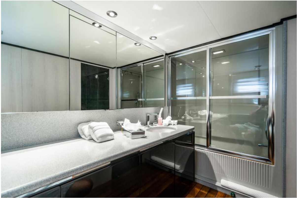
GUEST STATEROOM HEAD