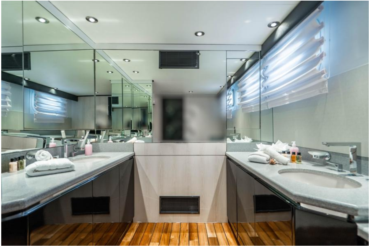
GUEST STATEROOM HEAD