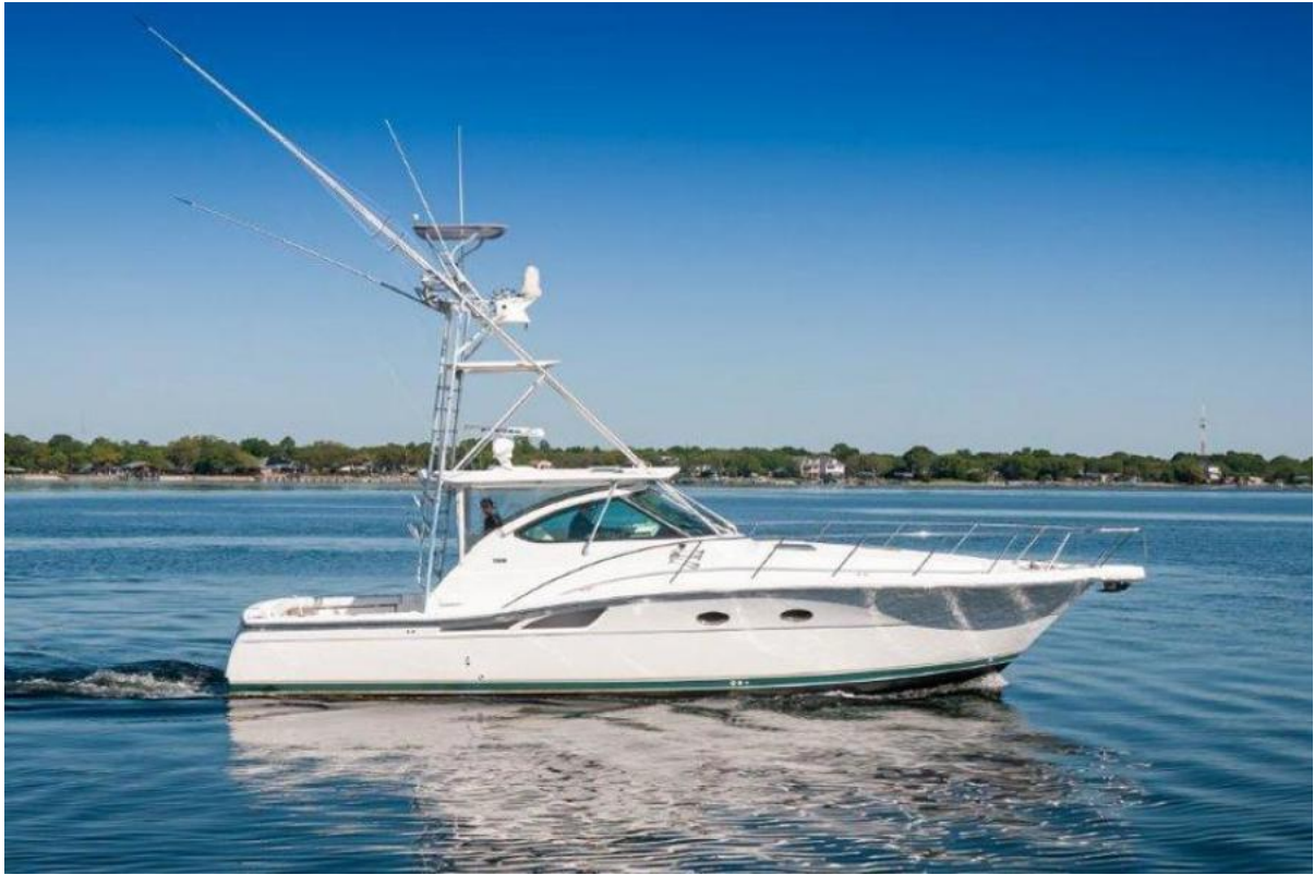
2003 Tiara Yachts 4200 Open Kingfisher STBD Profile