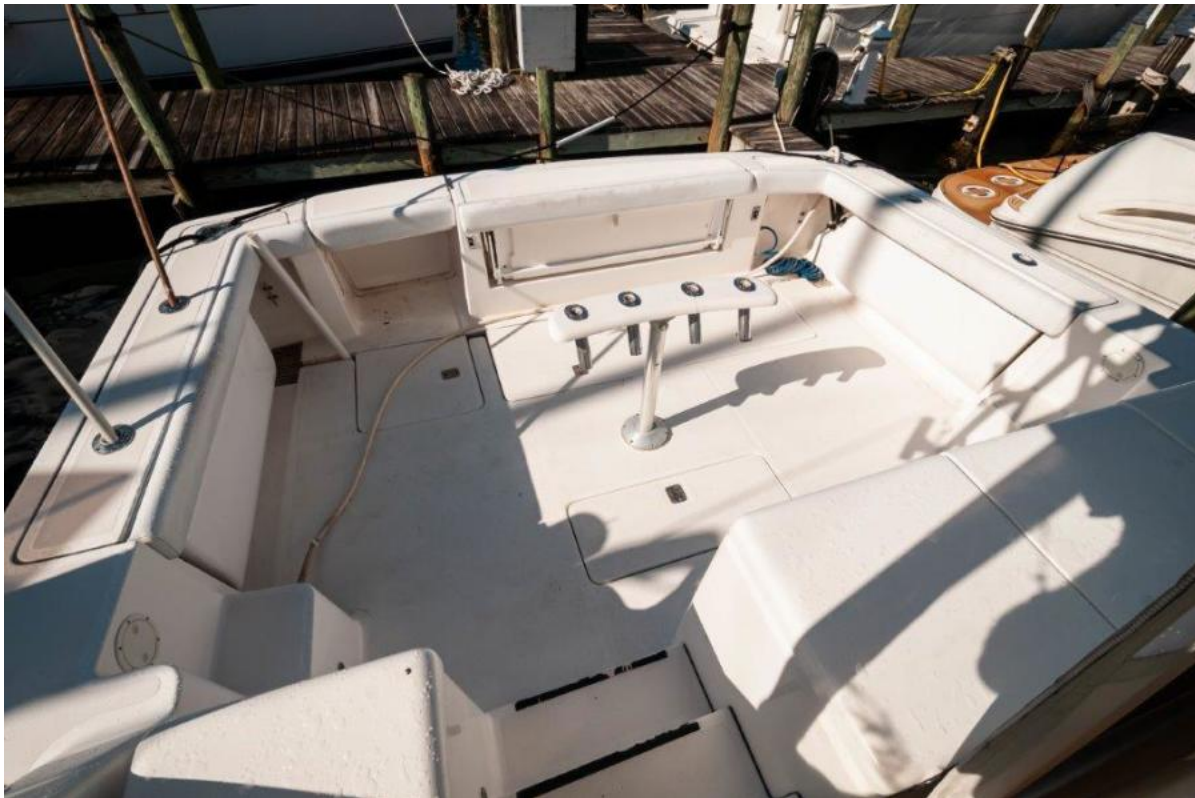
2003 Tiara Yachts 4200 Open Kingfisher Cockpit 2