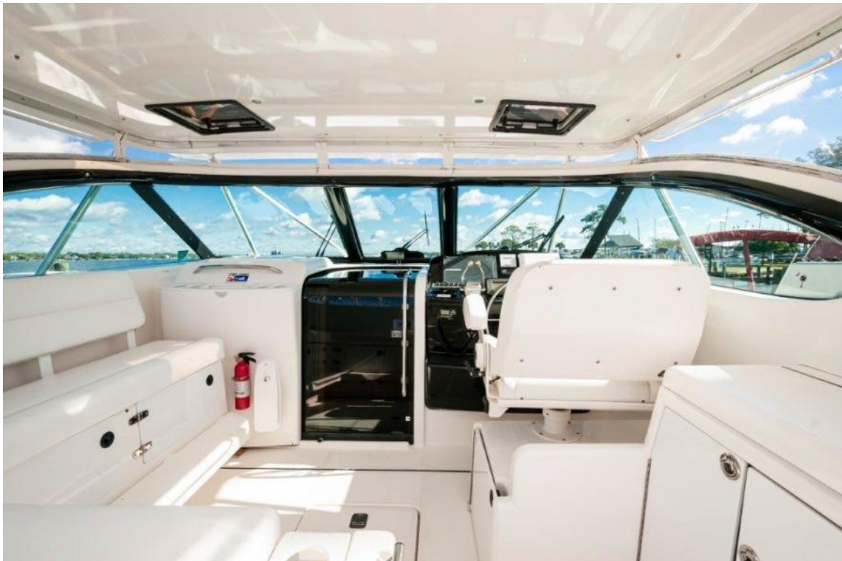
2003 Tiara Yachts 4200 Open Kingfisher Helm 5