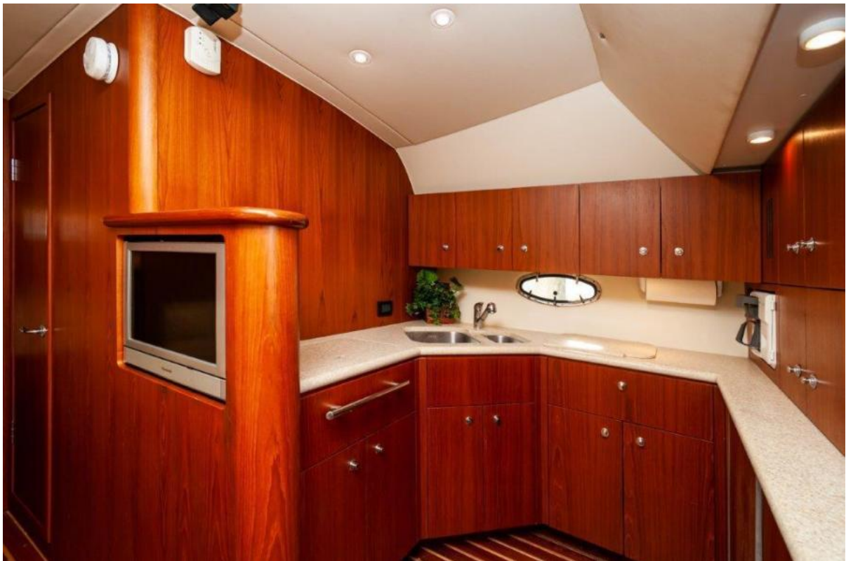
2003 Tiara Yachts 4200 Open Kingfisher Galley 3