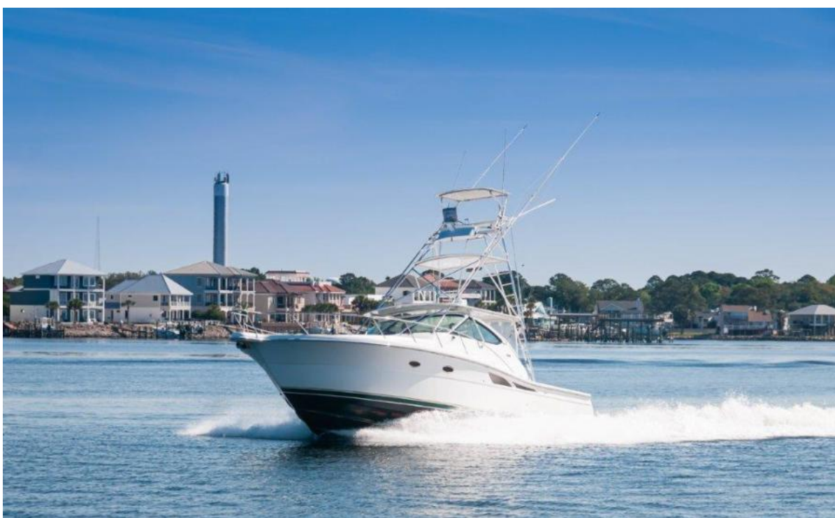
2003 Tiara Yachts 4200 Open Kingfisher Running 2