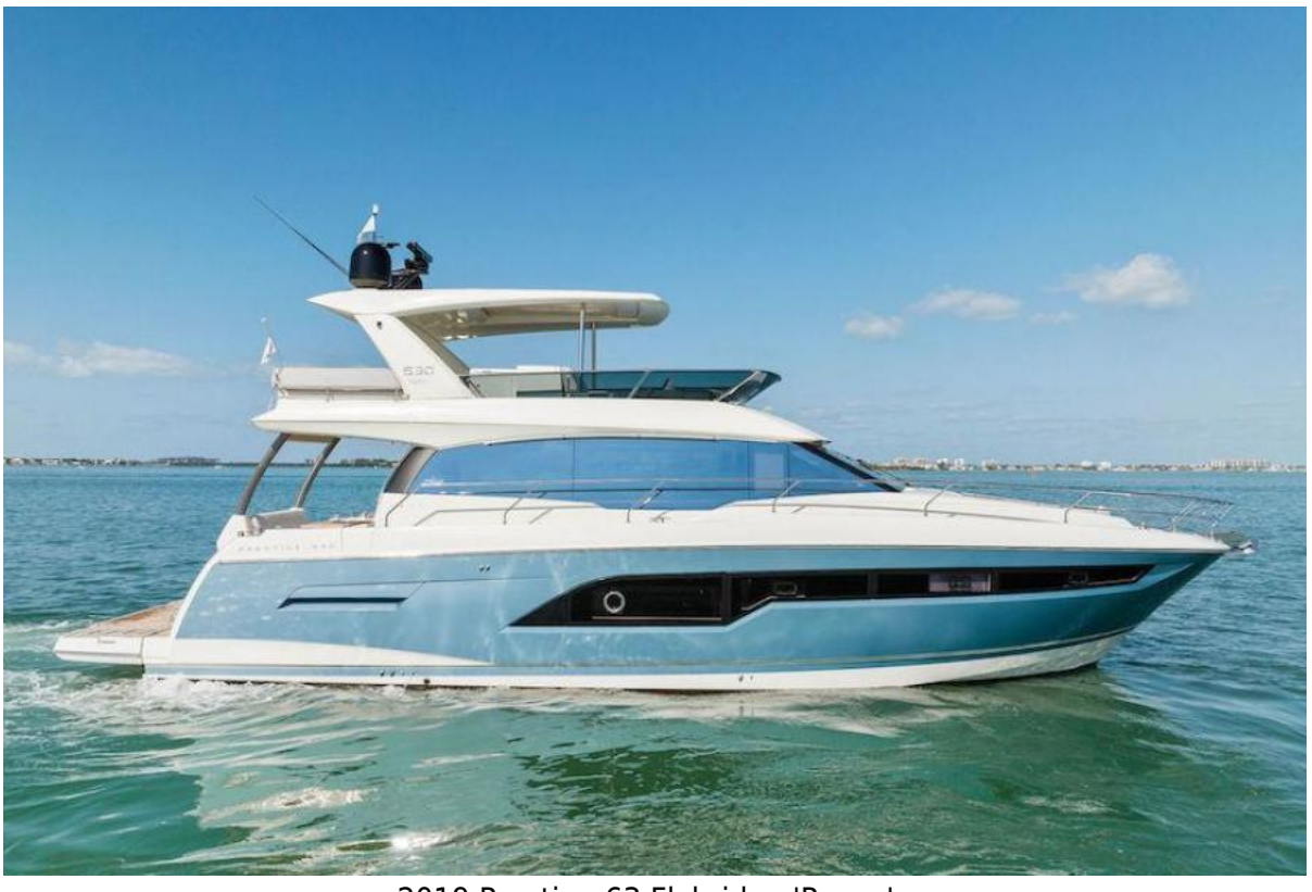
2019 Prestige 63 Flybridge 'Peace'