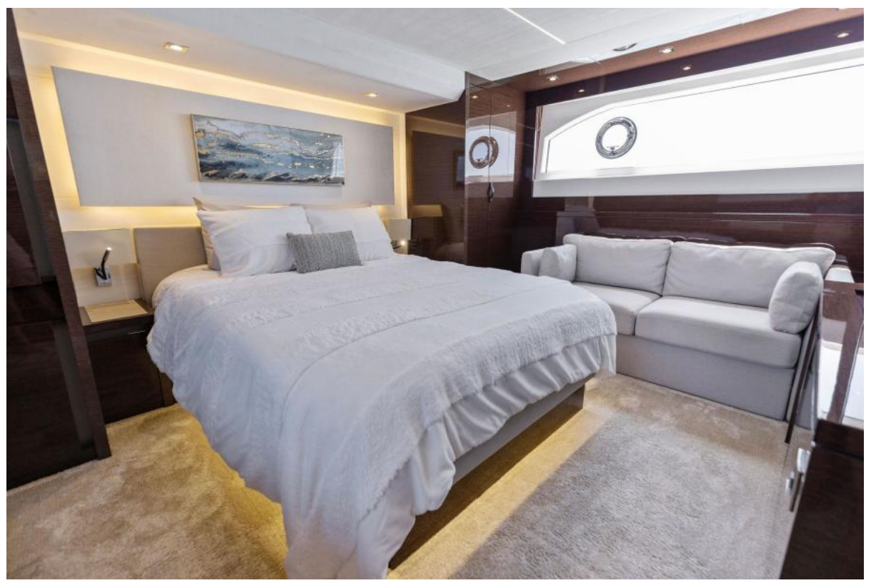
2019 Prestige 63 Flybridge 'Peace' Master Stateroom