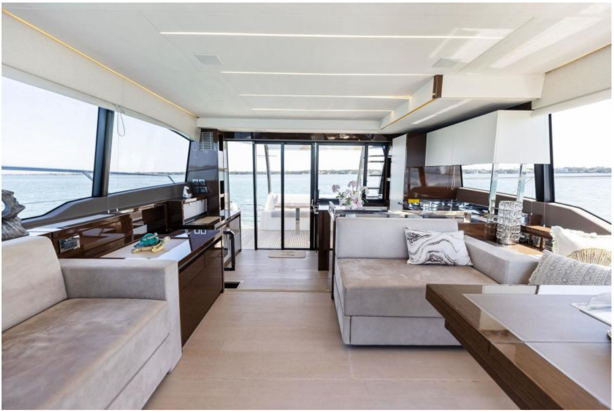
2019 Prestige 63 Flybridge 'Peace' Salon