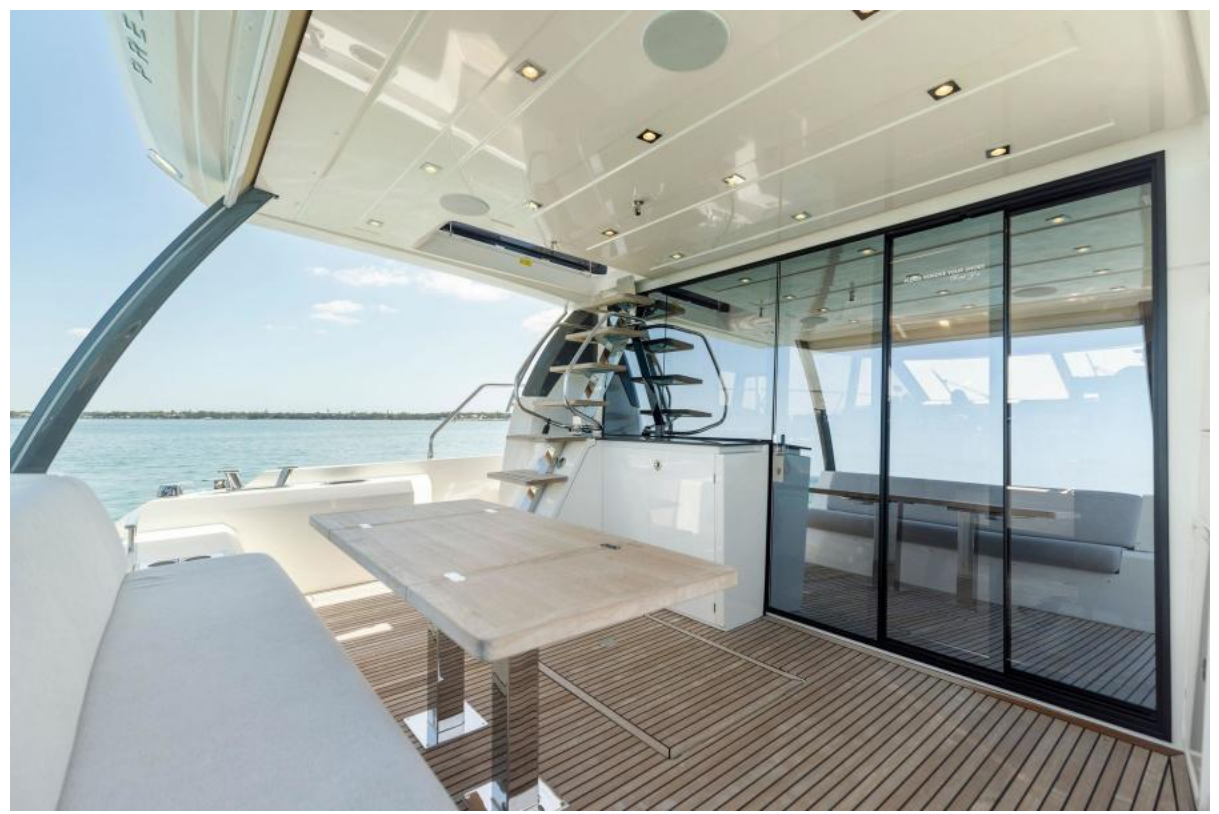
2019 Prestige 63 Flybridge 'Peace' Cockpit