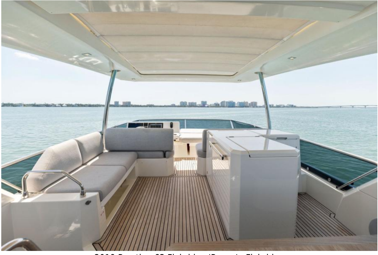
2019 Prestige 63 Flybridge 'Peace' Flybridge