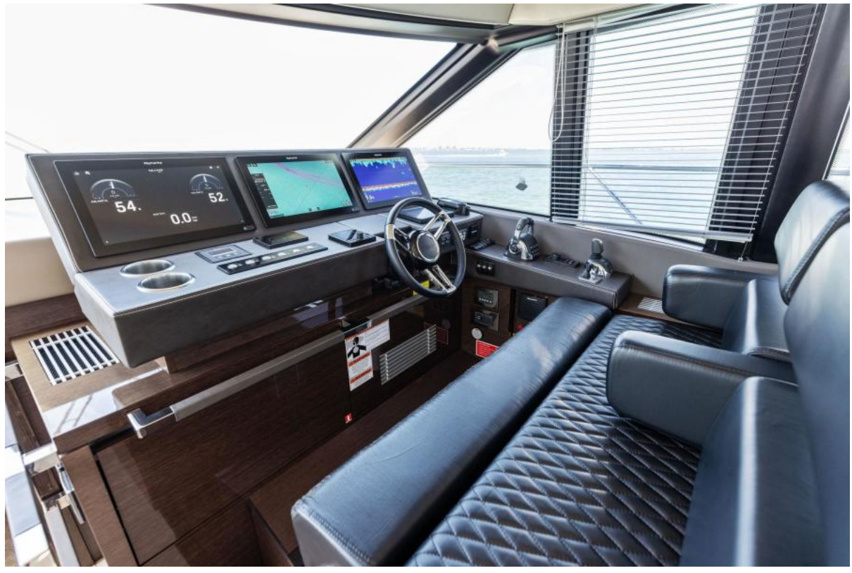
2019 Prestige 63 Flybridge 'Peace' Helm