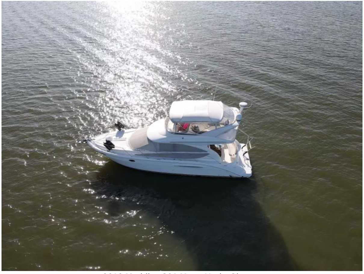
2010 Meridian 391 Motor Yacht Ohana