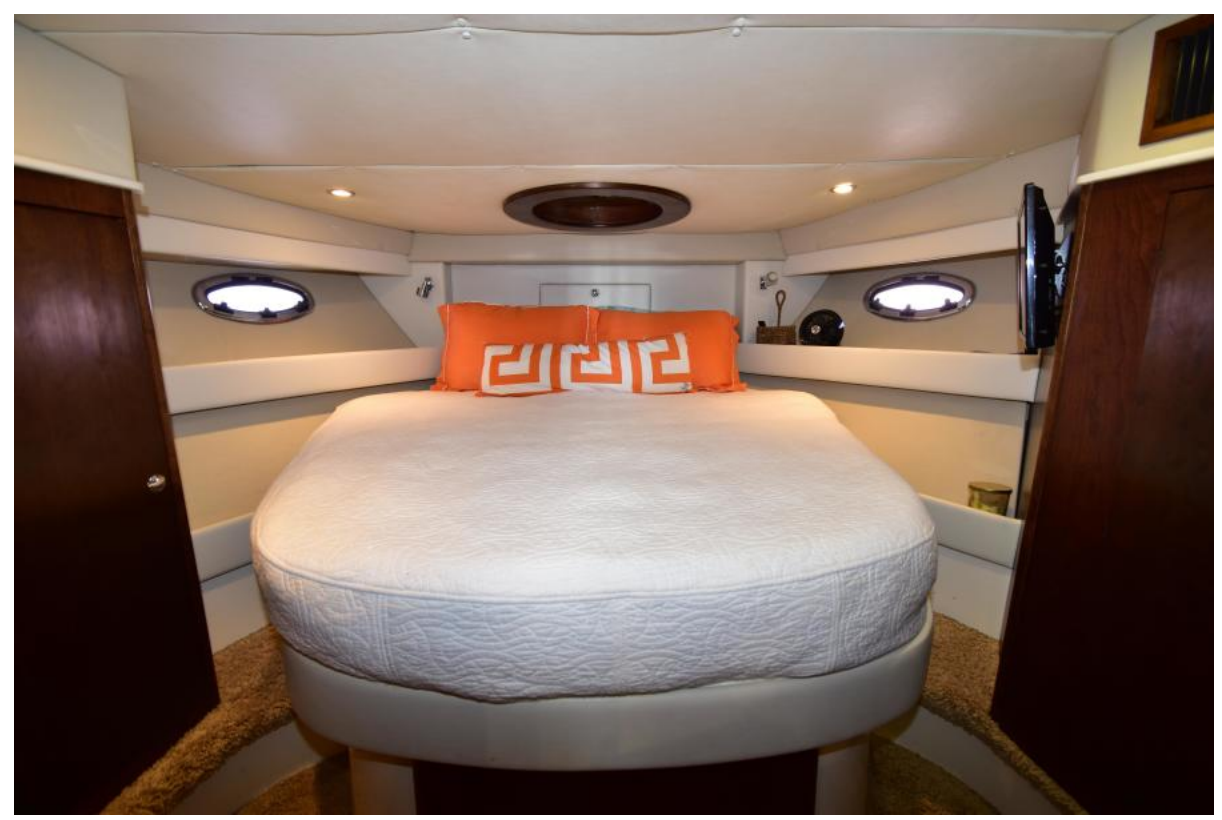
2010 Meridian 391 Motor Yacht Ohana