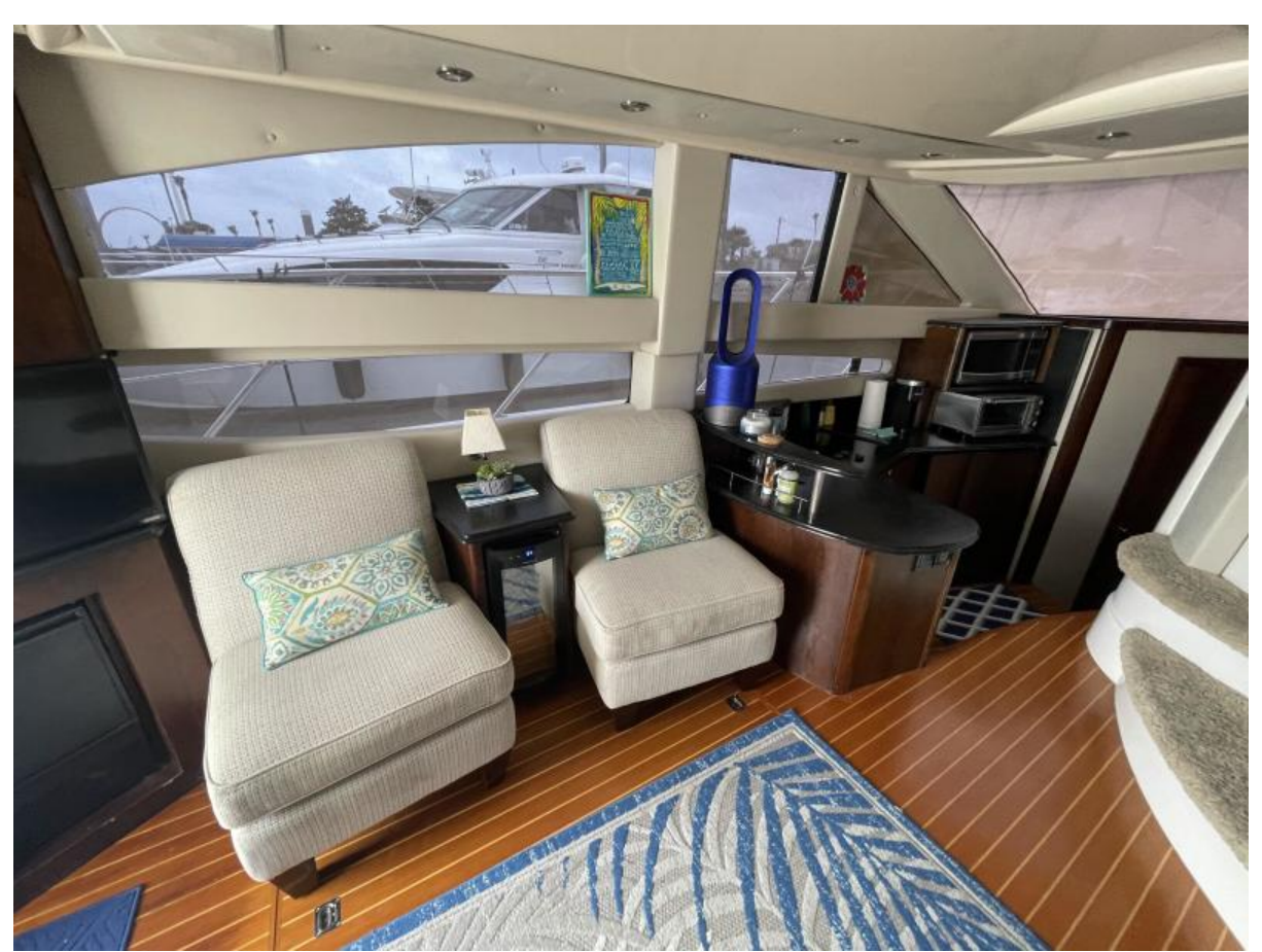
2010 Meridian 391 Motor Yacht Ohana