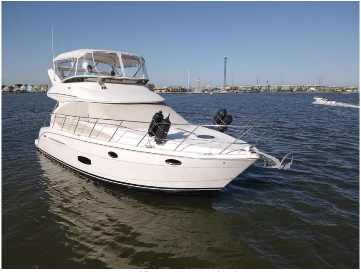
2010 Meridian 391 Motor Yacht Ohana