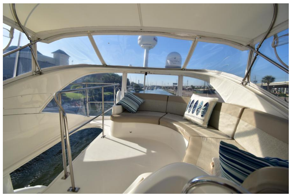
2010 Meridian 391 Motor Yacht Ohana