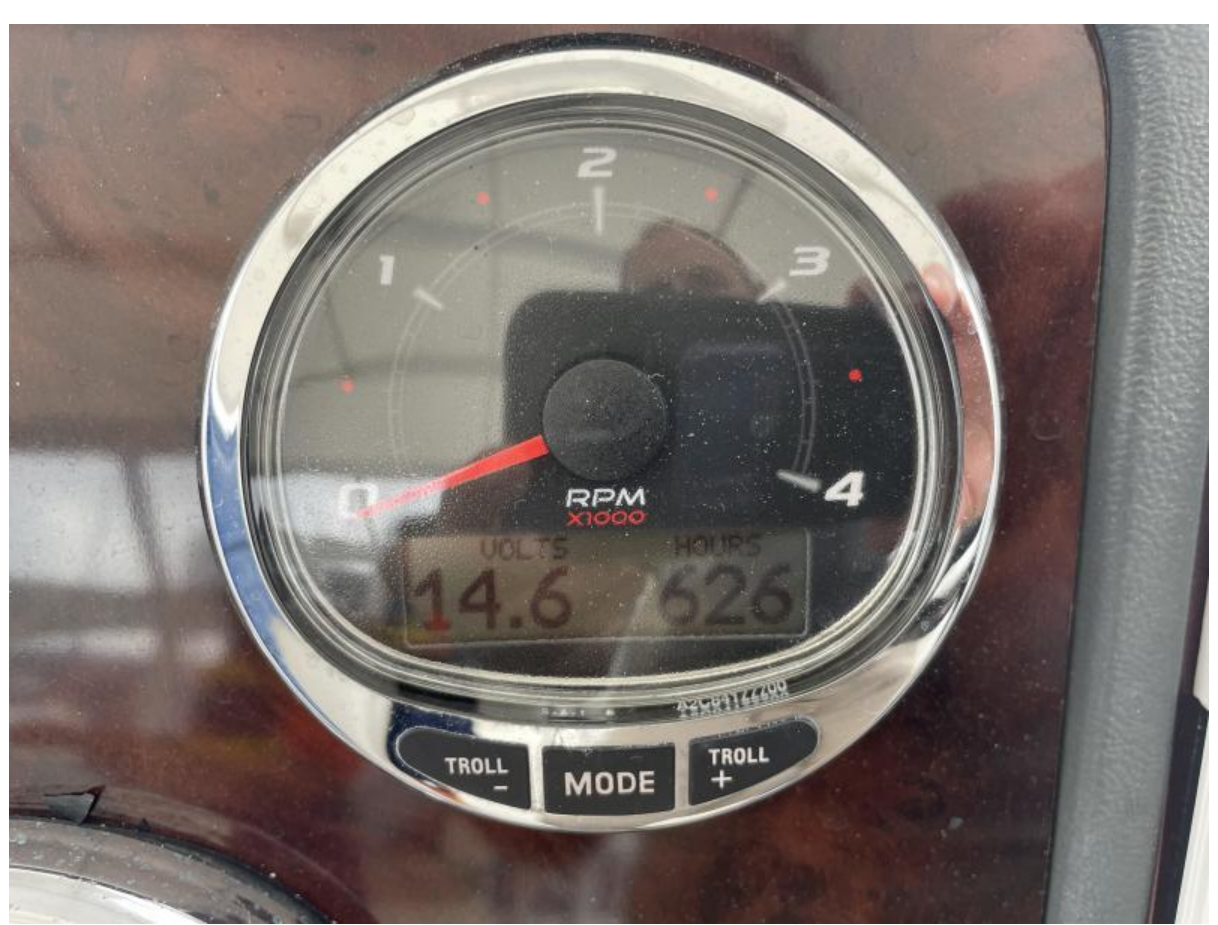
2010 Meridian 391 Motor Yacht Ohana