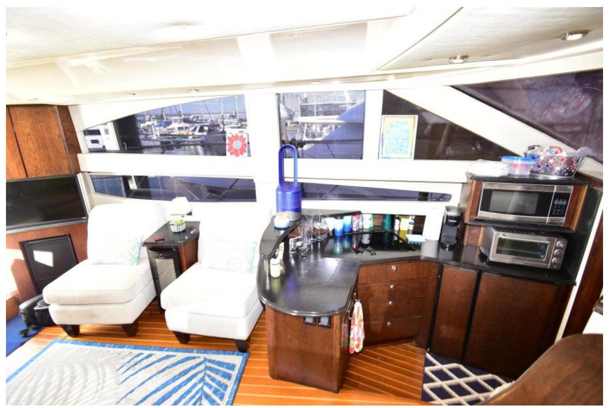
2010 Meridian 391 Motor Yacht Ohana