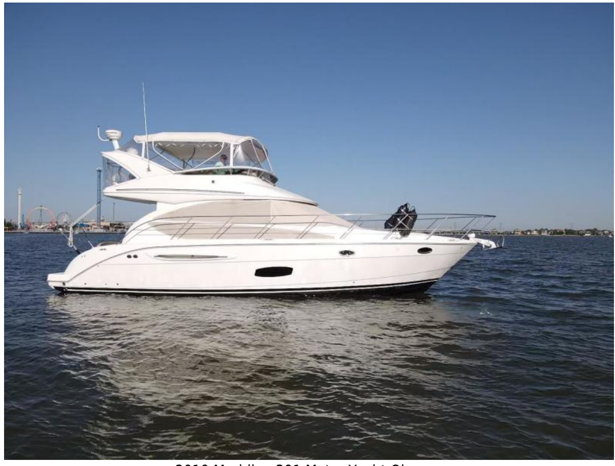
2010 Meridian 391 Motor Yacht Ohana