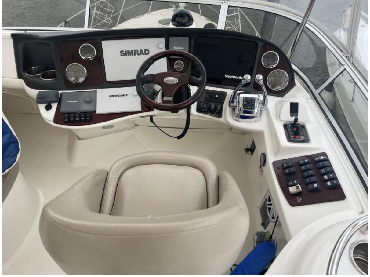
2010 Meridian 391 Motor Yacht Ohana