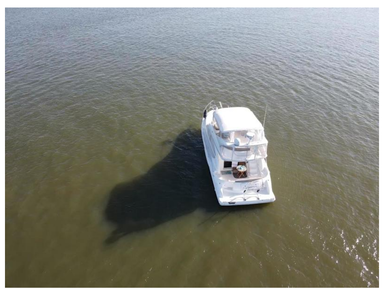
2010 Meridian 391 Motor Yacht Ohana