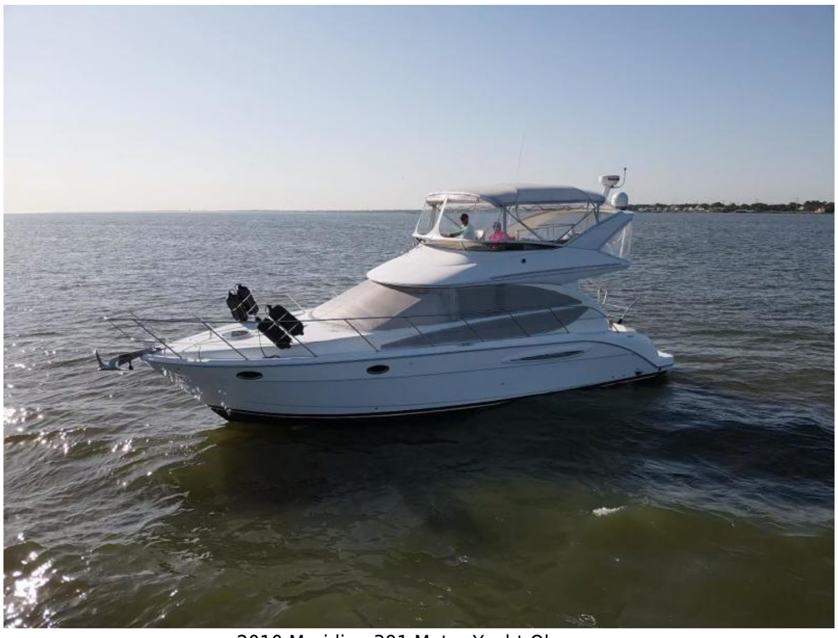
2010 Meridian 391 Motor Yacht Ohana