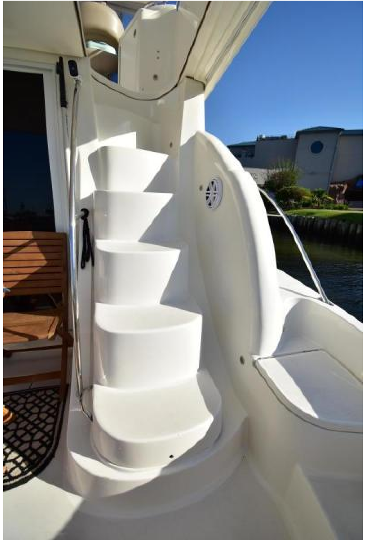
2010 Meridian 391 Motor Yacht Ohana