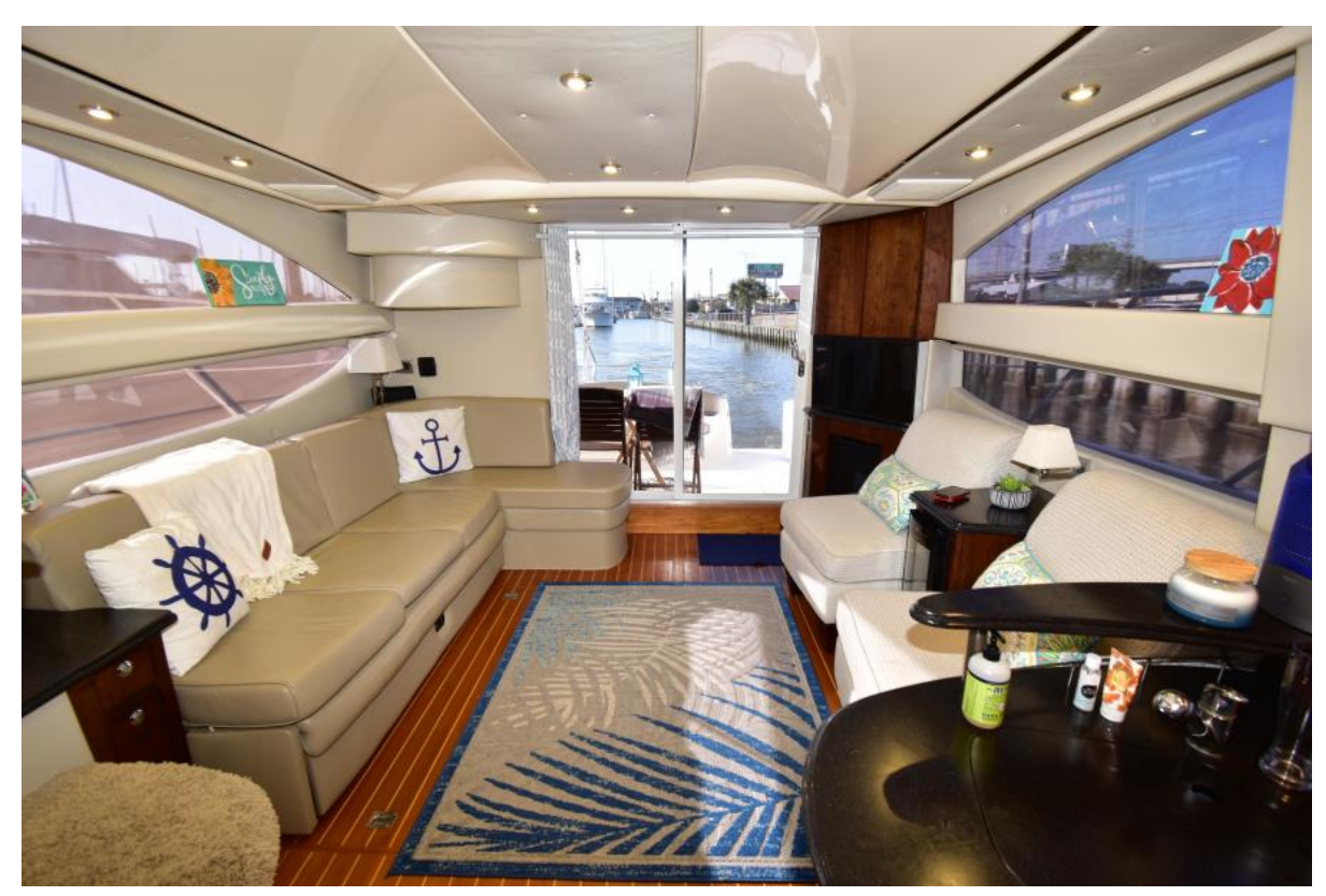
2010 Meridian 391 Motor Yacht Ohana