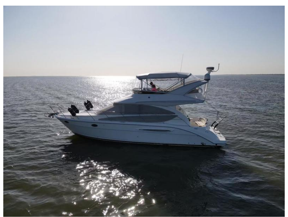
2010 Meridian 391 Motor Yacht Ohana