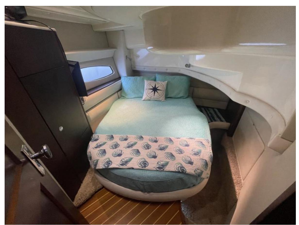
2010 Meridian 391 Motor Yacht Ohana