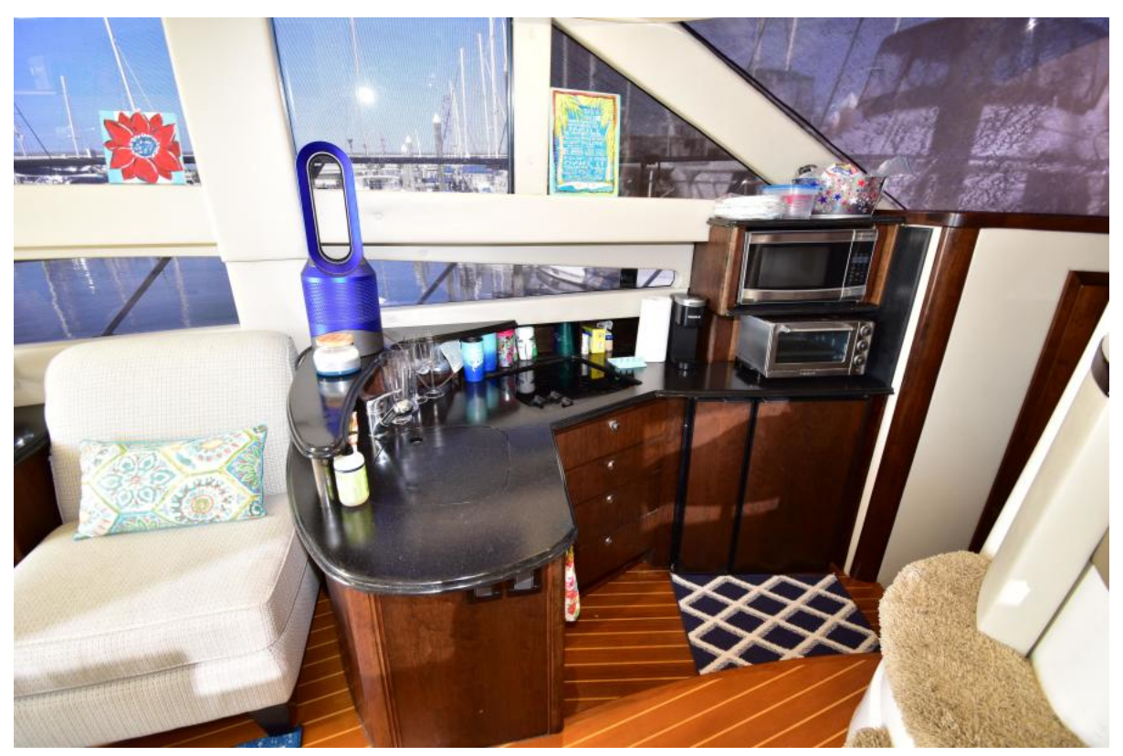
2010 Meridian 391 Motor Yacht Ohana