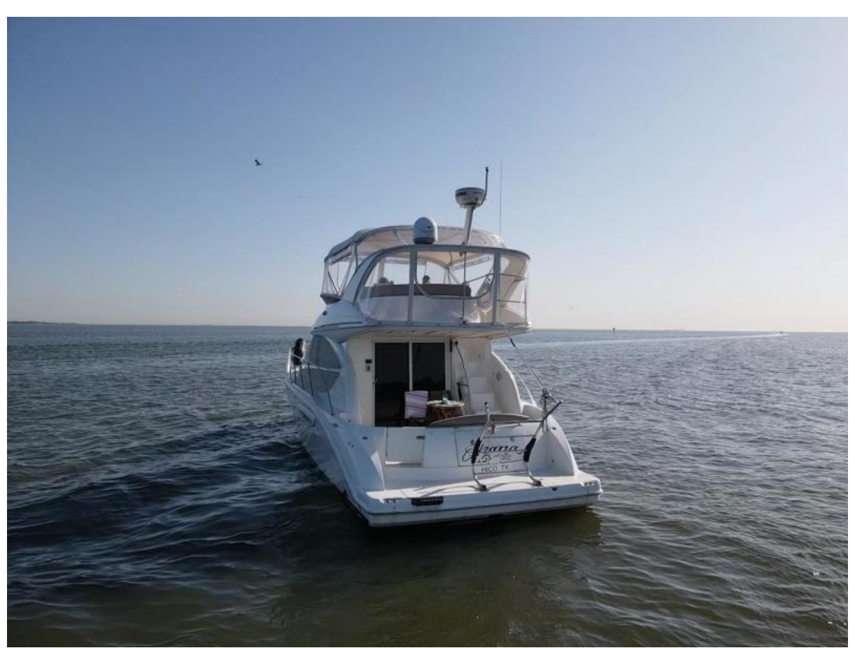
2010 Meridian 391 Motor Yacht Ohana