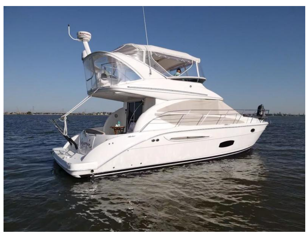
2010 Meridian 391 Motor Yacht Ohana