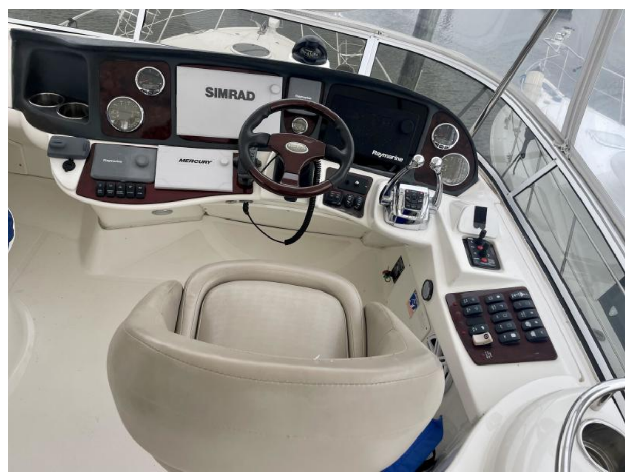
2010 Meridian 391 Motor Yacht Ohana