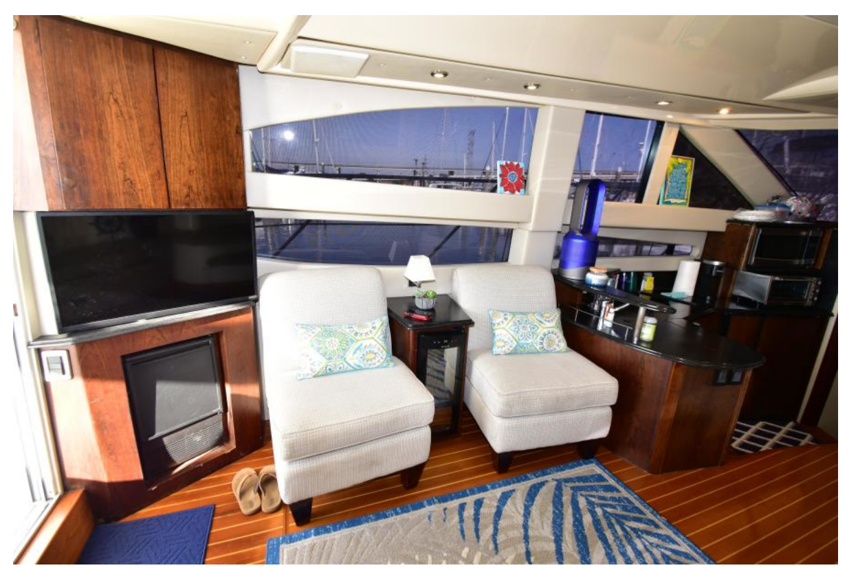
2010 Meridian 391 Motor Yacht Ohana