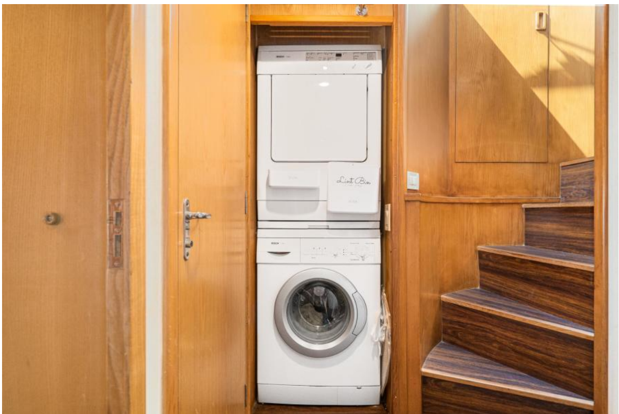
WASHER and DRYER