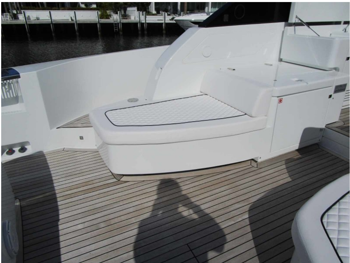
Portside Aft Seat