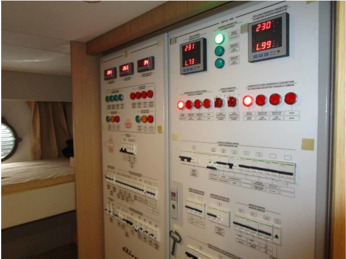
Crew Electrical Panel