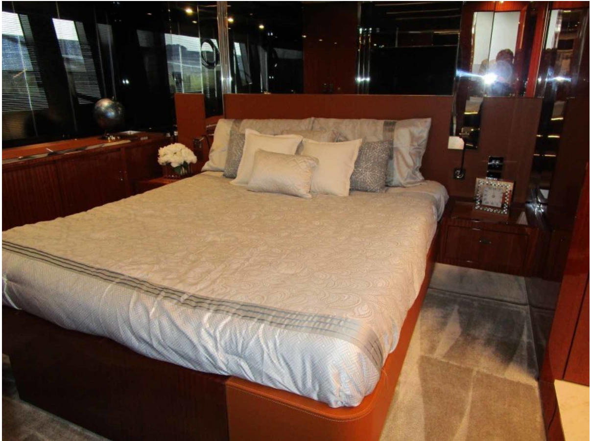
Master Looking Aft