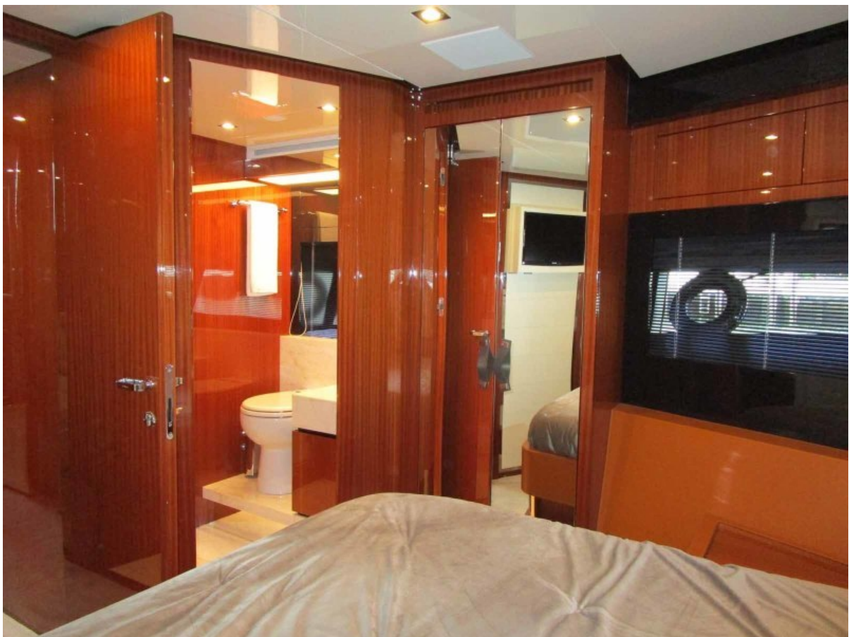
VIP Looking To Port