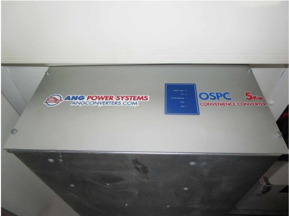
120 Outlet Converter