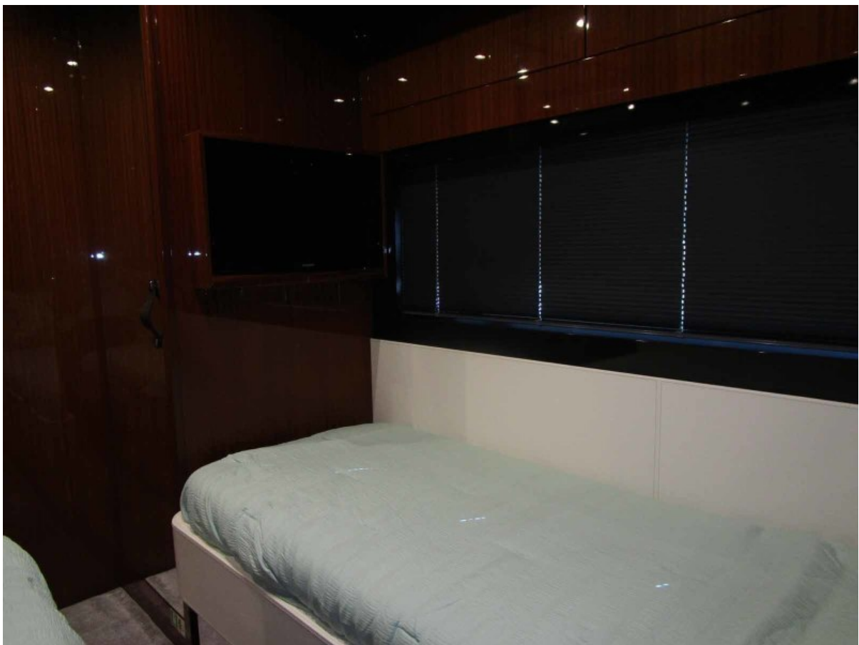
Guest Cabin Looking Forward