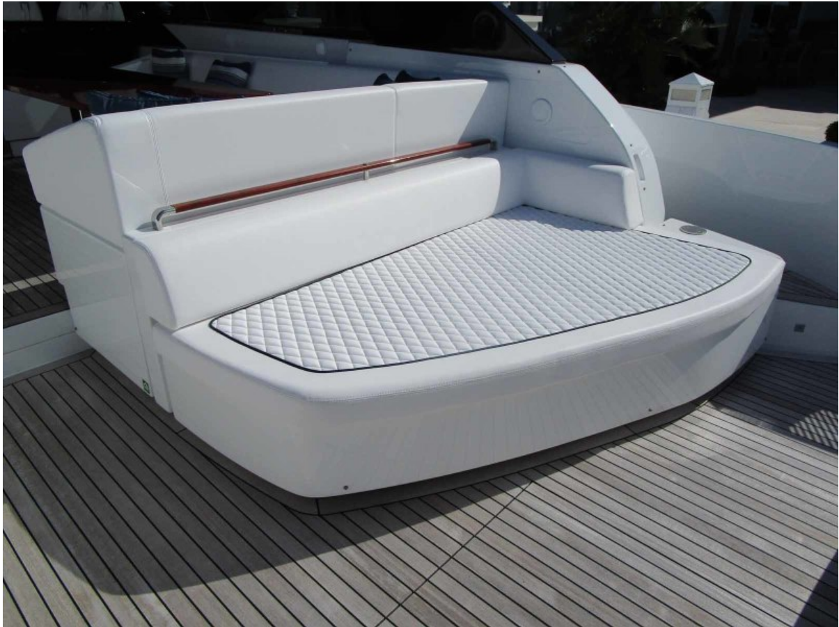
Starboard Side Lounge