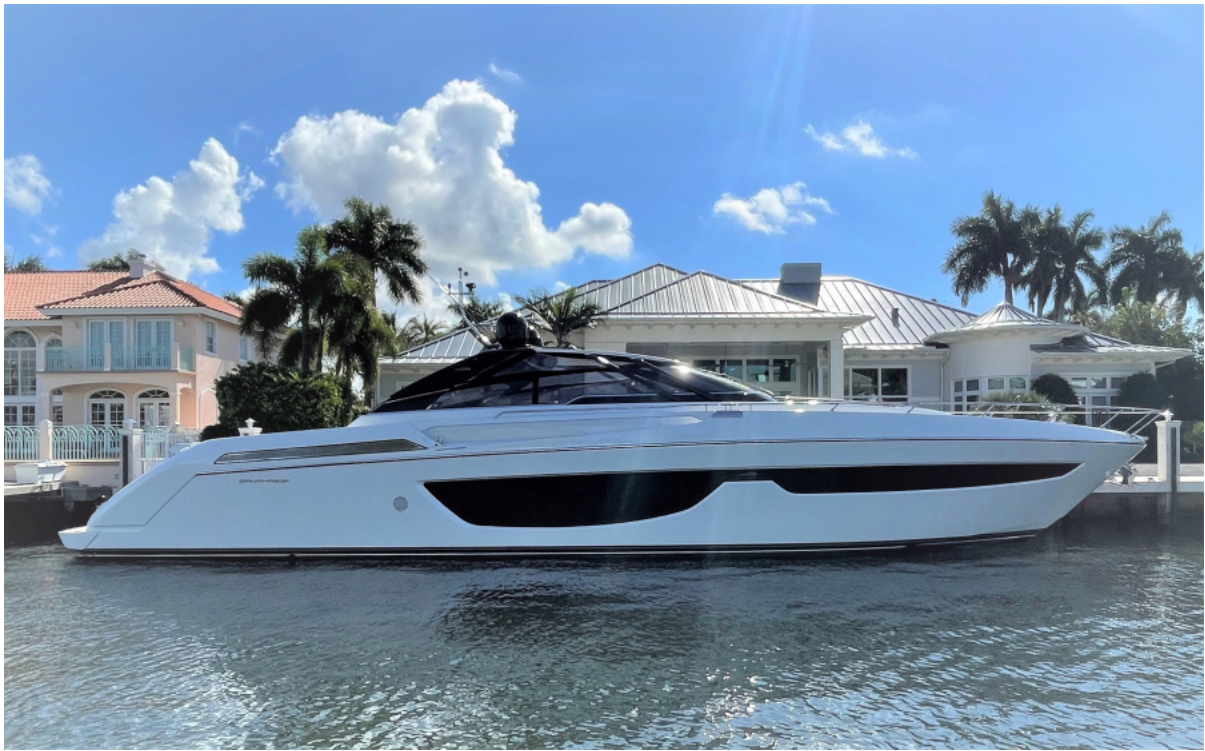
REGENCY, 76' Riva Bahamas 2020