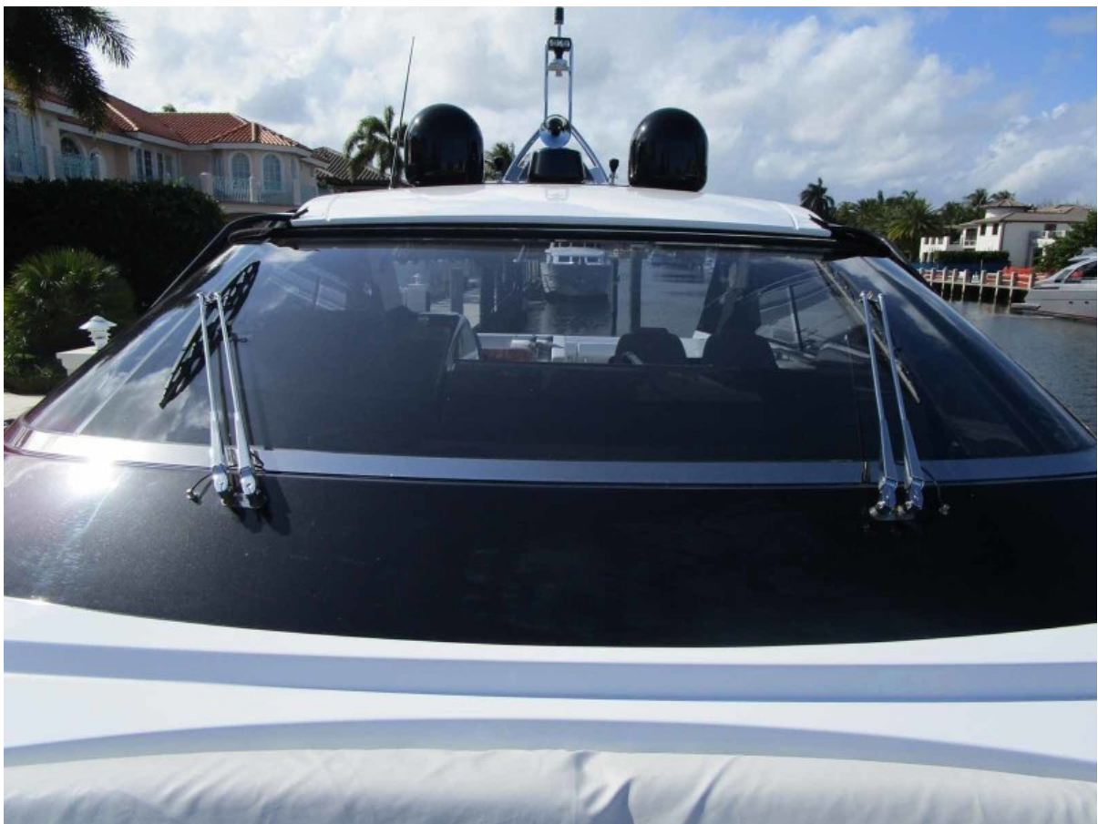
One Piece Windshield