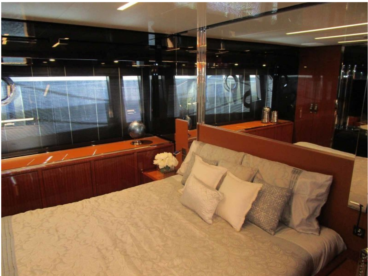
Master Looking To Starboard