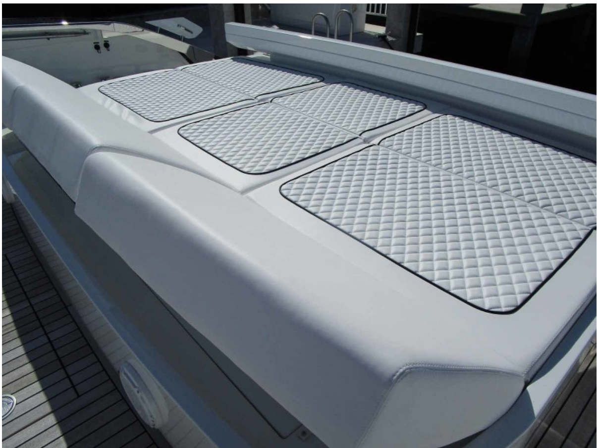
Sun Lounge Looking Aft