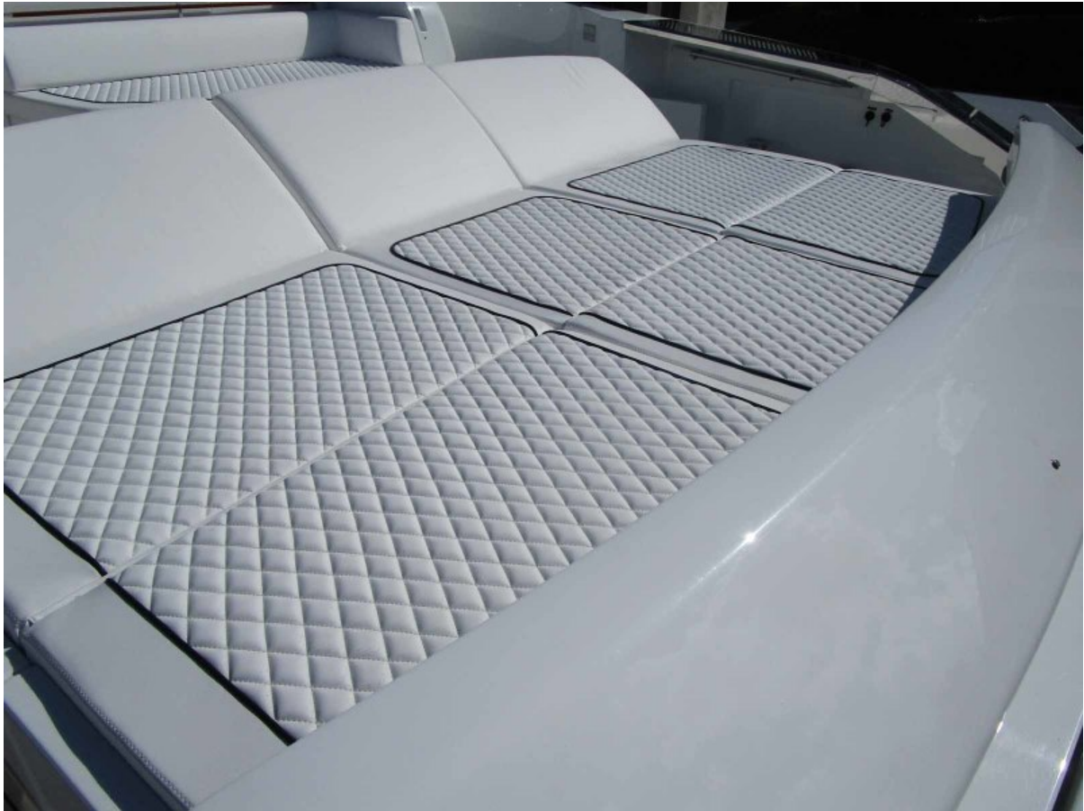
Centered Aft Deck Sun Lounge