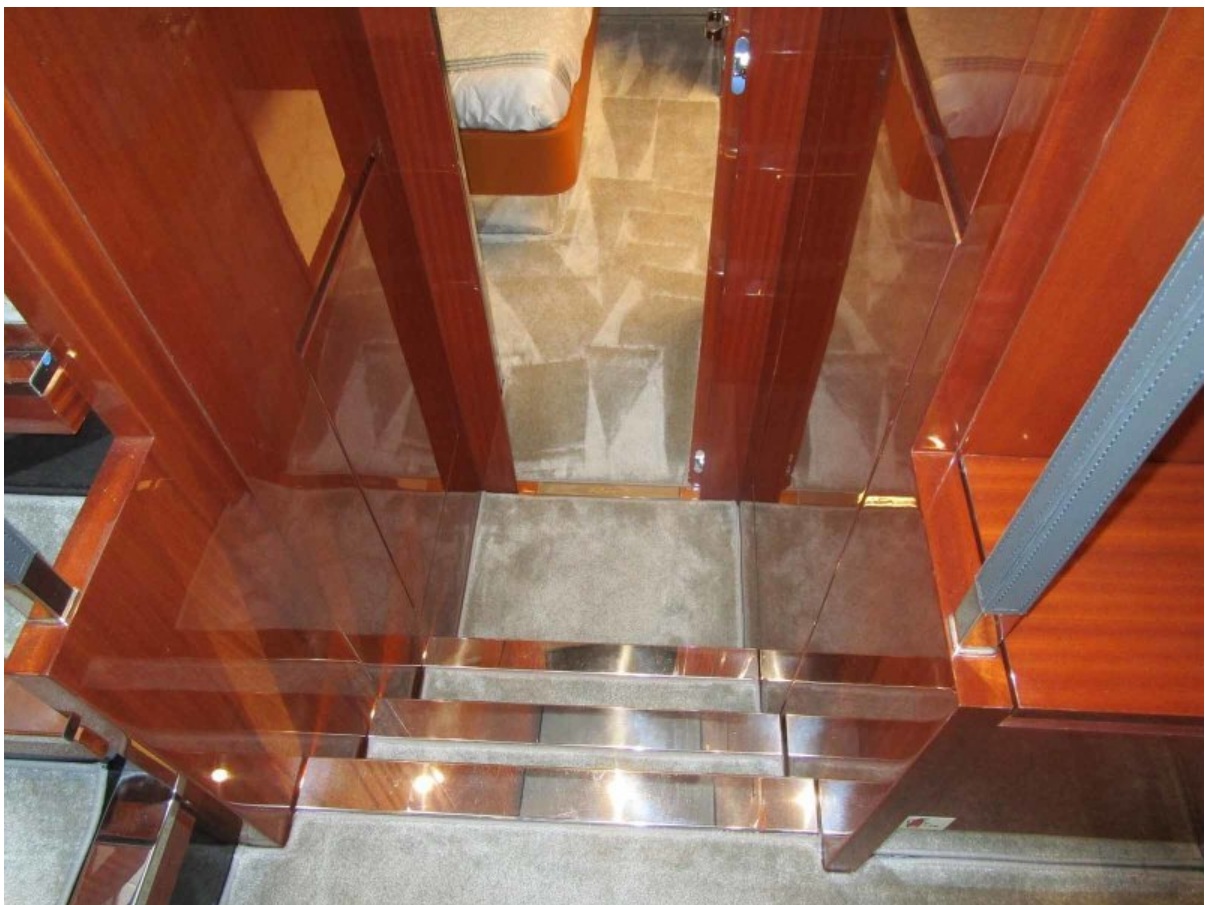
Master Stateroom Entrance