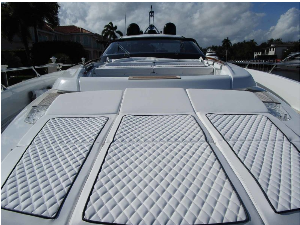
Bow Sun Lounge