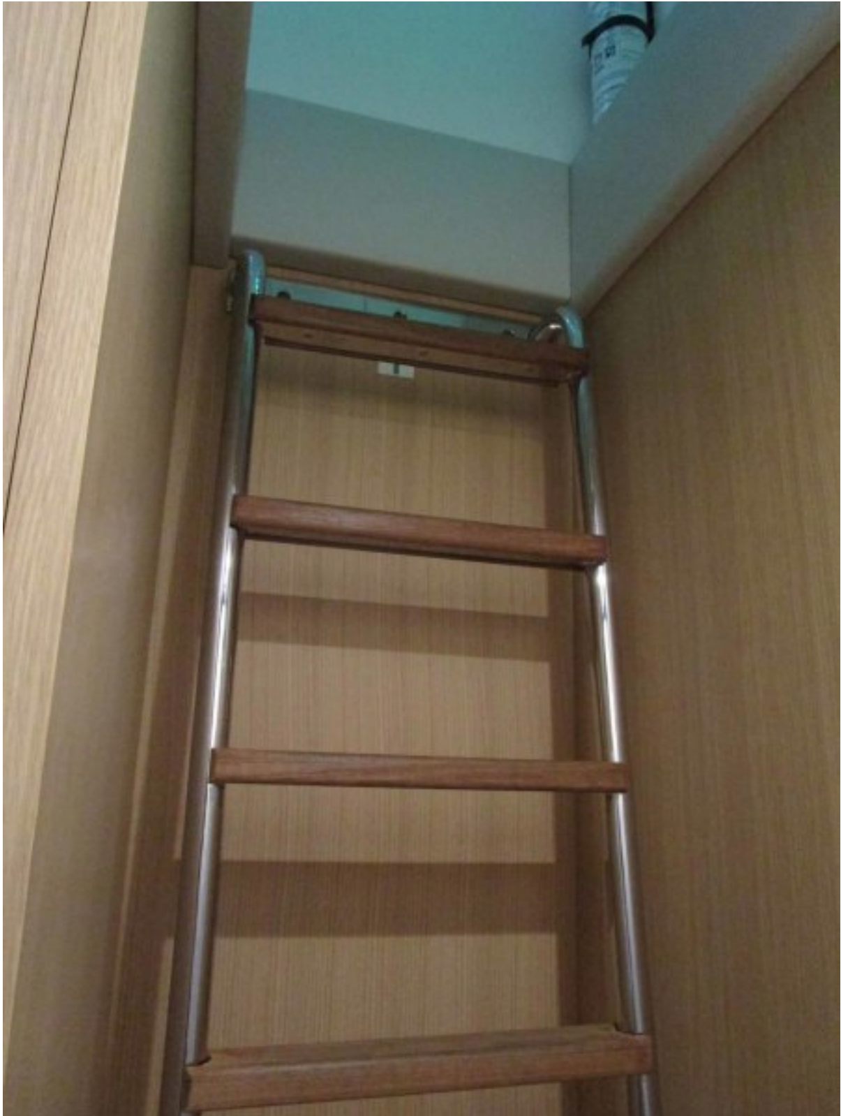
Aft Deck Crew Entrance