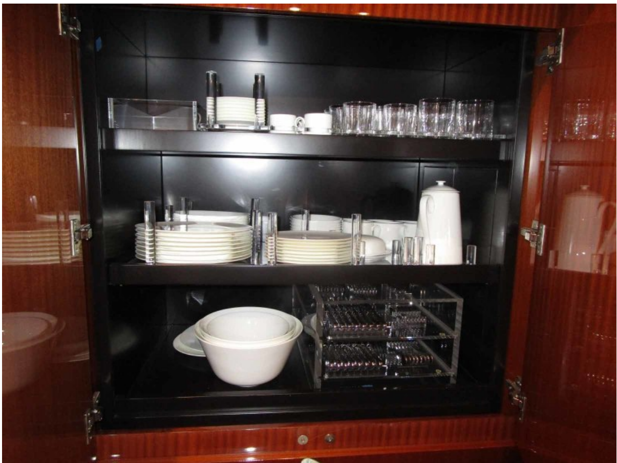
Salon Dinnerware Storage