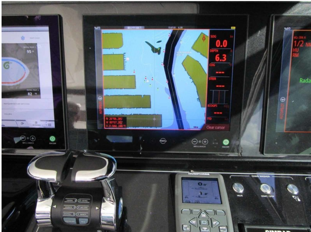
Helm Detail Center