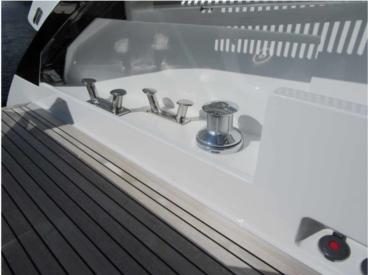
Stern Docking Capstan