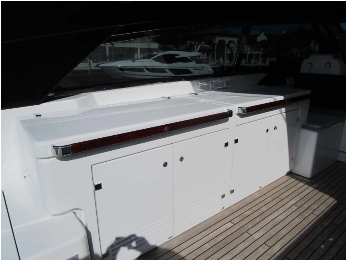
Portside Bar Area