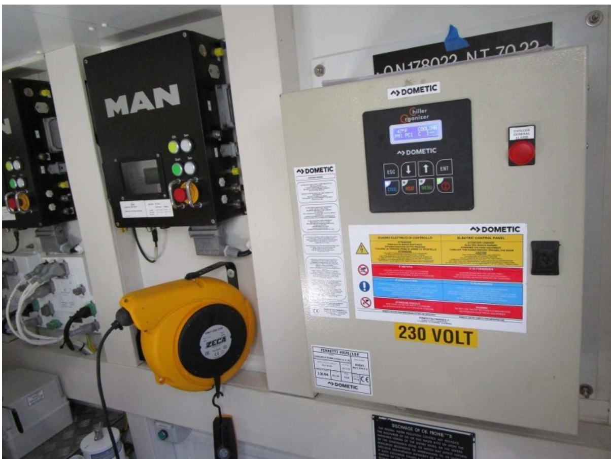
Ahead Of Port Engine