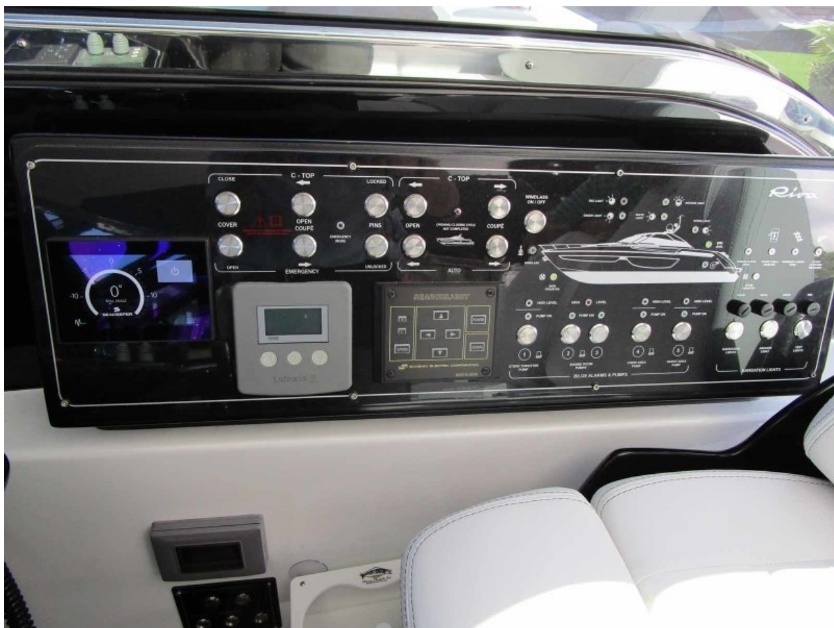
Helm Switches Plus Seakeeper Controls