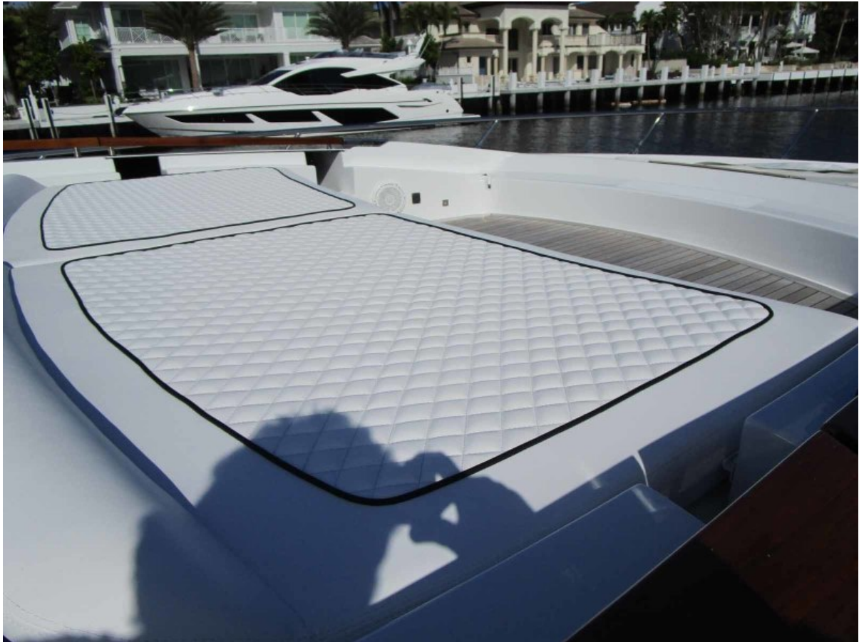
Mid Bow Seating