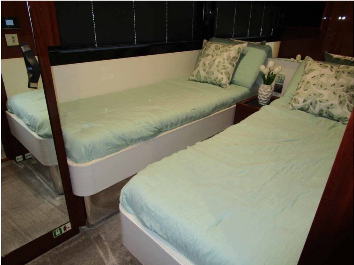
Guest Cabin Looking Aft