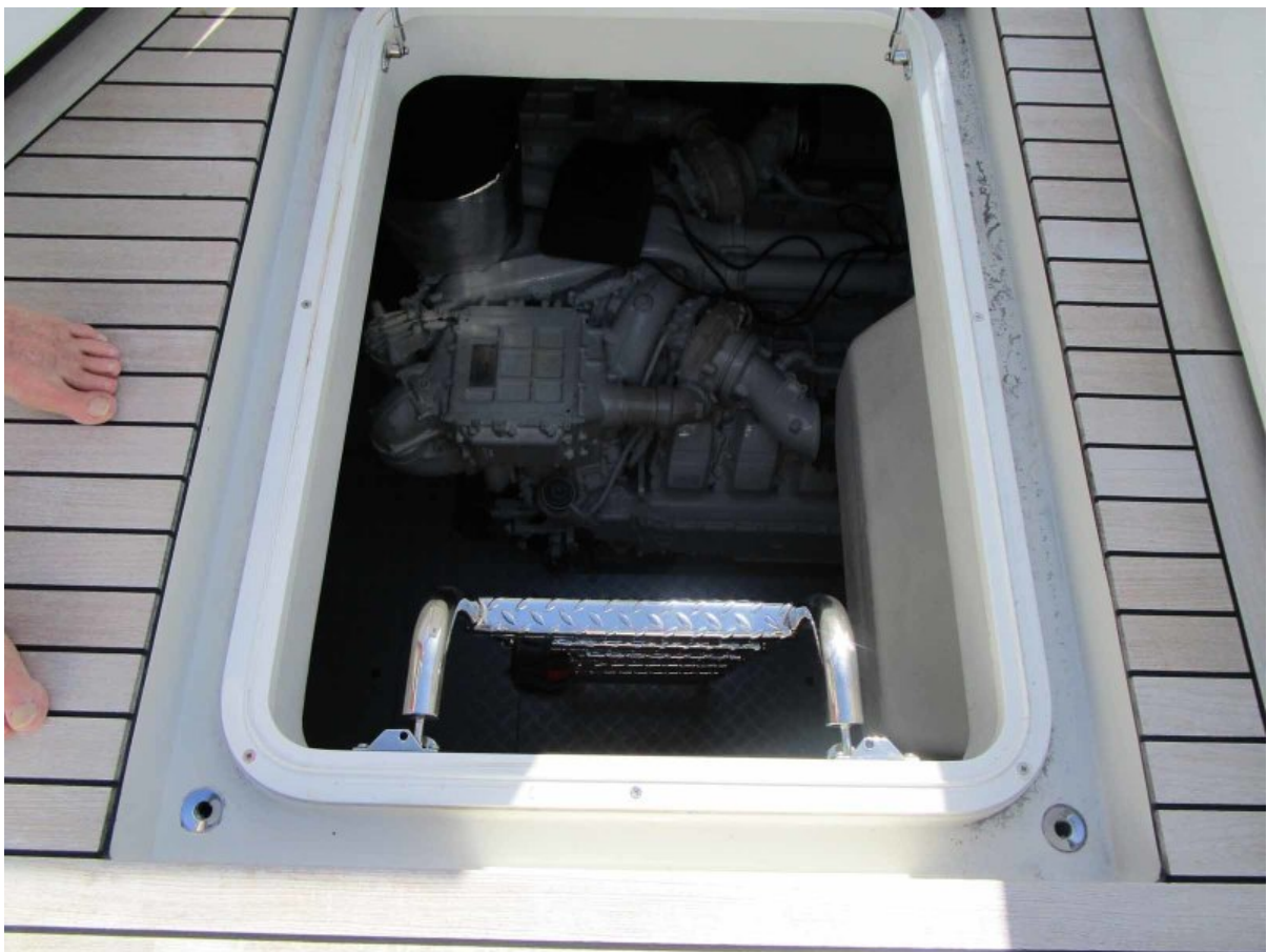
Engine Room Entrance