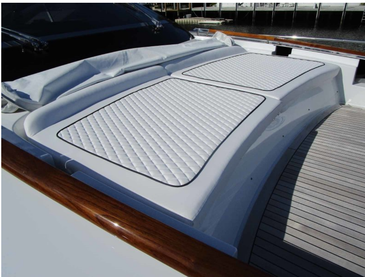
Mid Bow Seating