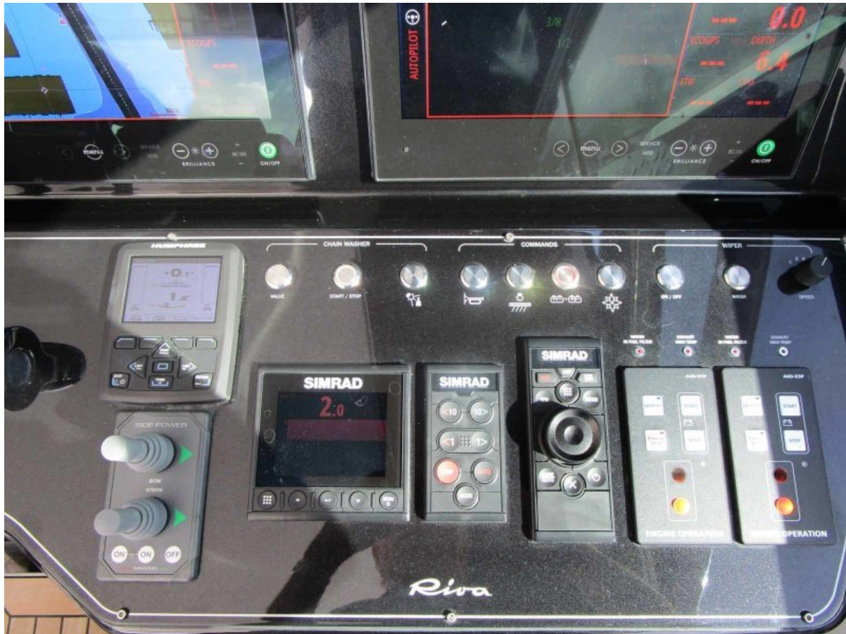
Lower Helm Detail