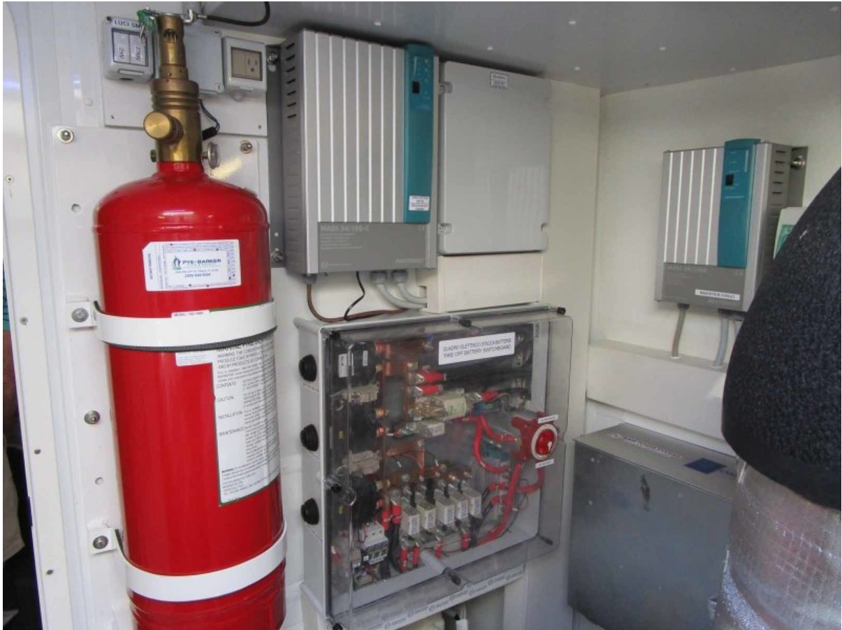
Ahead of Starboard Engine