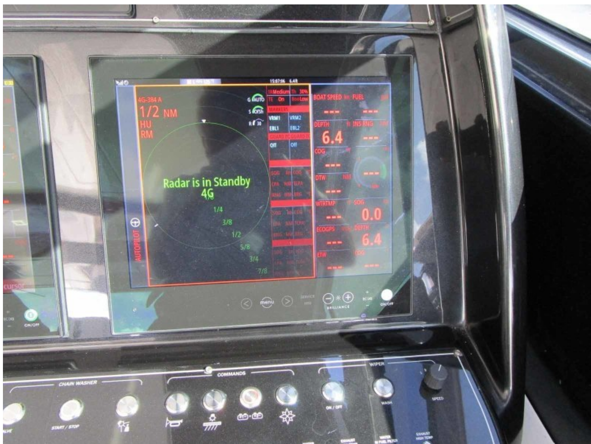
Helm Detail Starboard