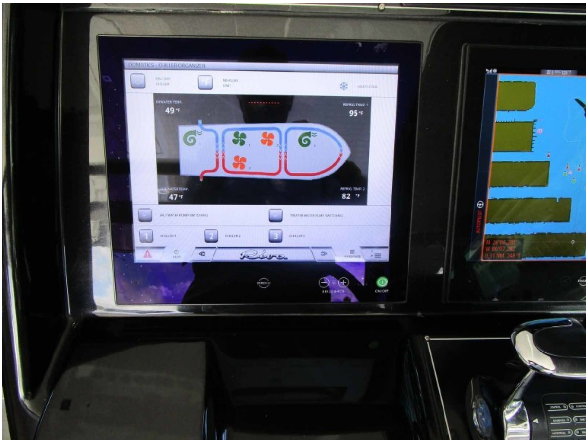
Helm Detail Port