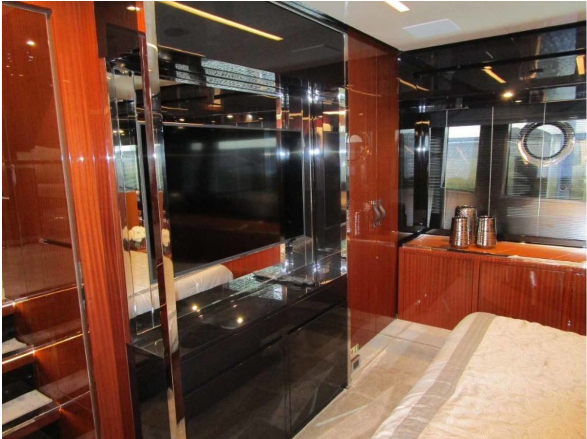
Master Looking Aft