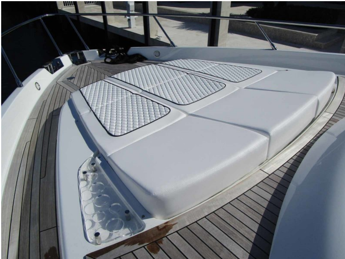
Bow Sun Lounge