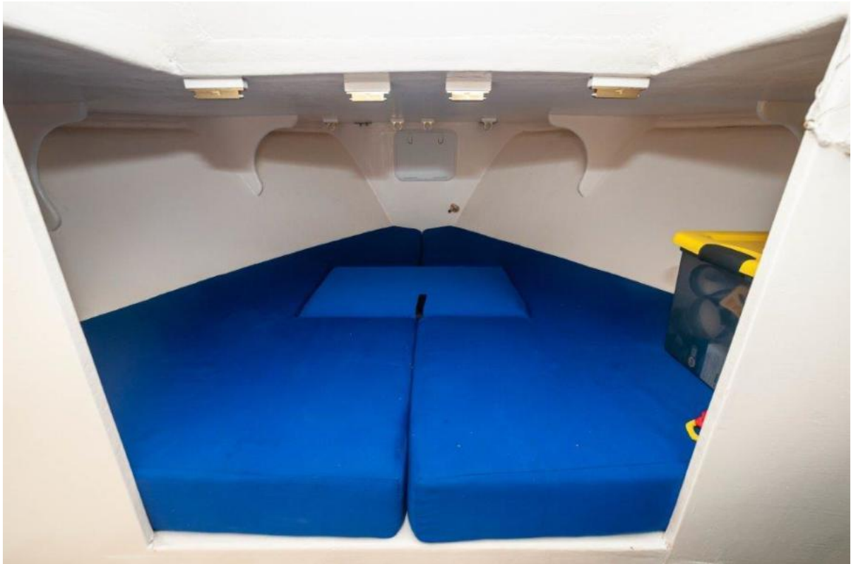
1987 G&S 32 Custom Express It L Do V Berth 3