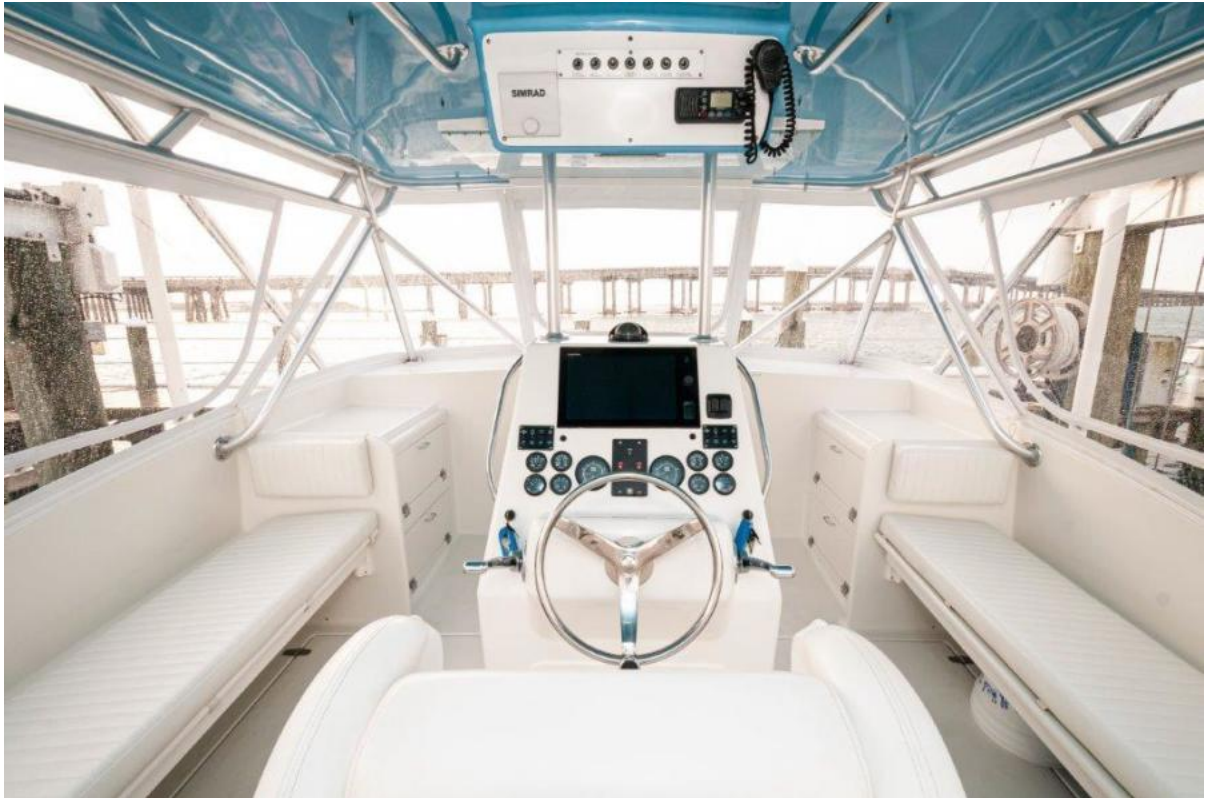
1987 G&S 32 Custom Express It L Do Helm 2