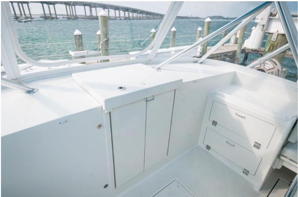
1987 G&S 32 Custom Express It L Do Companionway