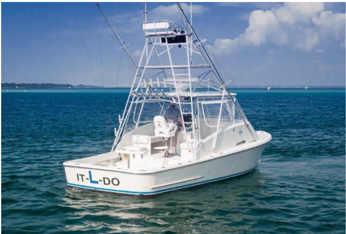
1987 G&S 32 Custom Express It L Do Transom Profile