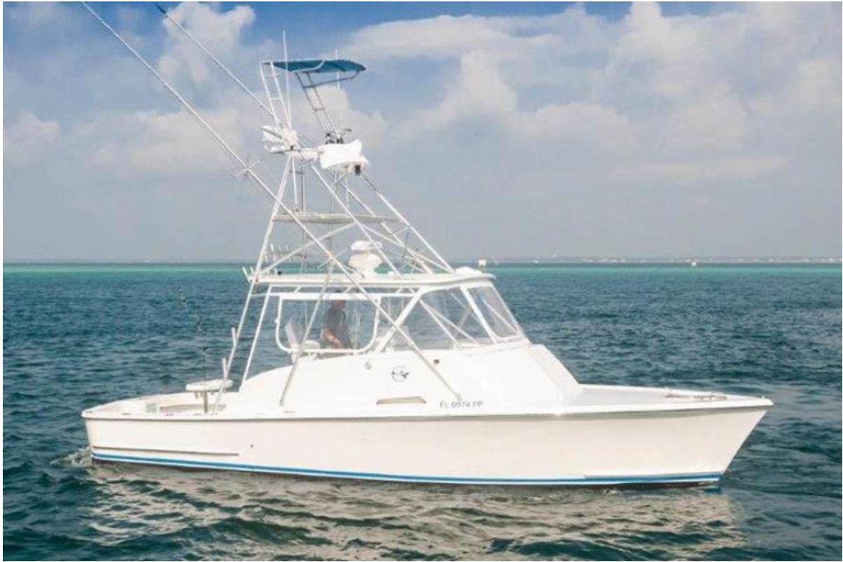
1987 G&S 32 Custom Express It L Do STBD Profile