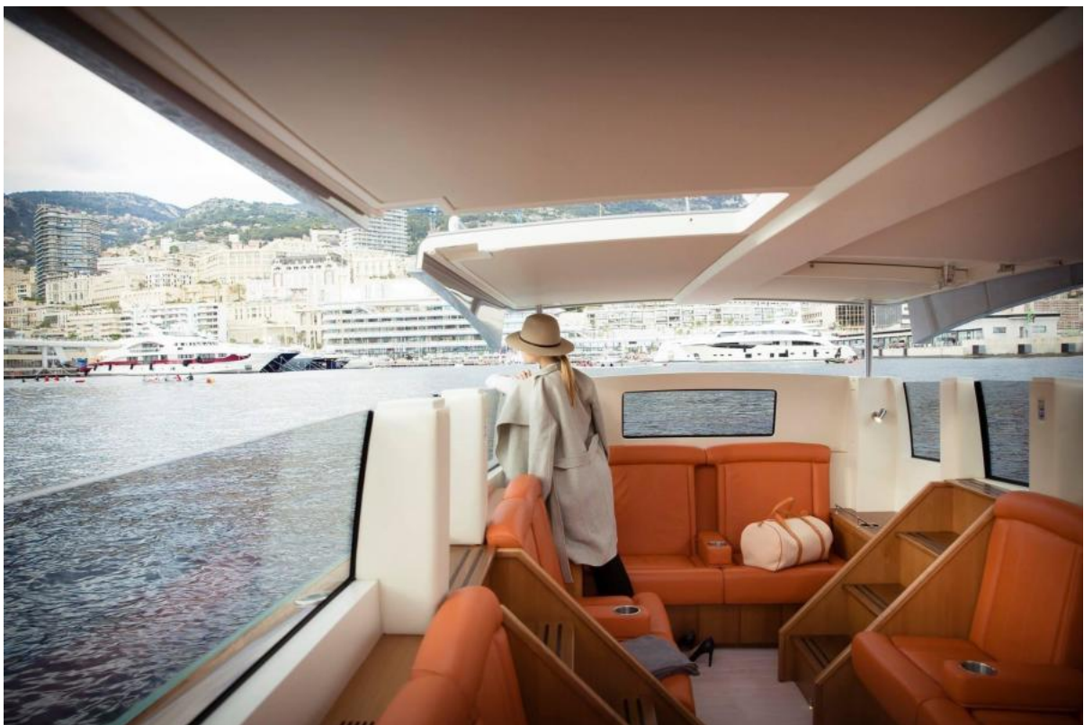
Hardtop Hardtop raised offering 6 foot of headroom