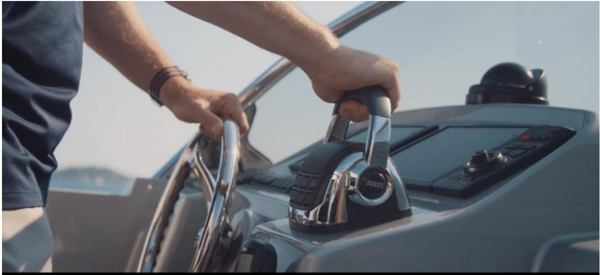
Helm Volvo Controls