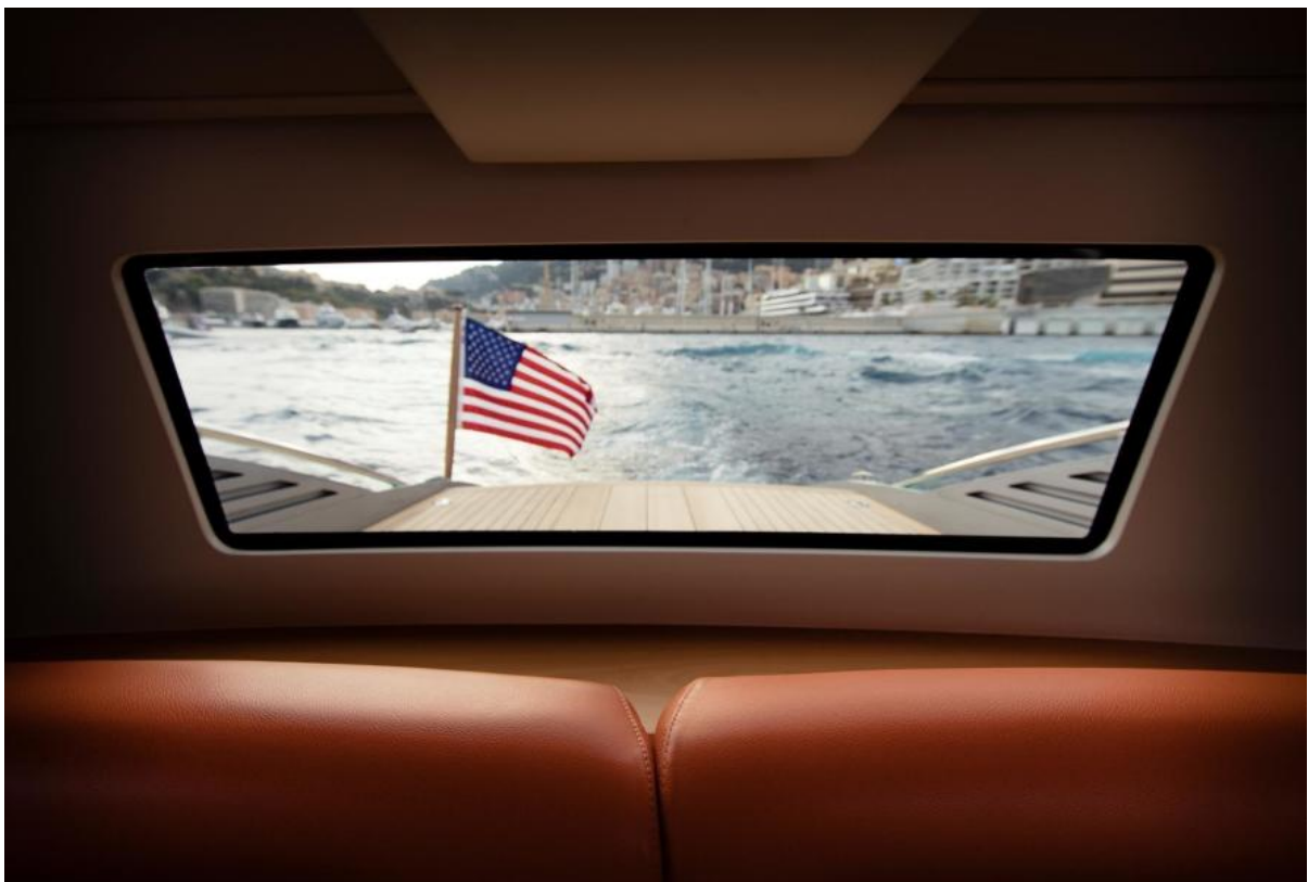
Aft salon window Aft view, looking out salon window while underway