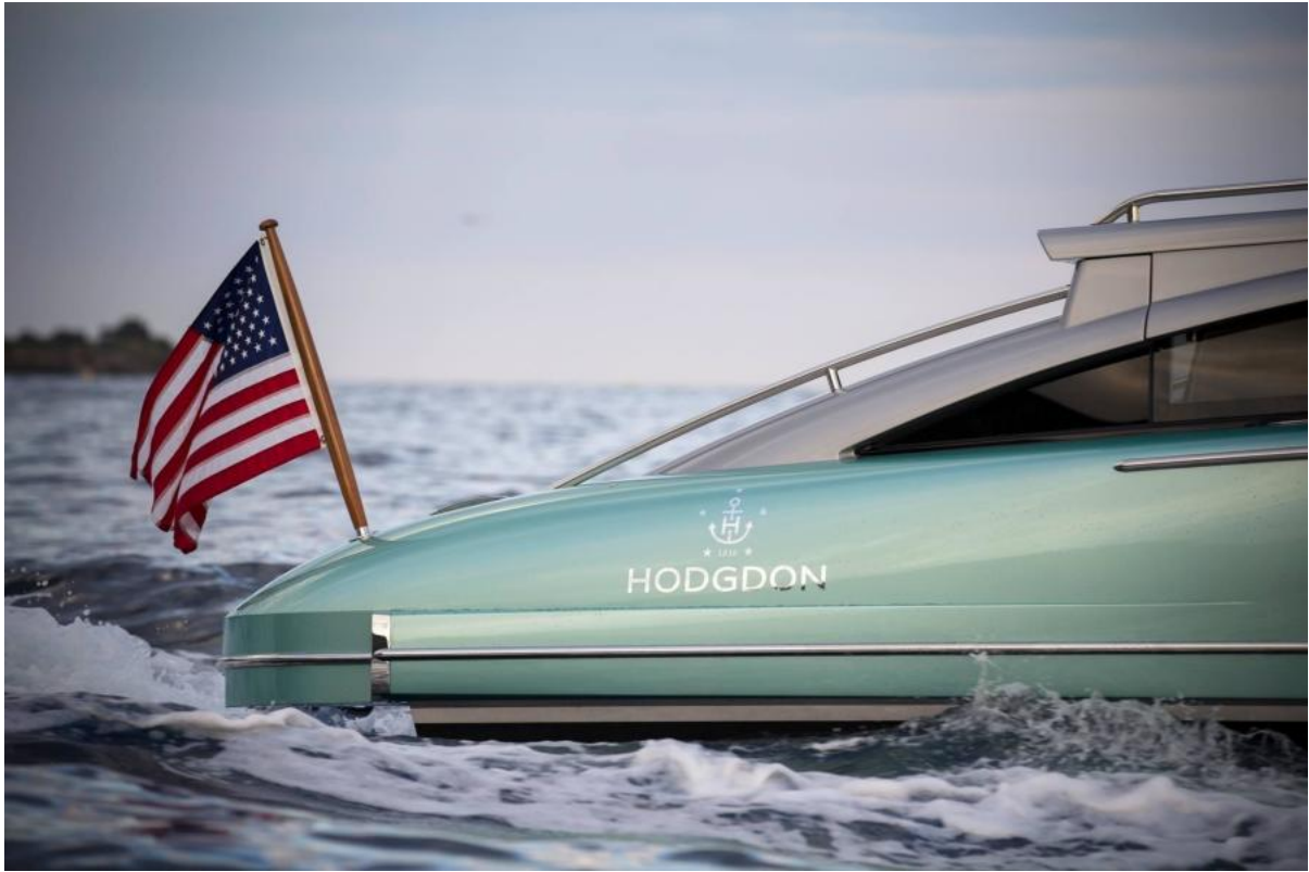
Port Side Aft