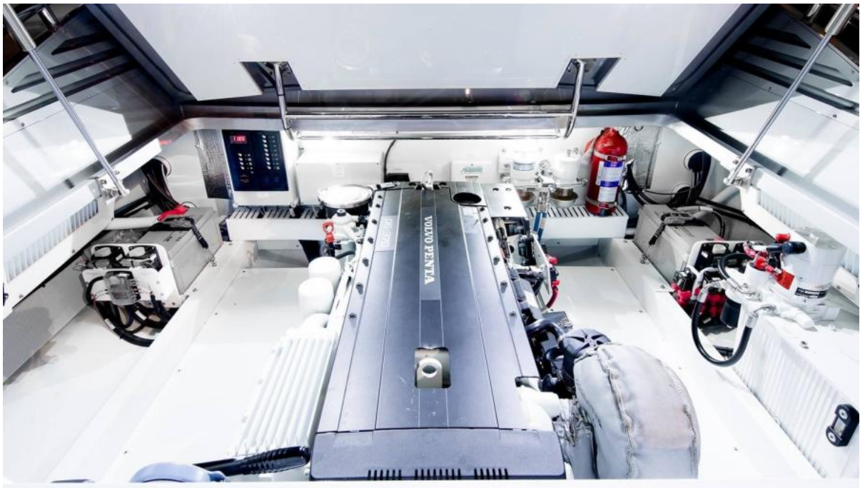
Engine Room Volvo D6 370HP