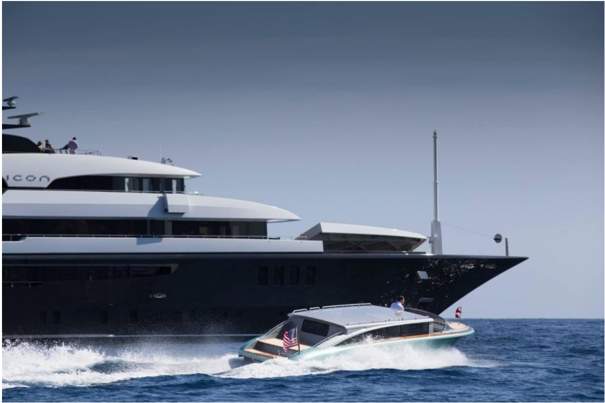
Underway from Superyacht