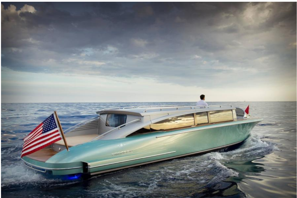
Starboard Starboard while underway