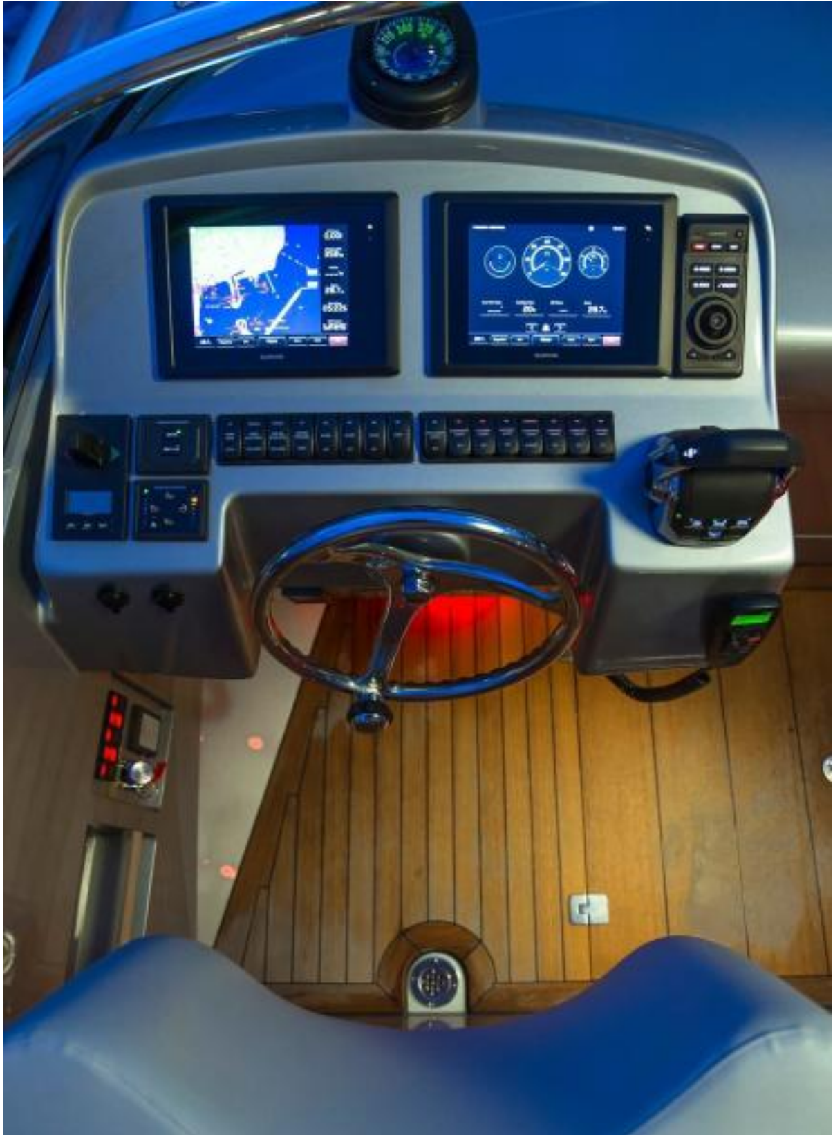
Helm Helm station electronics