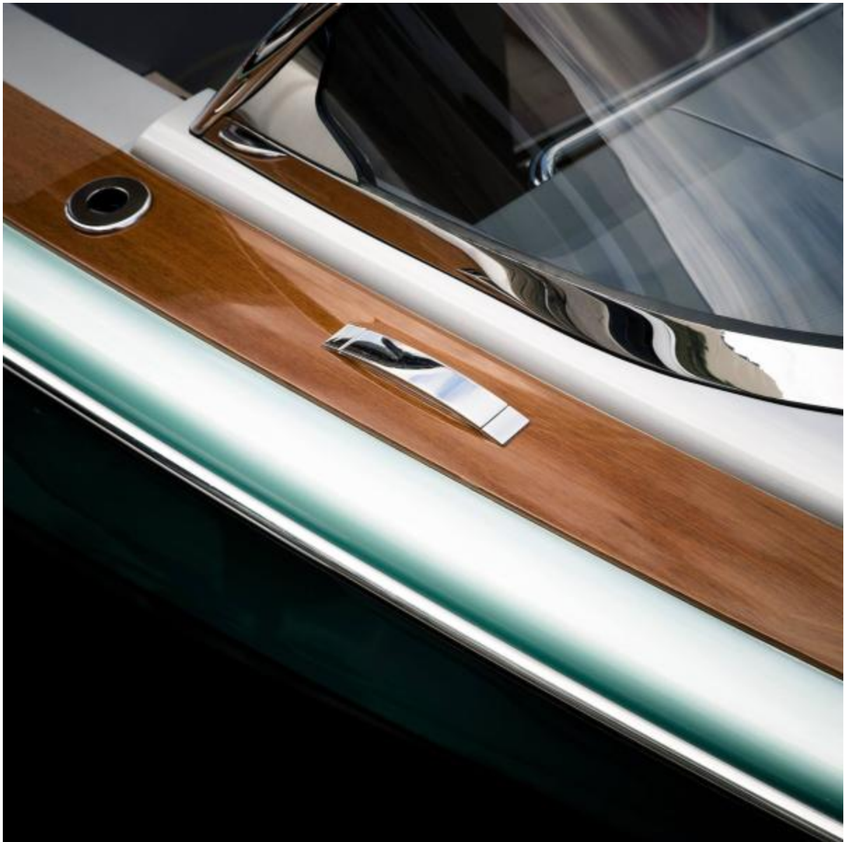
12 coats of varnish