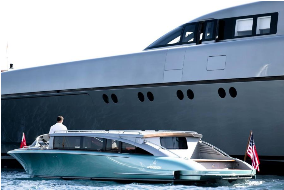
Hodgdon 10.5 Venetian SuperYacht Tender 2016 Hodgdon Yachts 10.5 Venetian SuperYacht Tender