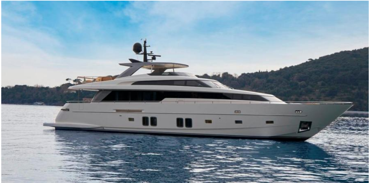
Peacekeeper- Sanlorenzo SL96