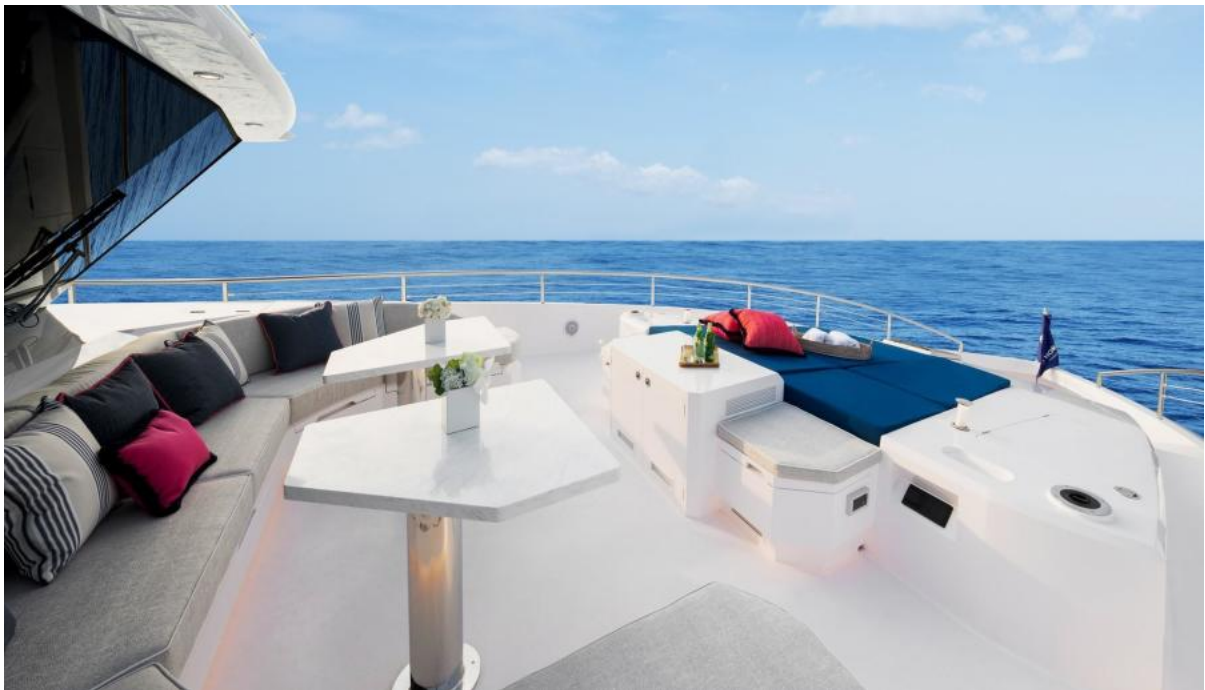
Sister ship Bow with U shape seating and table.