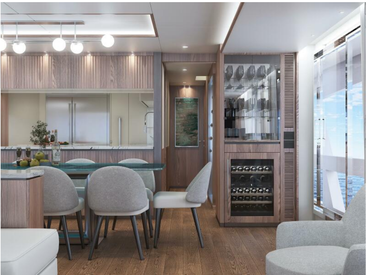
FD100 3D Renderings Dining with bar area and wine cooler.