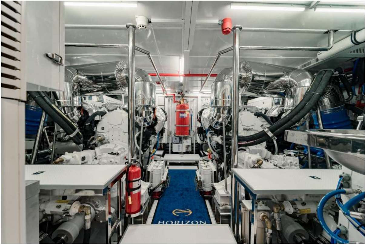
Sister ship Spacious engine room with fire system.