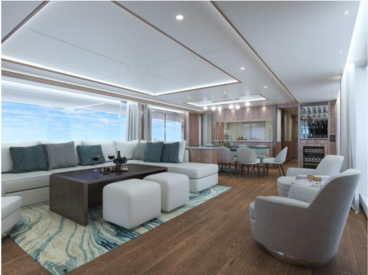
FD100 3D Renderings Custom salon table with push in ottomans.