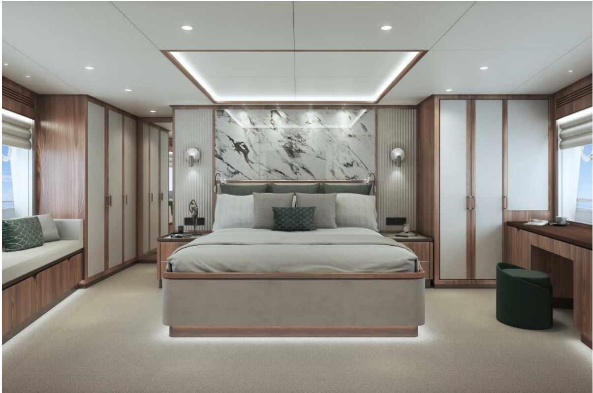
FD100 3D Renderings Master stateroom with a custom headboard.