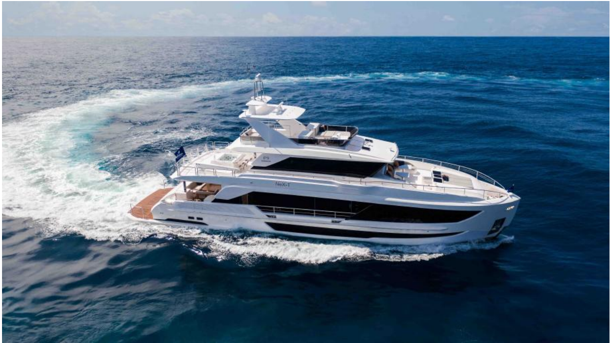
Sister ship Running in ocean