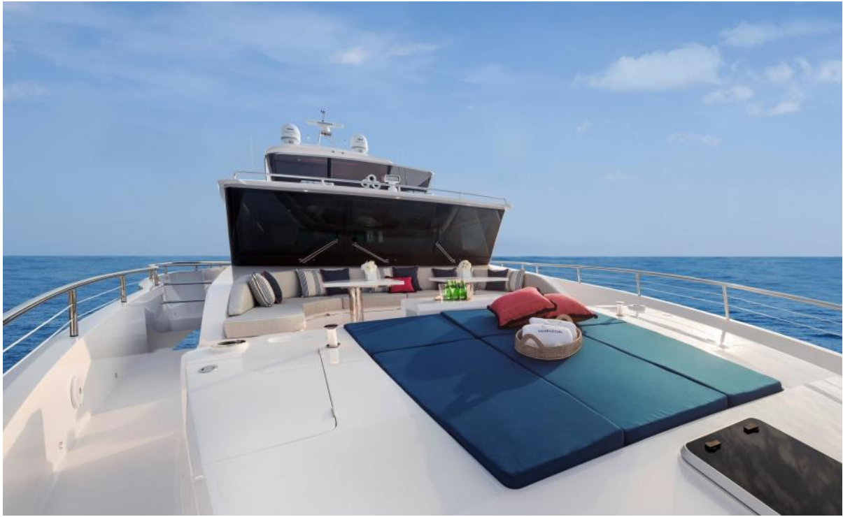
Sister ship Large bow area and blue sunpads.