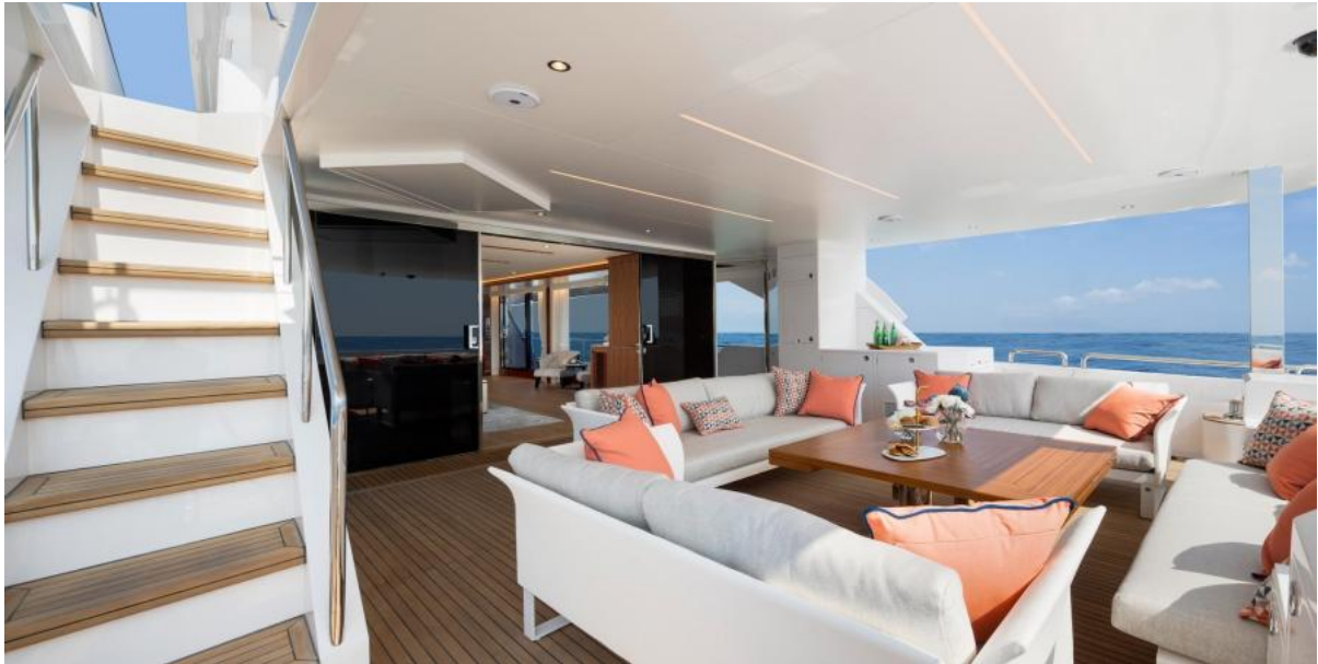
Sister ship Aft deck furniture with orange pillows.