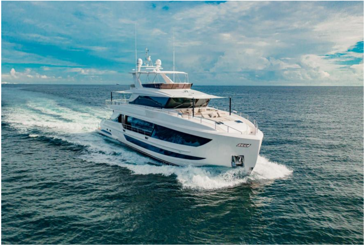
Sister ship F100 cruising the sea with sunshades on bow.