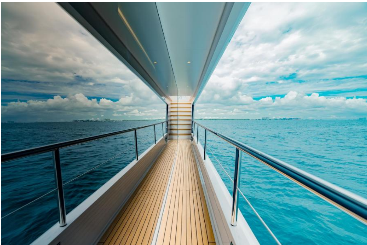
Sister ship Starboard walkway to bow.