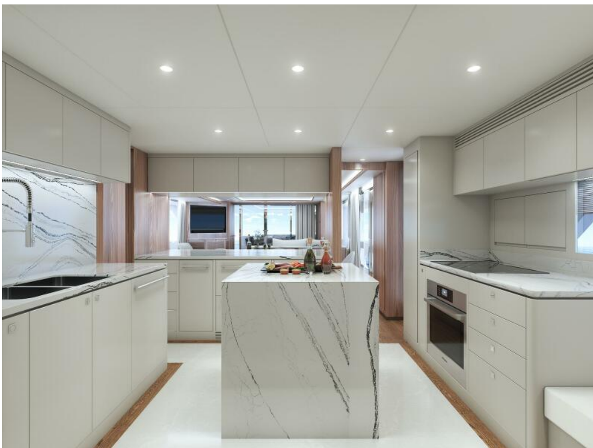
FD100 3D Renderings Large bright open galley with waterfall island.