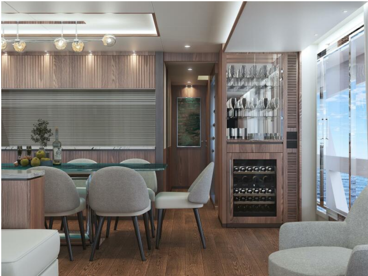
FD100 3D Renderings High-low galley privacy screen closed.