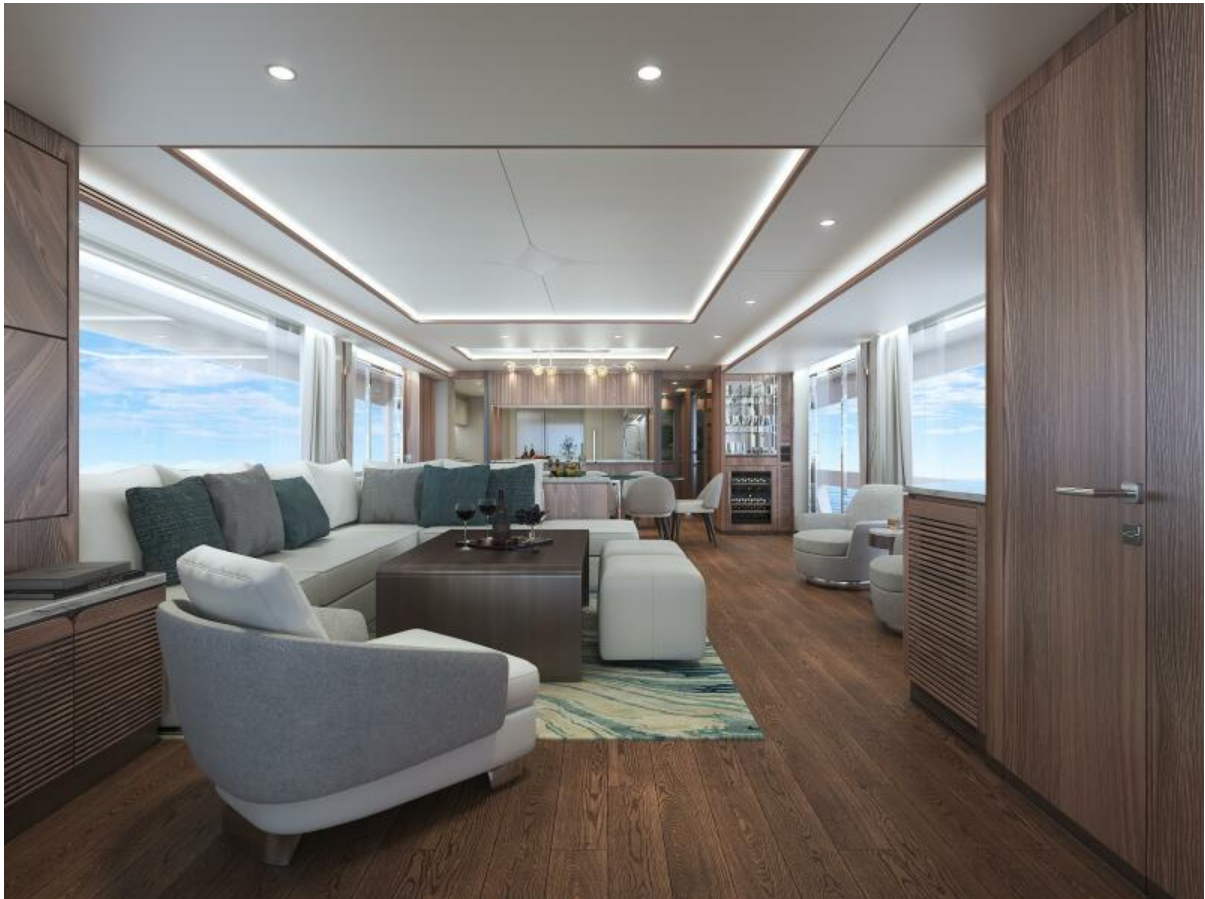
FD100 3D Renderings Forward-facing salon with lounge chair and couch.