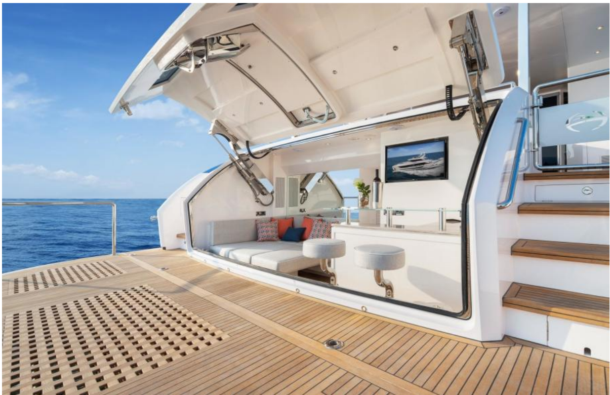
Sister ship Beach club with bar and TV.