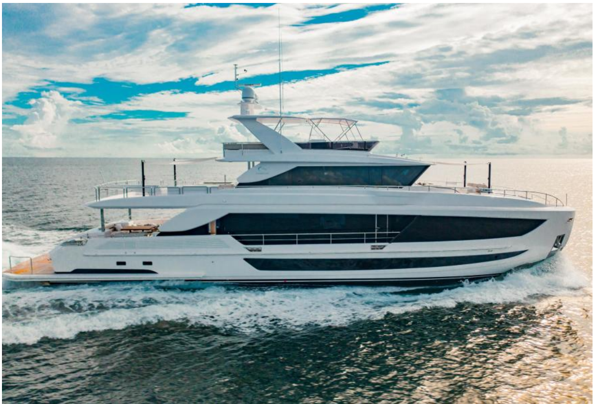
Sister ship FD100 running across flat sea.