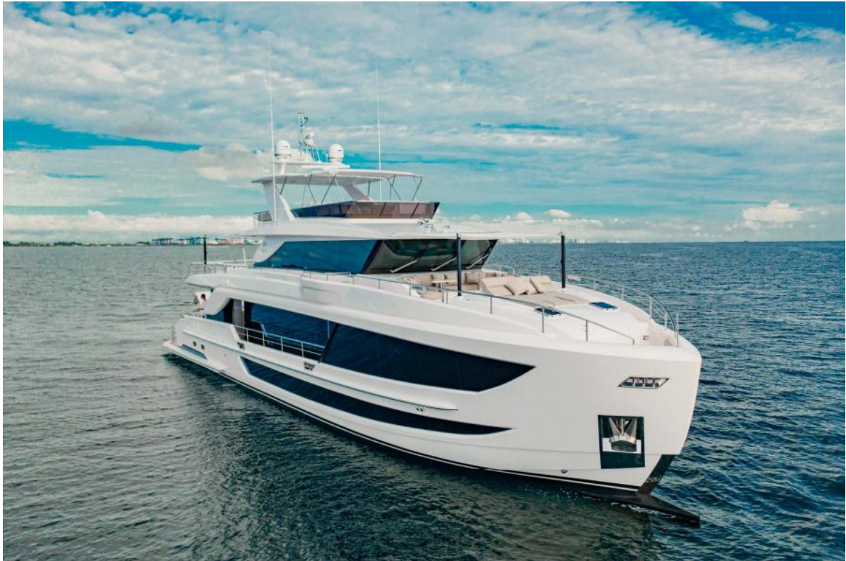
Sister ship Still shot of bow and sunshade.