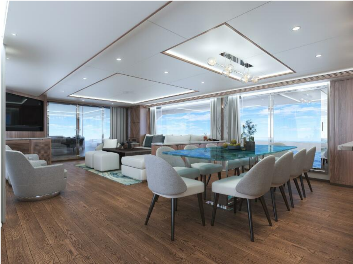
FD100 3D Renderings Salon with TV and dining table.