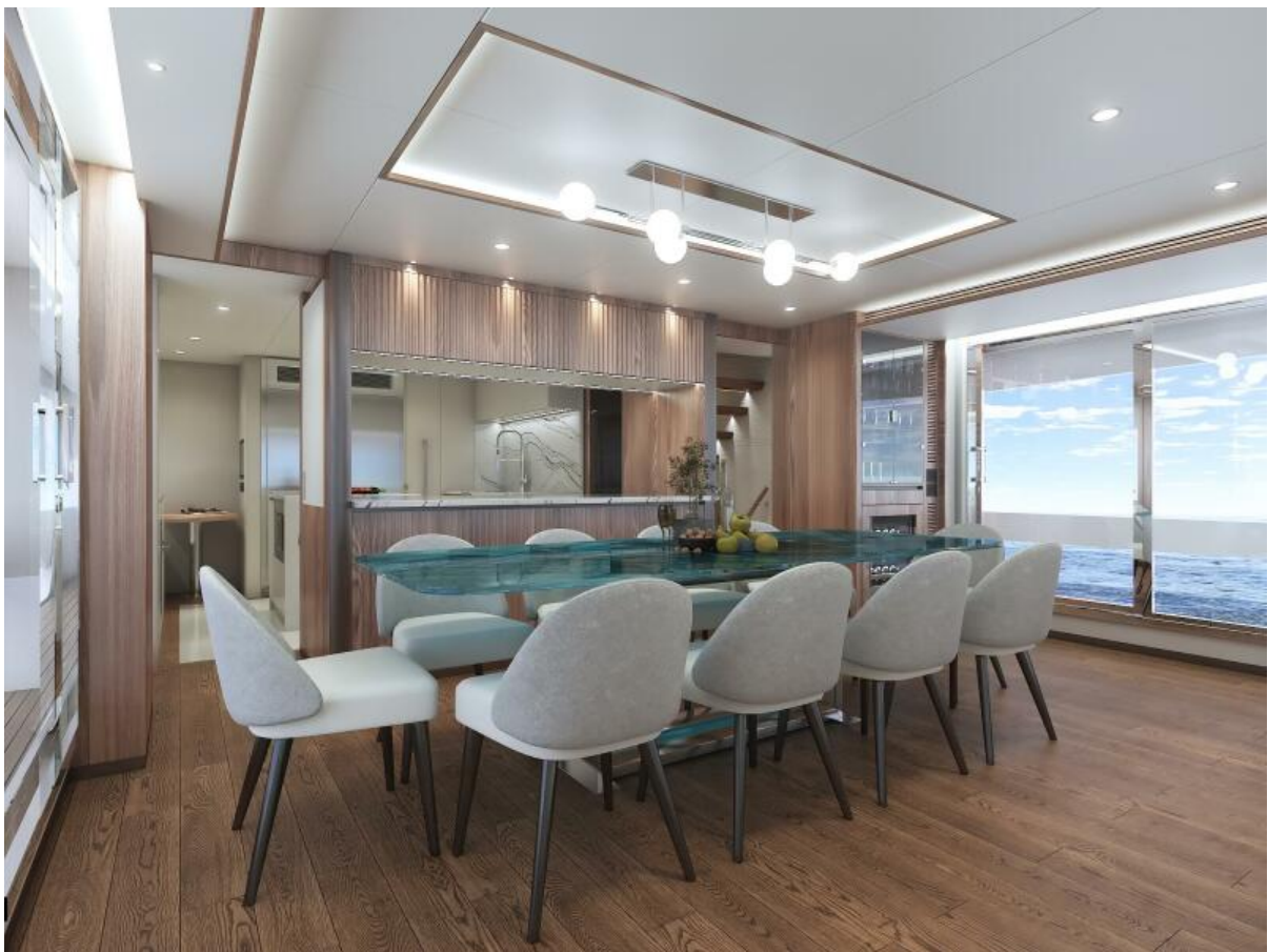
FD100 3D Renderings Dining area with large windows and seating for ten.