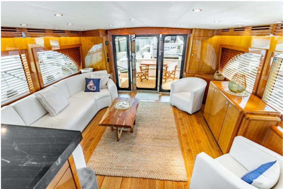
Salon aft view