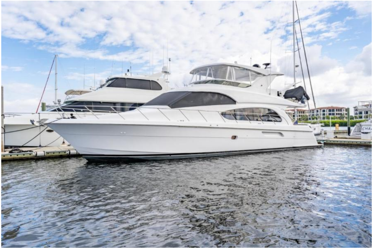
"BellisSimo" 2011 64' Hatteras Profile