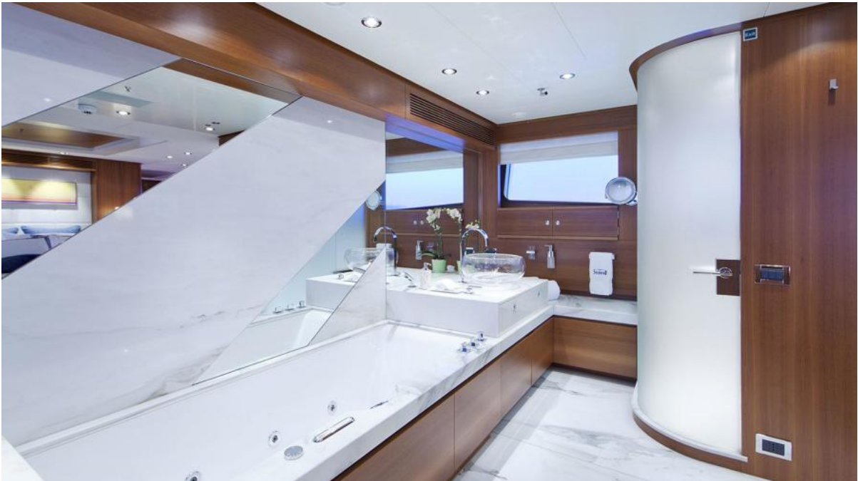
SNOWBIRD 128'/39m Hakvoort Tri-Deck Motor Yacht 2010/2020 Master Ensuite