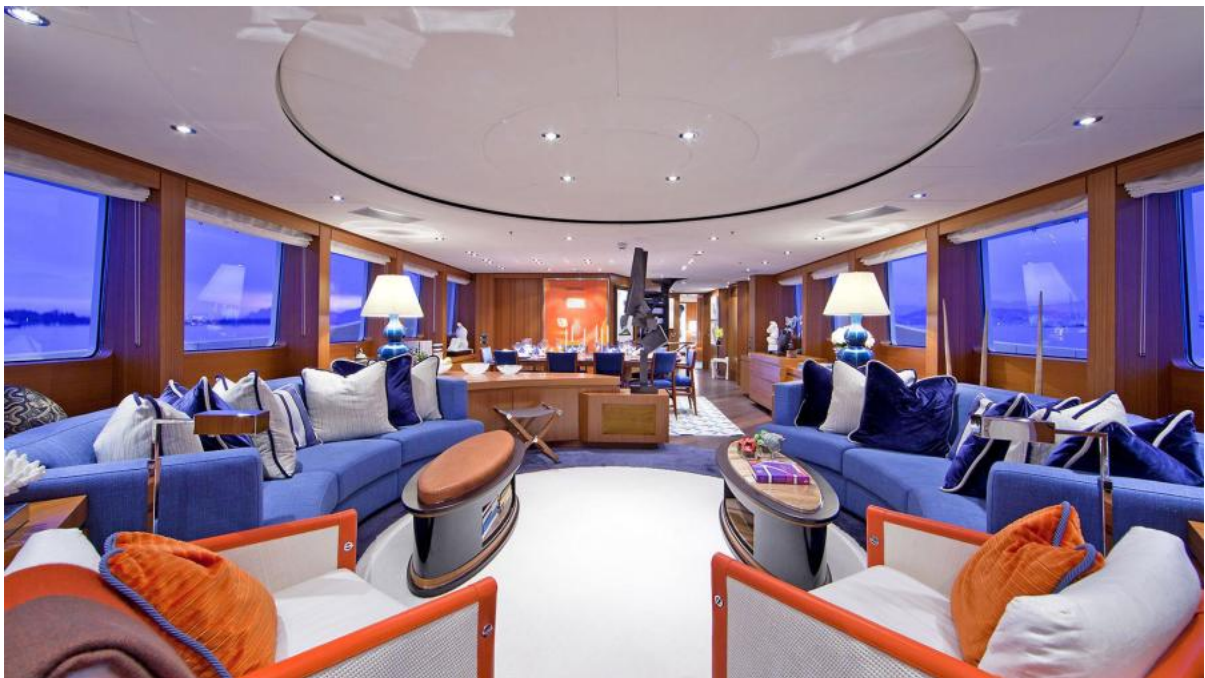
SNOWBIRD 128'/39m Hakvoort Tri-Deck Motor Yacht 2010/2020 Main Salon