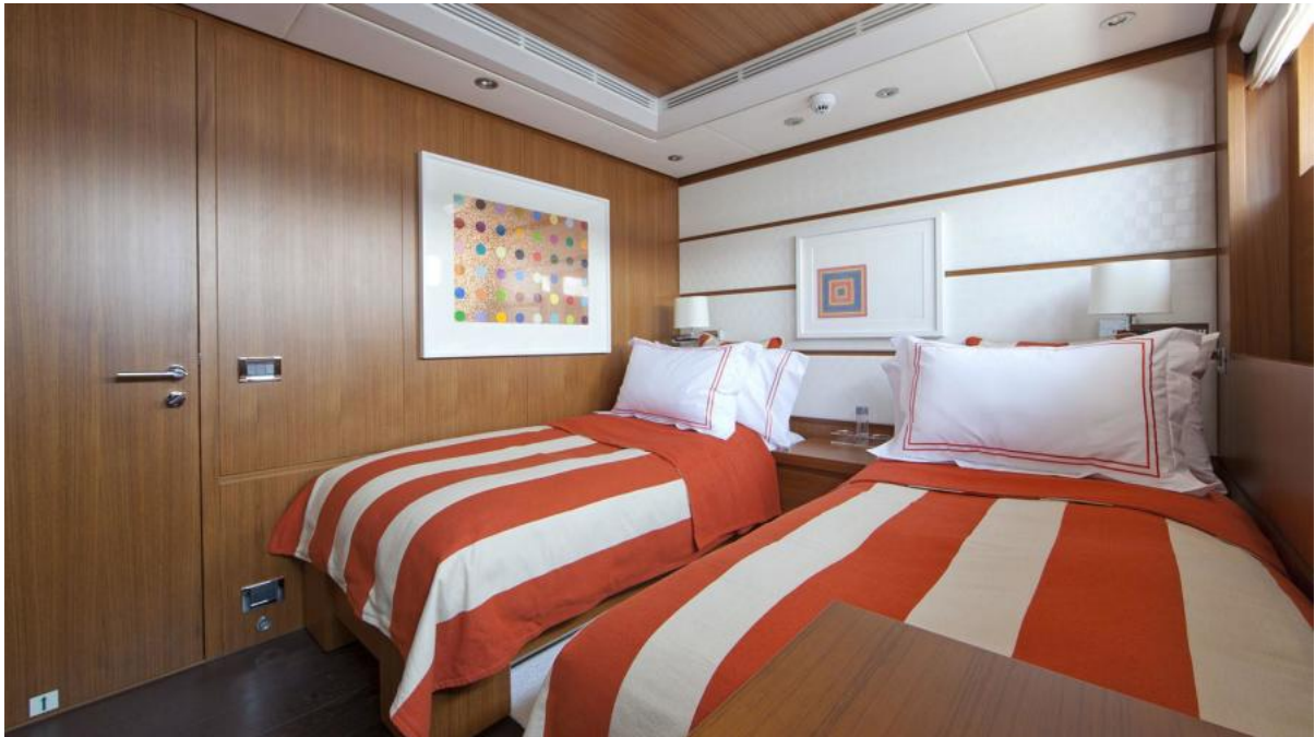
SNOWBIRD 128'/39m Hakvoort Tri-Deck Motor Yacht 2010/2020 (1) Twin Ensuite, Convertible