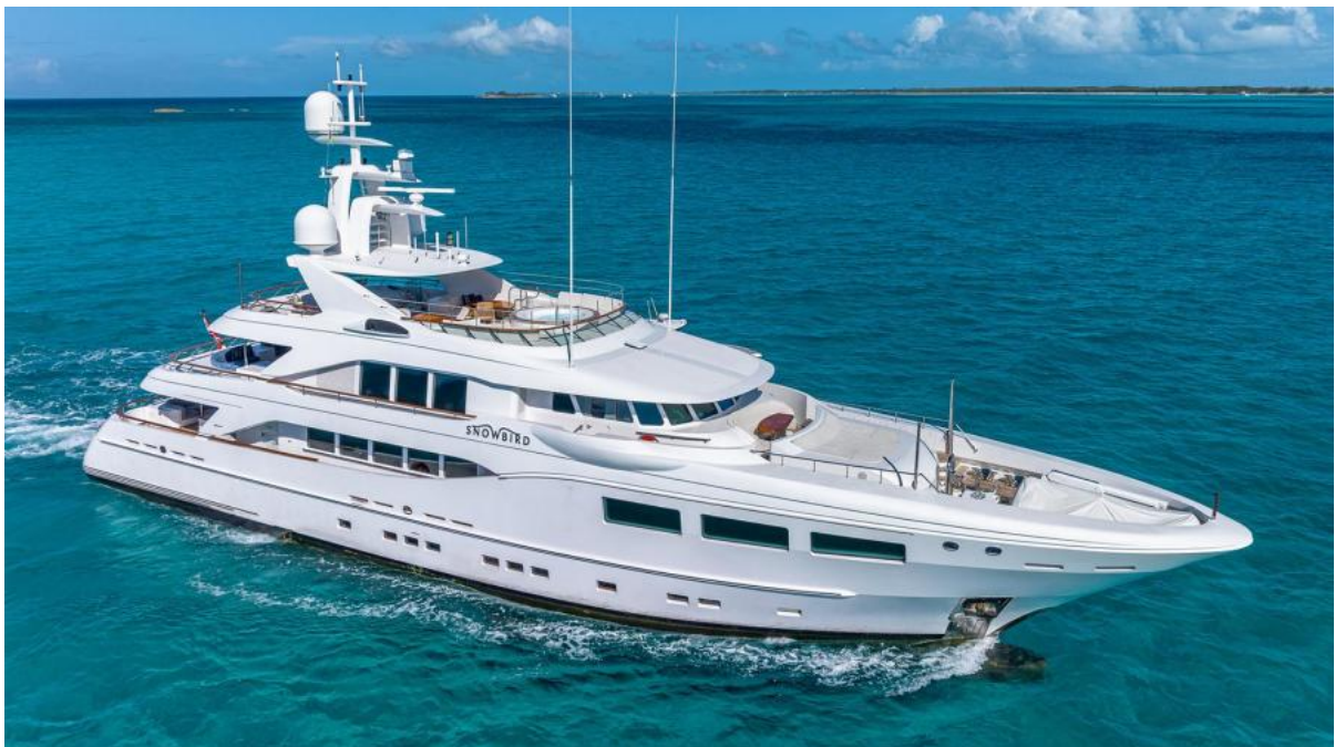
SNOWBIRD 128'/39m Hakvoort Tri-Deck Motor Yacht 2010/2020