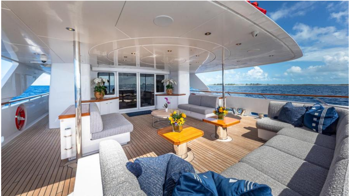
SNOWBIRD 128'/39m Hakvoort Tri-Deck Motor Yacht 2010/2020 Main Deck Aft