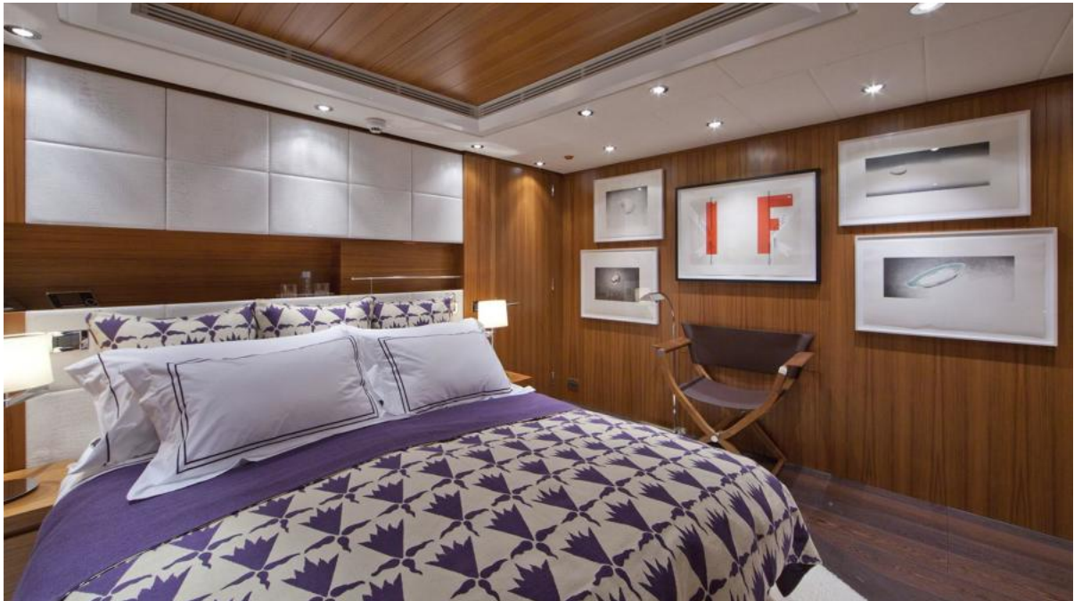
SNOWBIRD 128'/39m Hakvoort Tri-Deck Motor Yacht 2010/2020 (1) VIP Ensuite