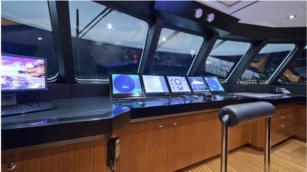
SNOWBIRD 128'/39m Hakvoort Tri-Deck Motor Yacht 2010/2020 Wheelhouse