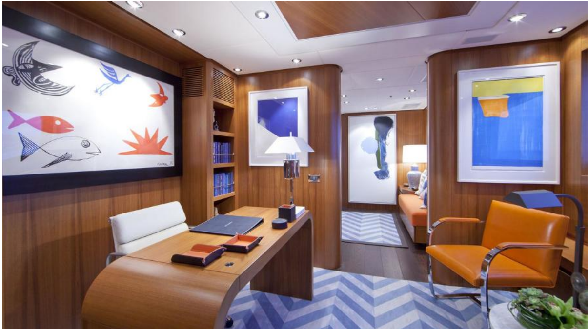
SNOWBIRD 128'/39m Hakvoort Tri-Deck Motor Yacht 2010/2020 Private Master Office