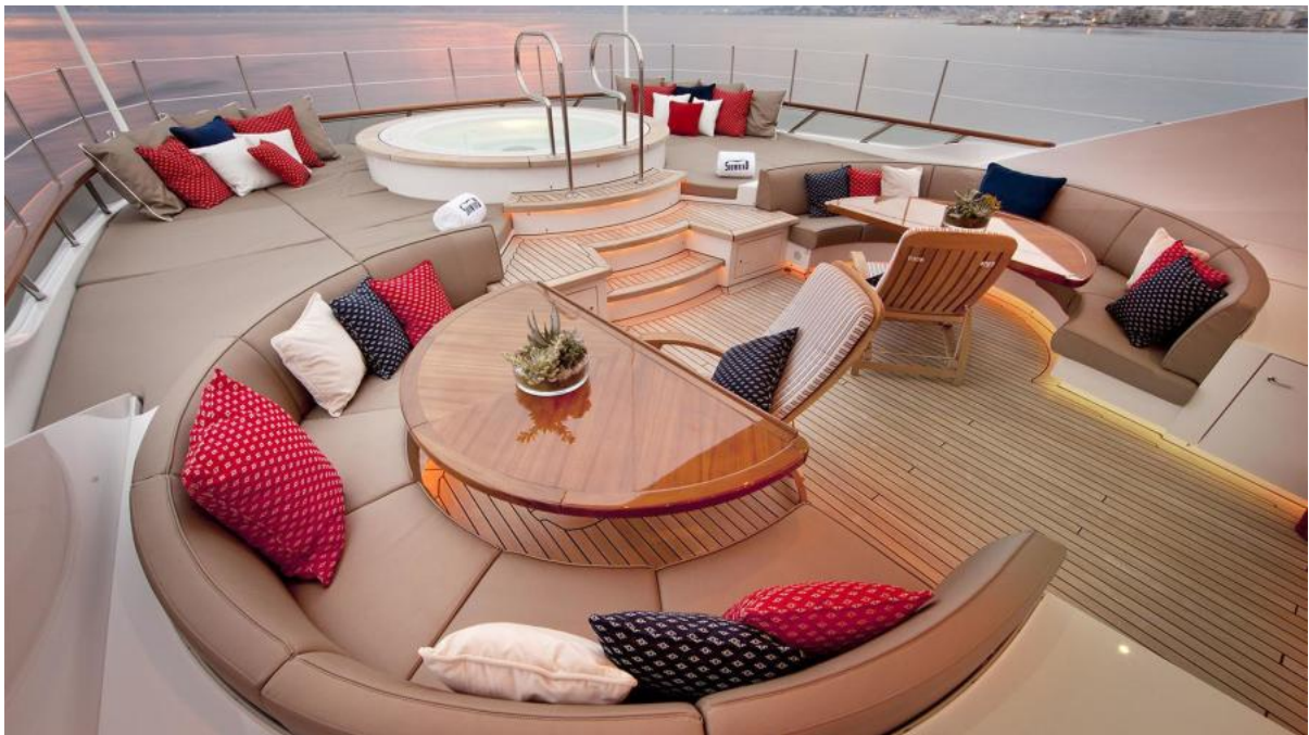
SNOWBIRD 128'/39m Hakvoort Tri-Deck Motor Yacht 2010/2020 Jacuzzi and Sundeck Seating