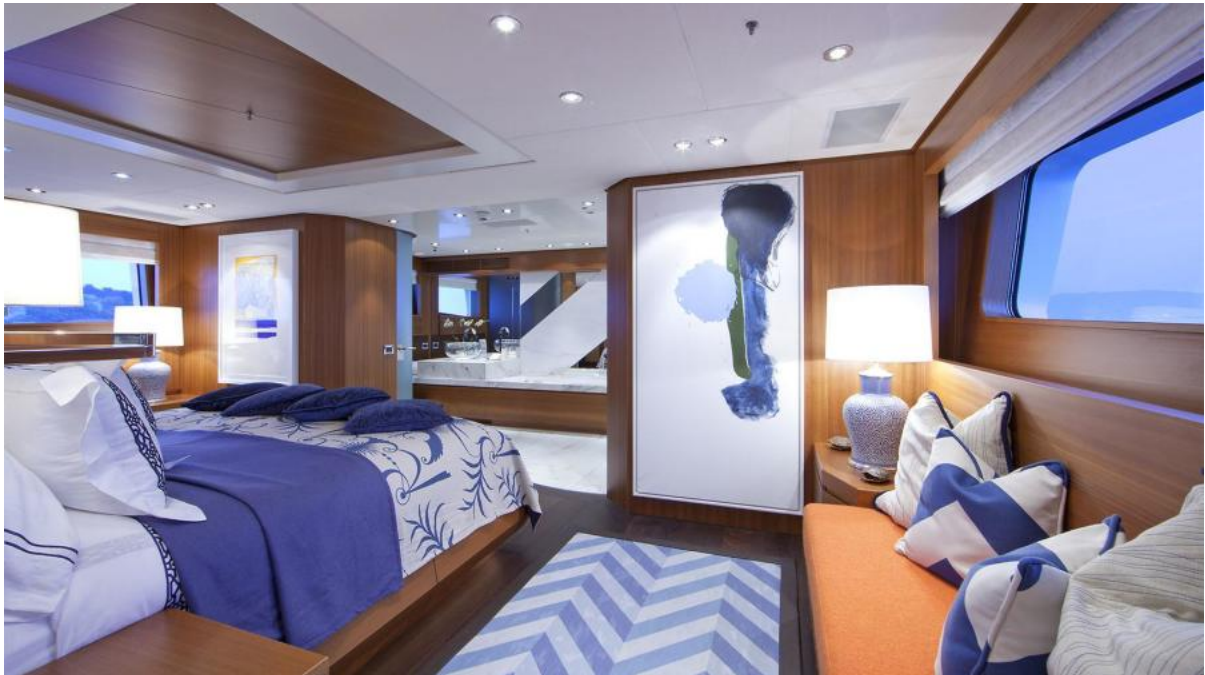
SNOWBIRD 128'/39m Hakvoort Tri-Deck Motor Yacht 2010/2020 Master Stateroom