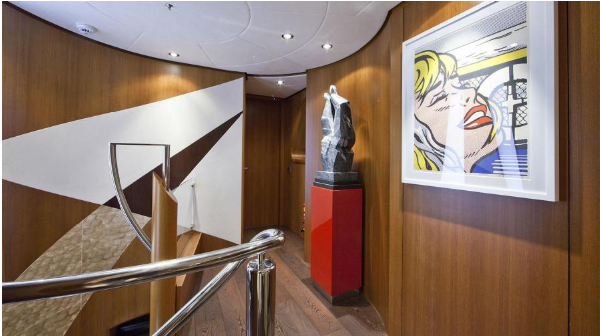
SNOWBIRD 128'/39m Hakvoort Tri-Deck Motor Yacht 2010/2020 Bridge Deck Lobby