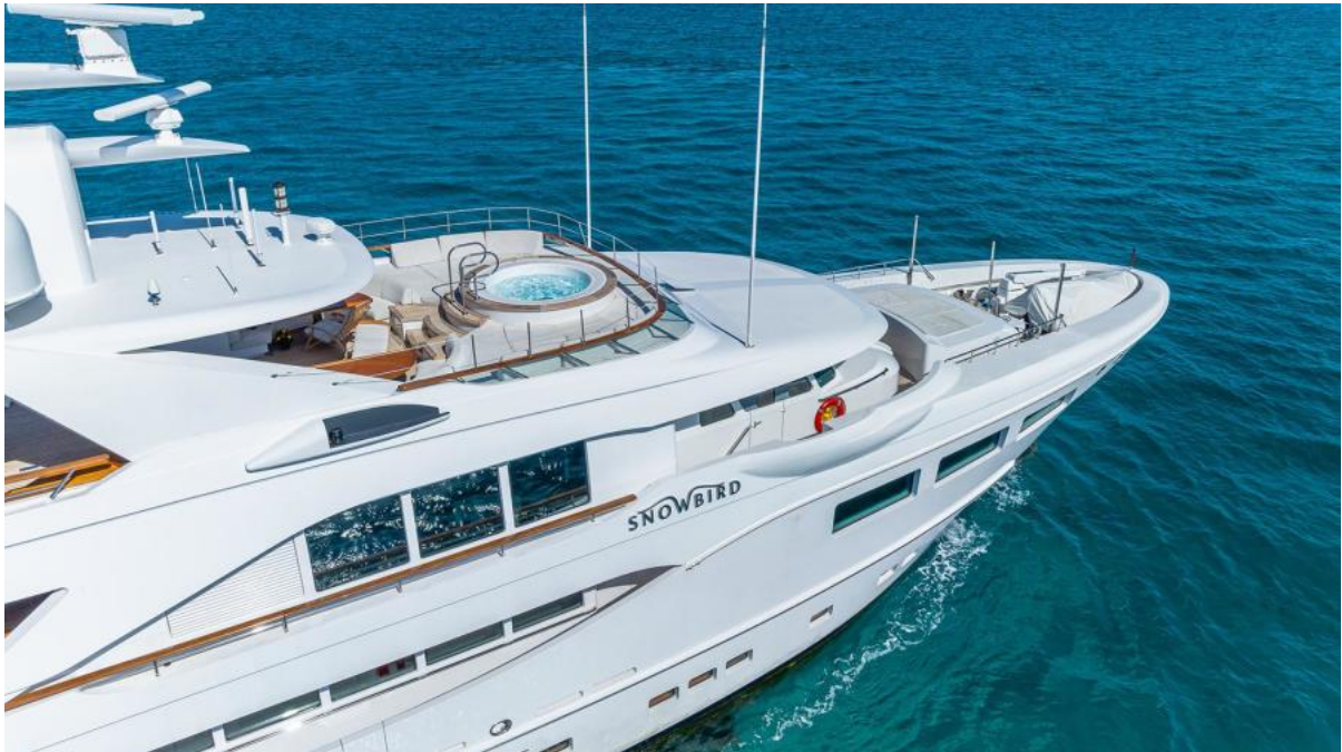
SNOWBIRD 128'/39m Hakvoort Tri-Deck Motor Yacht 2010/2020