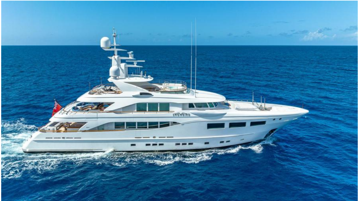
SNOWBIRD 128'/39m Hakvoort Tri-Deck Motor Yacht 2010/2020