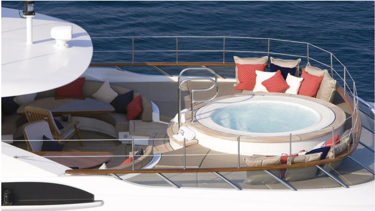
SNOWBIRD 128'/39m Hakvoort Tri-Deck Motor Yacht 2010/2020 Aerial Jacuzzi