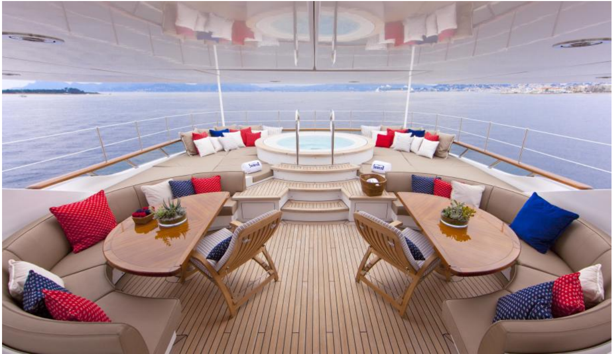
SNOWBIRD 128'/39m Hakvoort Tri-Deck Motor Yacht 2010/2020 Jacuzzi and Sundeck Seating