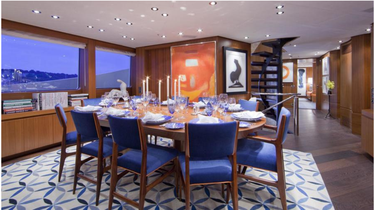
SNOWBIRD 128'/39m Hakvoort Tri-Deck Motor Yacht 2010/2020 Main Salon Dining Area