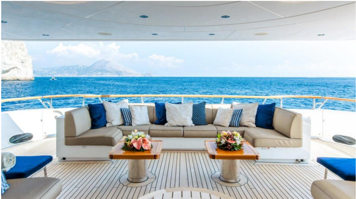
SNOWBIRD 128'/39m Hakvoort Tri-Deck Motor Yacht 2010/2020 Main Deck Aft