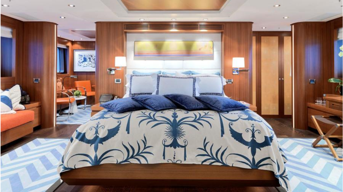
SNOWBIRD 128'/39m Hakvoort Tri-Deck Motor Yacht 2010/2020 Master Stateroom