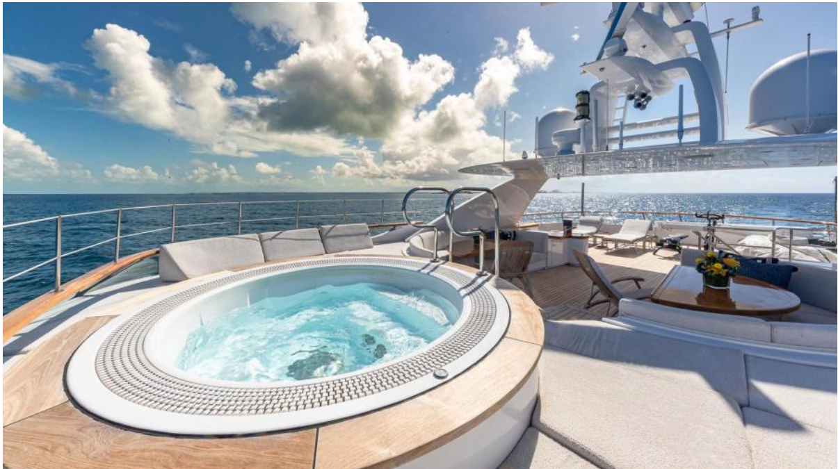
SNOWBIRD 128'/39m Hakvoort Tri-Deck Motor Yacht 2010/2020 Jacuzzi