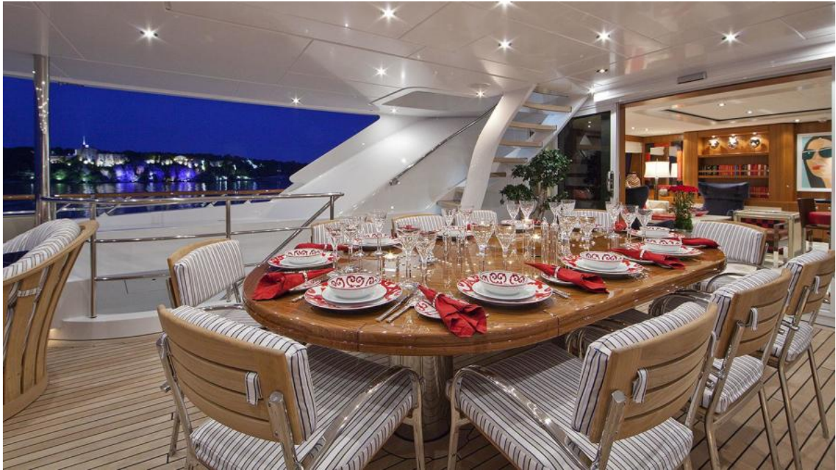
SNOWBIRD 128'/39m Hakvoort Tri-Deck Motor Yacht 2010/2020 Bridge Aft Dining