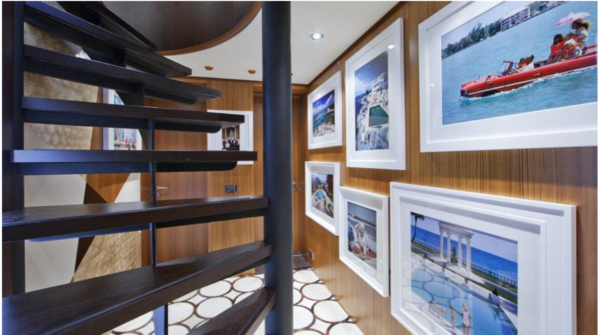
SNOWBIRD 128'/39m Hakvoort Tri-Deck Motor Yacht 2010/2020 Lower Deck Guest Lobby