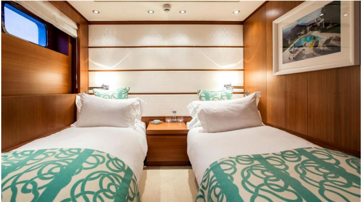
SNOWBIRD 128'/39m Hakvoort Tri-Deck Motor Yacht 2010/2020 (2) Twin Ensuite, Convertible