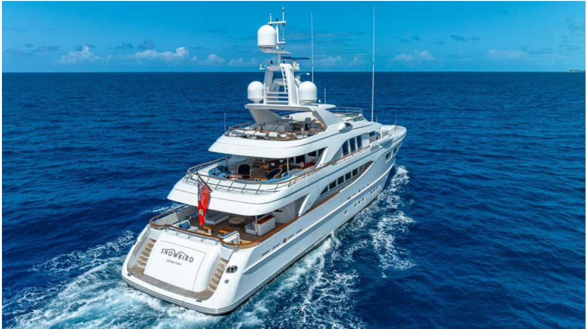
SNOWBIRD 128'/39m Hakvoort Tri-Deck Motor Yacht 2010/2020