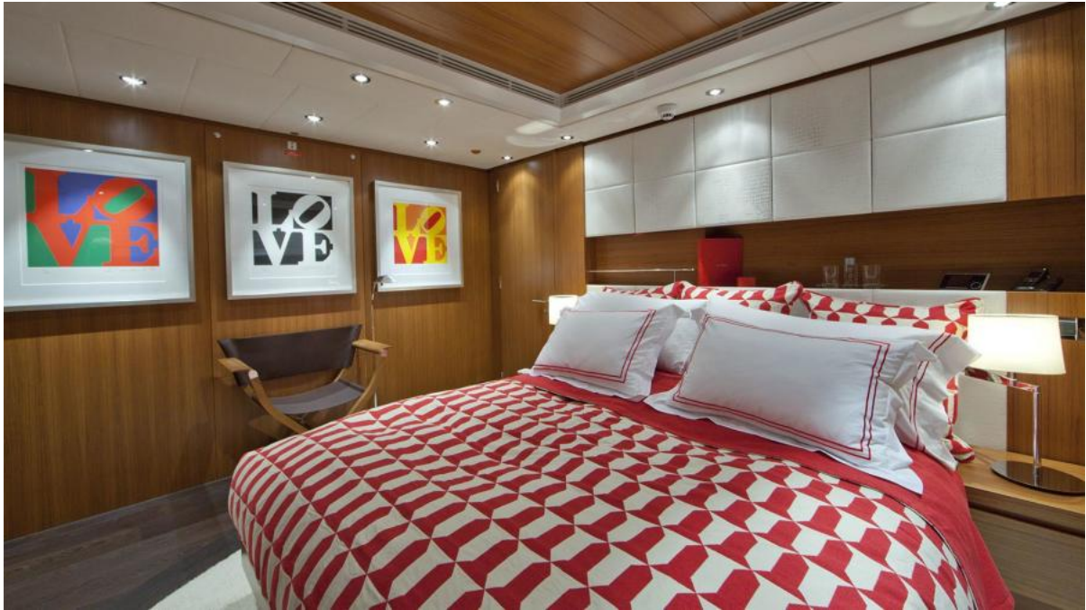
SNOWBIRD 128'/39m Hakvoort Tri-Deck Motor Yacht 2010/2020 (2) VIP Ensuite