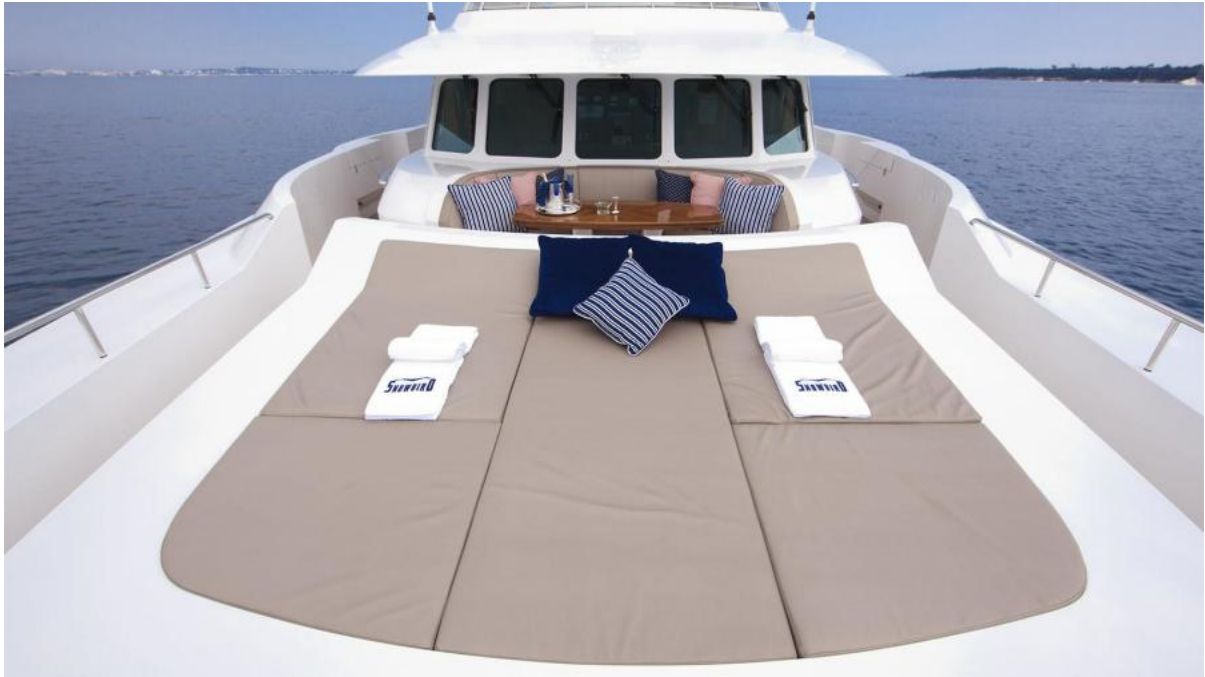
SNOWBIRD 128'/39m Hakvoort Tri-Deck Motor Yacht 2010/2020 Foredeck