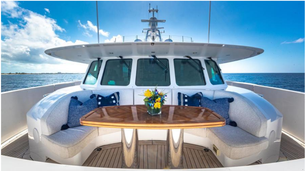
SNOWBIRD 128'/39m Hakvoort Tri-Deck Motor Yacht 2010/2020