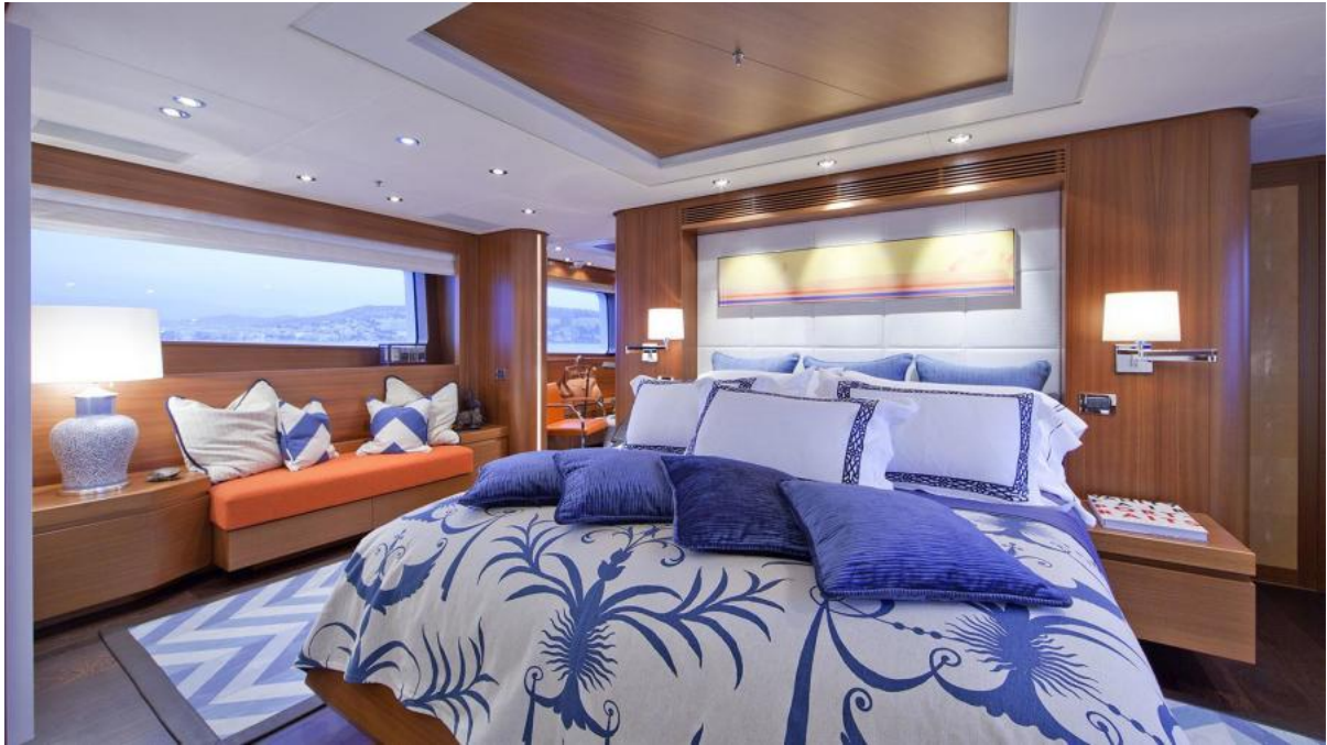
SNOWBIRD 128'/39m Hakvoort Tri-Deck Motor Yacht 2010/2020 Master Stateroom