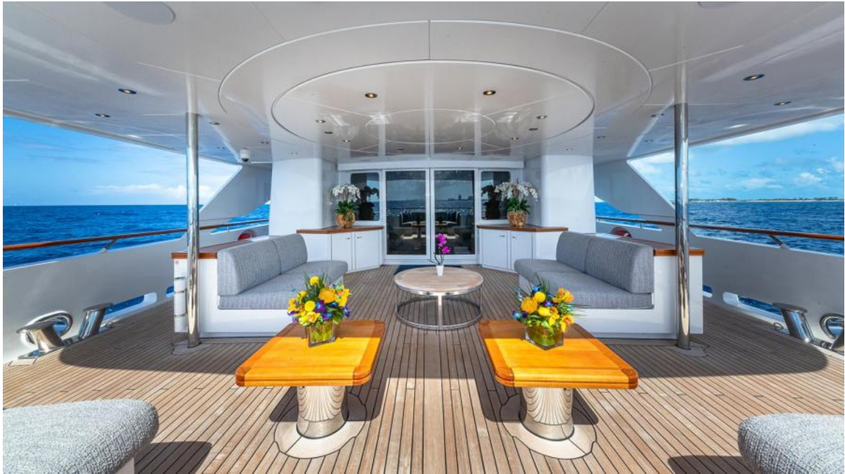
SNOWBIRD 128'/39m Hakvoort Tri-Deck Motor Yacht 2010/2020 Main Deck Aft