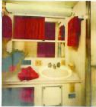
Guest stateroom head and adjacent stall shower.