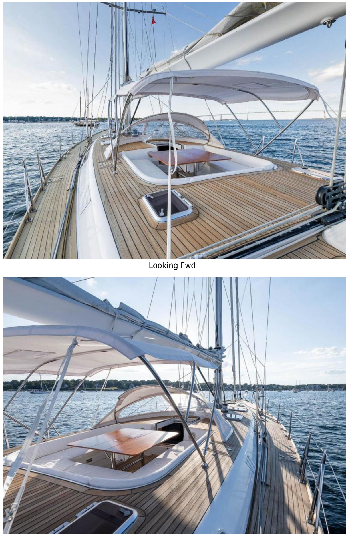
Stbd. Deck, Looking Fwd.