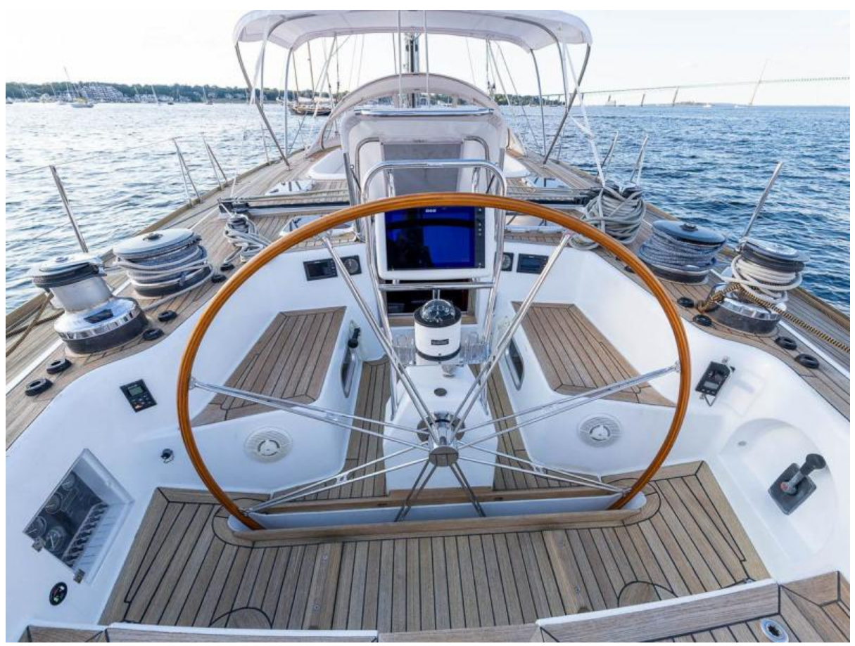
Aft Cockpit, Looking Fwd