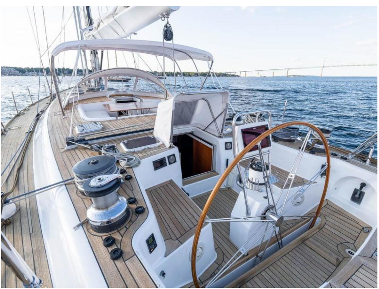
Aft Cockpit, Stbd.