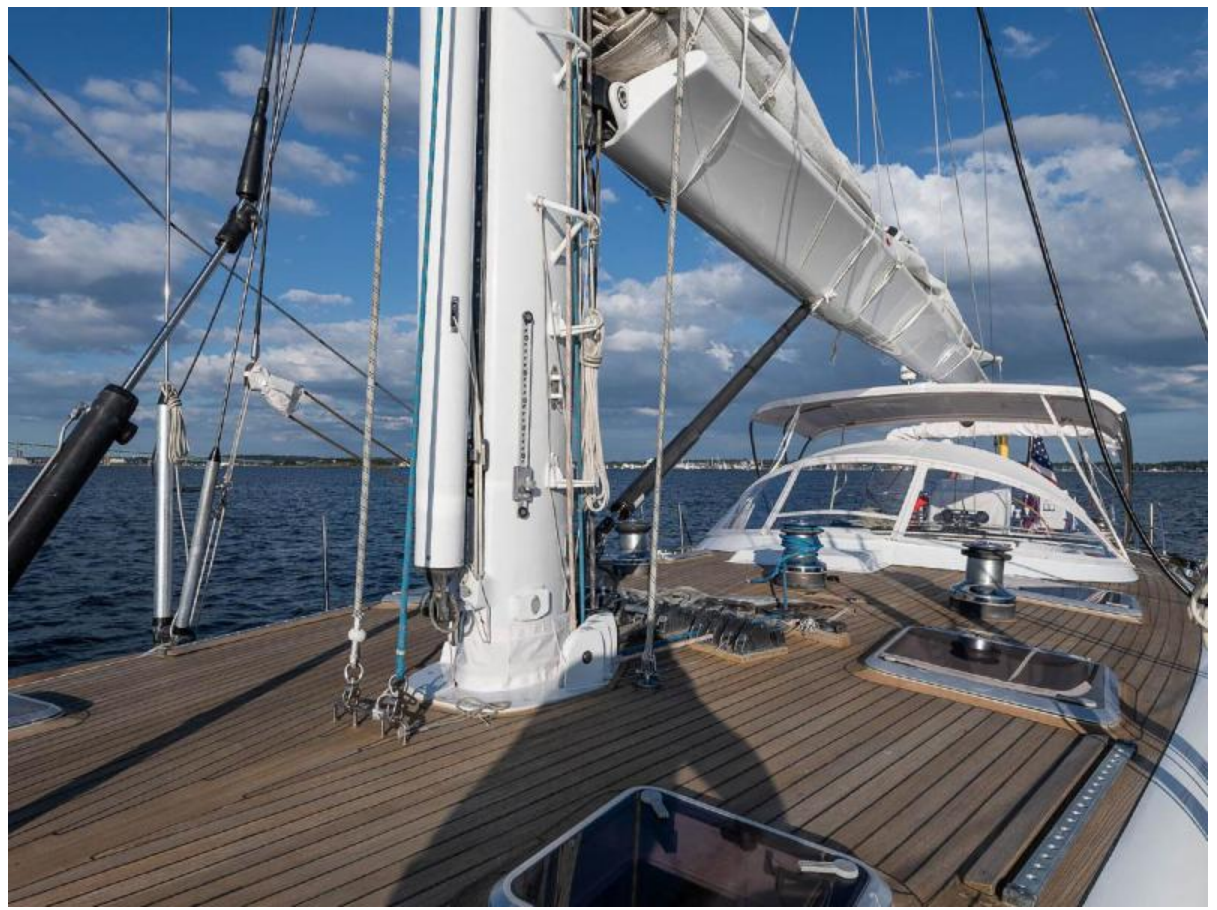
Mast Base, Looking Aft