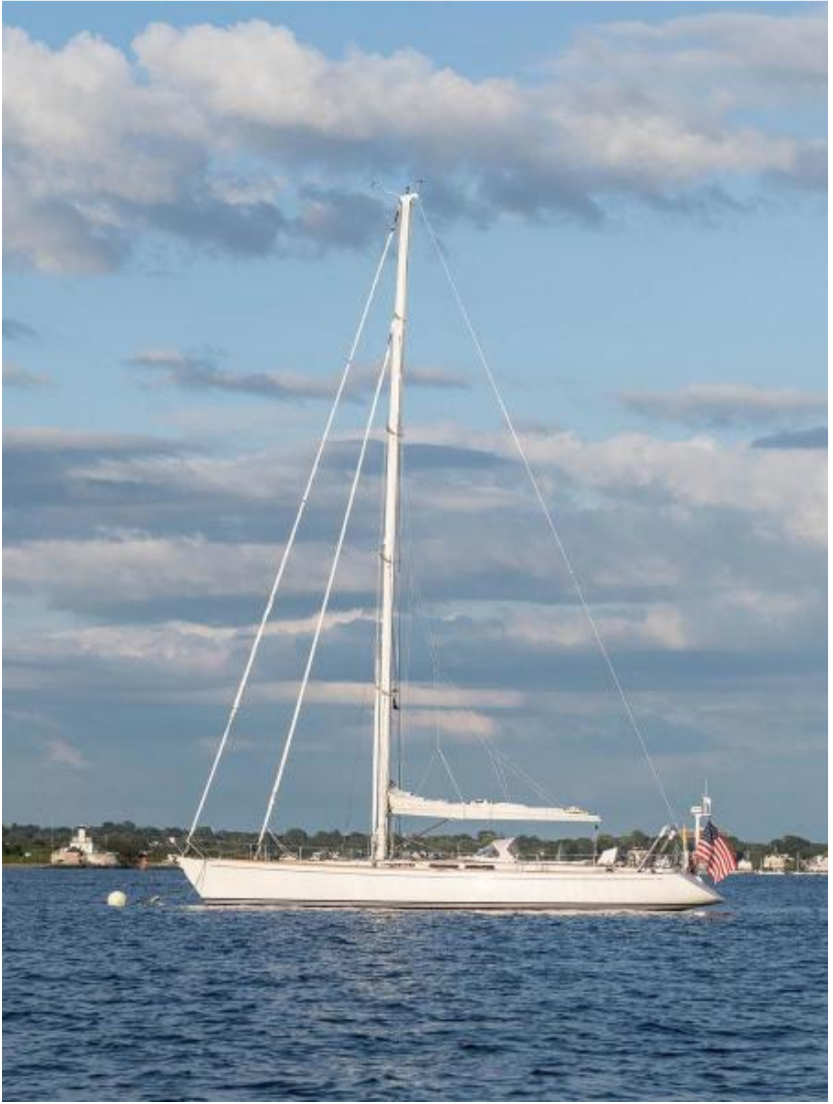
Port Profile, Mooring