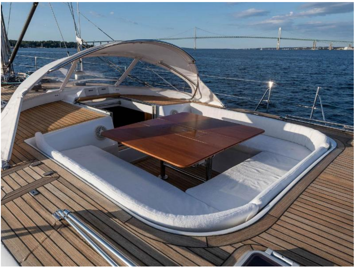
Center Cockpit, Table Up