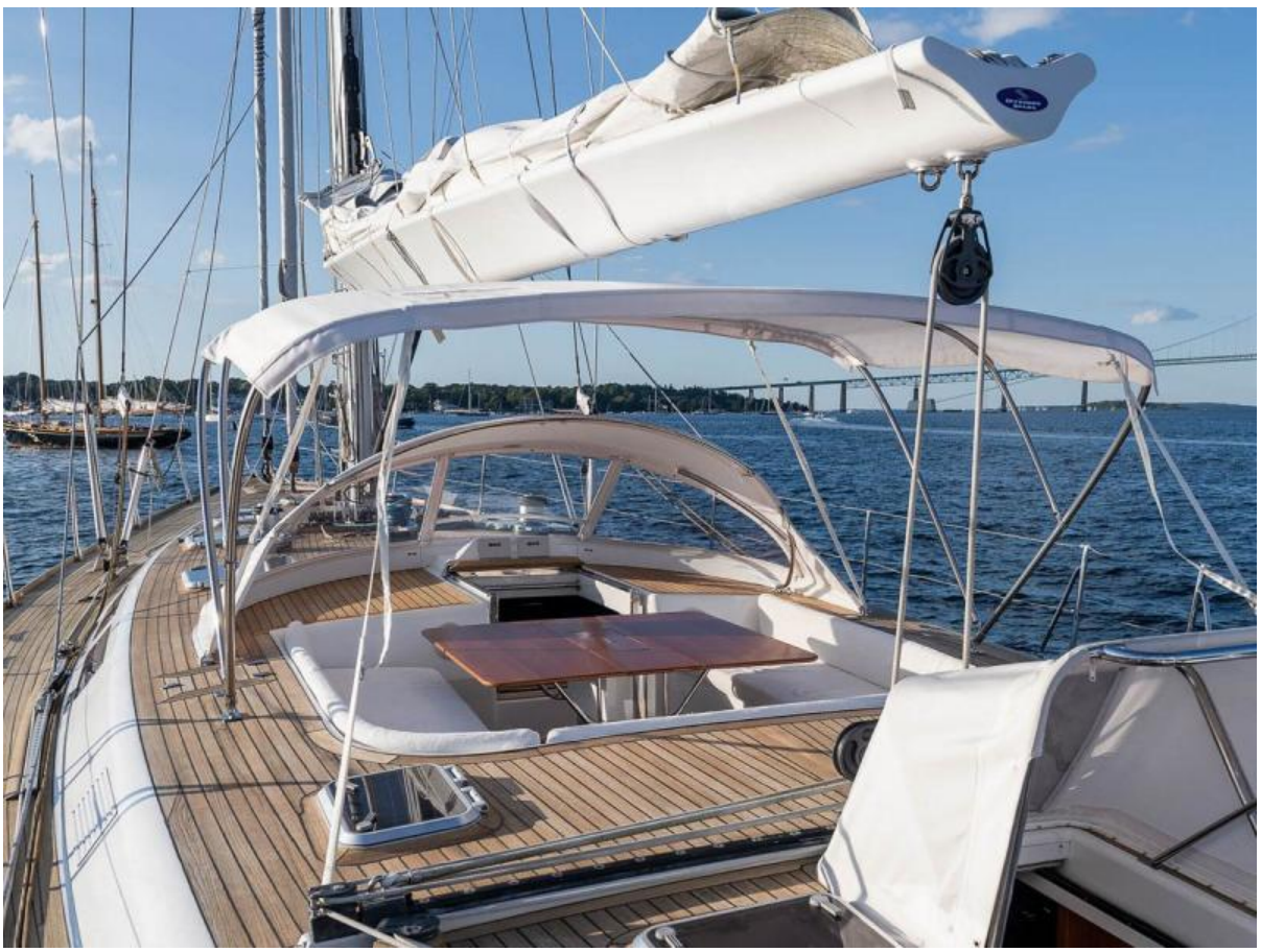
Center Cockpit, Looking Fwd.