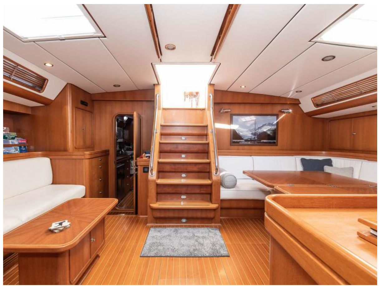
Main Salon, Looking Aft