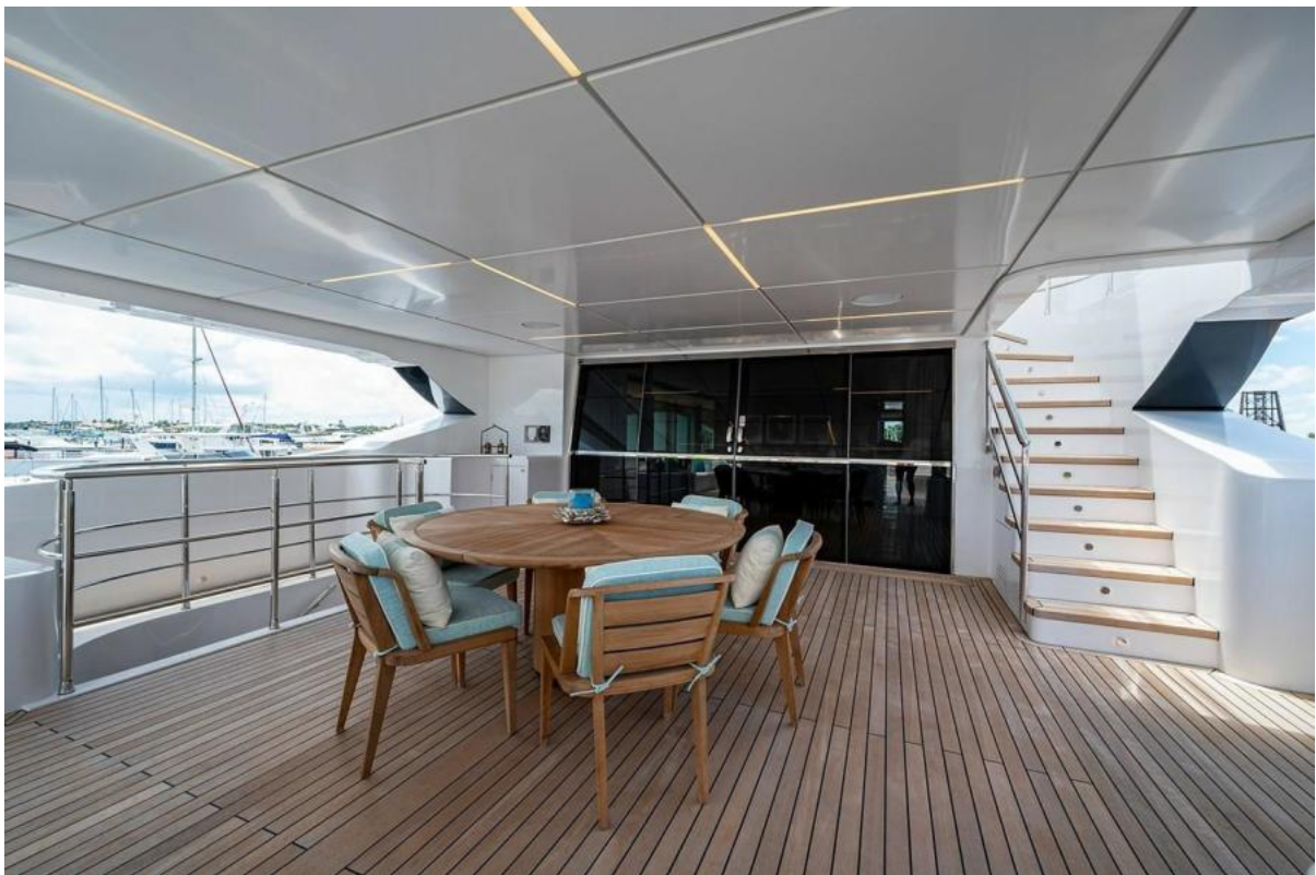
Skylounge Aft Deck