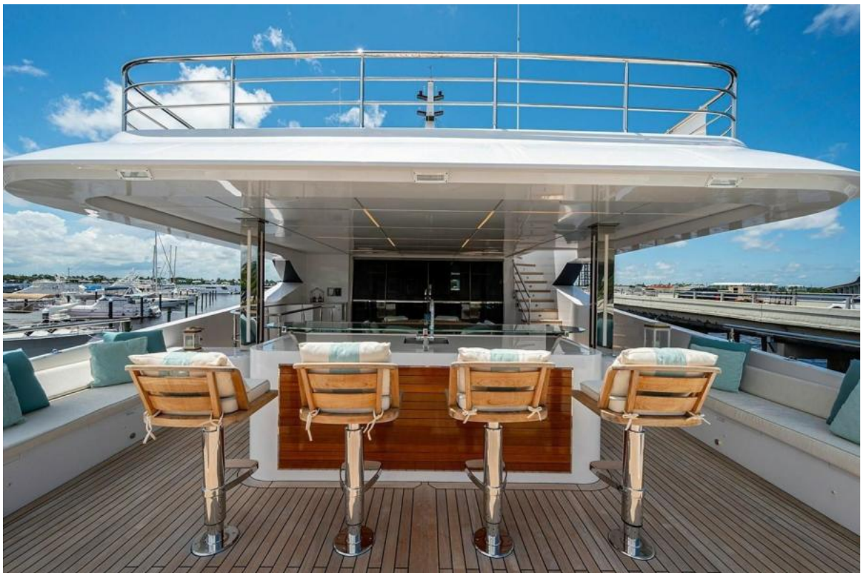
Skylounge Aft Deck