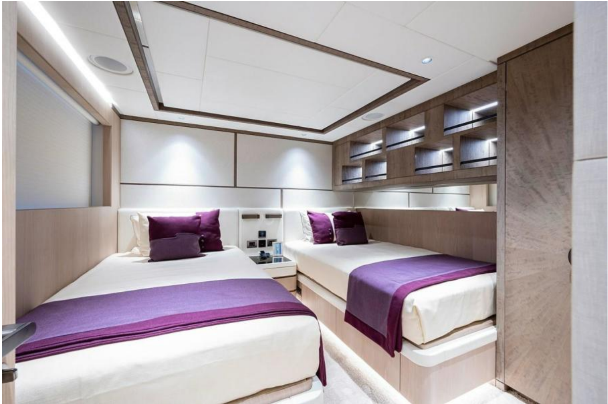
Port Forward Guest Stateroom