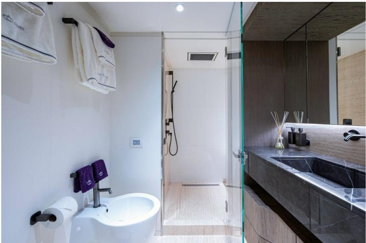
Port Forward Guest Head