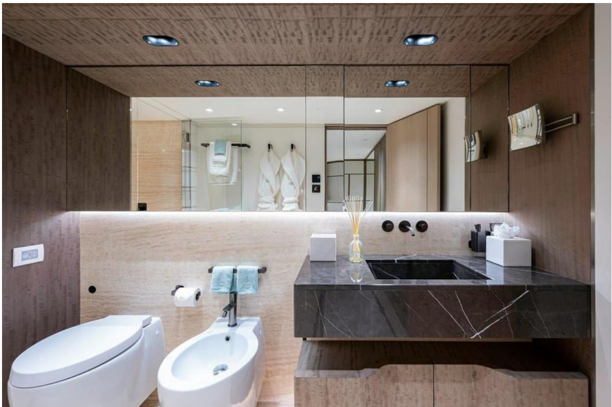
Starboard Aft Guest Head