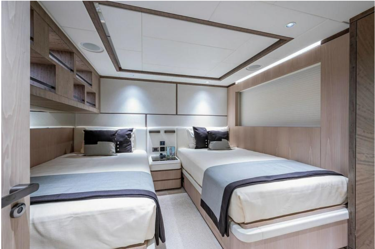
Starboard Forward Guest Stateroom