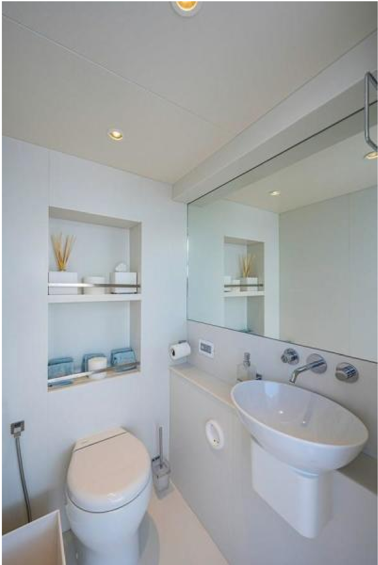
Sun Deck Head