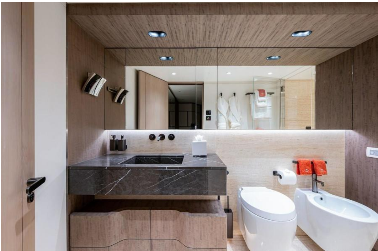
Port Aft Guest Head