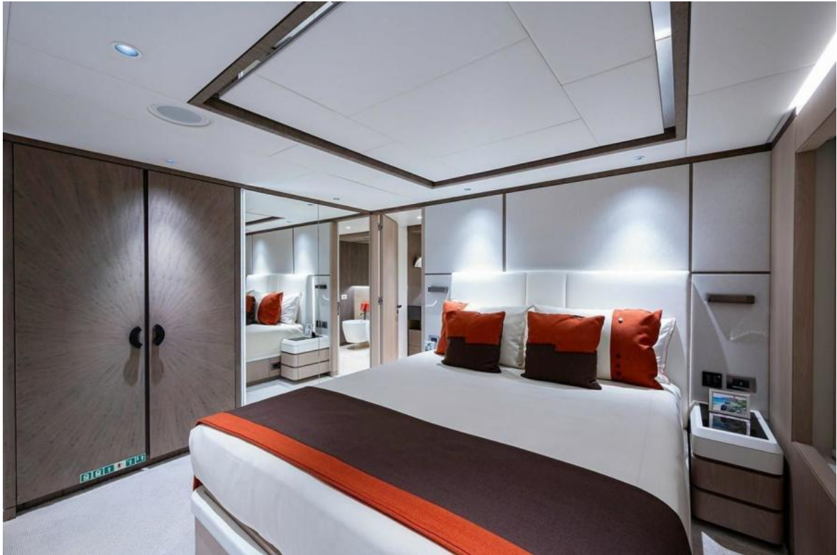
Port Aft Guest Stateroom