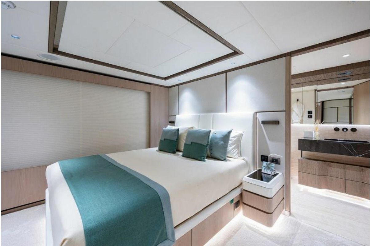
Starboard Aft Guest Stateroom