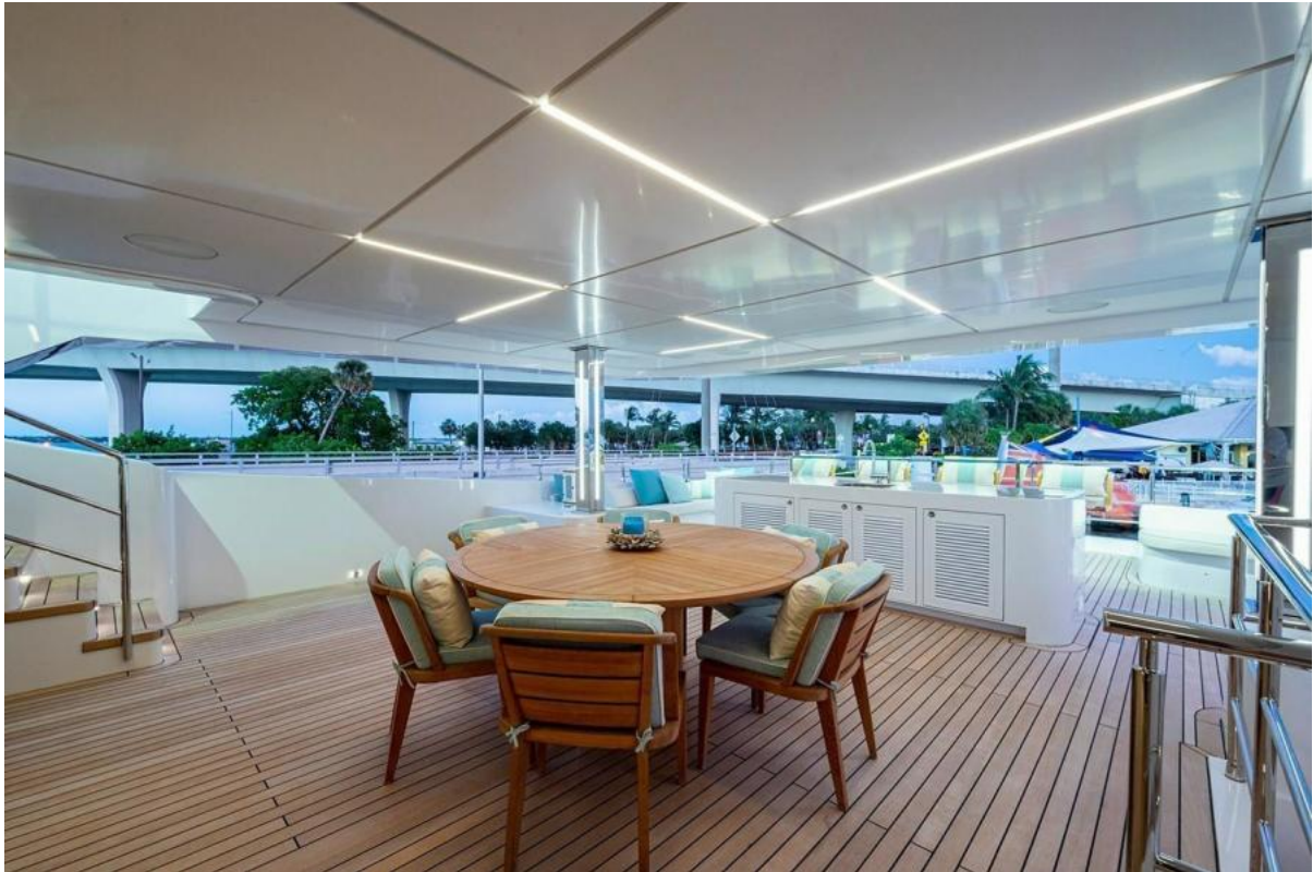
Skylounge Aft Deck