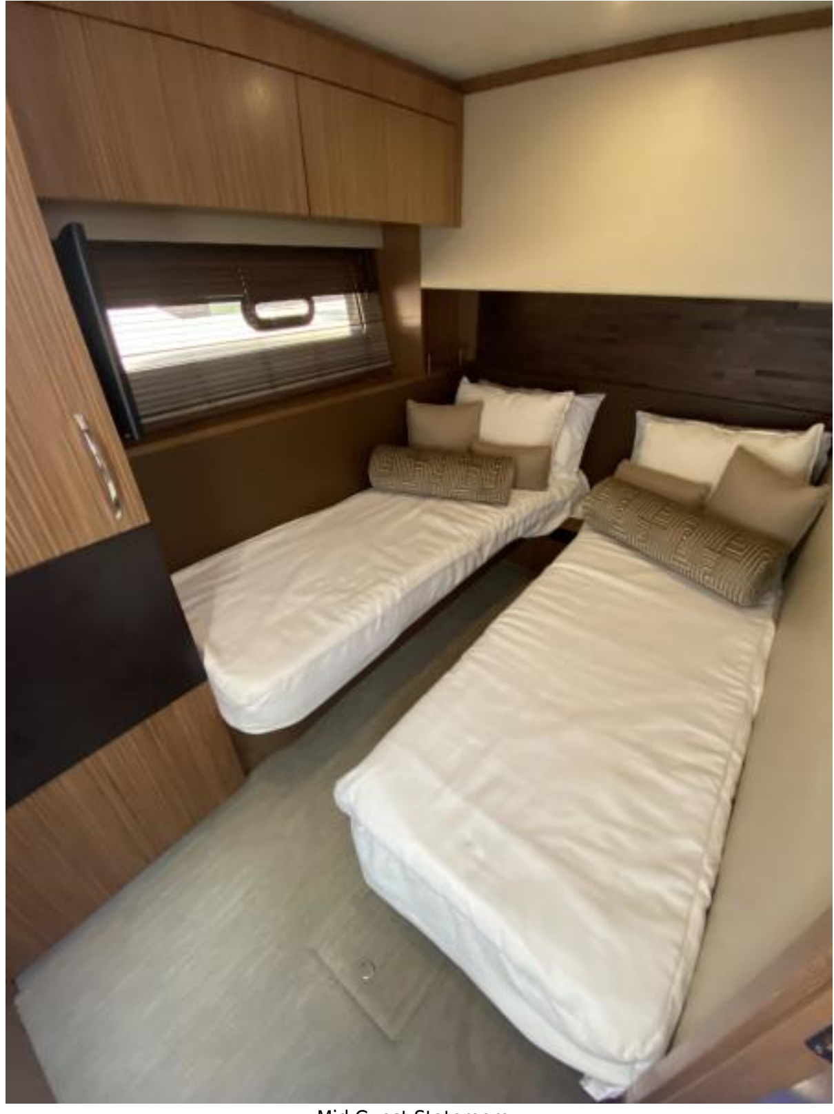
Mid Guest Stateroom