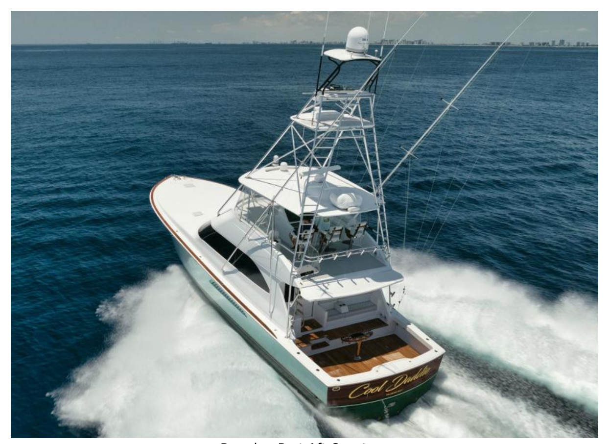
Running Port Aft Quarter