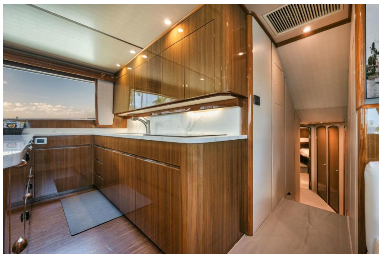
Galley And Companionway