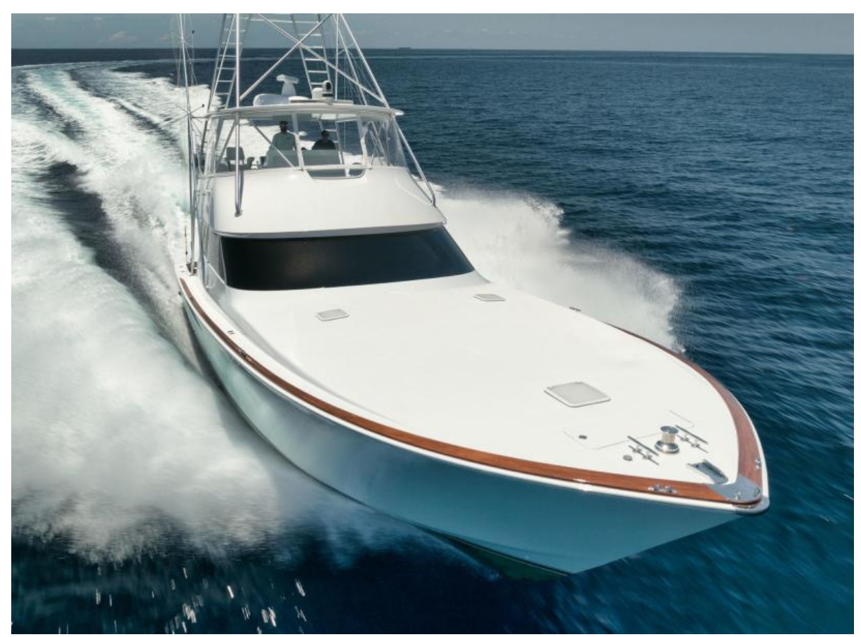
On The Go