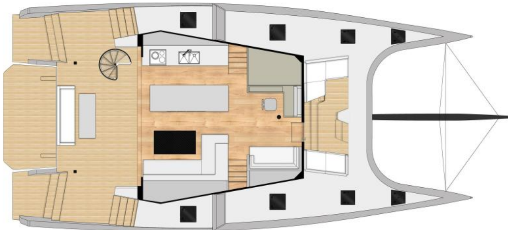
3 CABIN LAYOUT