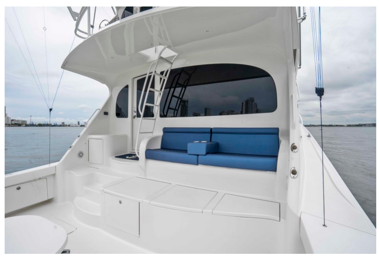
2011 Viking 70 Enclosed Bridge - Last Call - Cockpit