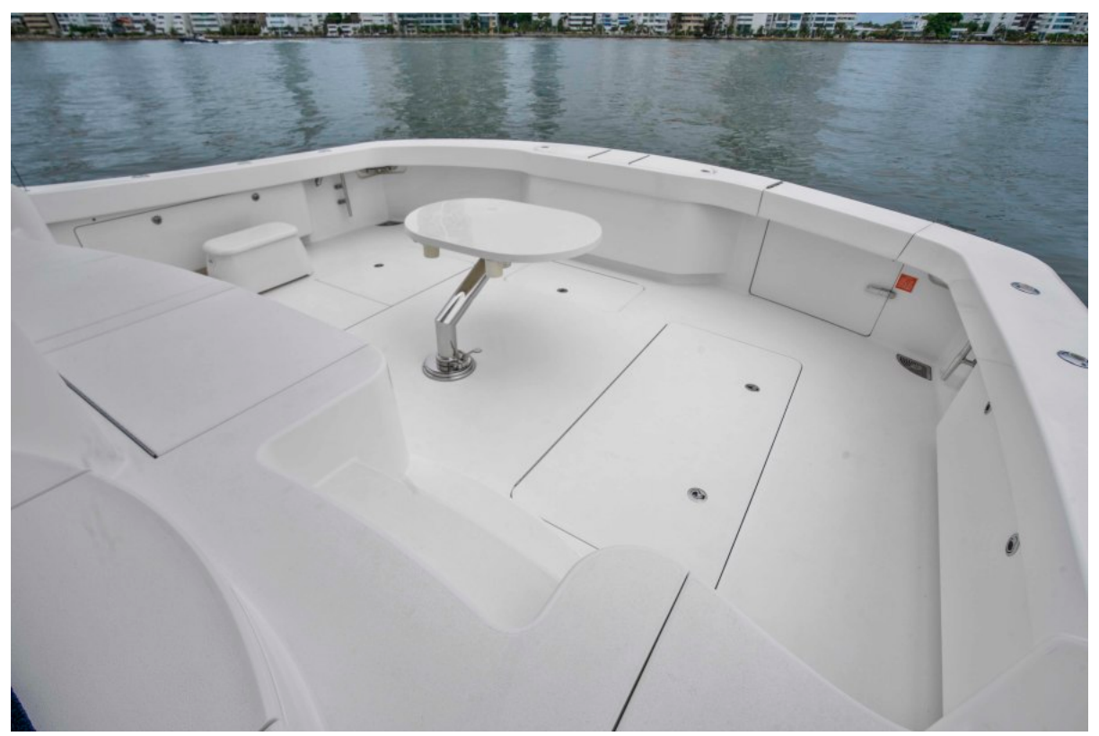
2011 Viking 70 Enclosed Bridge - Last Call - Cockpit