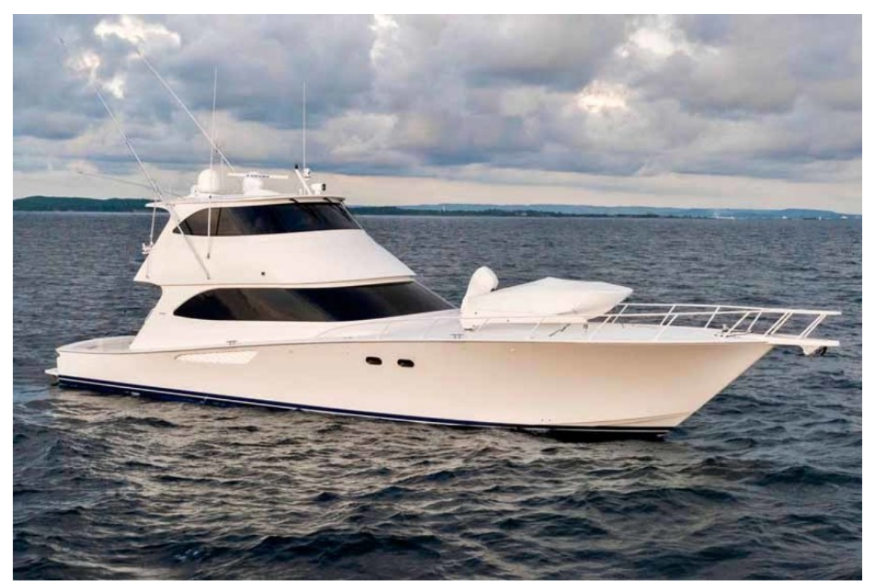
2011 Viking 70 Enclosed Bridge - Last Call