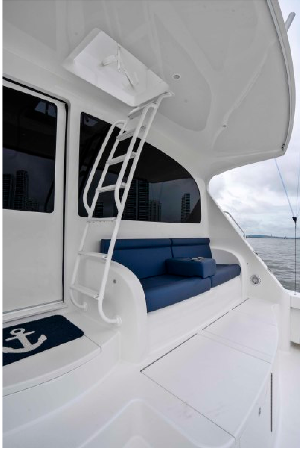
2011 Viking 70 Enclosed Bridge - Last Call - Cockpit to Bridge