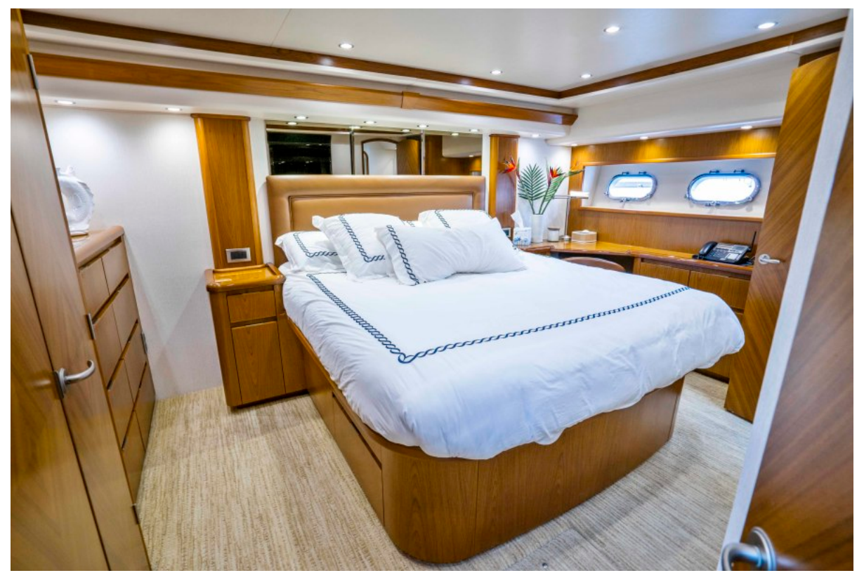
2011 Viking 70 Enclosed Bridge - Last Call - Master Stateroom