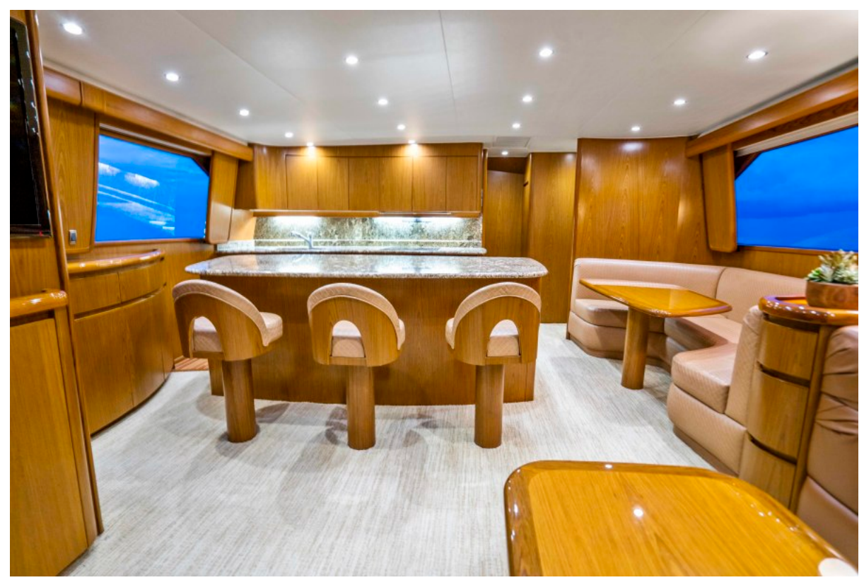
2011 Viking 70 Enclosed Bridge - Last Call - Salon