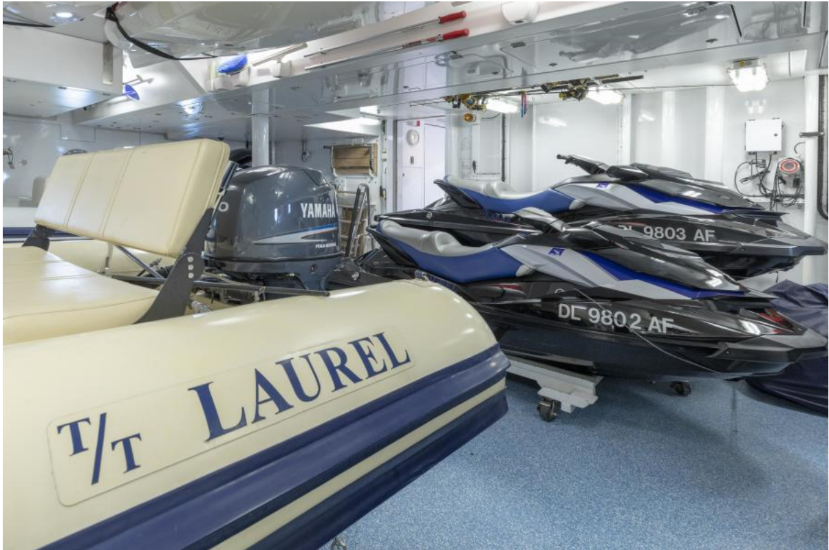
LAUREL 240'73.15m Delta 2006/2014