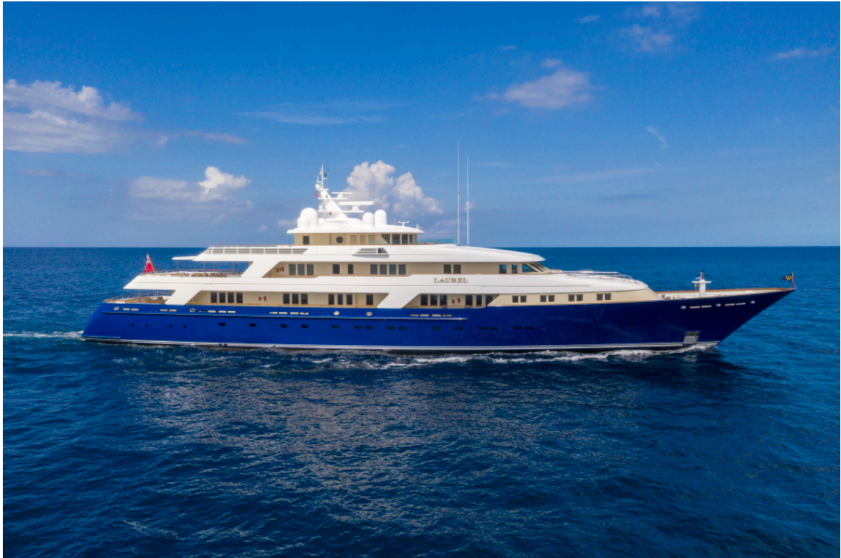
LAUREL 240'73.15m Delta 2006/2014 LAUREL 240'73.15m Delta 2006/2014