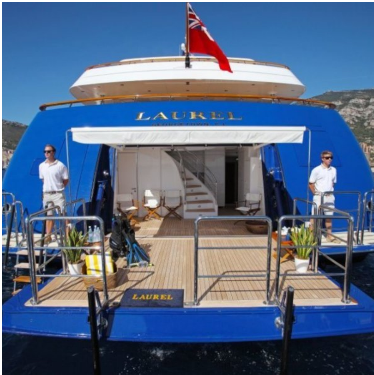
LAUREL 240'/73.15m Delta 2006/2014 Beach Club