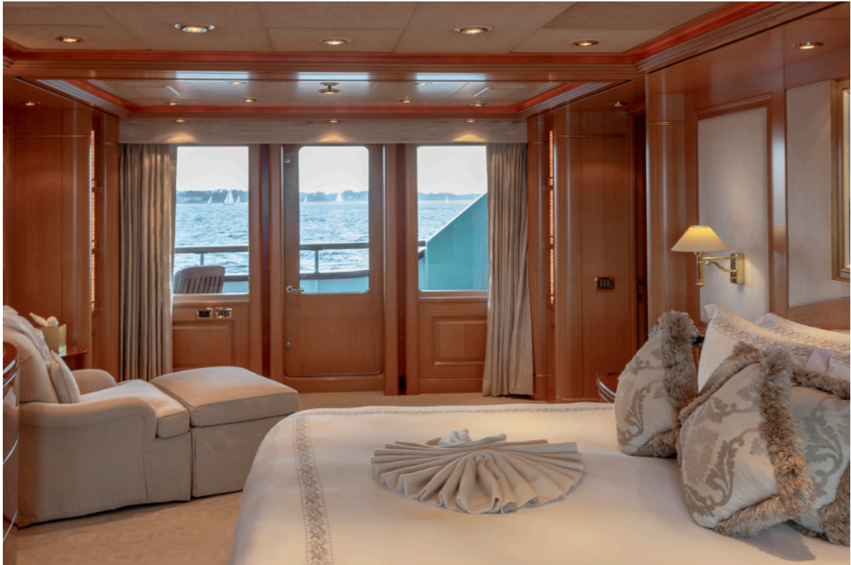
LAUREL 240'/73.15m Delta 2006/2014 Private Master Balcony