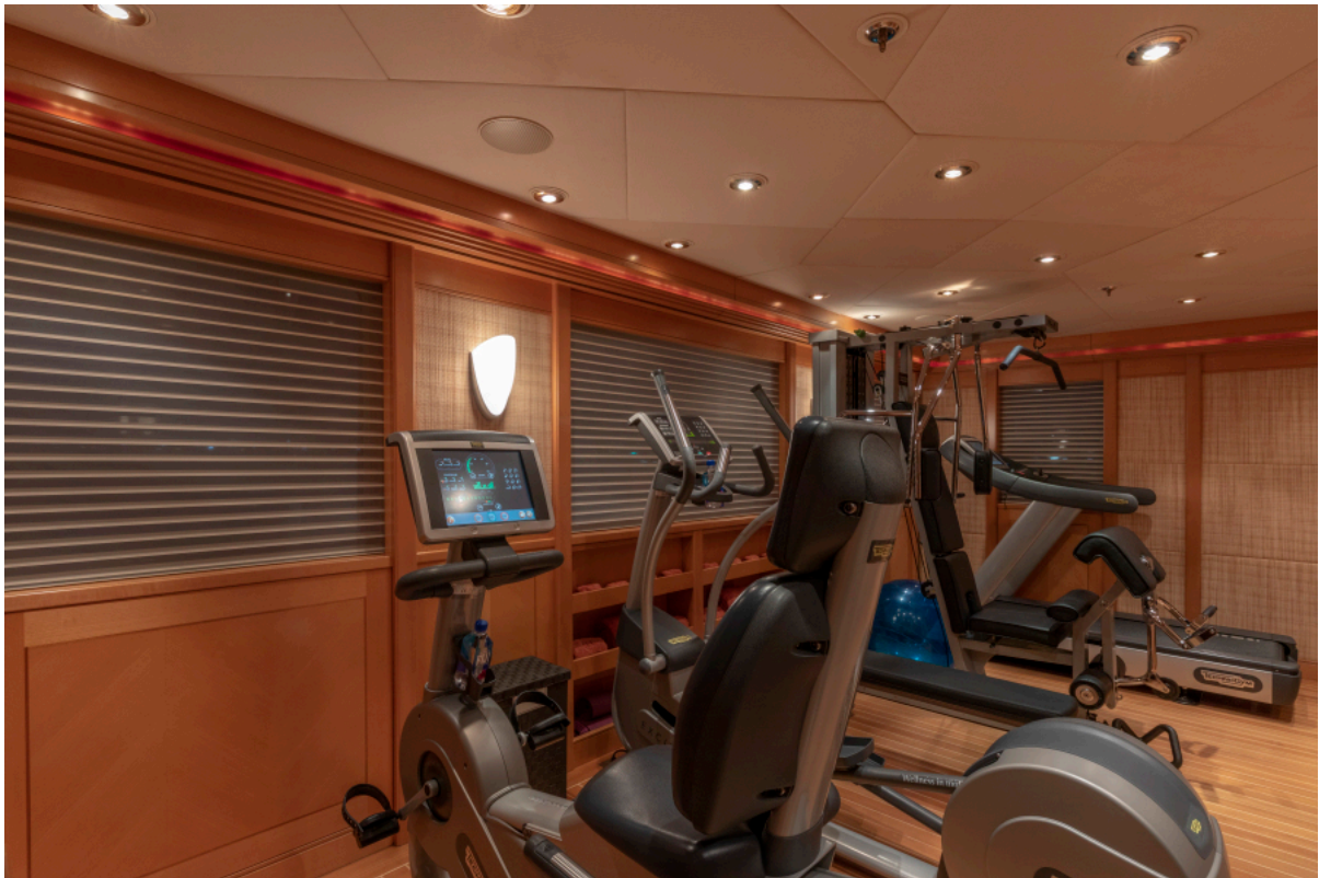
LAUREL 240'/73.15m Delta 2006/2014 Private Gym