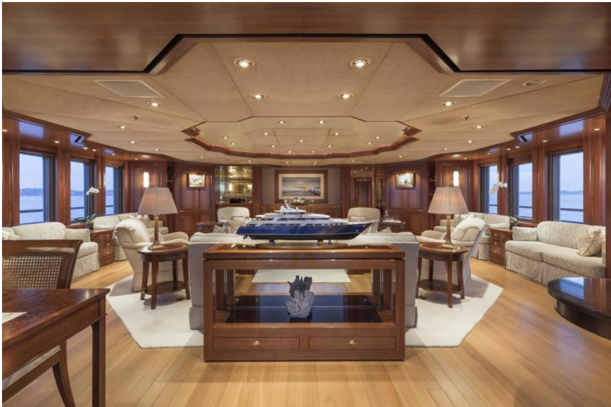
LAUREL 240'/73.15m Delta 2006/2014 Main Salon