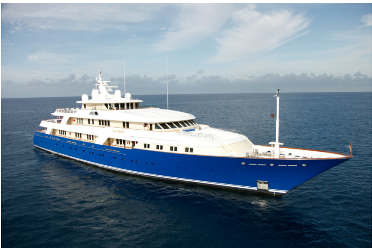
LAUREL 240'73.15m Delta 2006/2014 LAUREL 240'73.15m Delta 2006/2014