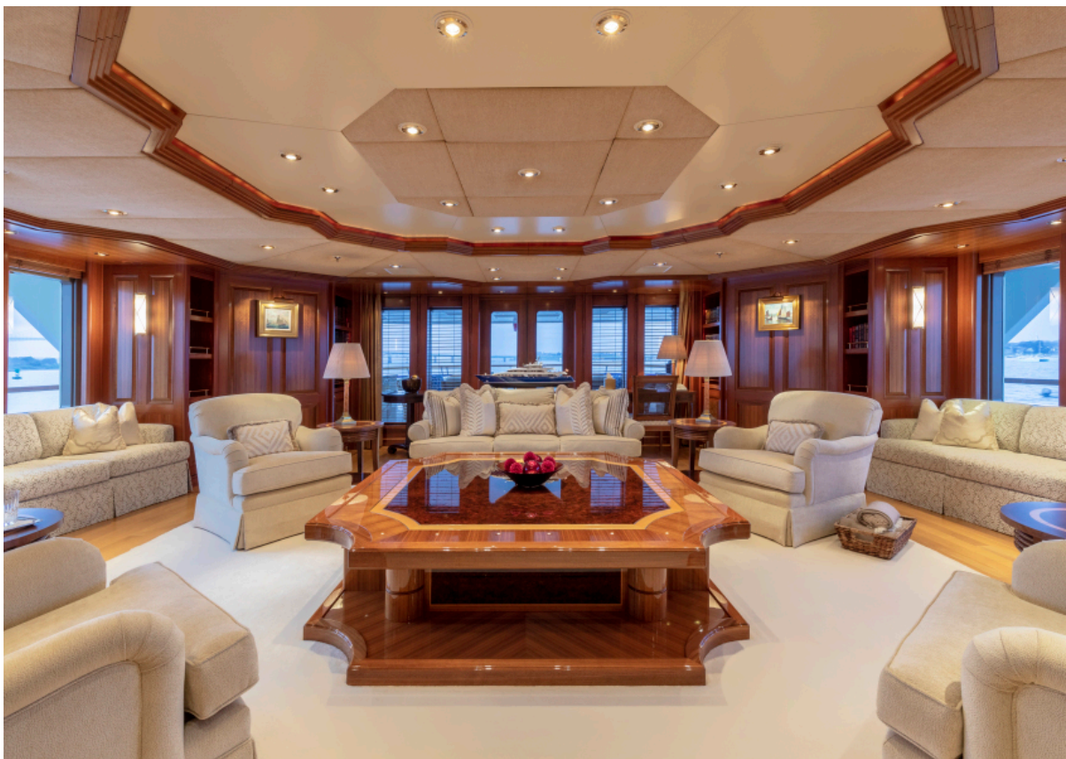
LAUREL 240'/73.15m Delta 2006/2014 Main Salon