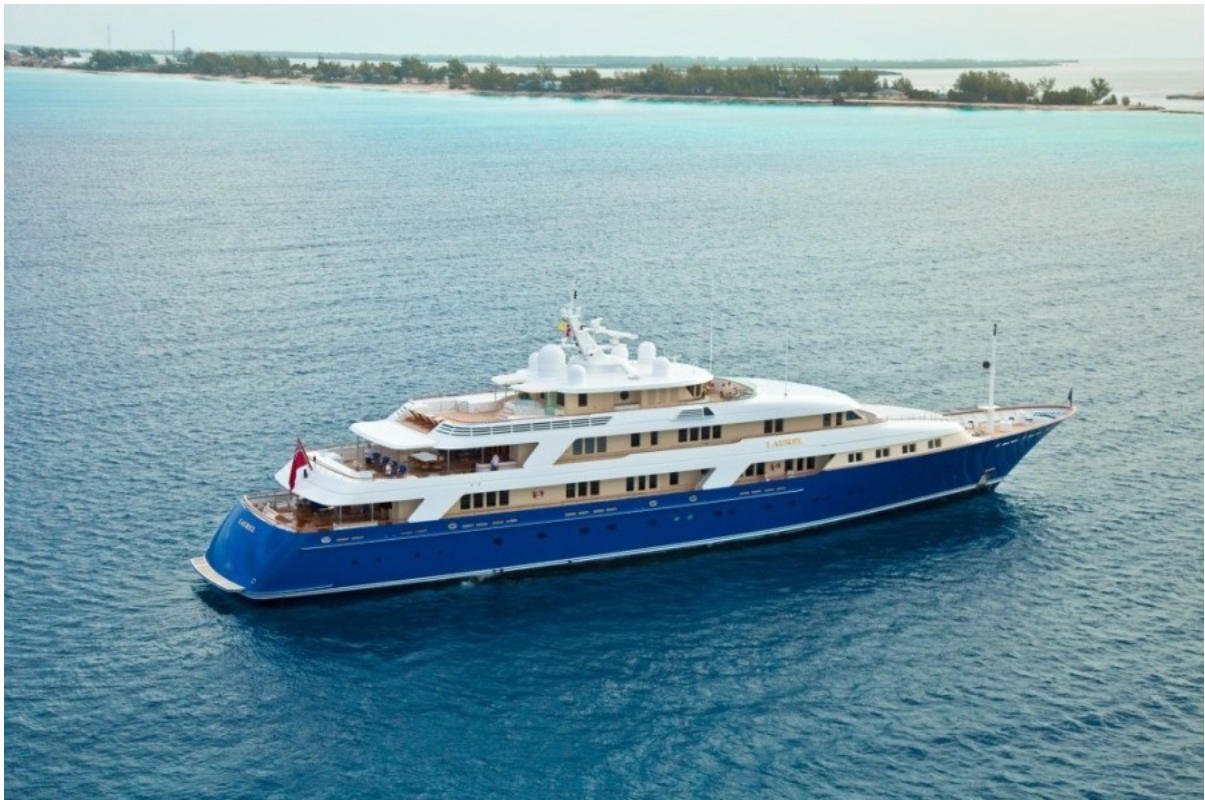
LAUREL 240'73.15m Delta 2006/2014 LAUREL 240'73.15m Delta 2006/2014