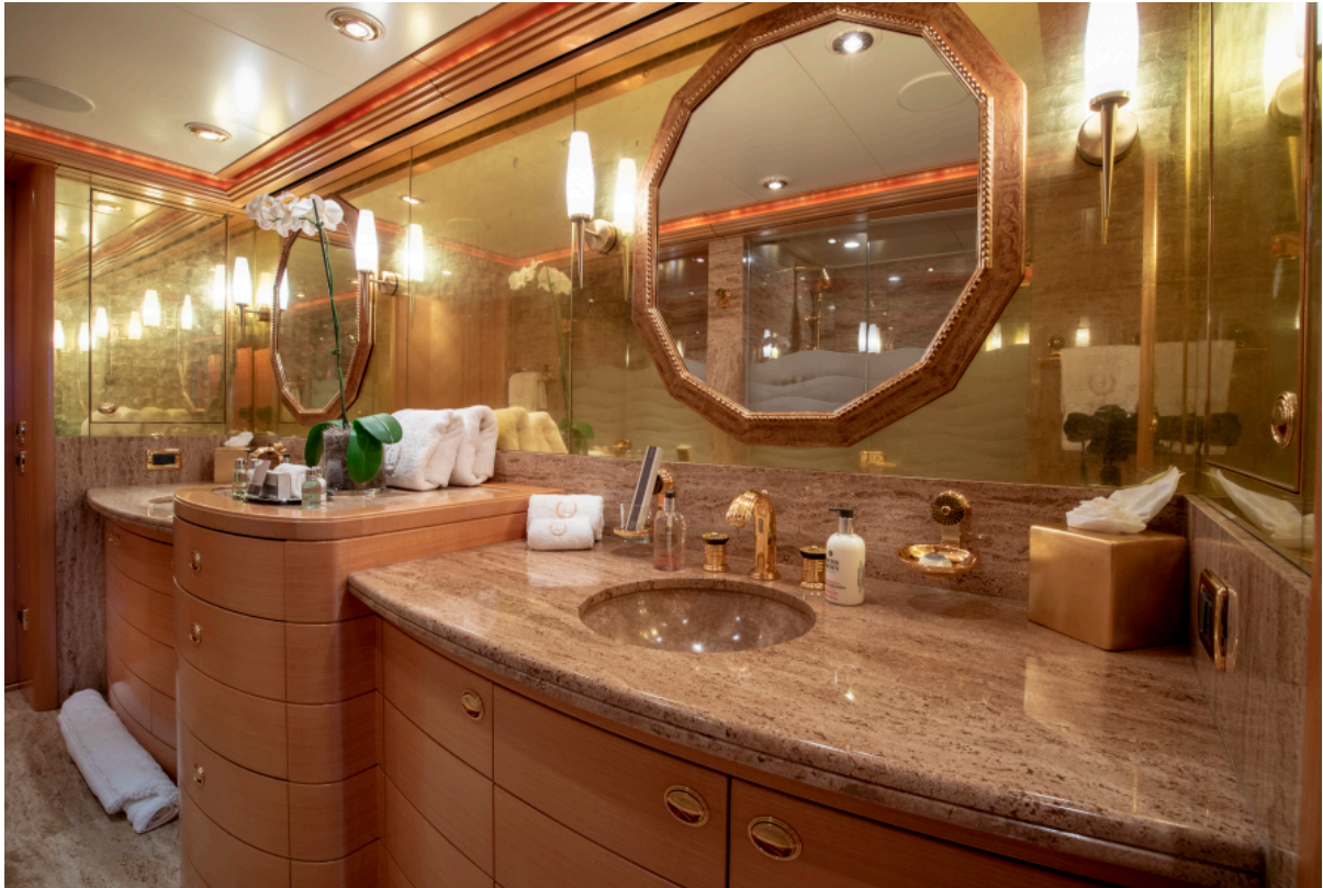
LAUREL 240'/73.15m Delta 2006/2014 Master Ensuite