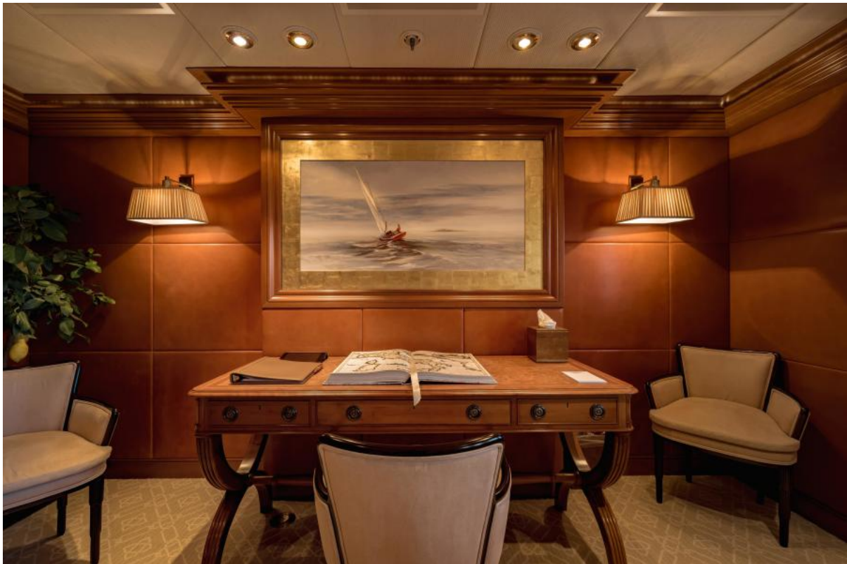
LAUREL 240'/73.15m Delta 2006/2014 Library