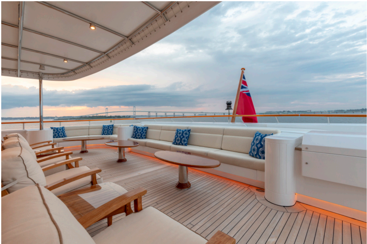
LAUREL 240'/73.15m Delta 2006/2014 Bridge Aft Seating