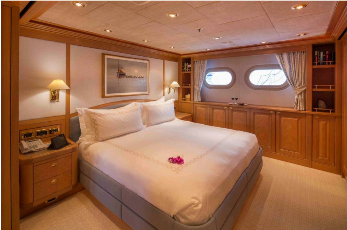
LAUREL 240'/73.15m Delta 2006/2014 Guest Stateroom