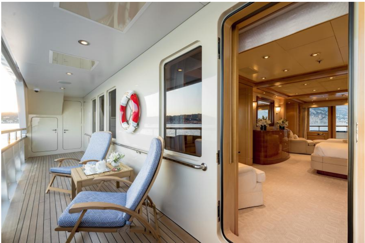
LAUREL 240'/73.15m Delta 2006/2014 View from Balcony looking into the Master