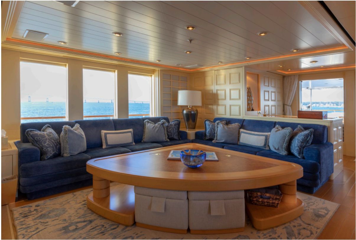
LAUREL 240'/73.15m Delta 2006/2014 Sky Lounge