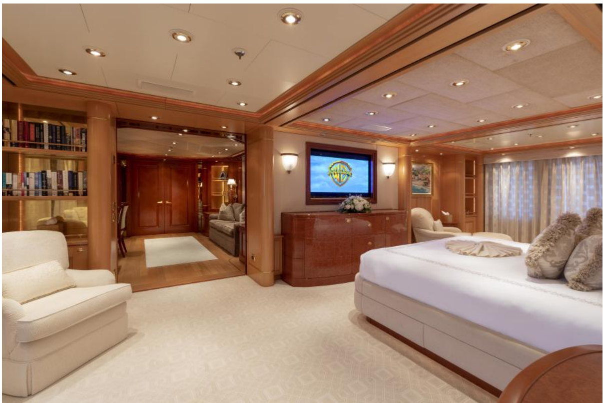
LAUREL 240'/73.15m Delta 2006/2014 Master Stateroom