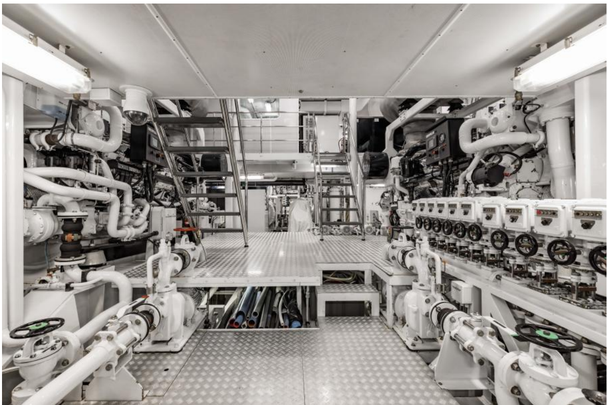
LAUREL 240'73.15m Delta 2006/2014 Engine Room