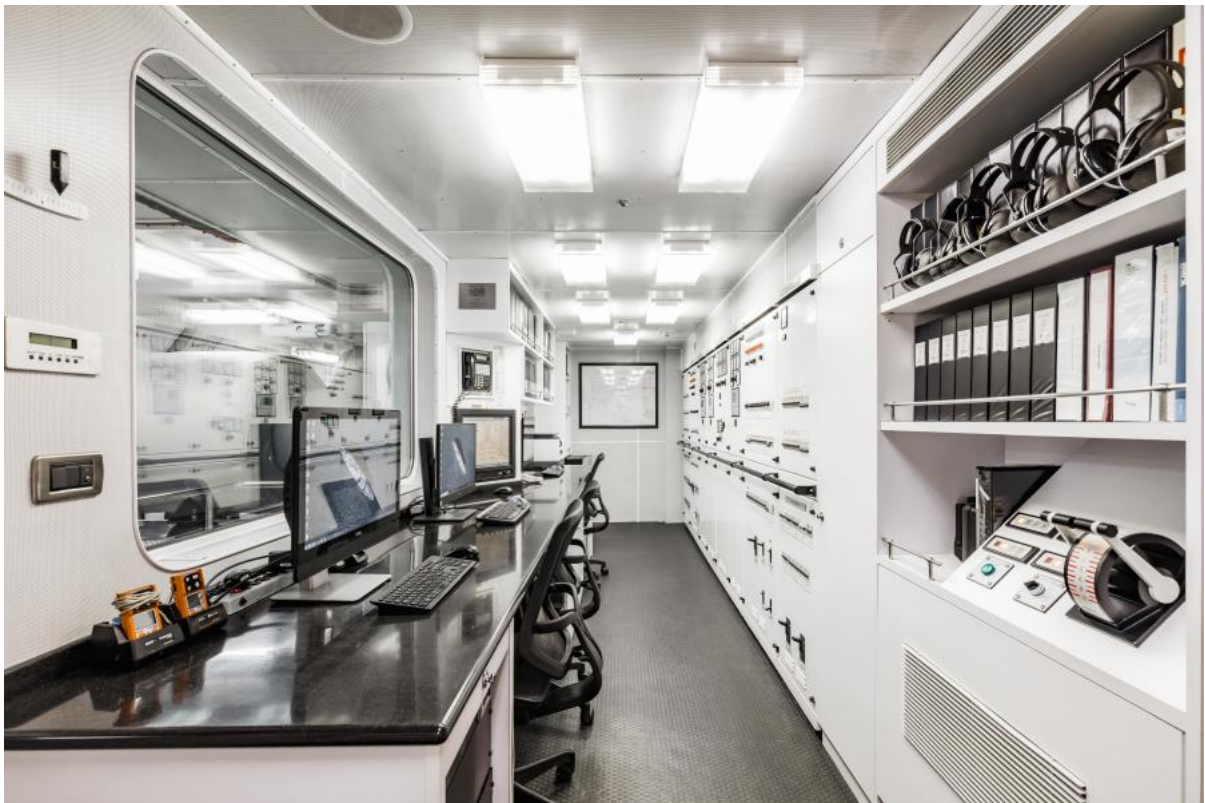
LAUREL 240' / 73.15m Delta 2006/2014 Engineer Office