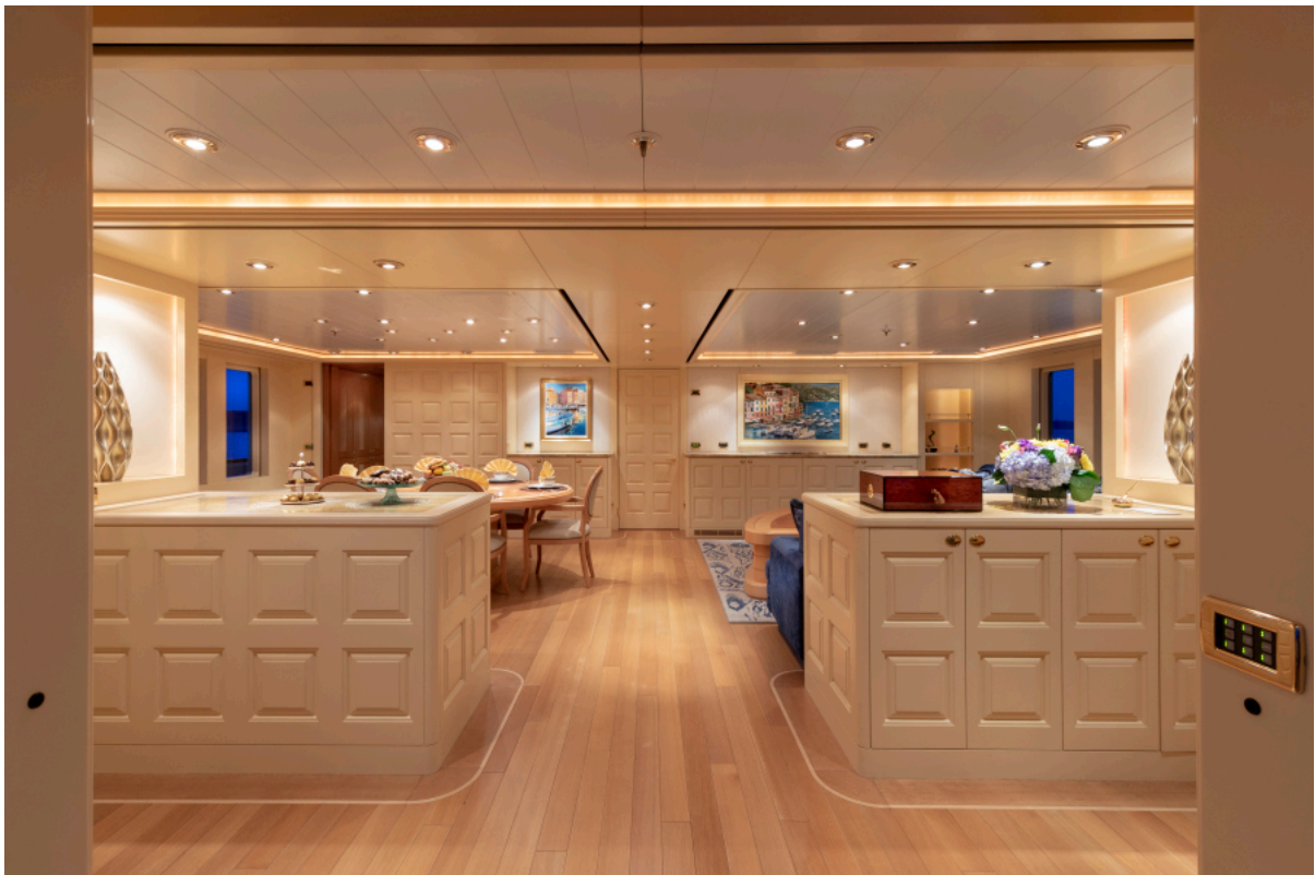
LAUREL 240'/73.15m Delta 2006/2014 Sky Lounge