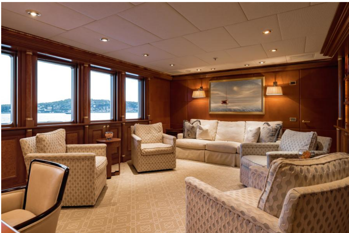
LAUREL 240'/73.15m Delta 2006/2014 Library