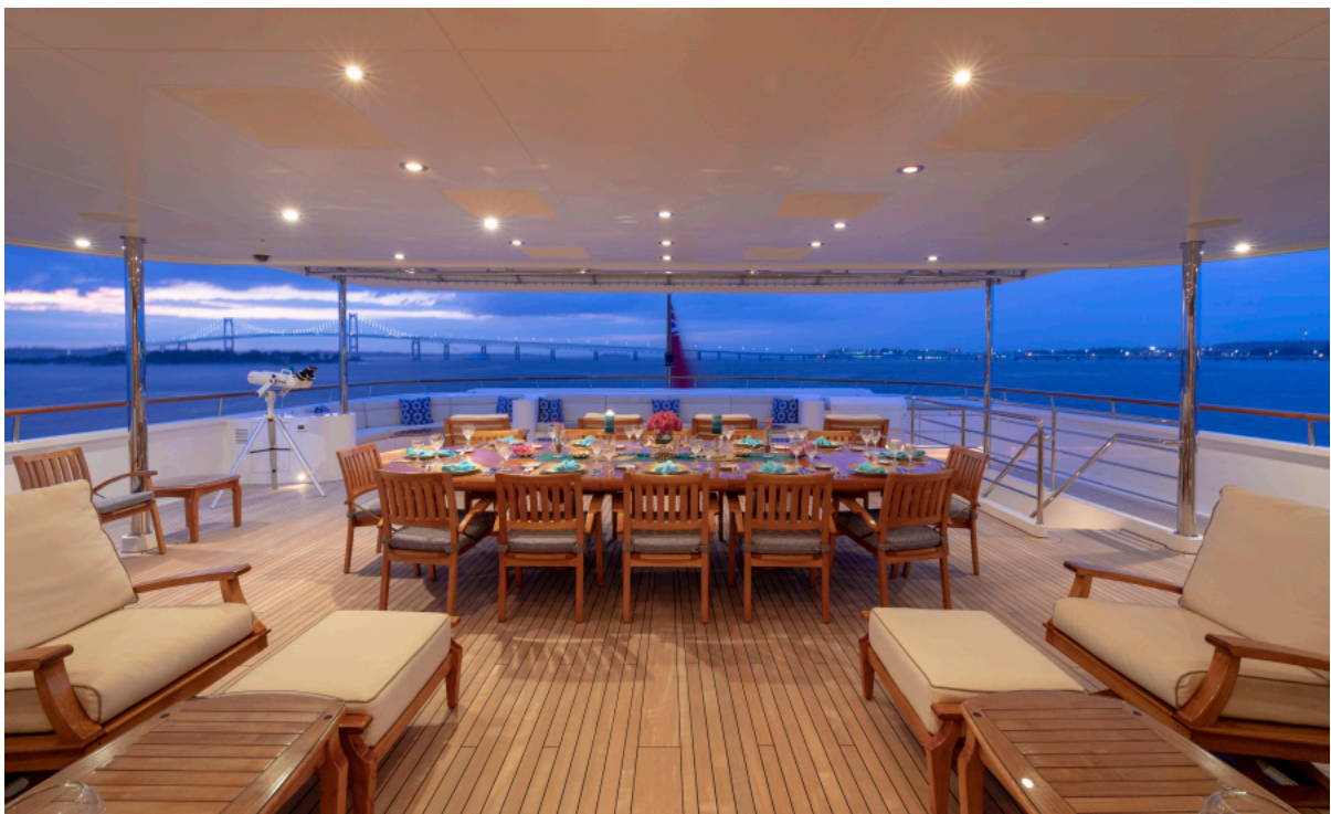
LAUREL 240'/73.15m Delta 2006/2014 Bridge Aft Dining