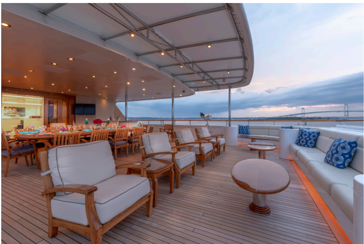
LAUREL 240'/73.15m Delta 2006/2014 Bridge Aft Seating