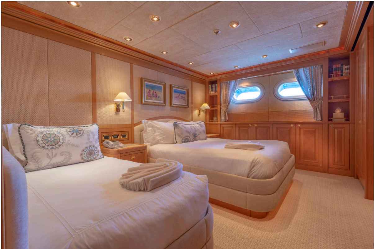
LAUREL 240'/73.15m Delta 2006/2014 Twin Stateroom