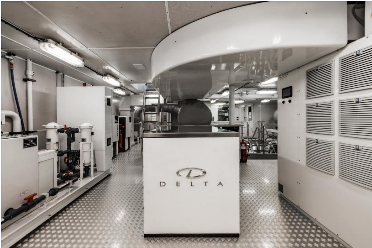
LAUREL 240'/73.15m Delta 2006/2014 Engine Room