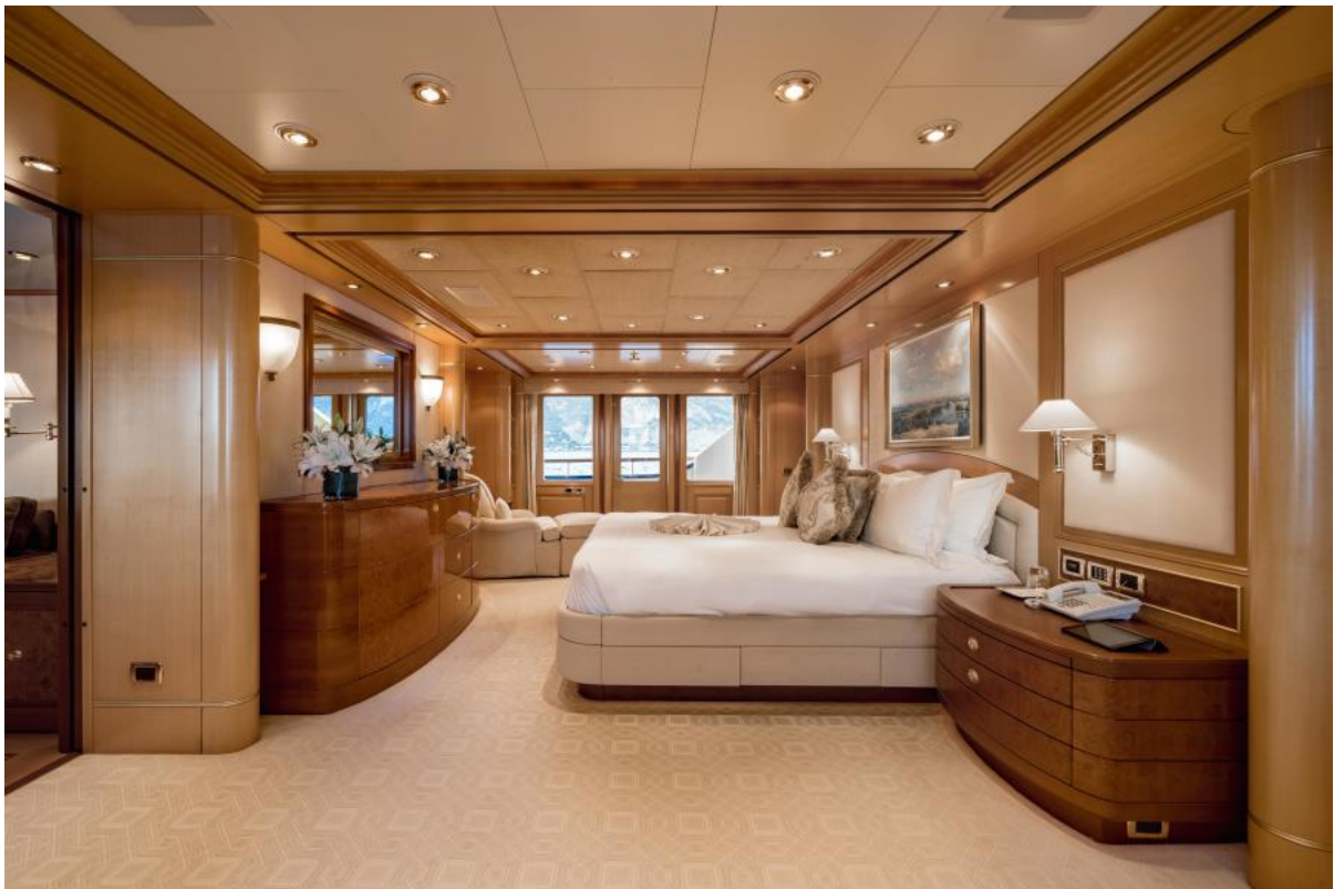
LAUREL 240'73.15m Delta 2006/2014 Master Stateroom