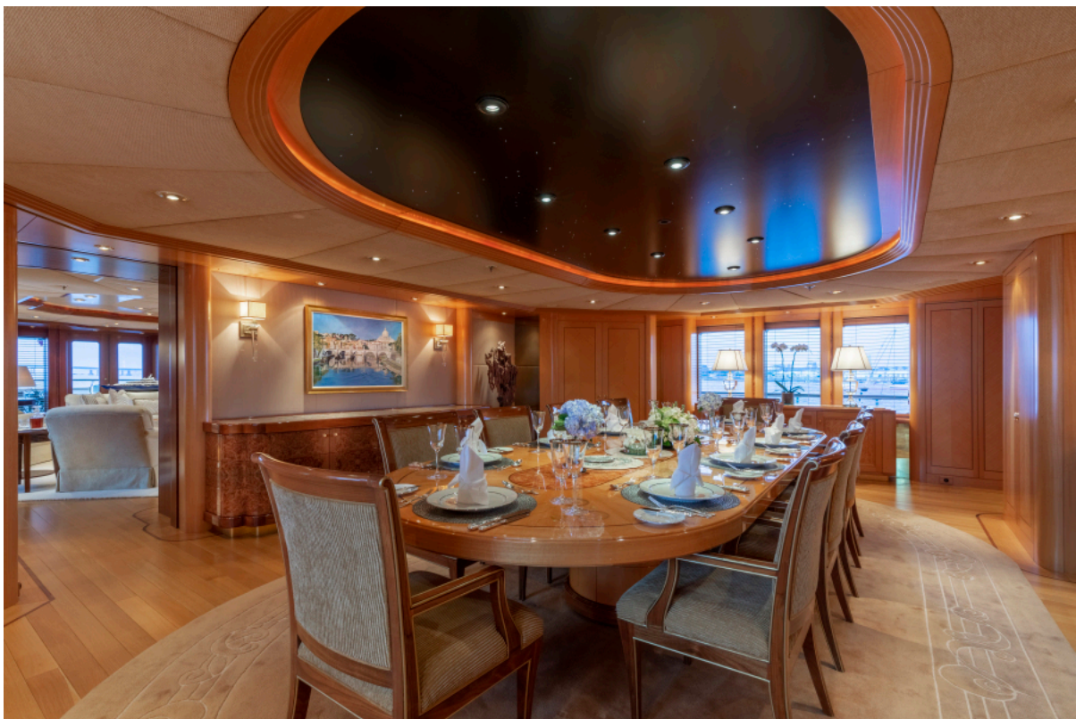
LAUREL 240'73.15m Delta 2006/2014 Main Salon Dining