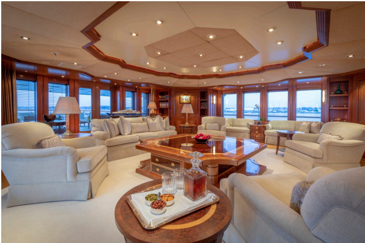
LAUREL 240'73.15m Delta 2006/2014 Main Salon