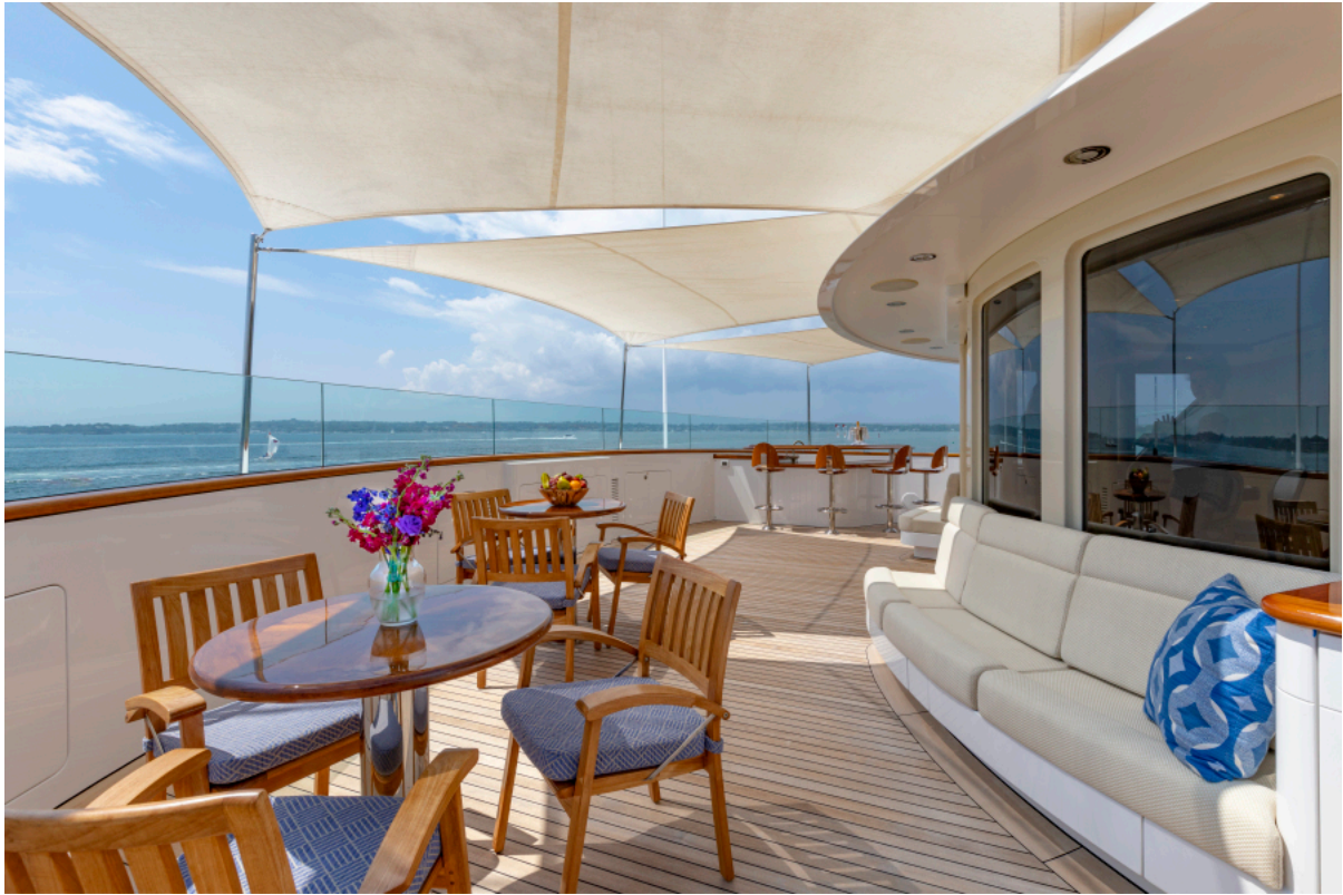
LAUREL 240'73.15m Delta 2006/2014 Sun Deck, Forward