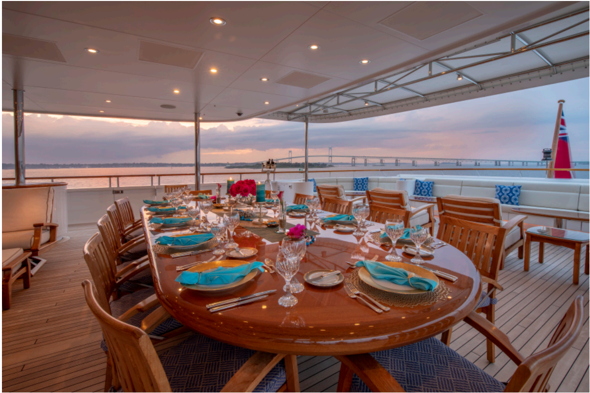
LAUREL 240'/73.15m Delta 2006/2014 Bridge Aft Dining