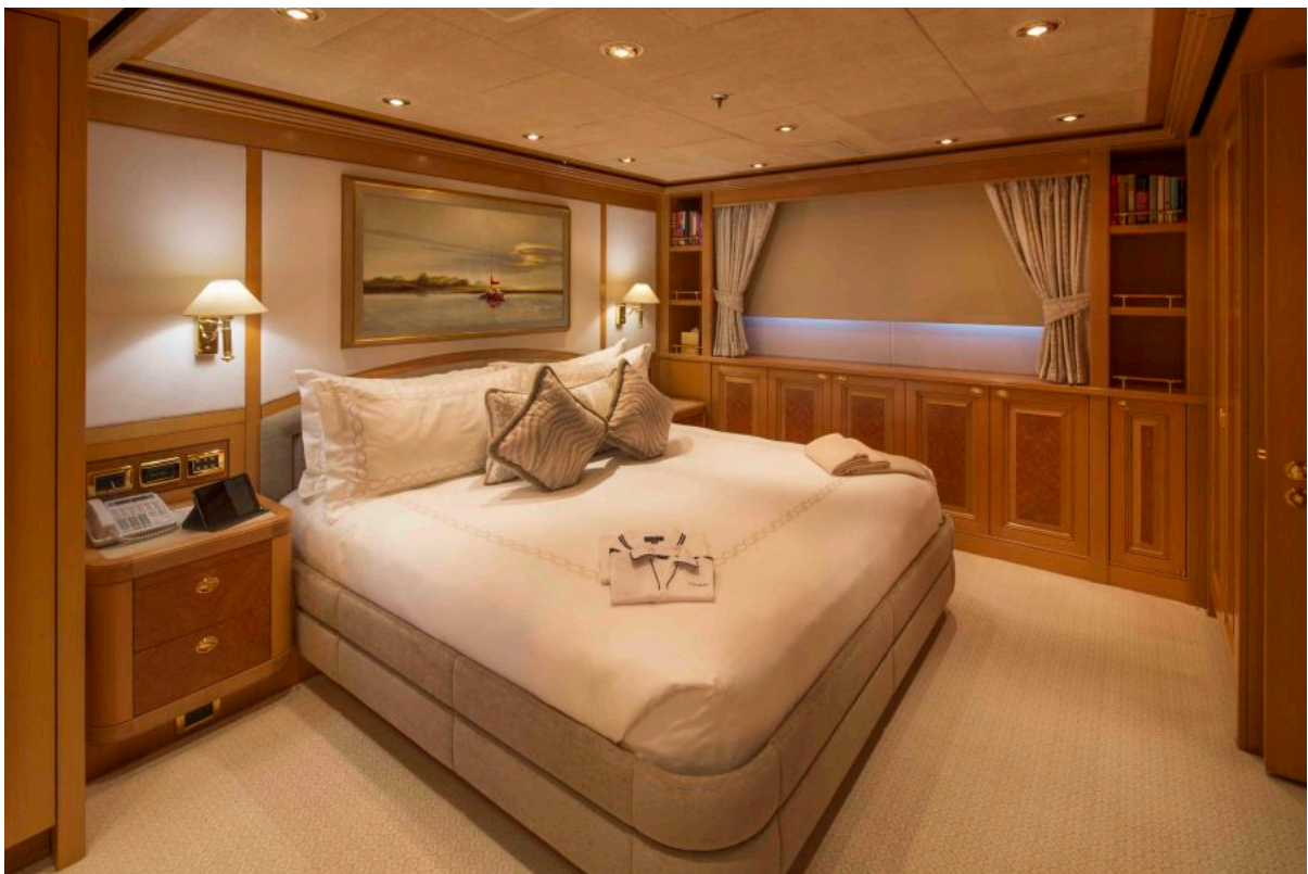
LAUREL 240'/73.15m Delta 2006/2014 Guest Stateroom