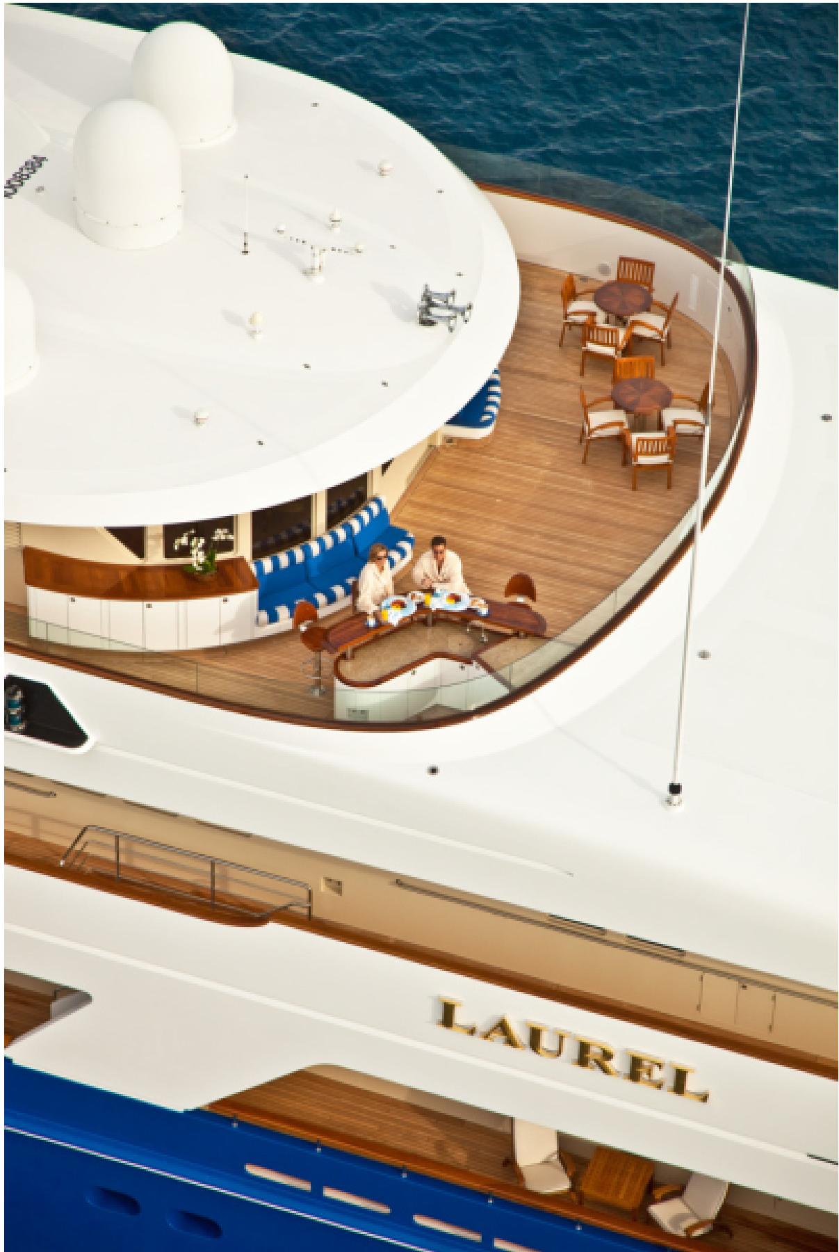
LAUREL 240'/73.15m Delta 2006/2014 Sun Deck, Forward