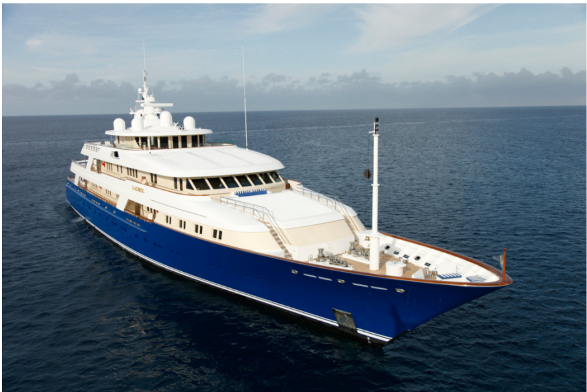
LAUREL 240'73.15m Delta 2006/2014 LAUREL 240'73.15m Delta 2006/2014