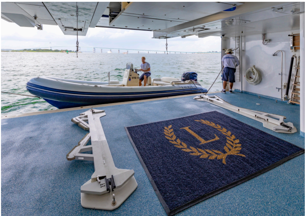
LAUREL 240'73.15m Delta 2006/2014 Tender Bay