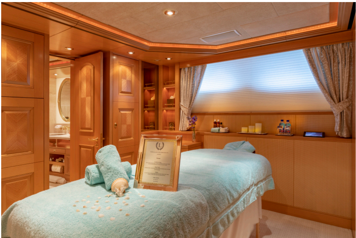
LAUREL 240'/73.15m Delta 2006/2014 7th Stateroom/Massage Room