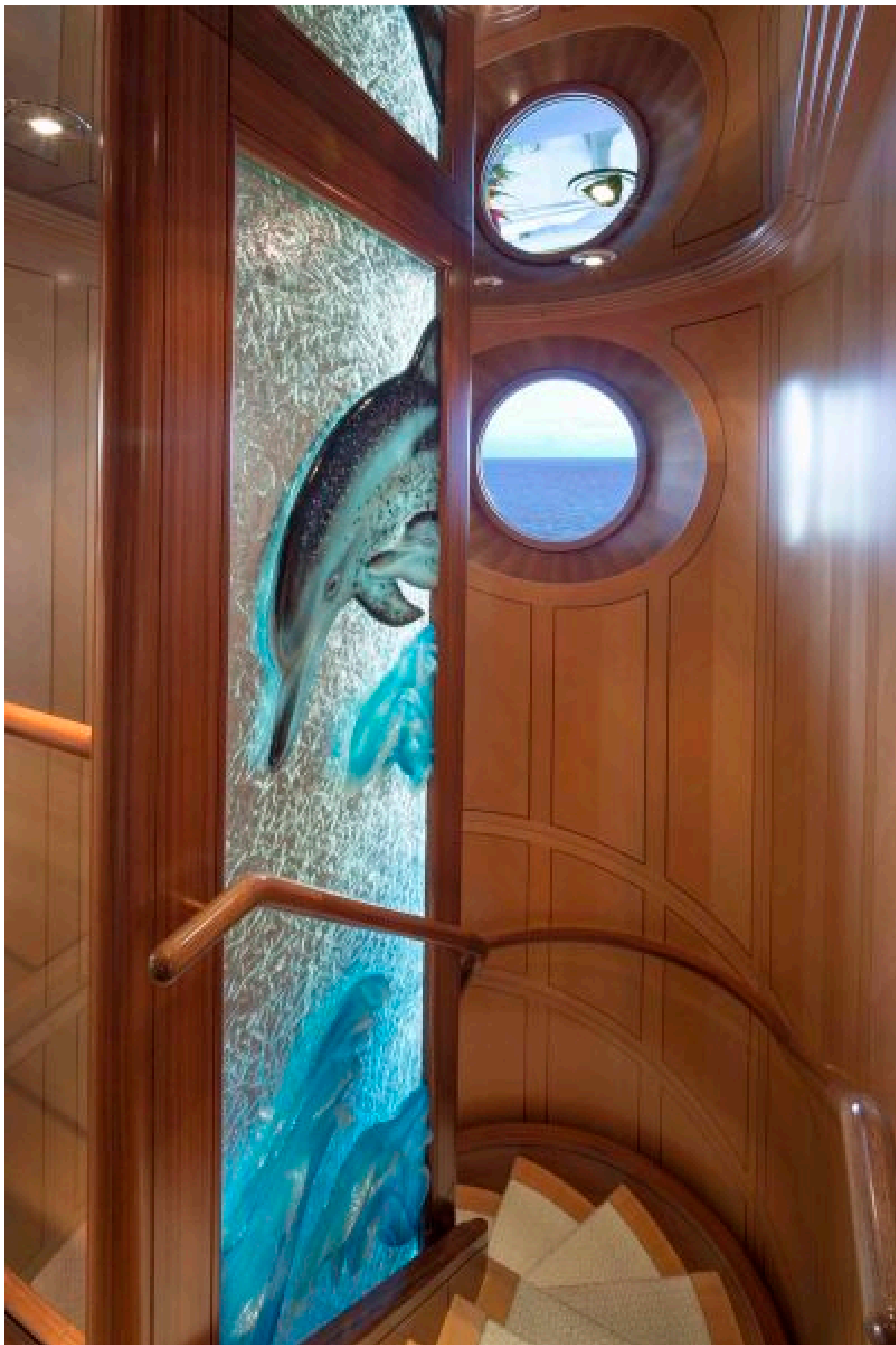
LAUREL 240'73.15m Delta 2006/2014 Main Staircase