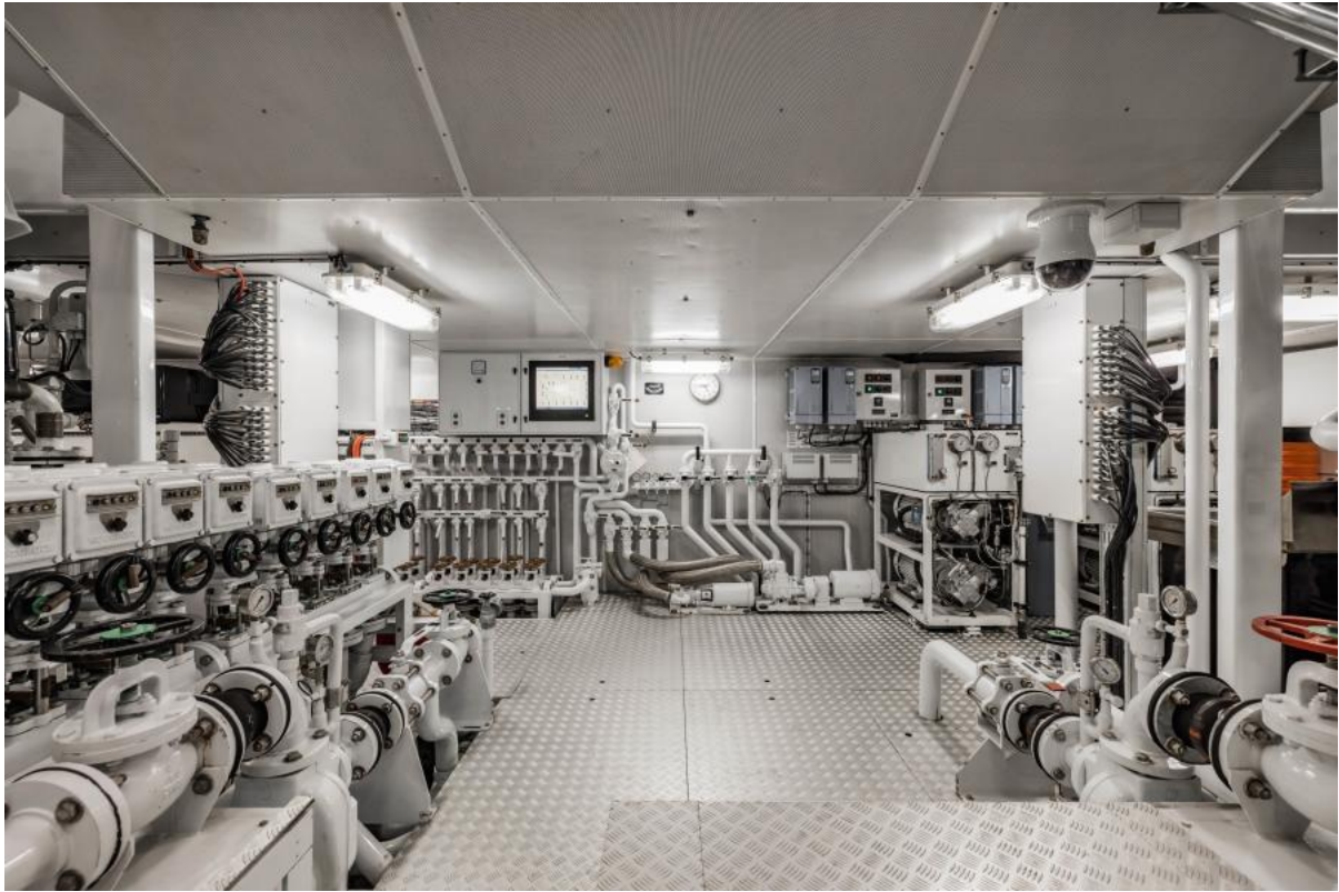
LAUREL 240' / 73.15m Delta 2006/2014 Engine Room