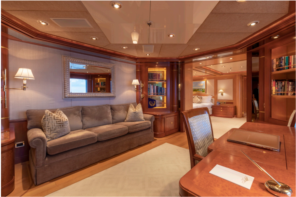
LAUREL 240'/73.15m Delta 2006/2014 Private Master Office