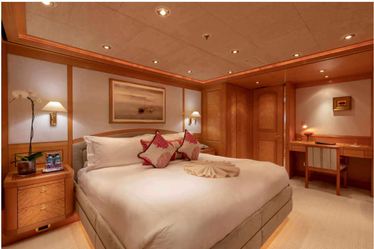
LAUREL 240'/73.15m Delta 2006/2014 VIP Stateroom