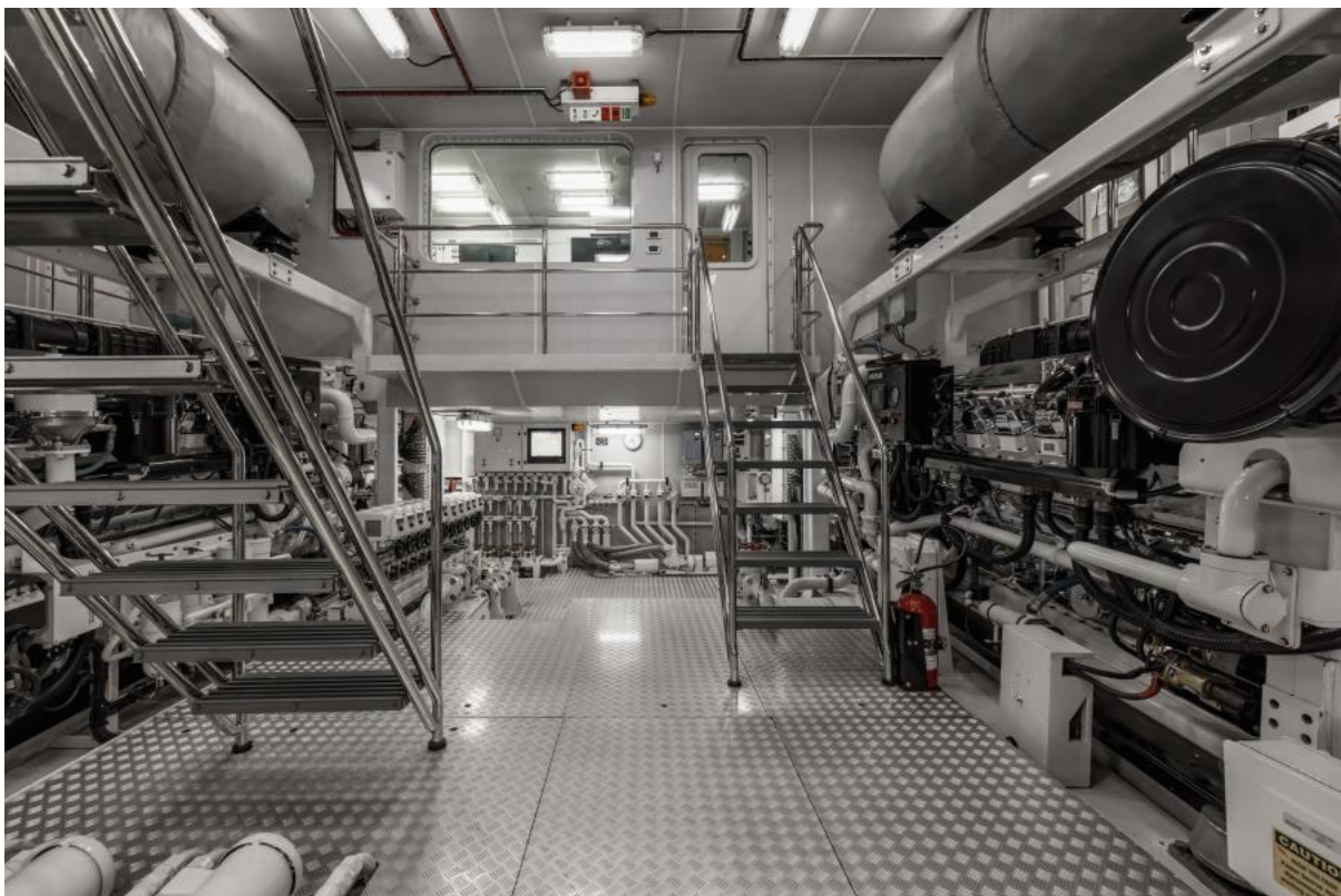
LAUREL 240'73.15m Delta 2006/2014 Engine Room