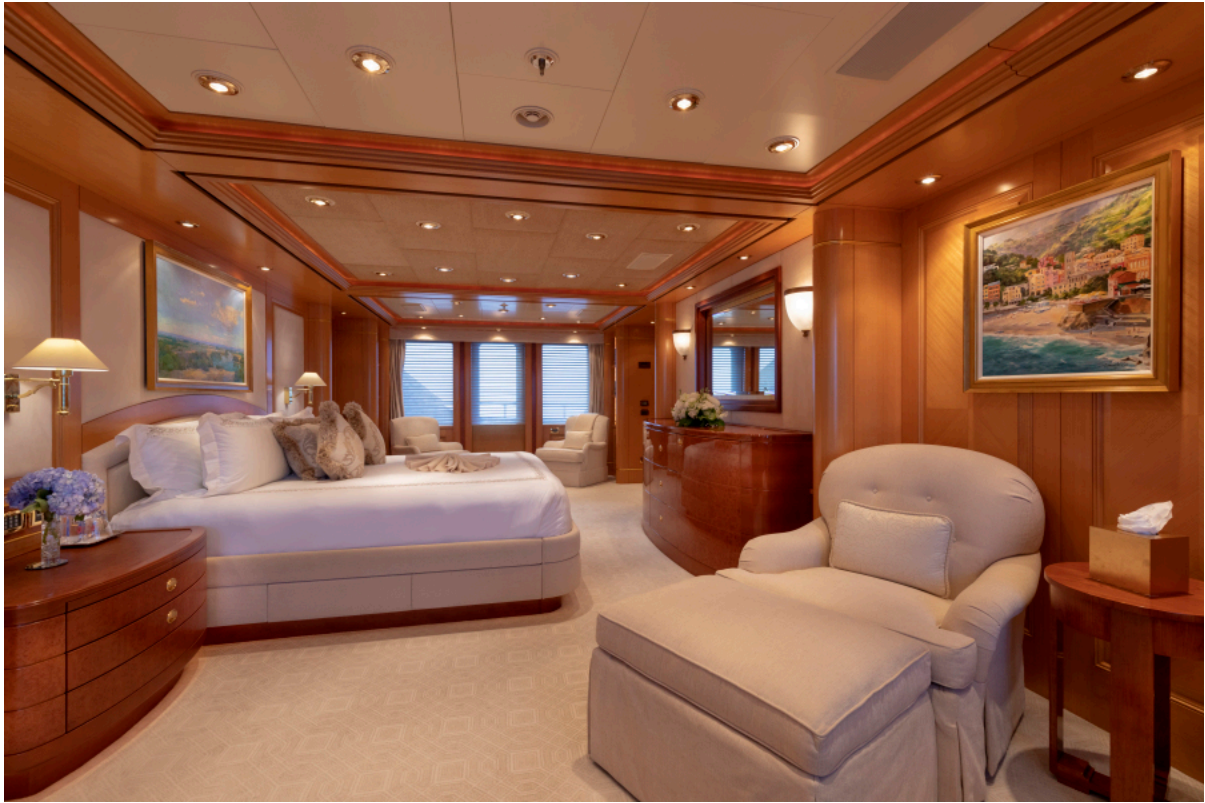
LAUREL 240'73.15m Delta 2006/2014 Master Stateroom