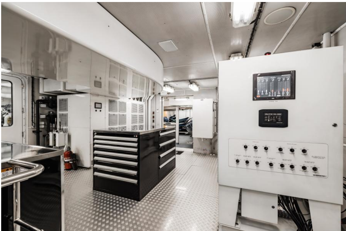
LAUREL 240'/73.15m Delta 2006/2014 Engine Room