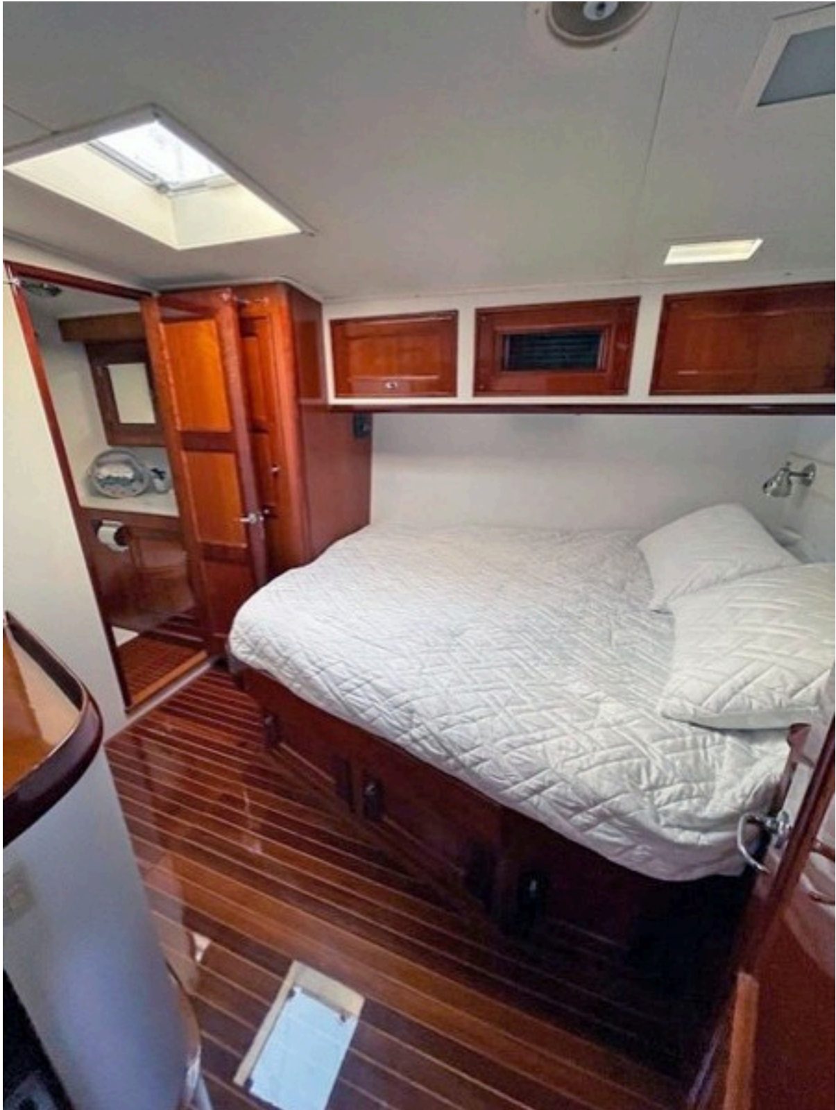
Stbd. Guest Cabin