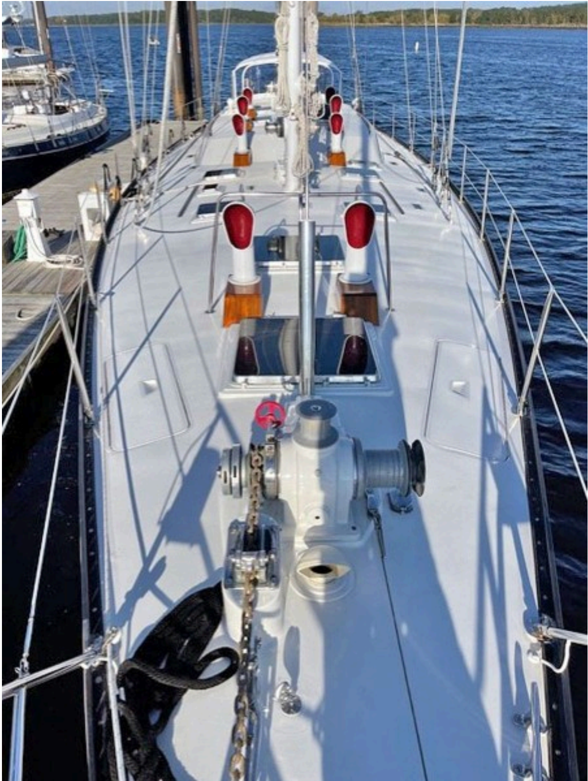
Foredeck, Looking Aft