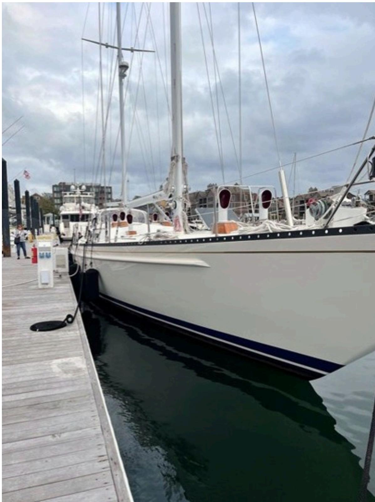
Stbd. Hull, Fwd.