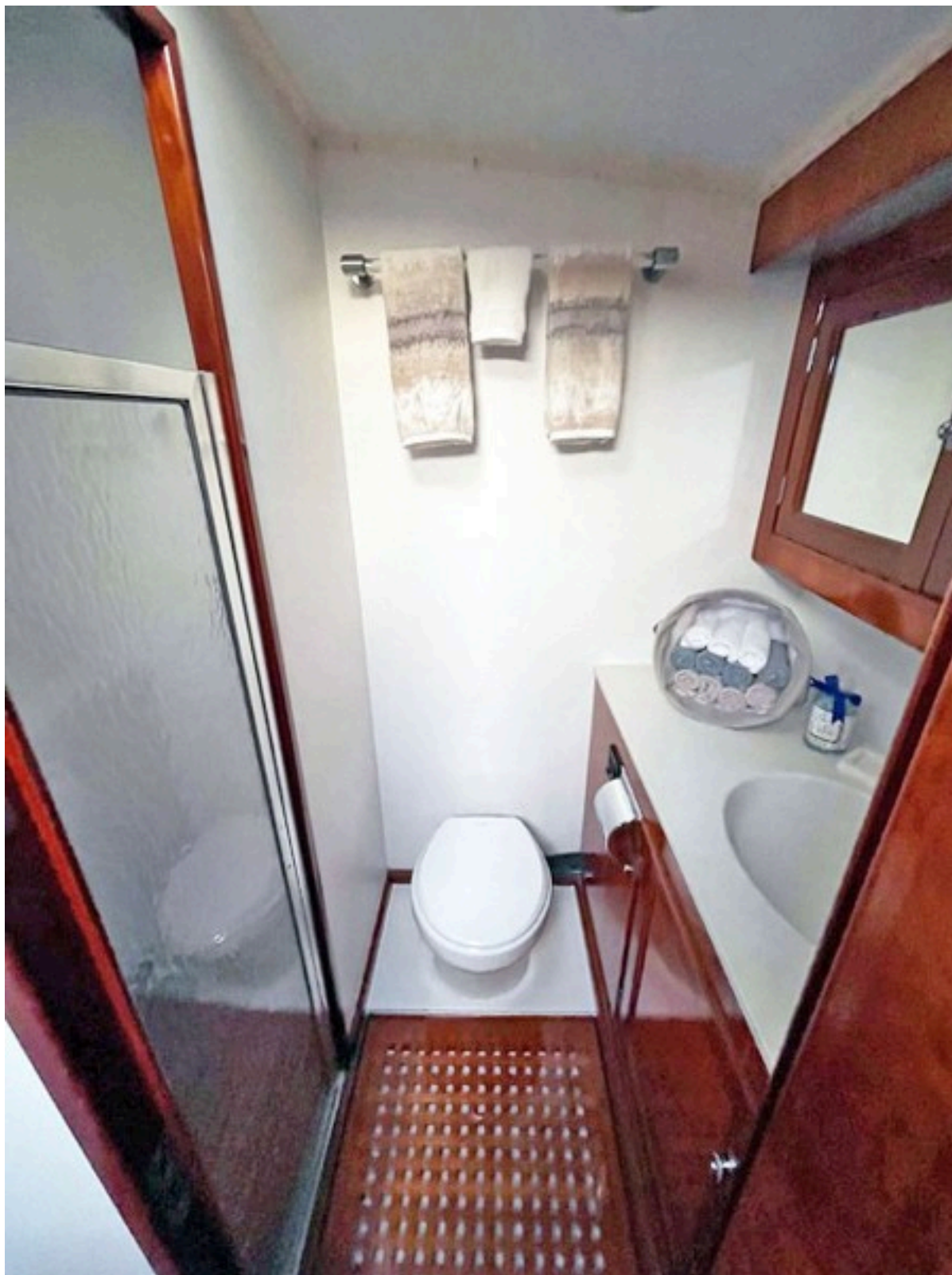
Stbd. Guest Head