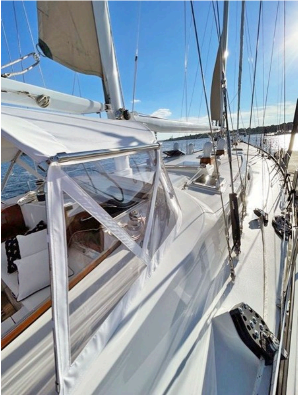
Stbd. Deck, Looking Fwd.