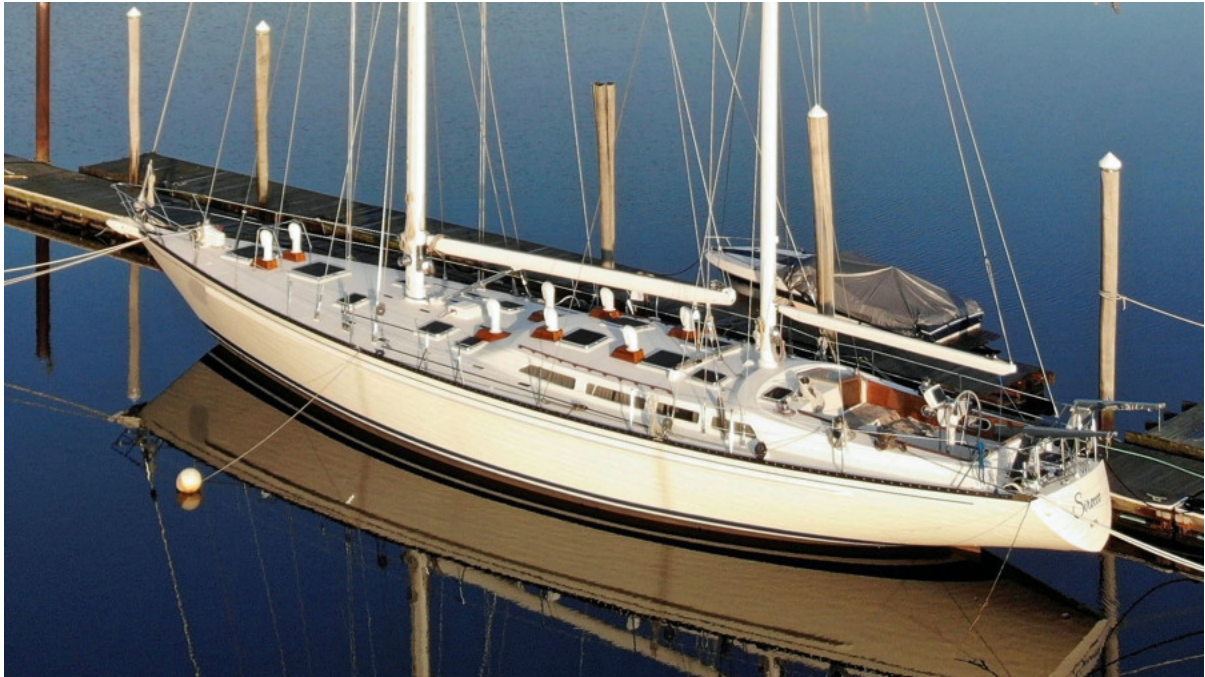
SIROCCO Alden/Palmer Johnson 78