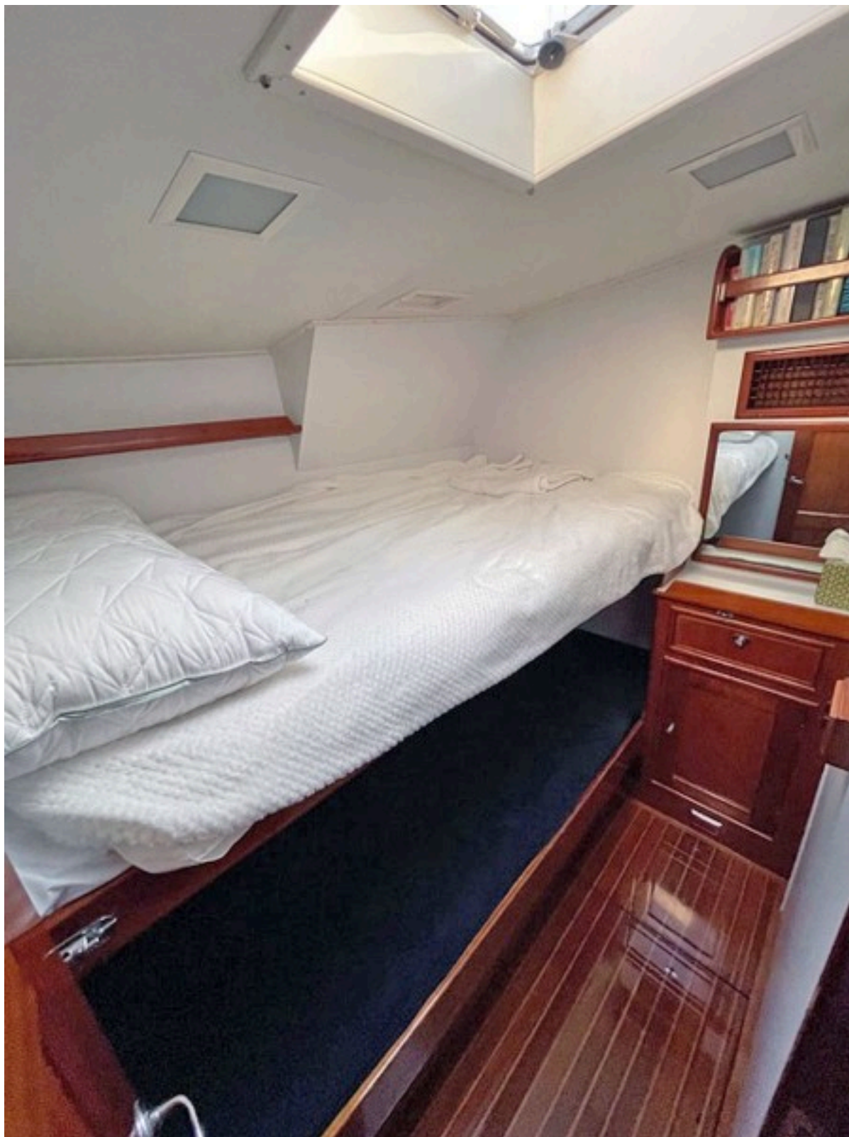
Port Fwd. Cabin