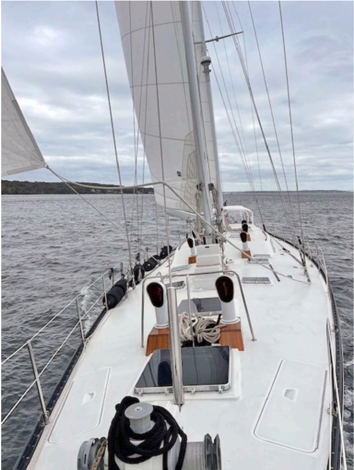
Looking Aft, Under Sail