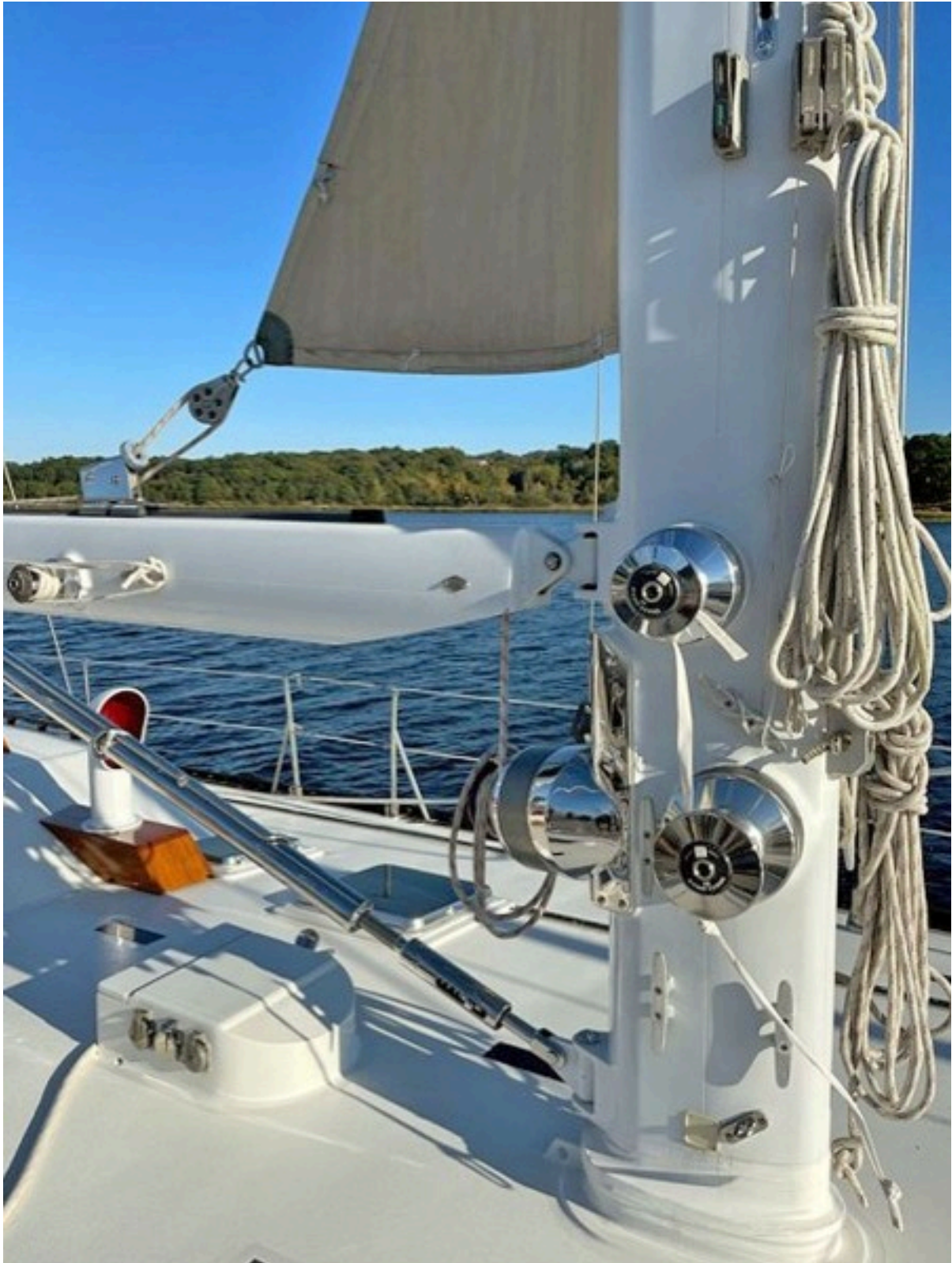
Mast and Boom