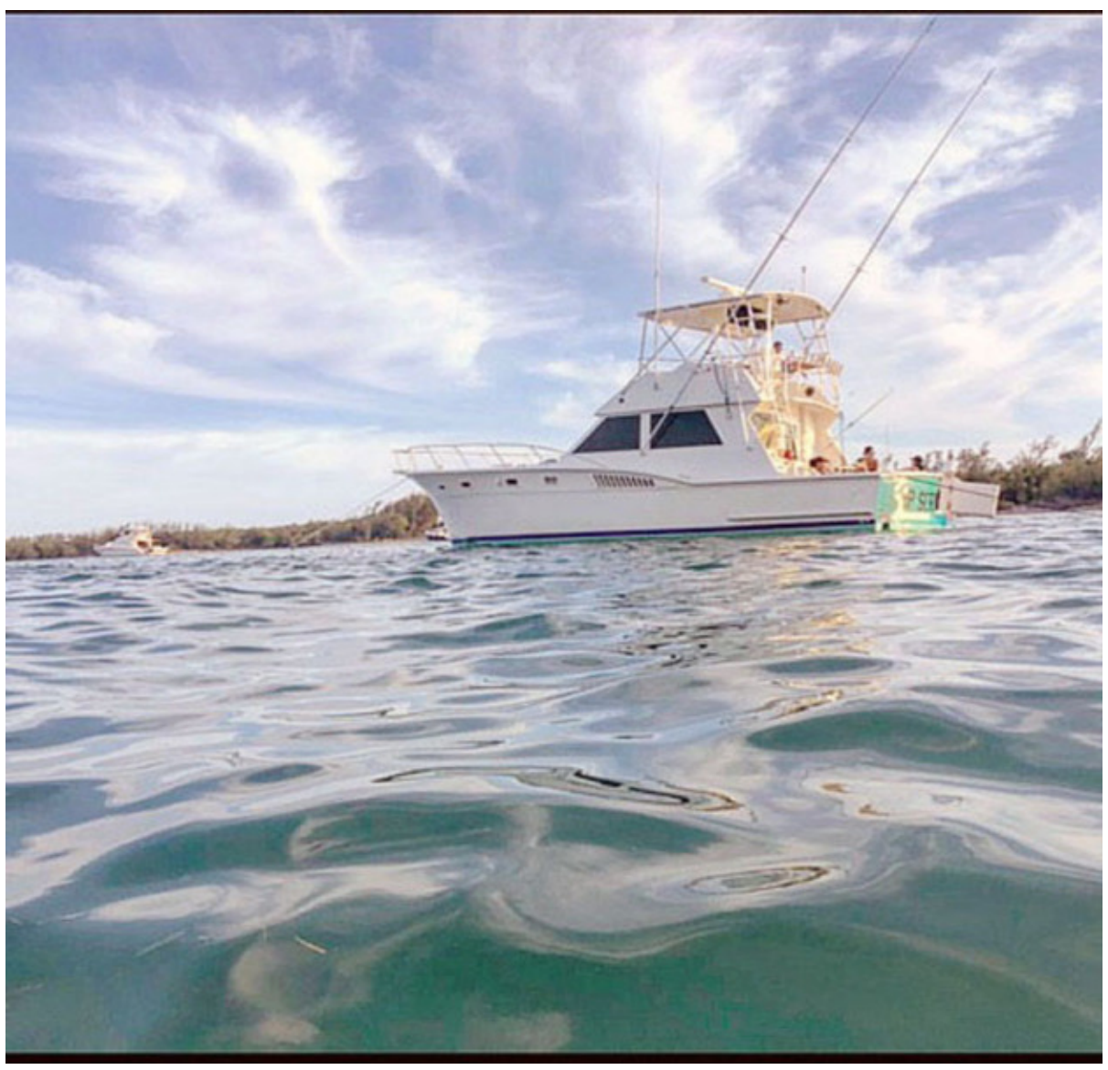
Port View Anchored