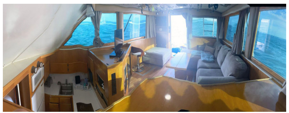
Galley Down, Salon Aft