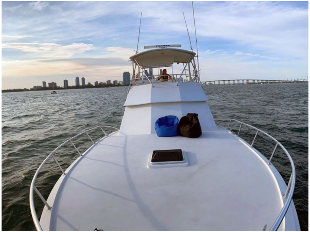
Foredeck To Aft