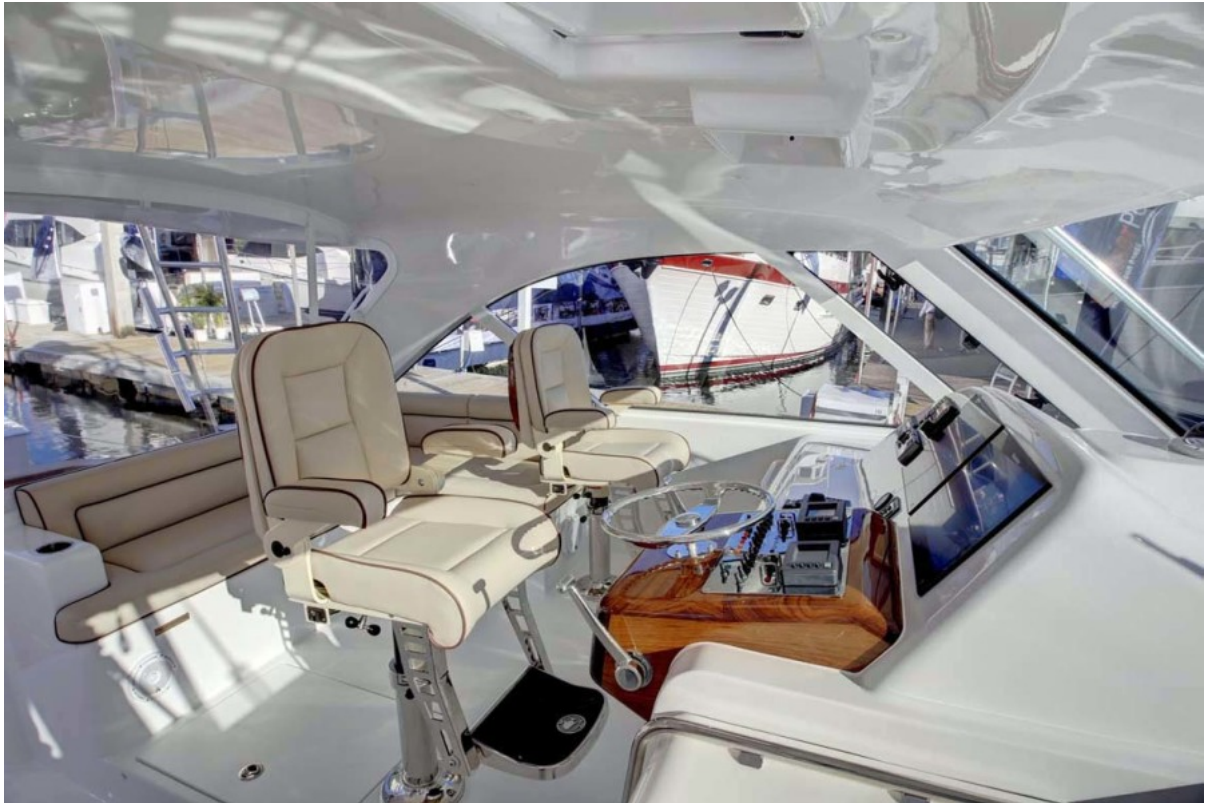
HeBridge Helm Decklm