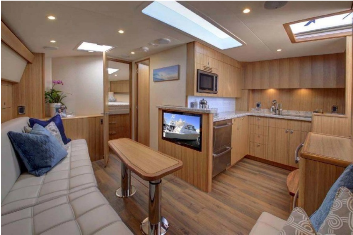
Salon and Galley