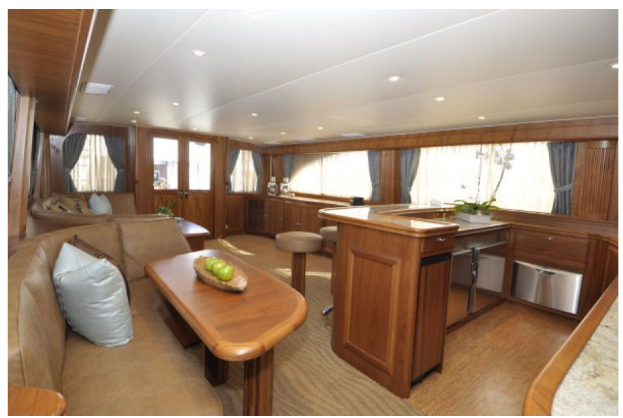
Aft Salon Aft Salon