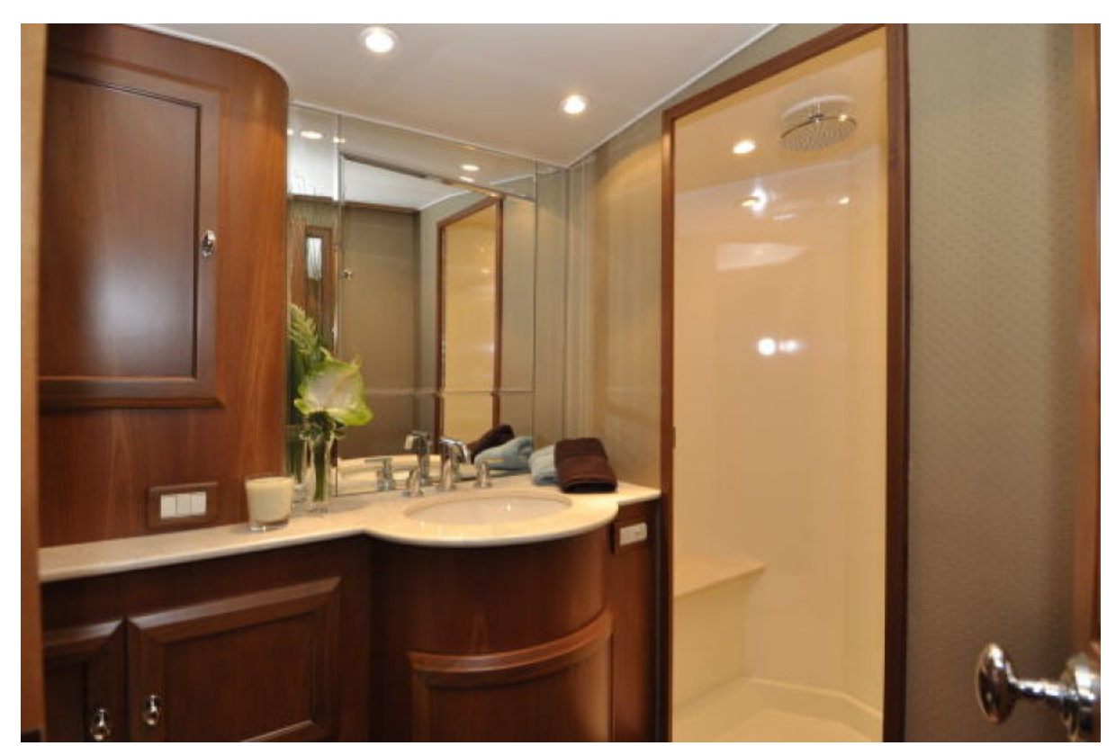
Master Bath Master Bath