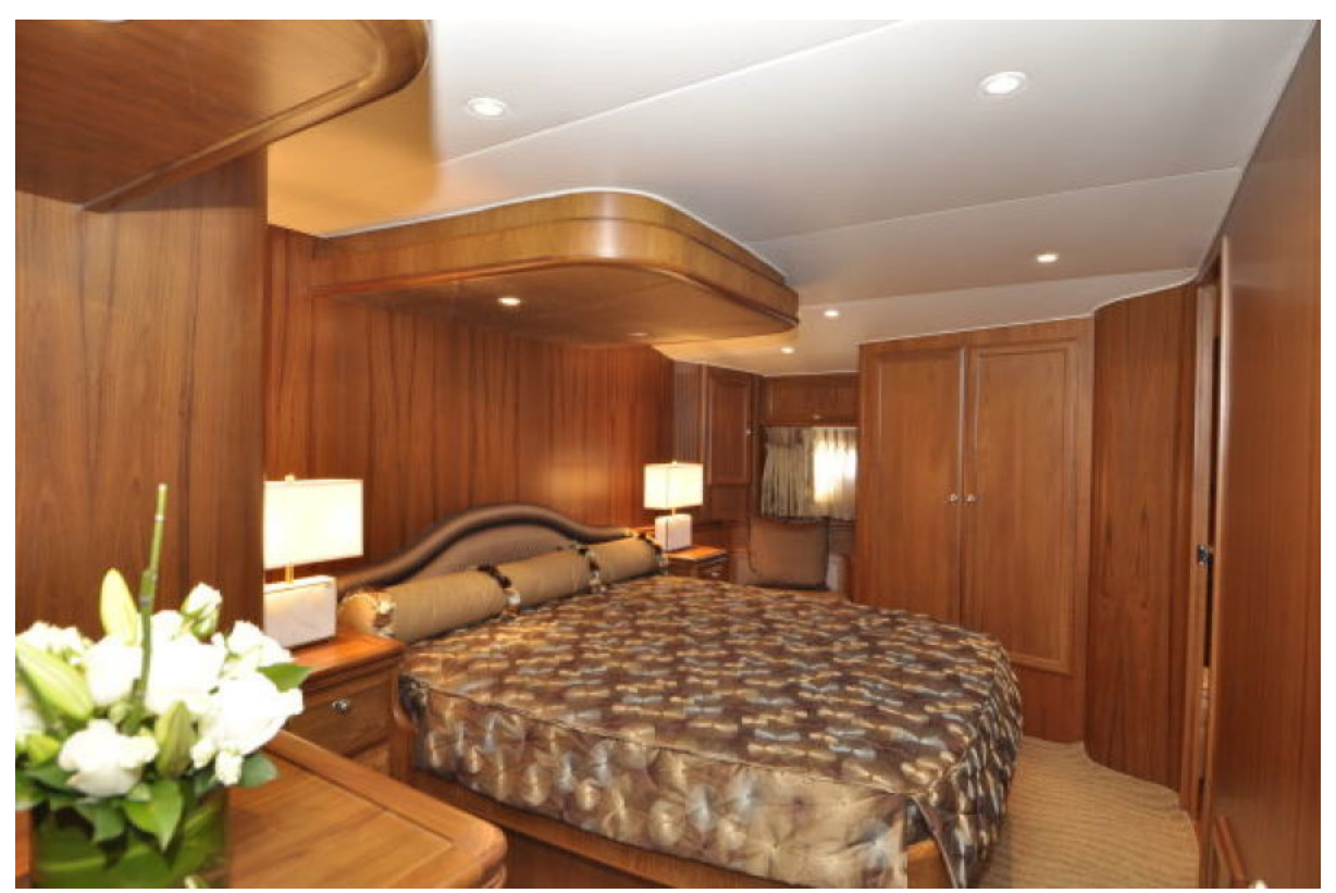
Master Stateroom Master Stateroom