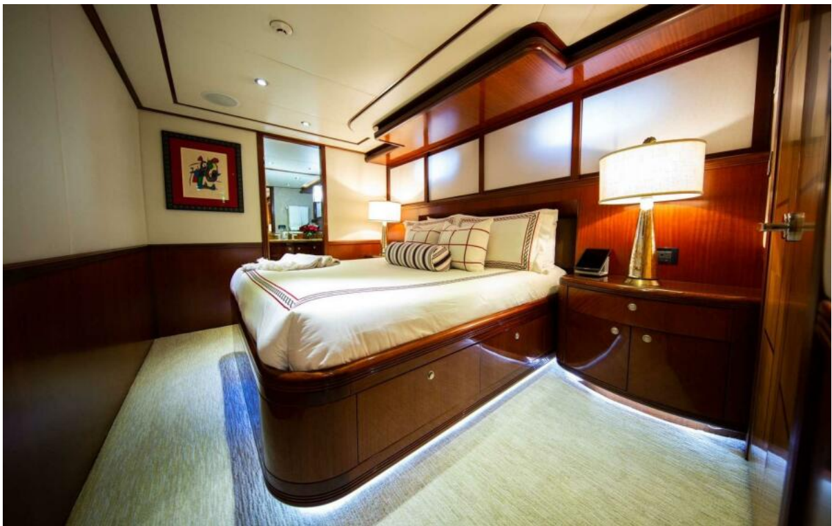
Queen Guest Cabin