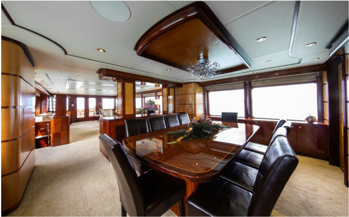
Main Salon Dining