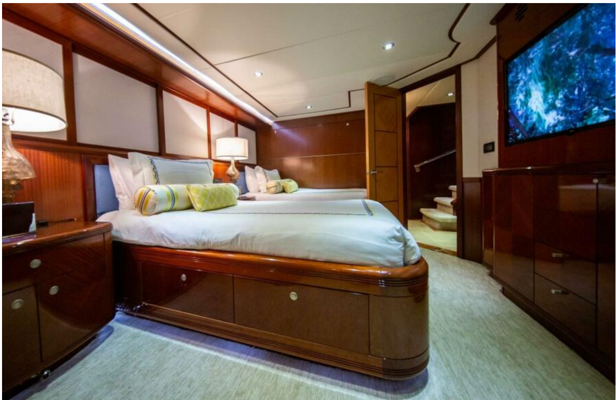
Queen Guest Suite