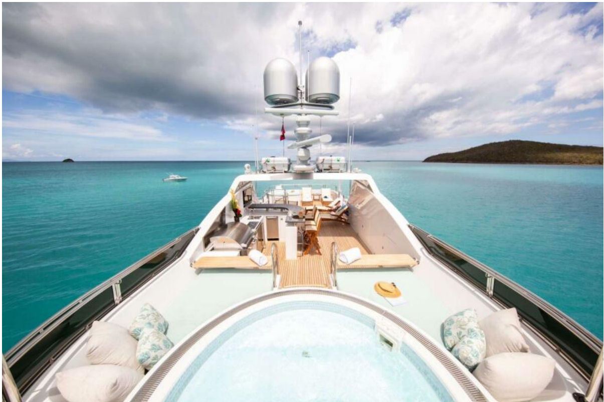
Sun Deck Aft View