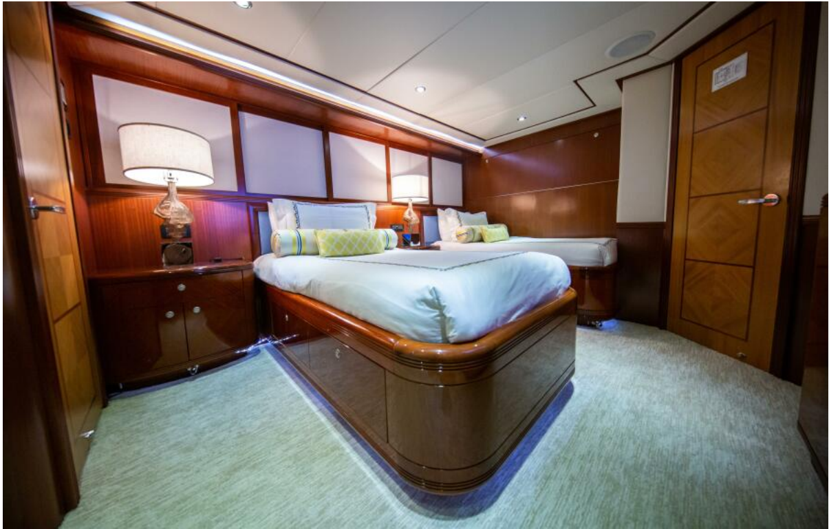
Twin Guest Suite