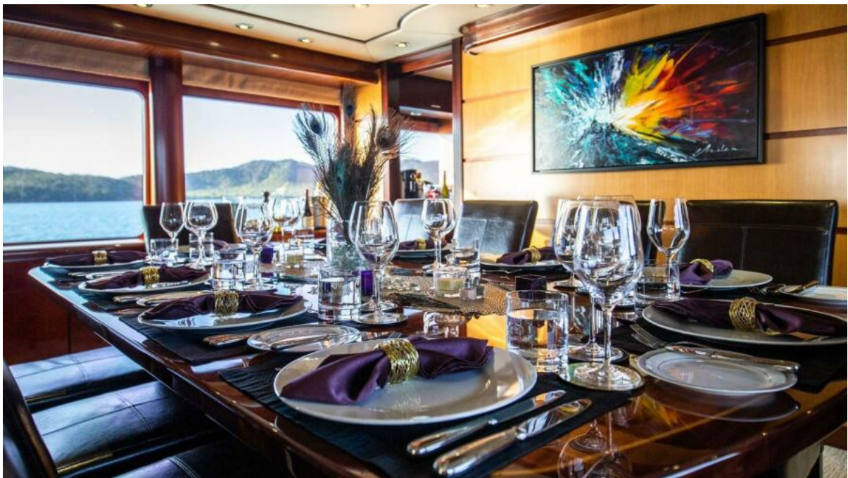
Main Salon Dining