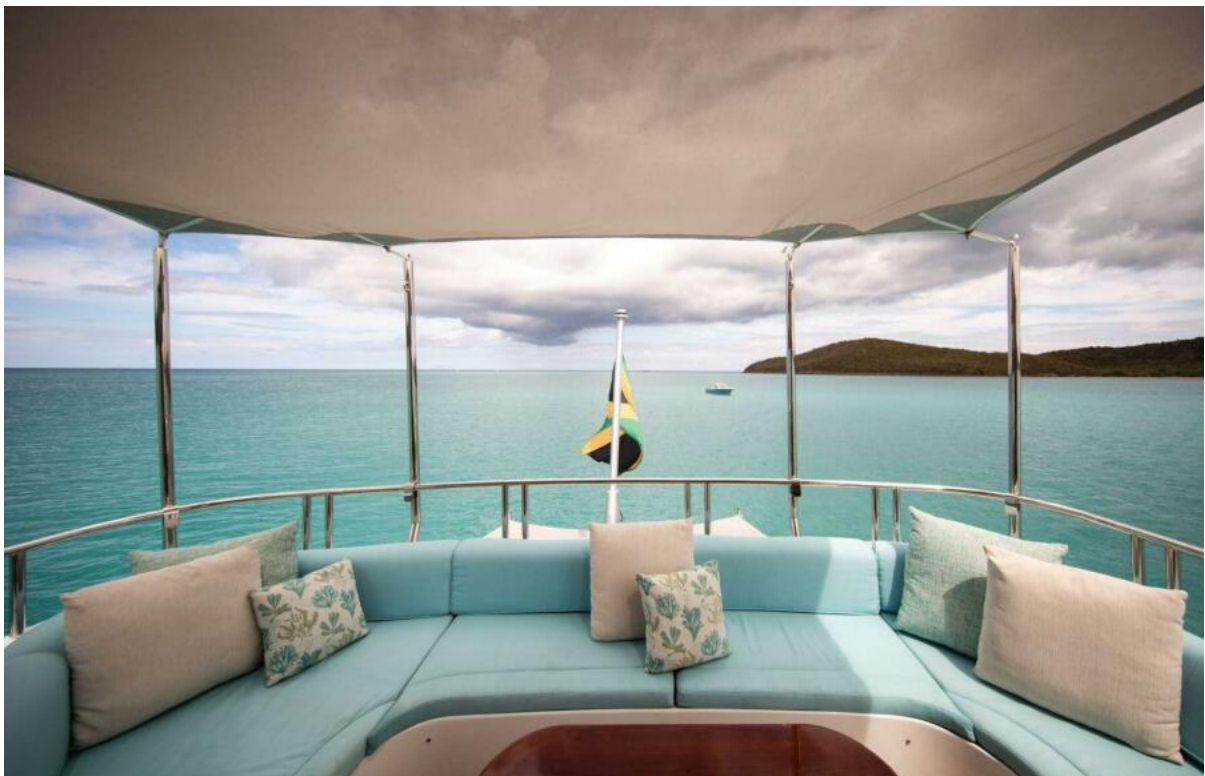
Bridge Deck Aft Lounge Seating