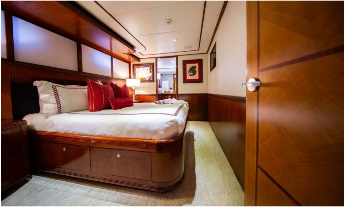
Queen Guest Cabin