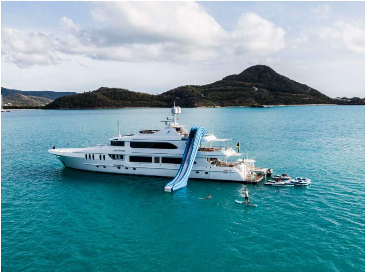
Just Enough Profile with Toys