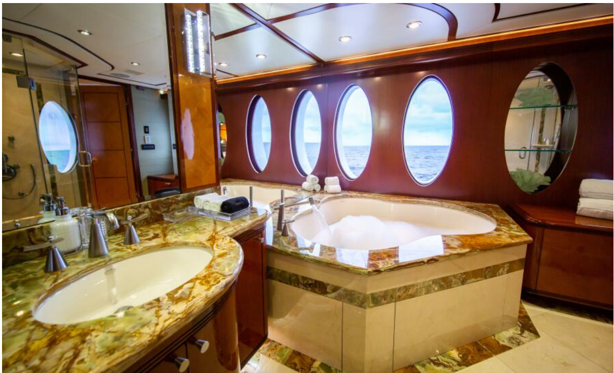
Master Bath with Jacuzzi