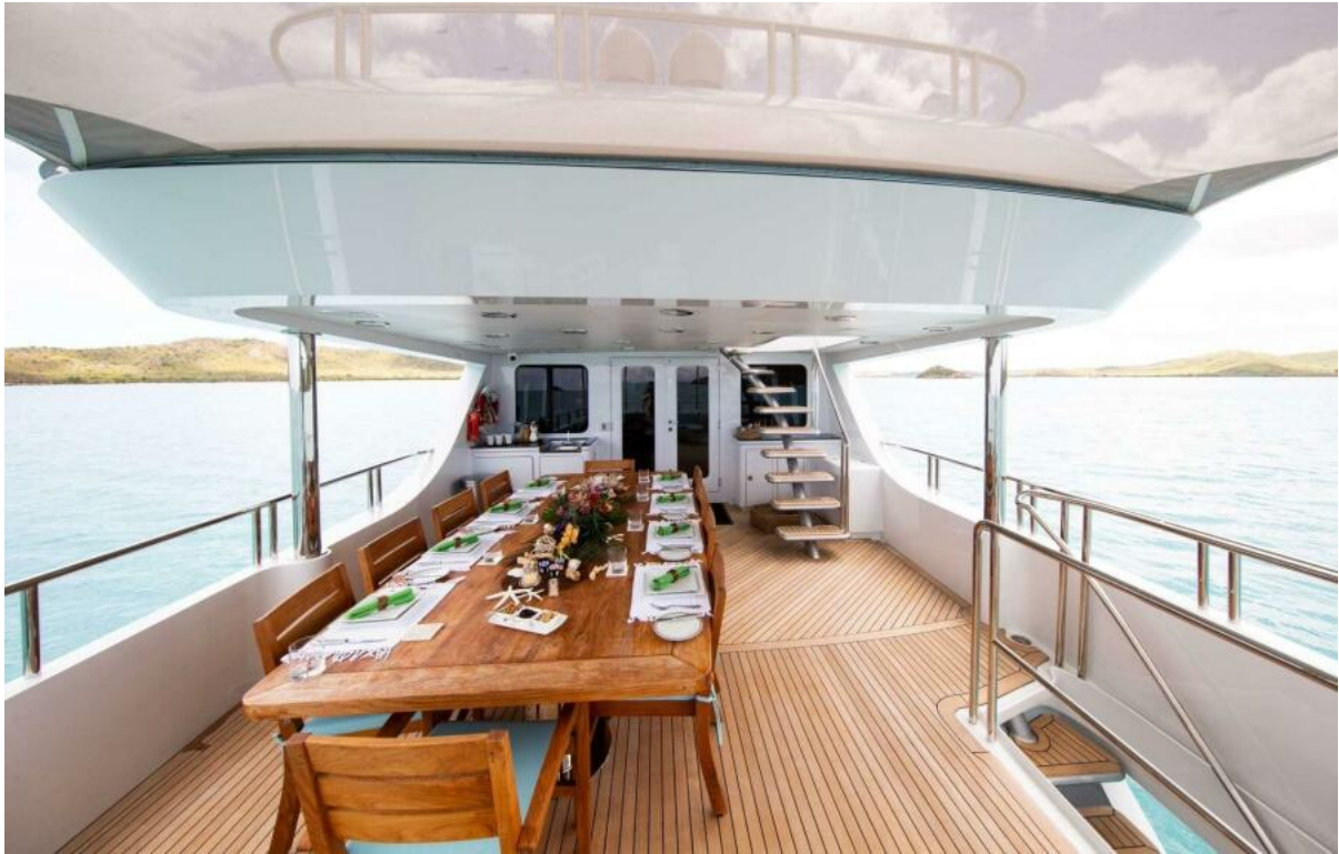
Bridge Deck Aft Dining