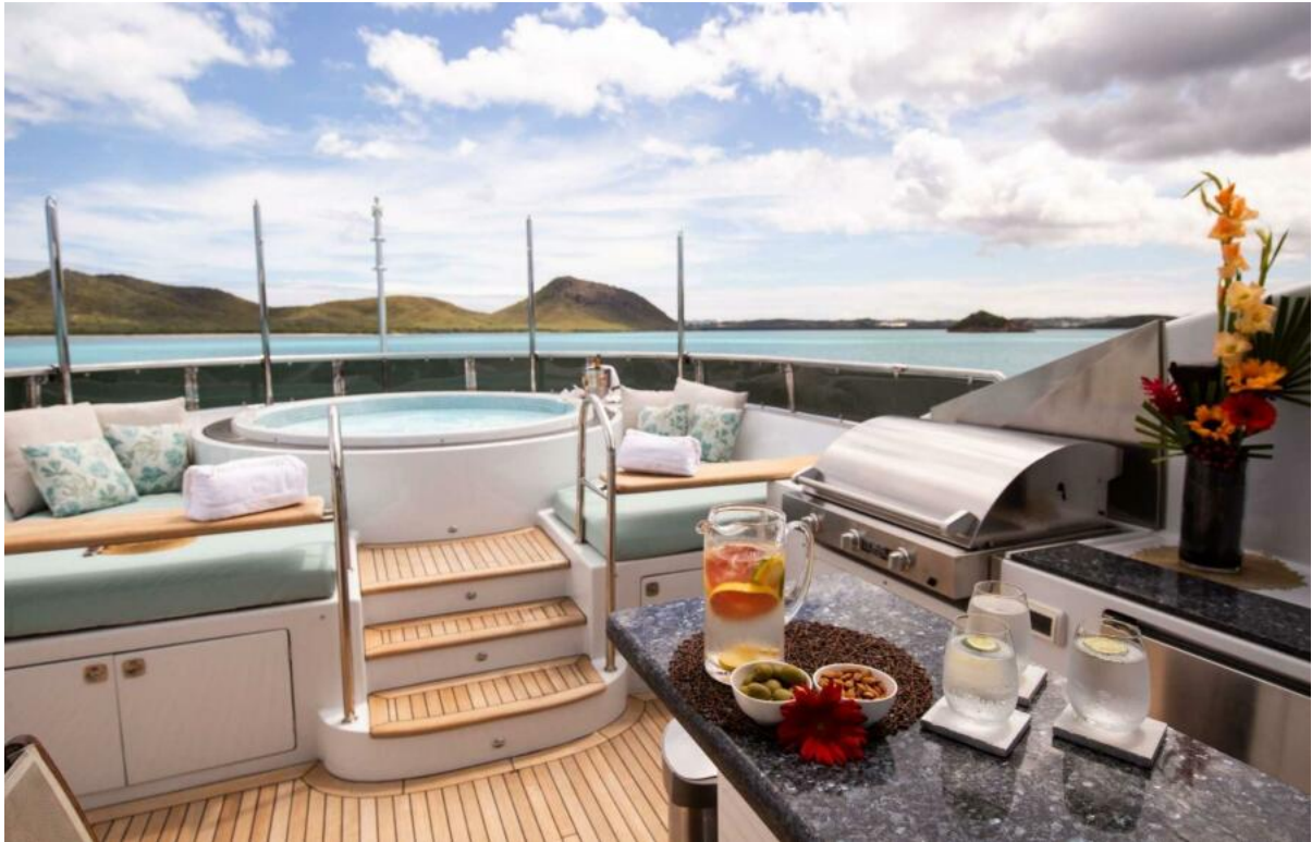
Sundeck Forward View