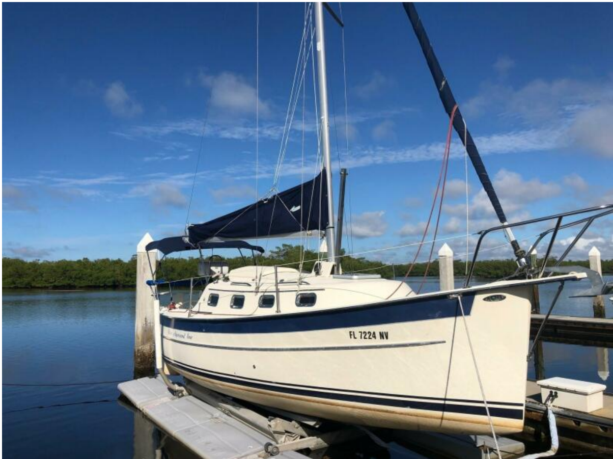
2009 Seaward 26RK Profile Starboard Bow 2