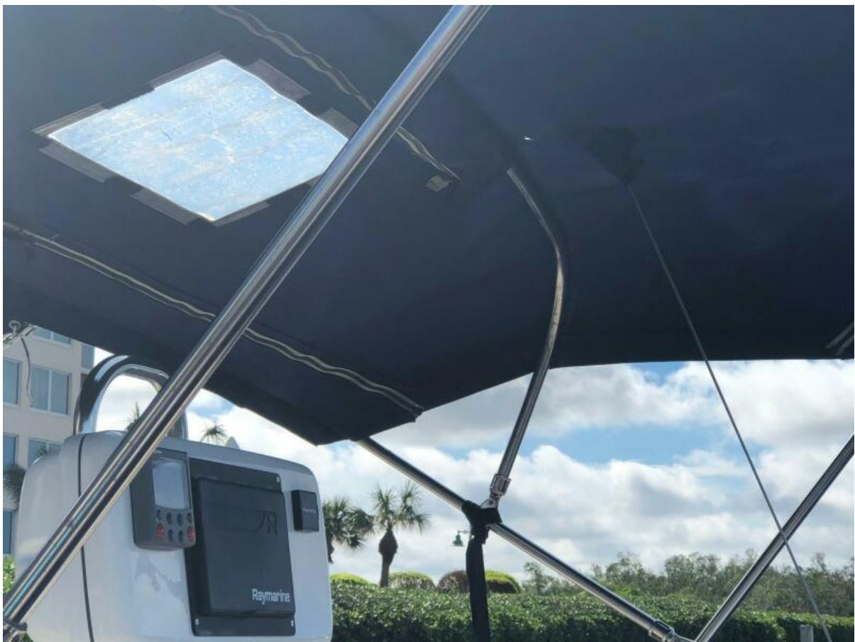
2009 Seaward 26RK Helm Bimini Top