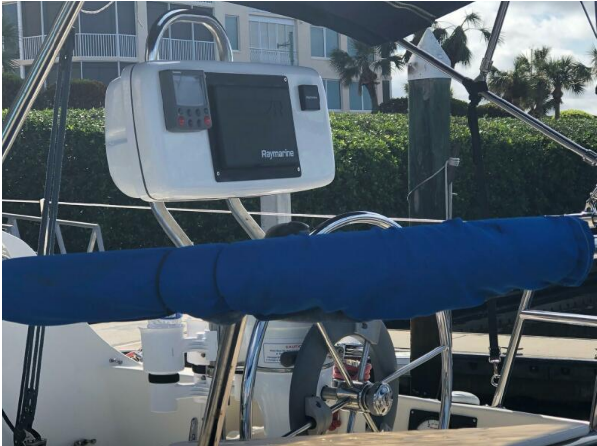
2009 Seaward 26RK Helm Raymarine GPS-Autopilot