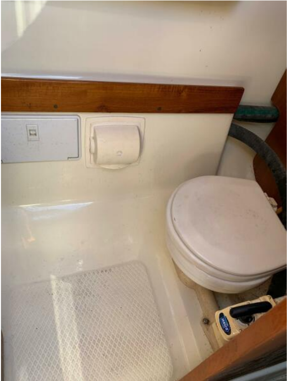
2009 Seaward 26RK Cabin Head