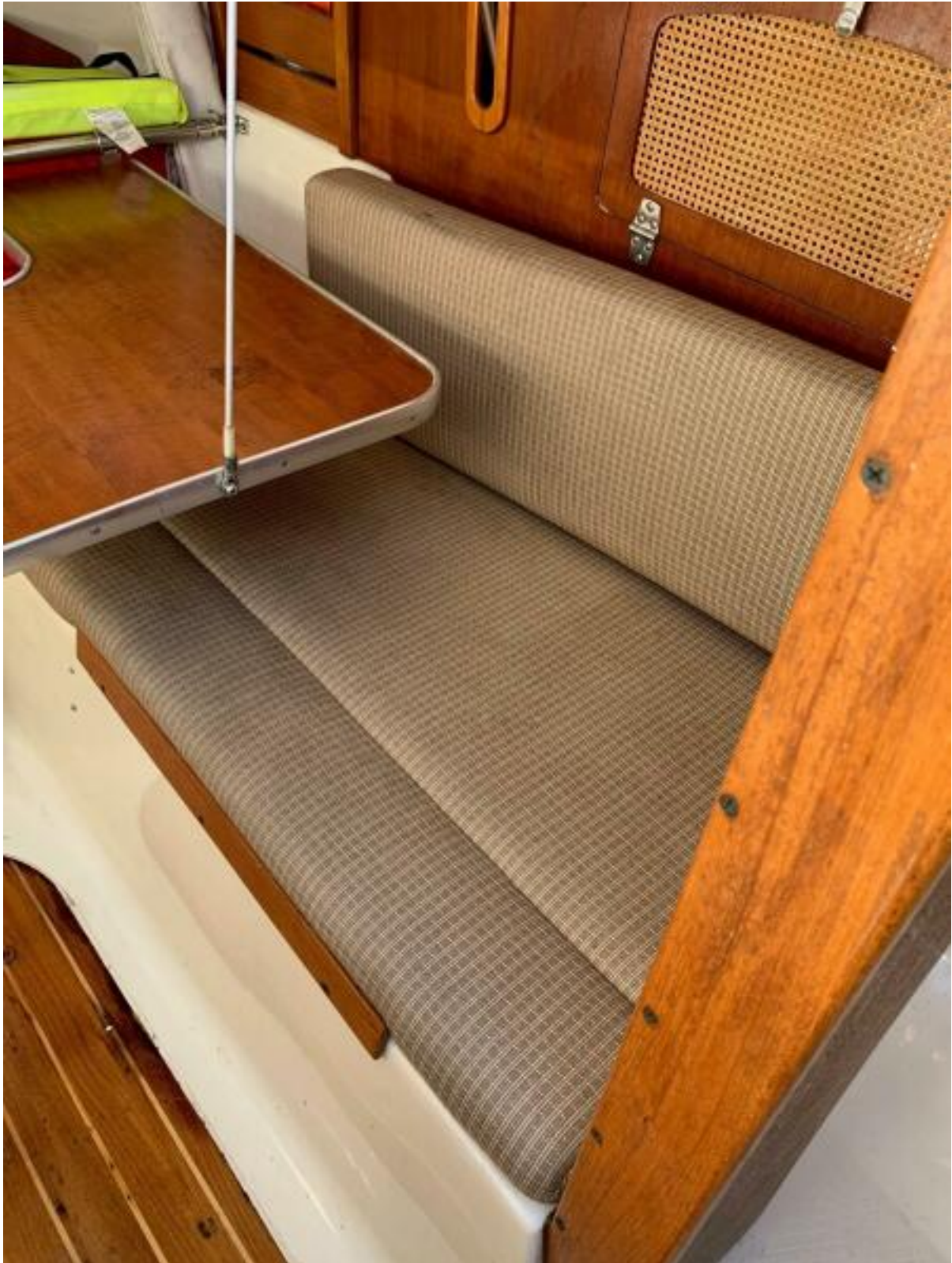
2009 Seaward 26RK Cabin Dinette