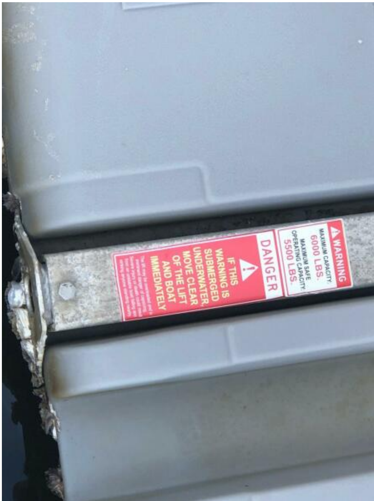
2009 Seaward 26RK Lift Capacity