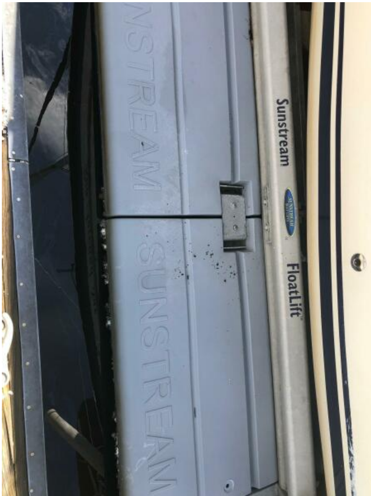
2009 Seaward 26RK Sunstream Float Lift