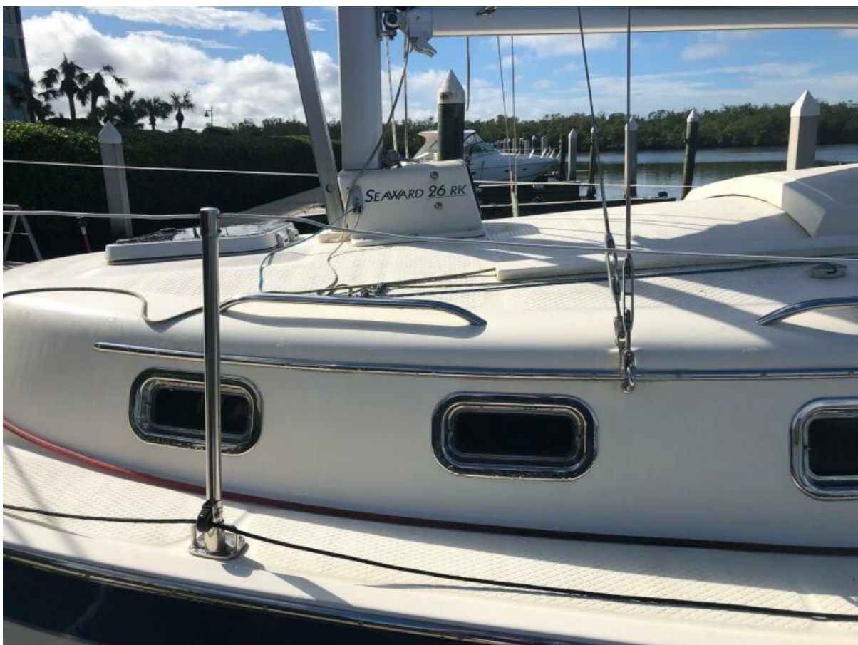
2009 Seaward 26RK Seaward 26RK