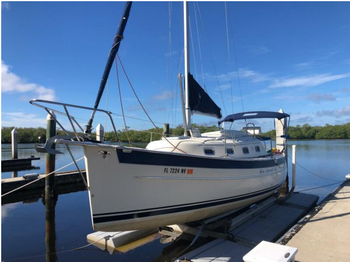
2009 Seaward 26RK Profile Port Bow