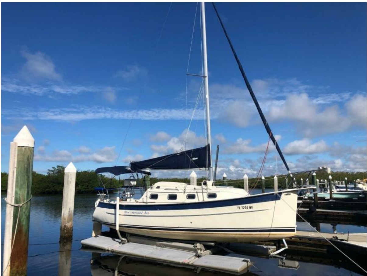
2009 Seaward 26RK Profile Starboard Bow