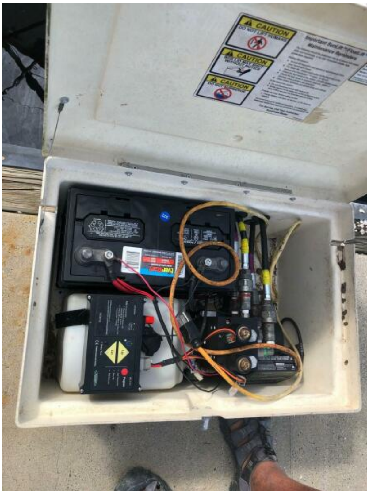
2009 Seaward 26RK Lift Hydraulics