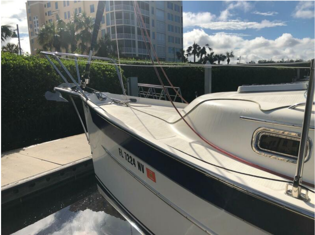
2009 Seaward 26RK Foredeck