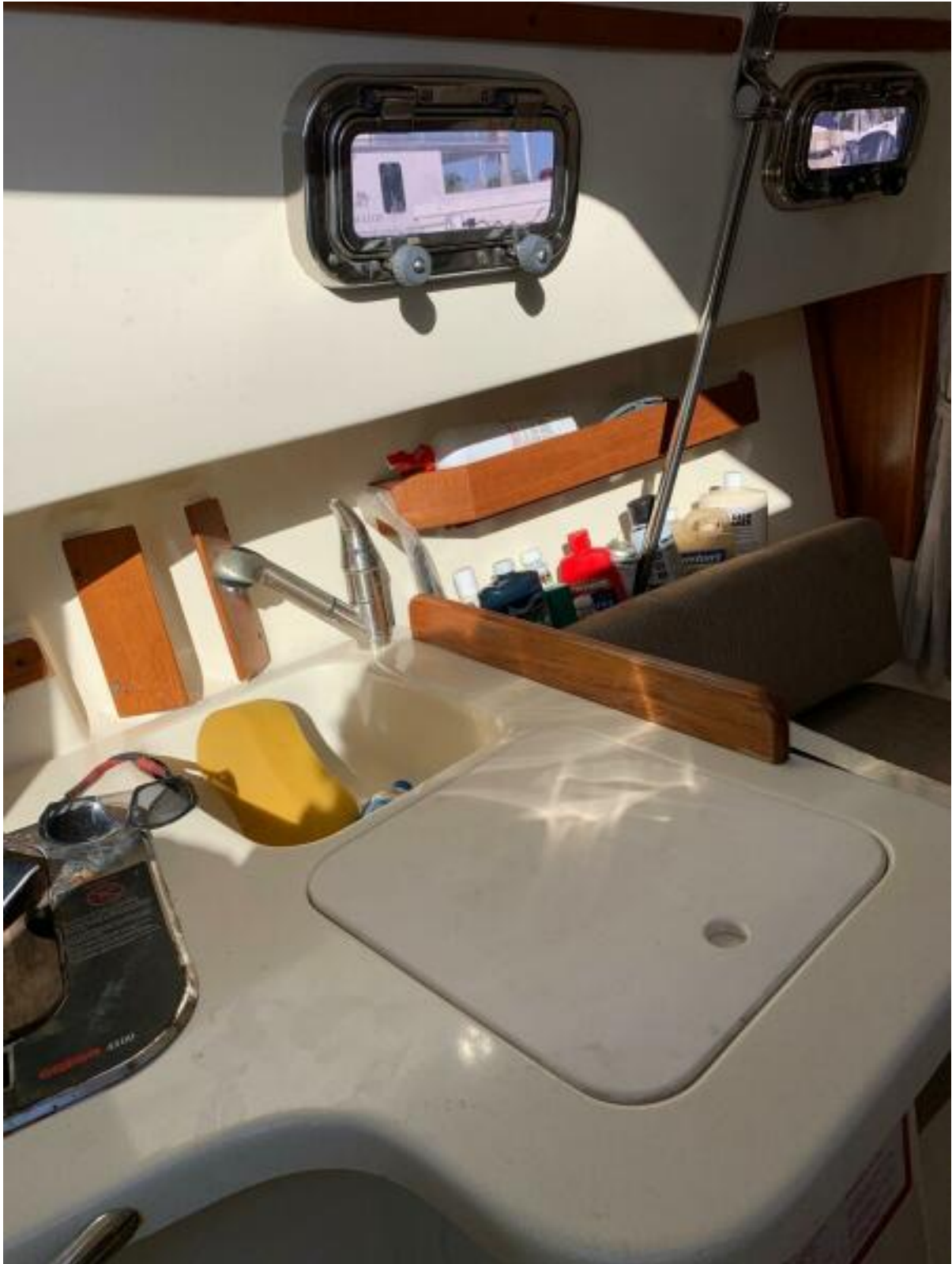
2009 Seaward 26RK Cabin Galley Sink