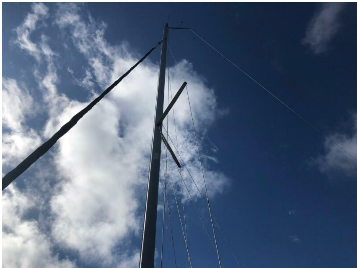
2009 Seaward 26RK Mast