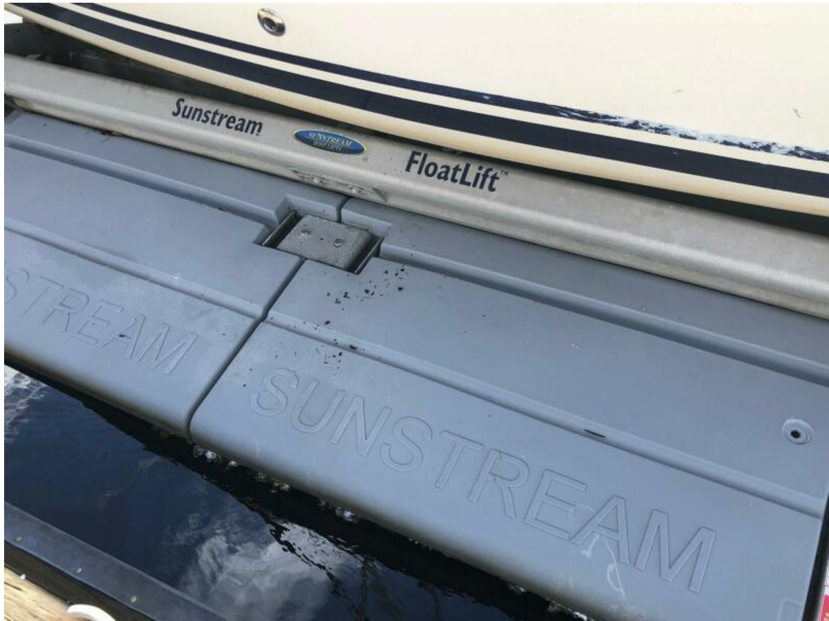
2009 Seaward 26RK Sunstream Float Lift 2