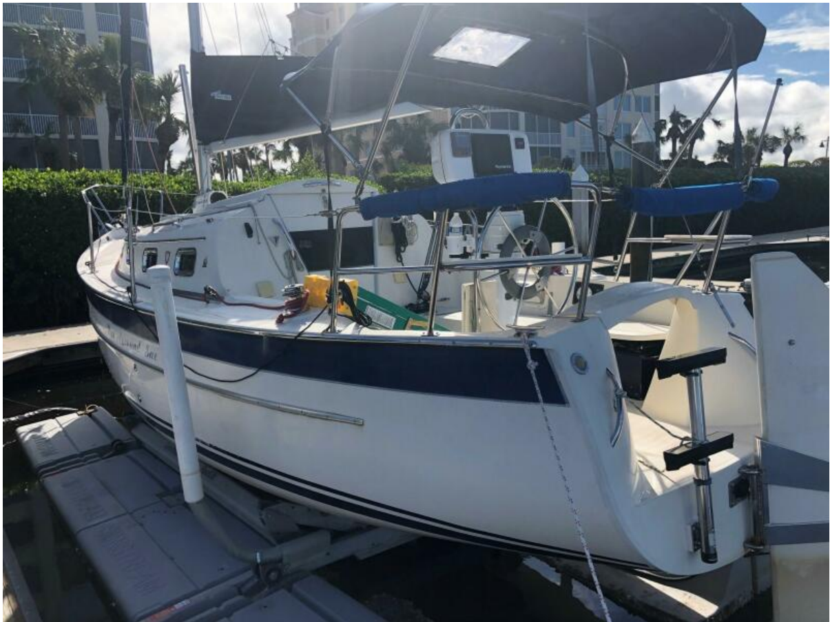
2009 Seaward 26RK Profile Starboard