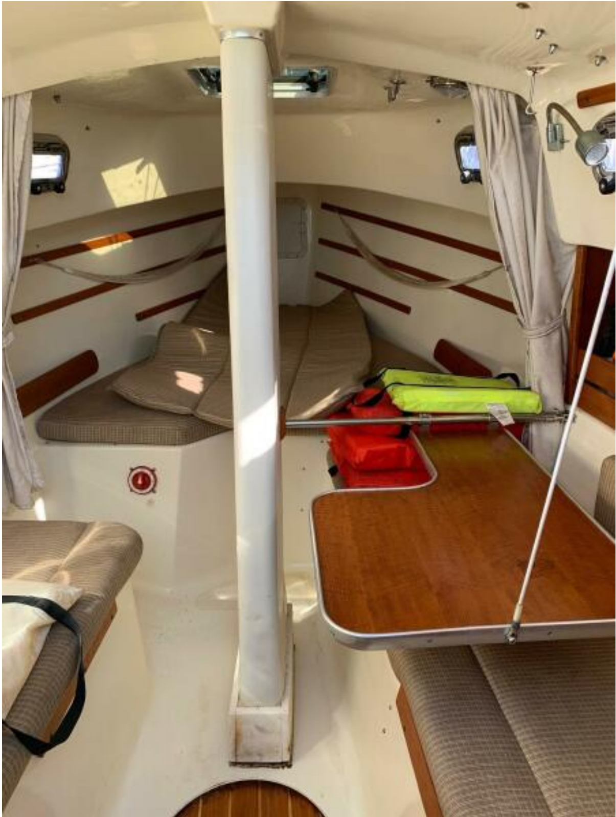
2009 Seaward 26RK Cabin V-Berth