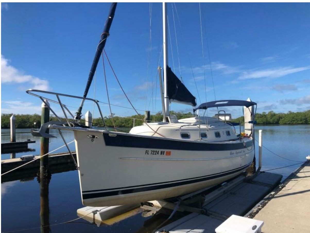
2009 Seaward 26RK Profile Port Stern