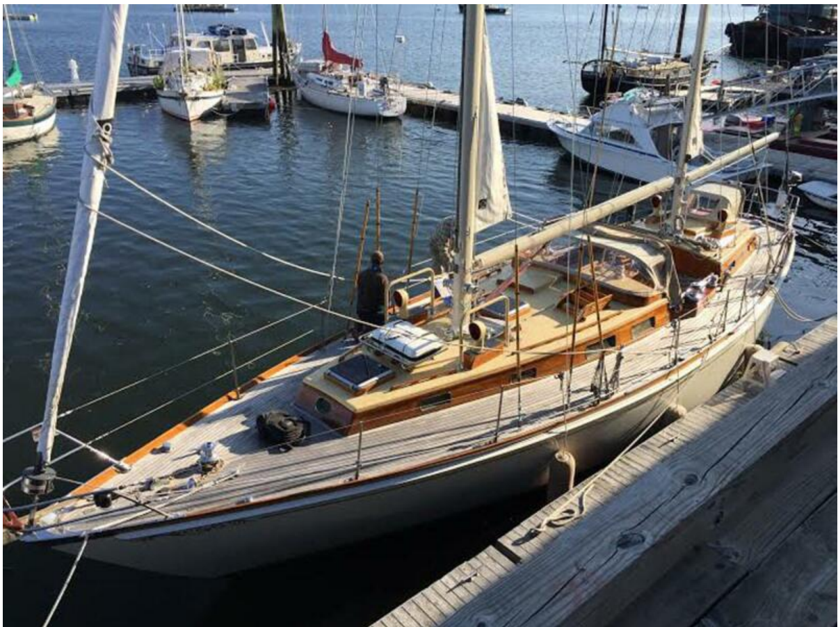
Deck Bow View