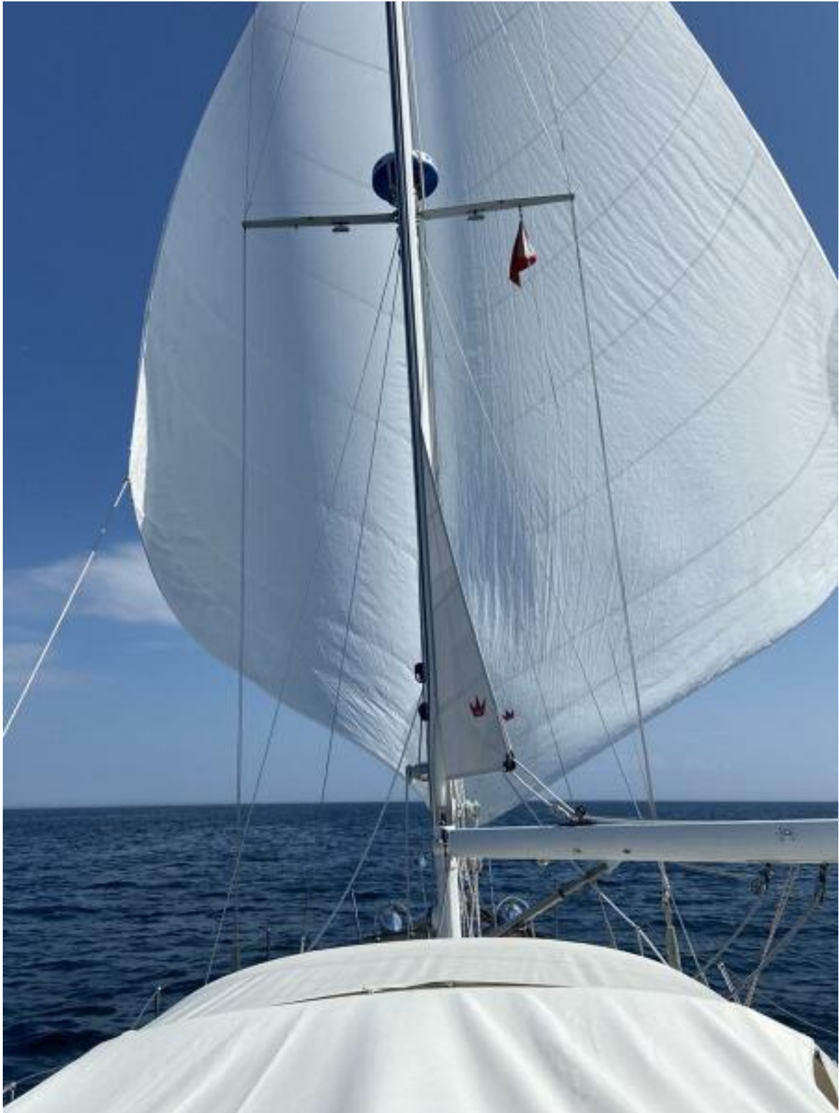
Under Sail w/ Double-Winged Genoas