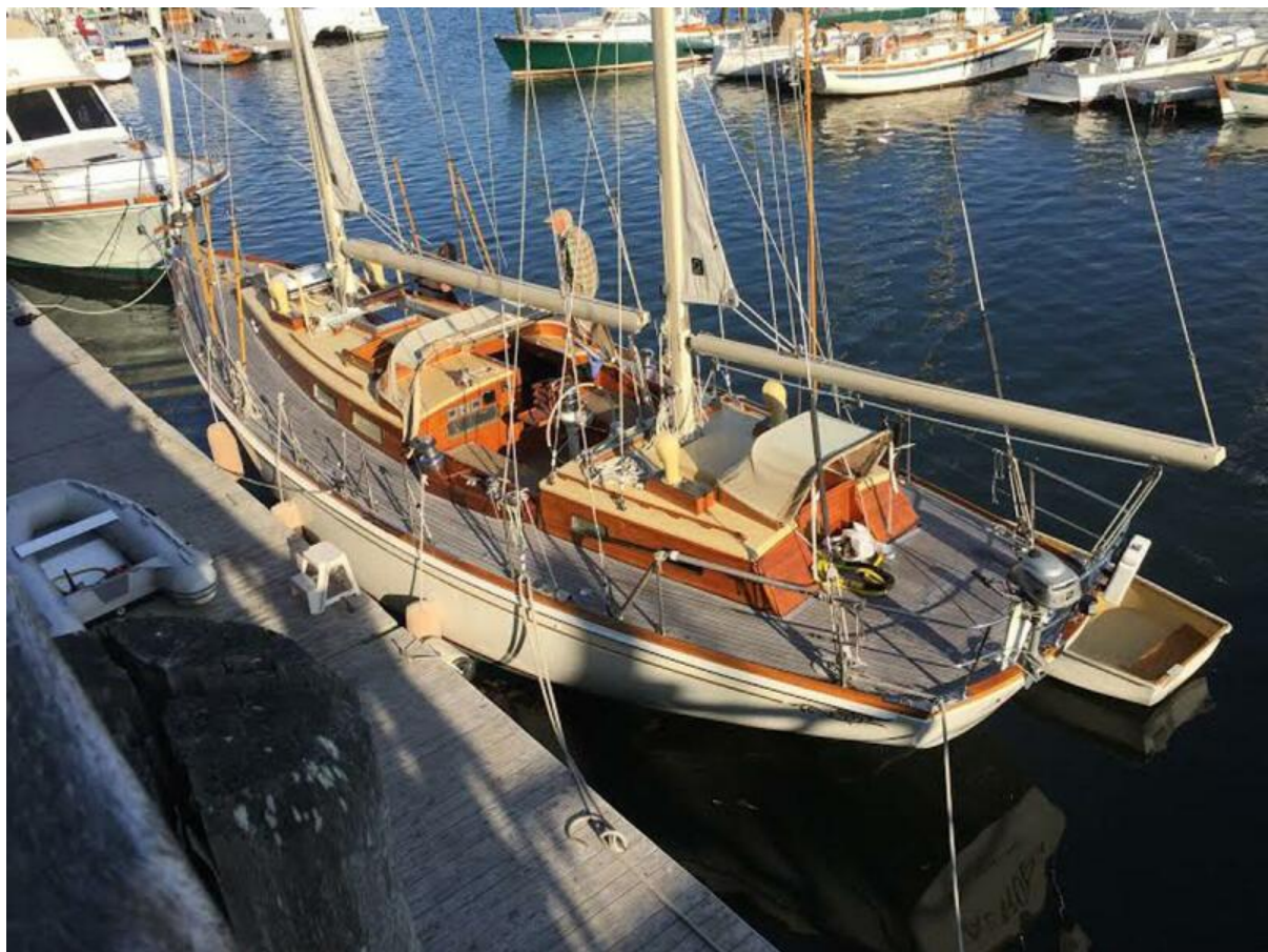
Deck, Stern View