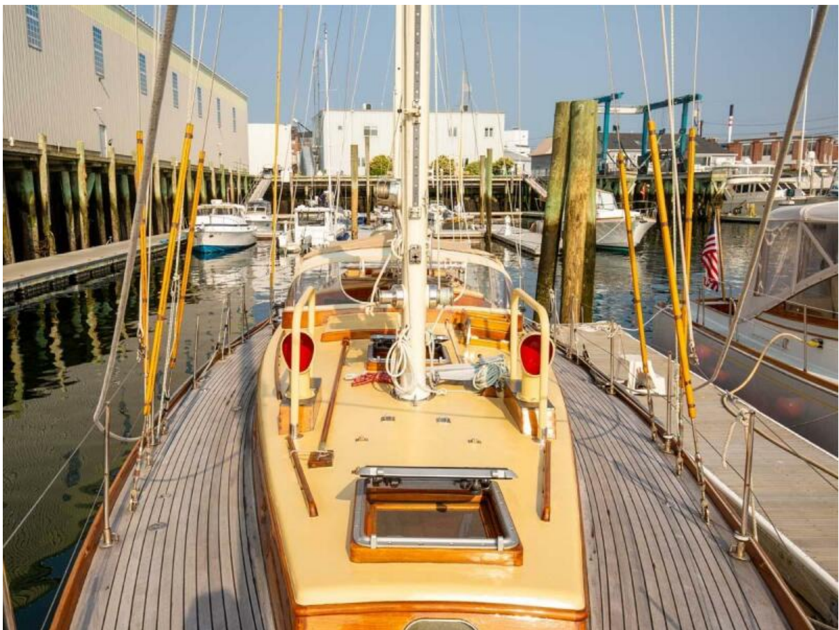
Cabintop, Looking Aft