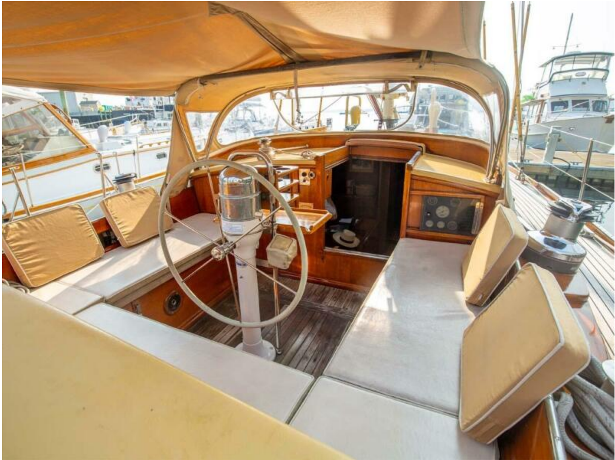
Helm Looking Fwd