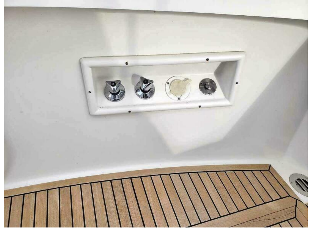
New Cockpit Shower