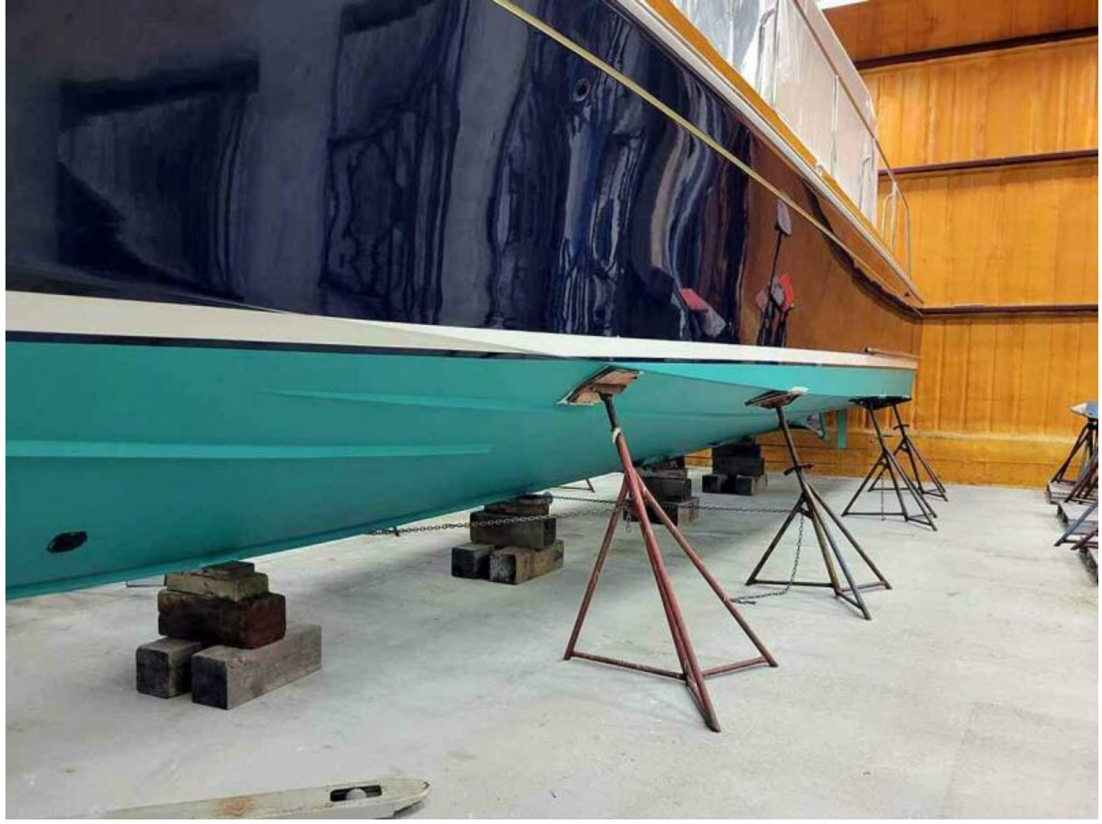
New Bottom Paint 2022