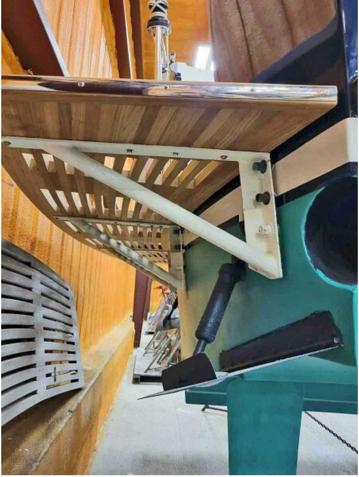
New Swim Platform 2023