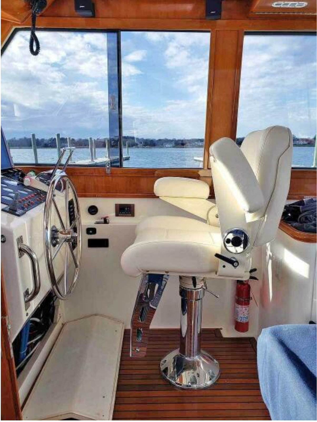
Stidd Helm Seat