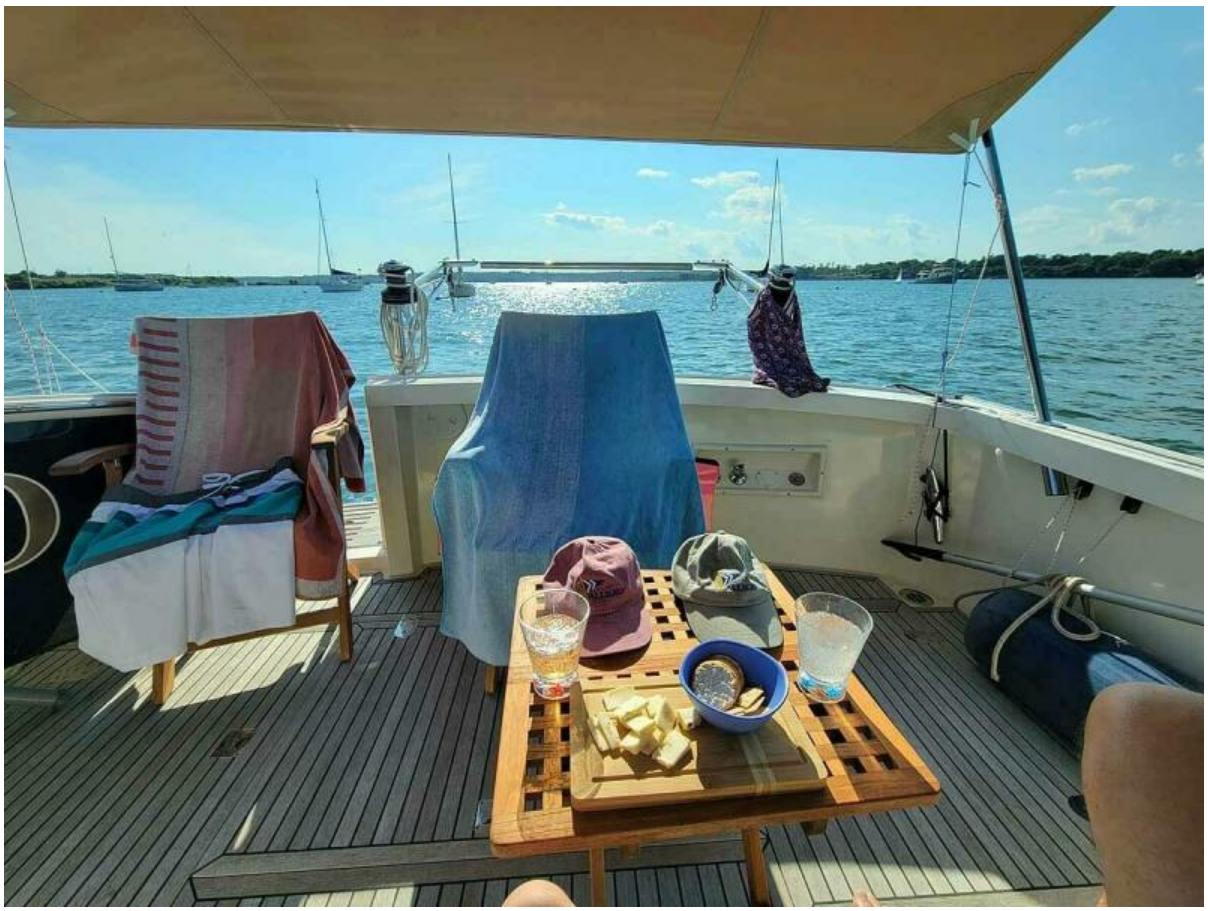
Canvas Cockpit Awning