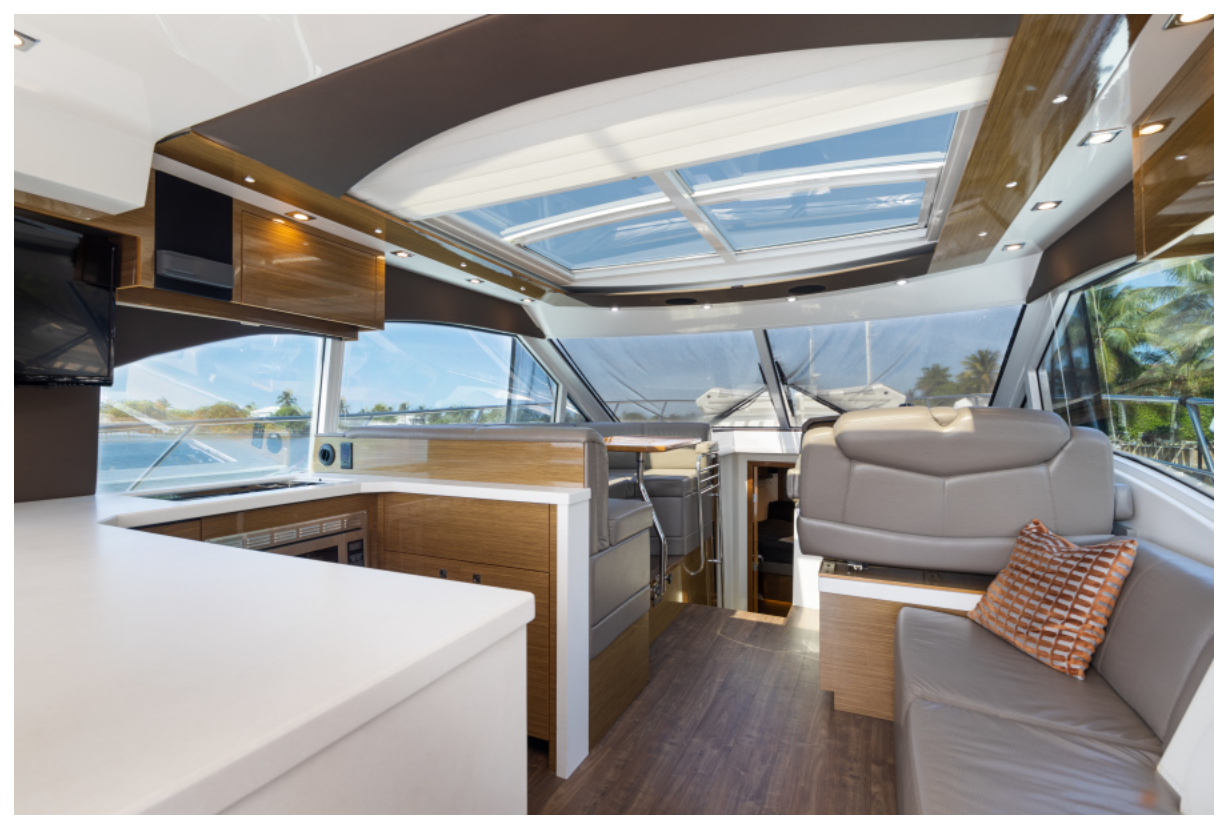
Cruisers 45 - Salon 2018 Cruisers 45 Cantius - Insieme