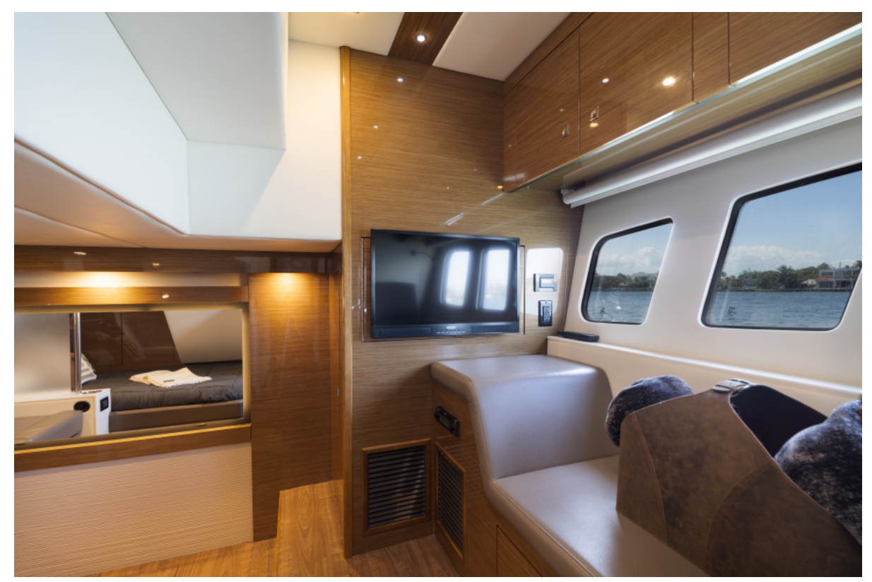
Cruisers 45 - Guest Stateroom 2018 Cruisers 45 Cantius - Insieme