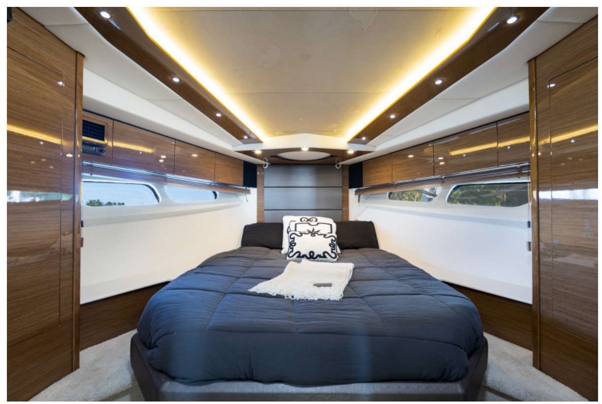
Cruisers 45 - Master Stateroom 2018 Cruisers 45 Cantius - Insieme