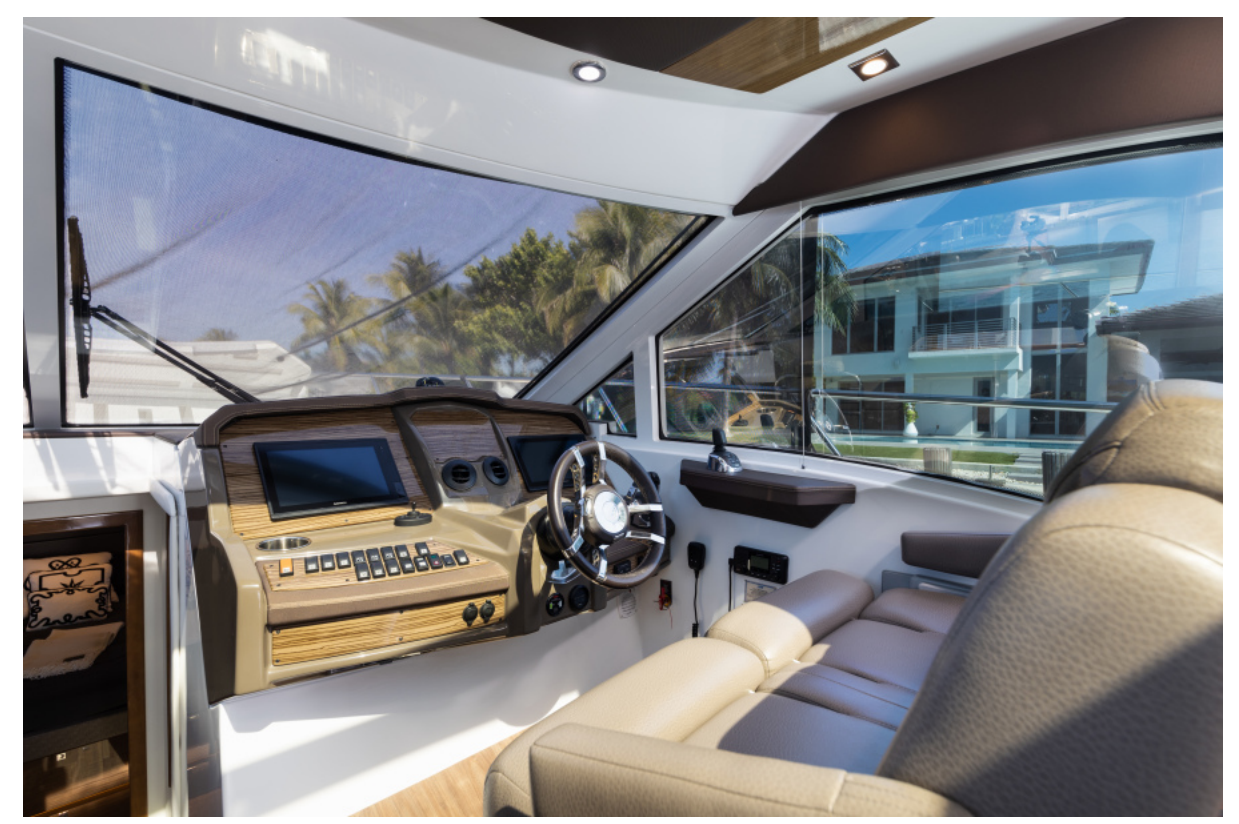
Cruisers 45 - Helm 2018 Cruisers 45 Cantius - Insieme