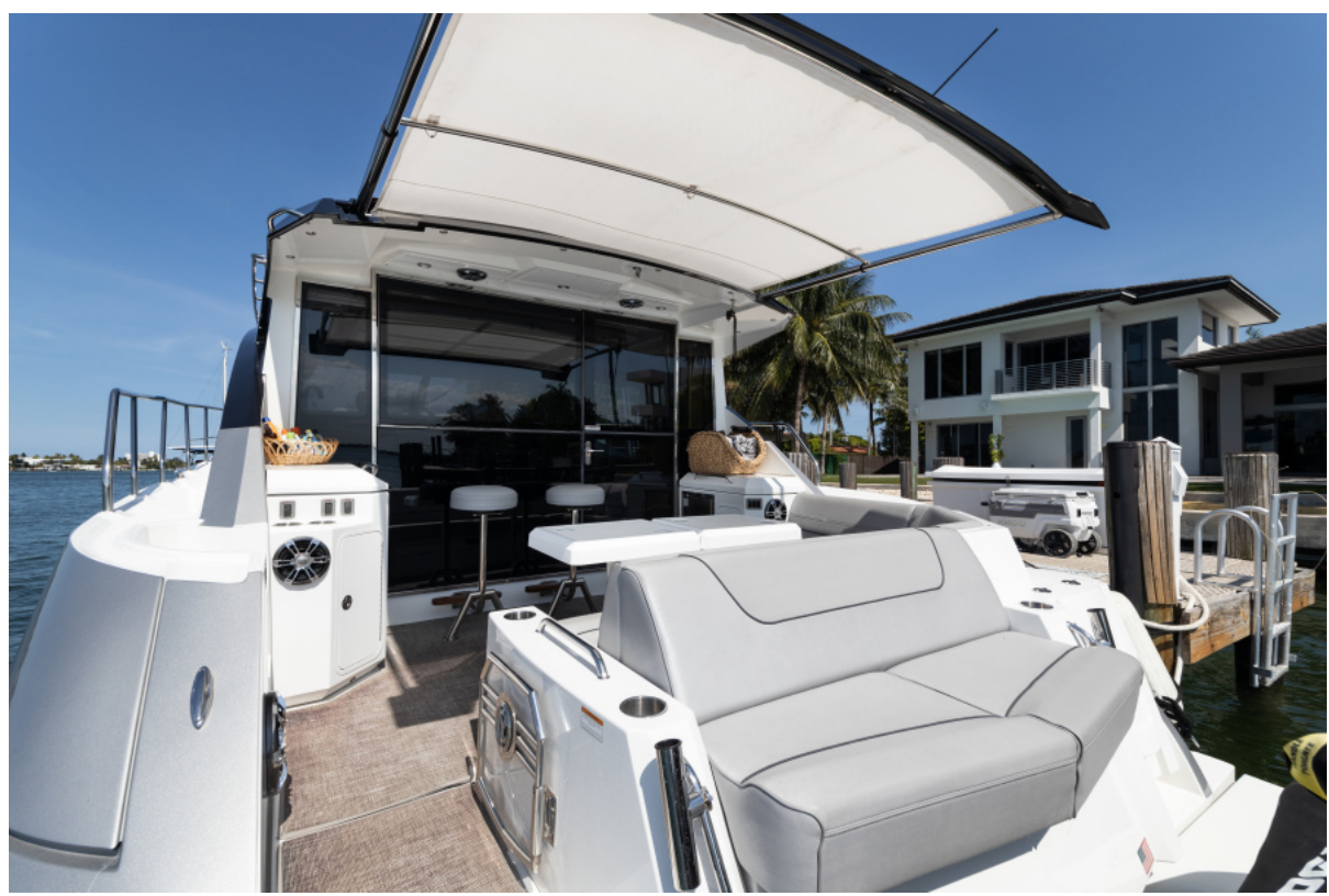
Cruisers 45 - Aft Deck Seating 2018 Cruisers 45 Cantius - Insieme