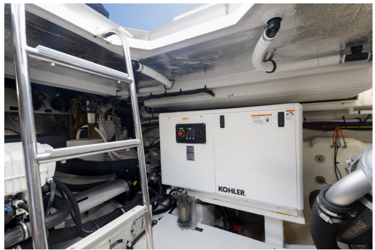
Cruisers 45 - Engine Room 2018 Cruisers 45 Cantius - Insieme

Eddie Montserrat emontserrat@hmy.com 1-954-309-5033