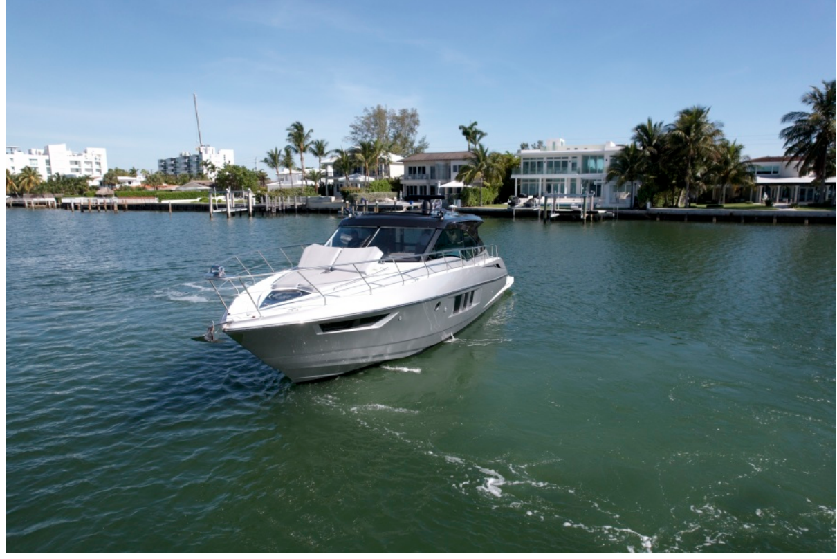
Cruisers 45 - Exterior Profile 2018 Cruisers 45 Cantius - Insieme