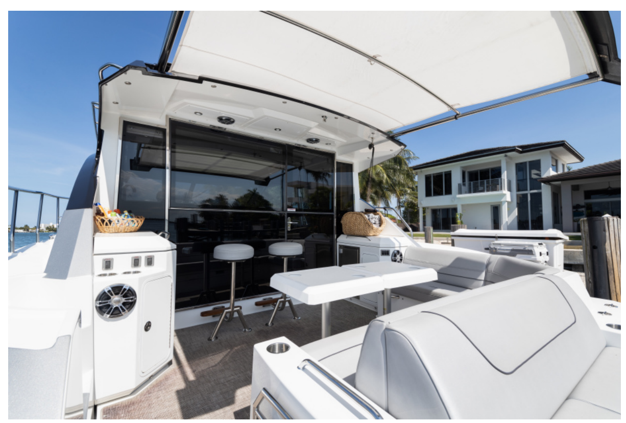
Cruisers 45 - Aft Deck 2018 Cruisers 45 Cantius - Insieme