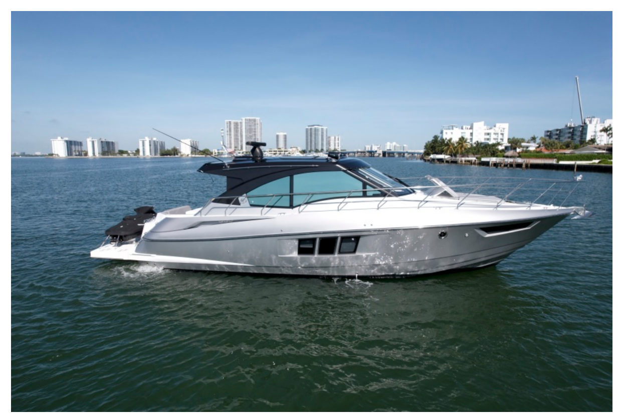
Cruisers 45 - Exterior Profile 2018 Cruisers 45 Cantius - Insieme