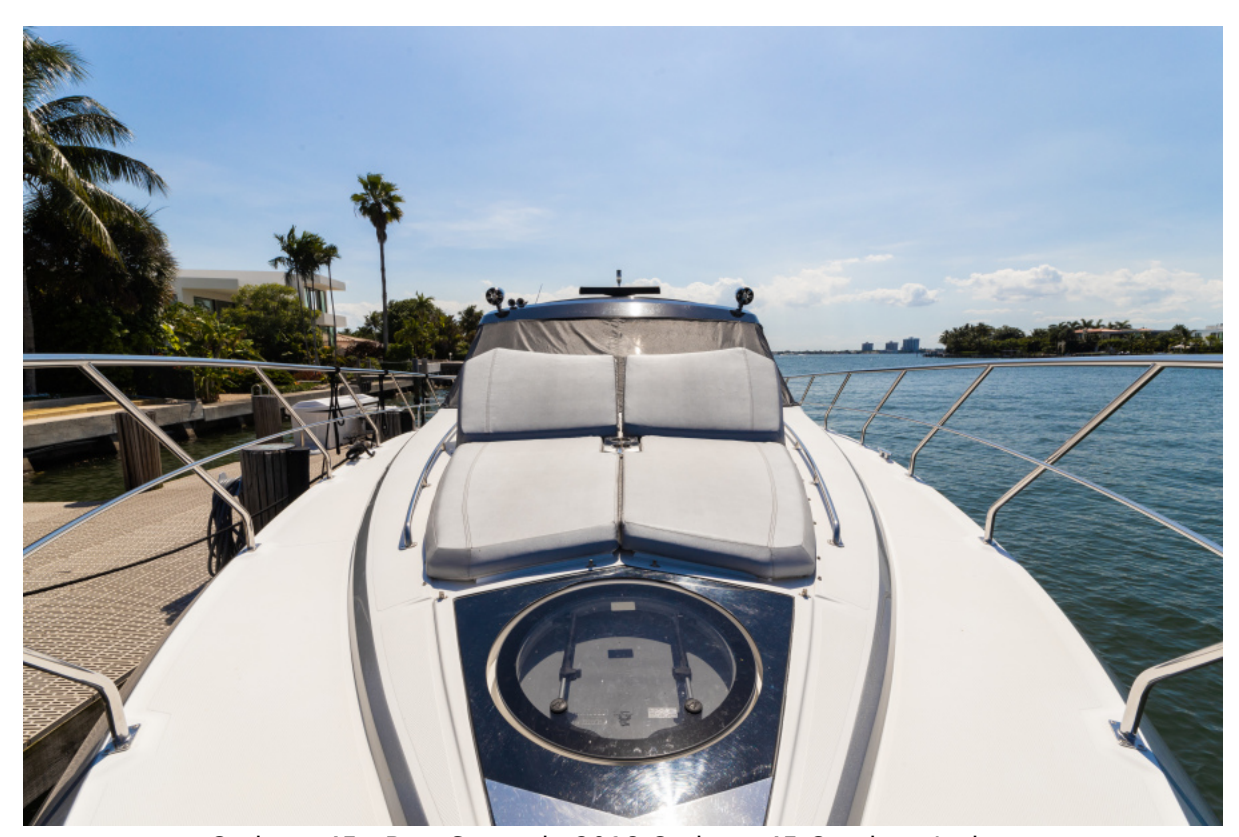
Cruisers 45 - Bow Sunpad 2018 Cruisers 45 Cantius - Insieme