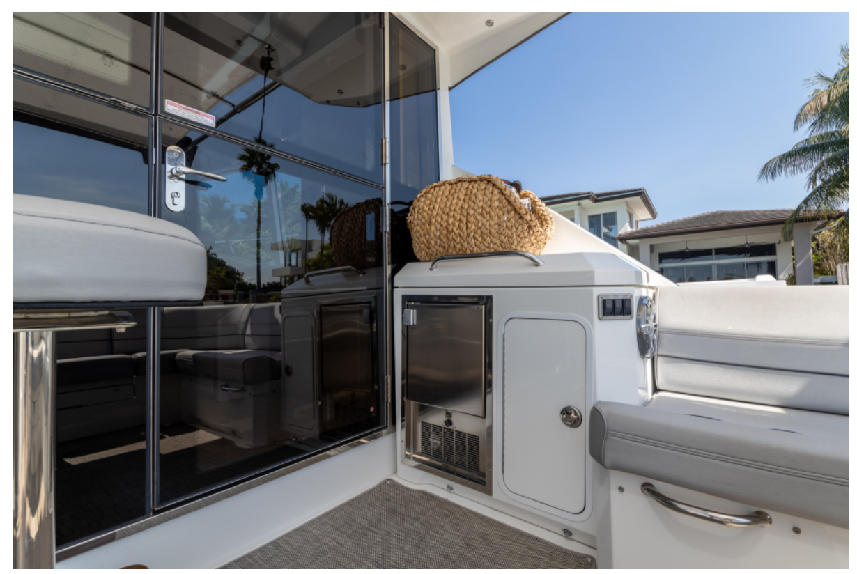
Cruisers 45 - Aft Deck 2018 Cruisers 45 Cantius - Insieme