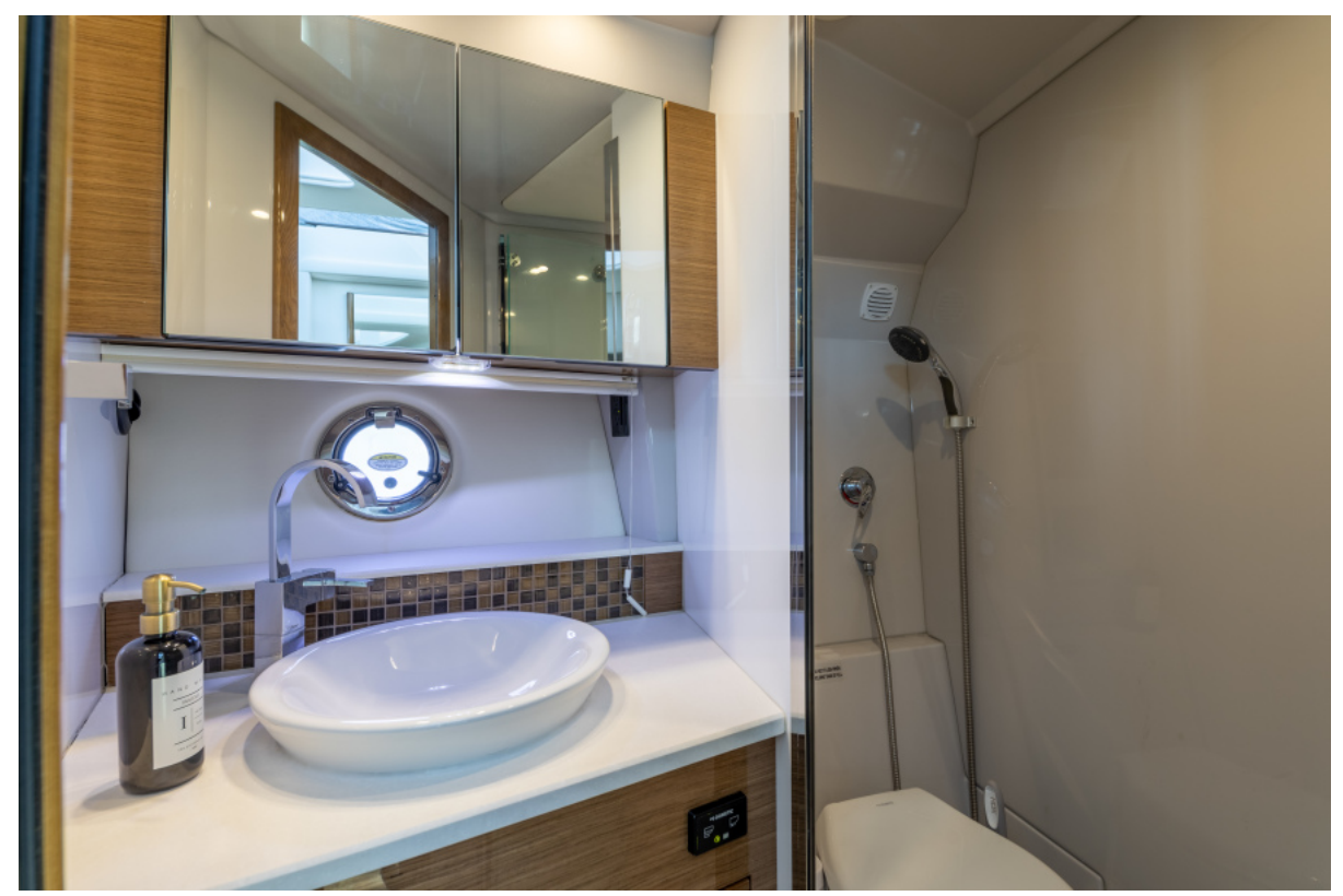
Cruisers 45 - Head 2018 Cruisers 45 Cantius - Insieme