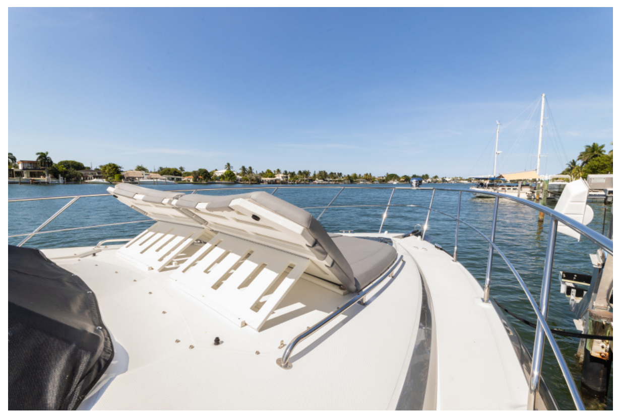
Cruisers 45 - Bow Sunpad 2018 Cruisers 45 Cantius - Insieme