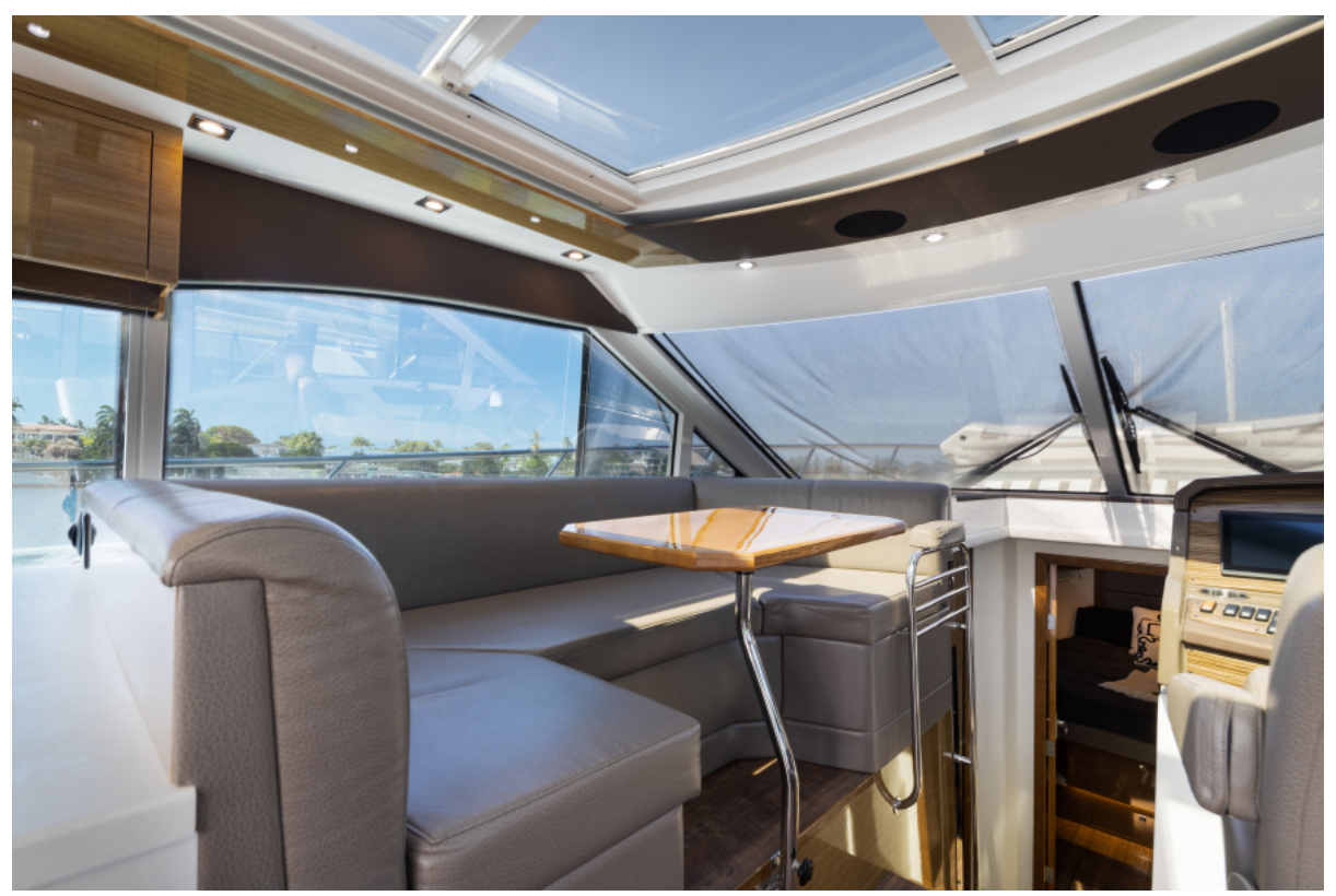
Cruisers 45 - Helm 2018 Cruisers 45 Cantius - Insieme