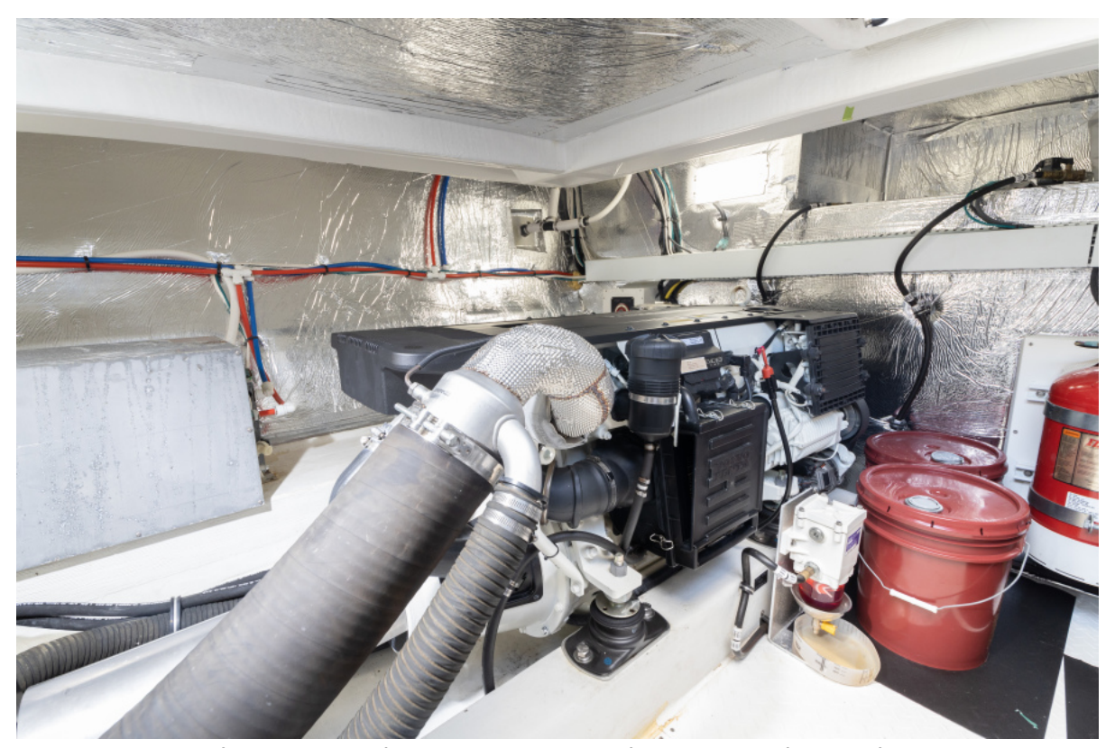
Cruisers 45 - Engine Room 2018 Cruisers 45 Cantius - Insieme