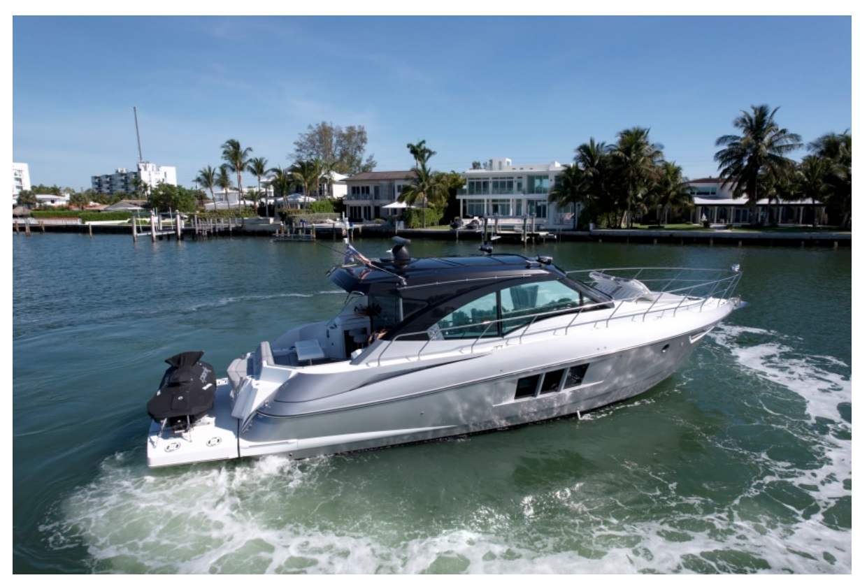
Cruisers 45 - Exterior Profile 2018 Cruisers 45 Cantius - Insieme