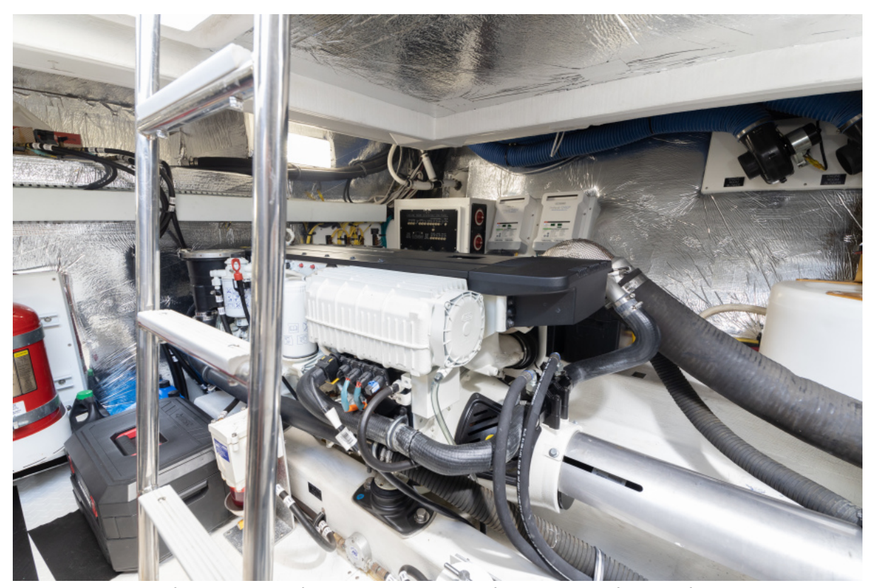
Cruisers 45 - Engine Room 2018 Cruisers 45 Cantius - Insieme