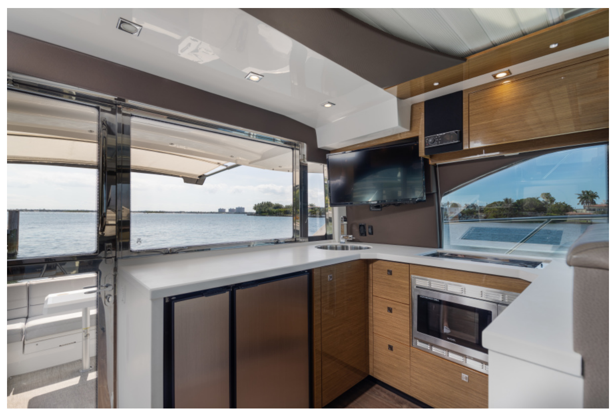
Cruisers 45 - Galley 2018 Cruisers 45 Cantius - Insieme