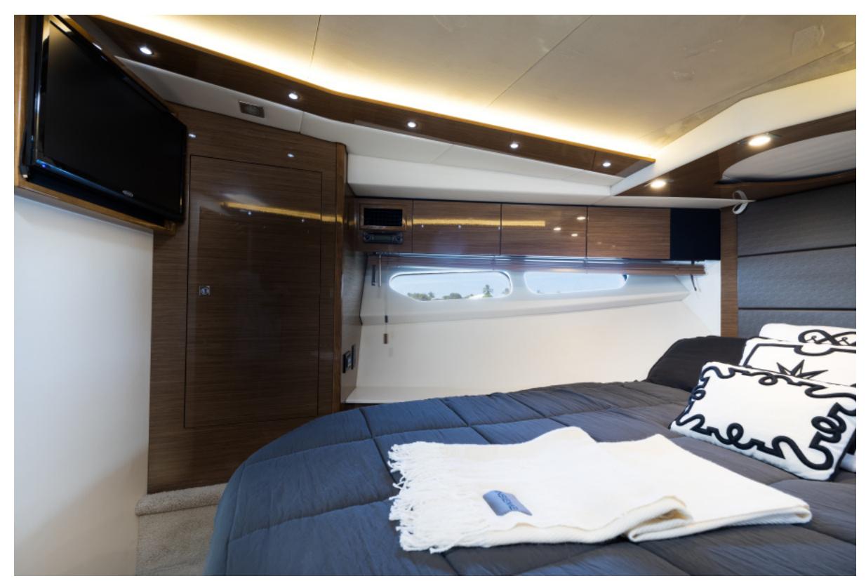
Cruisers 45 - Master Stateroom 2018 Cruisers 45 Cantius - Insieme