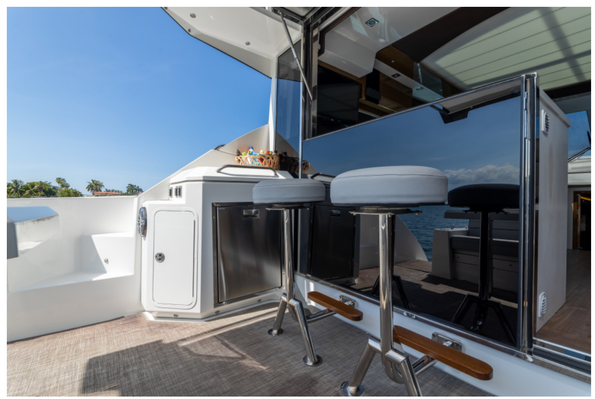
Cruisers 45 - Aft Deck Bar 2018 Cruisers 45 Cantius - Insieme