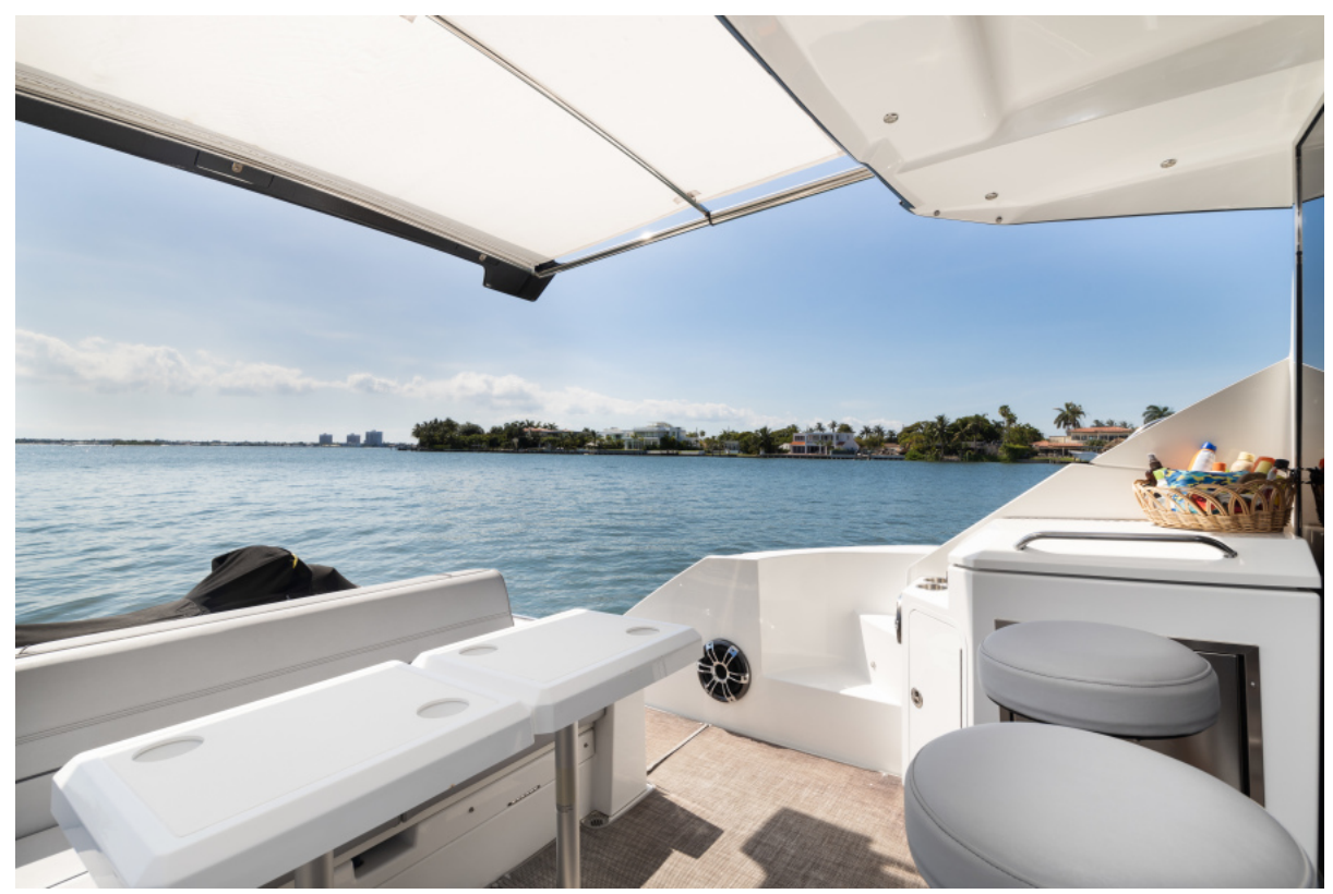
Cruisers 45 - Aft Deck 2018 Cruisers 45 Cantius - Insieme