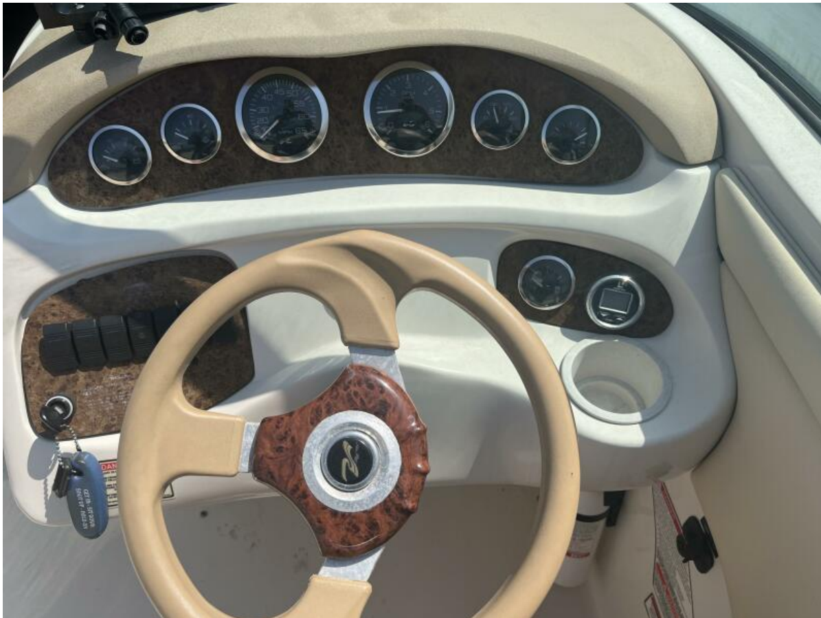
Helm Smart Gauges