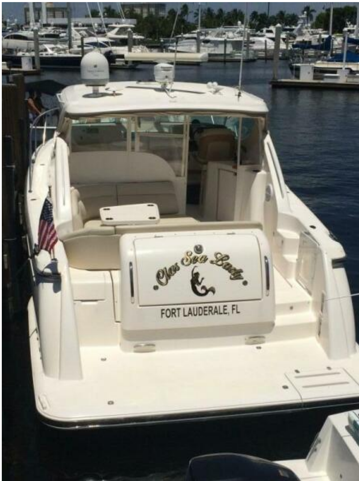
CLAS SEA LADY