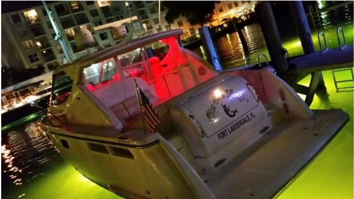
CLAS SEA LADY