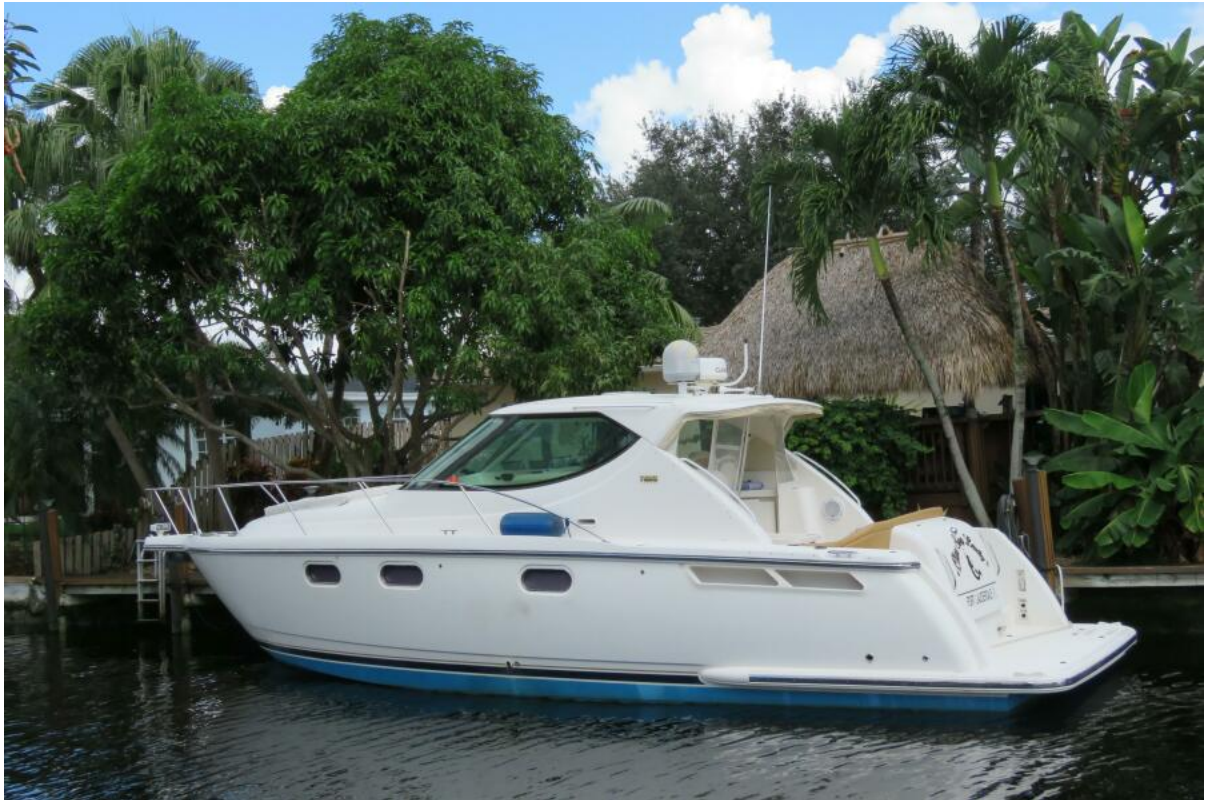
CLAS SEA LADY