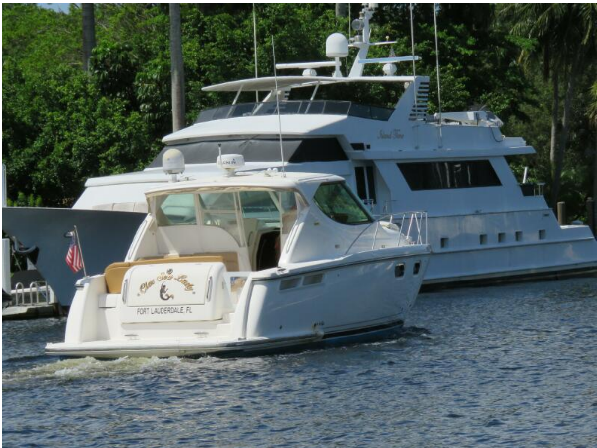
CLAS SEA LADY