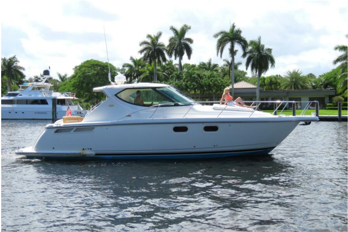
CLAS SEA LADY