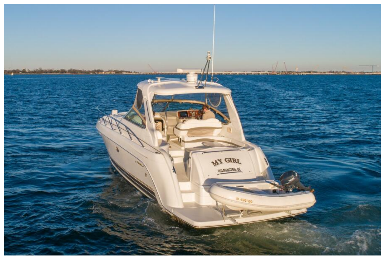
2004 Formula 40 8