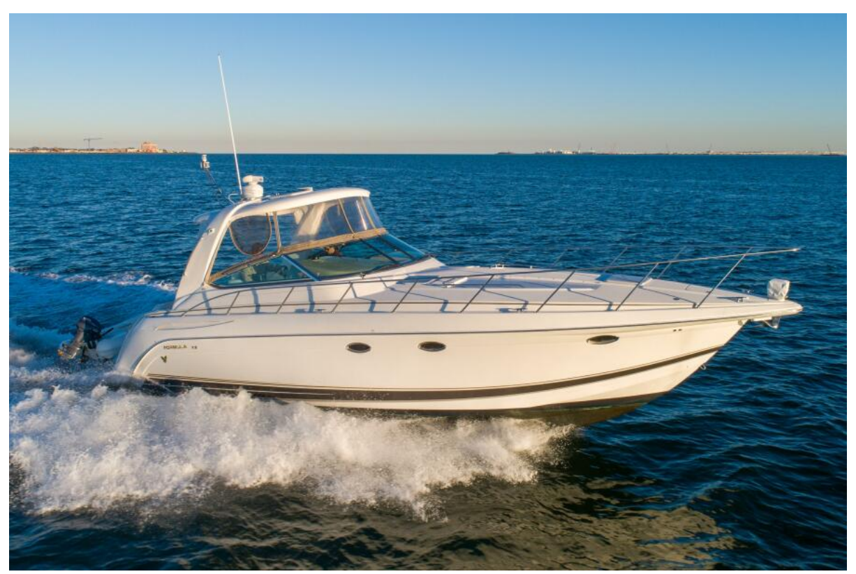
2004 Formula 40 1