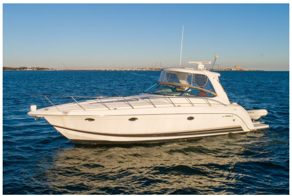
2004 Formula 40 3