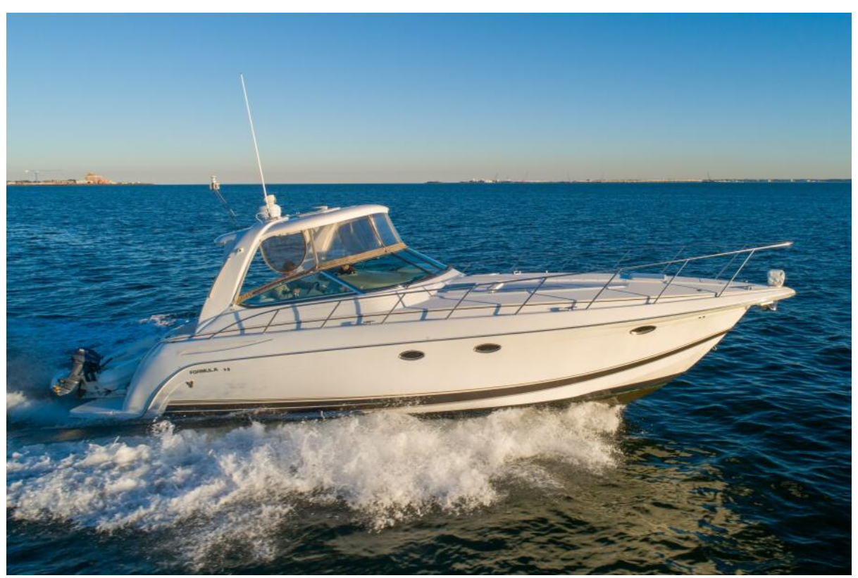
2004 Formula 40 7