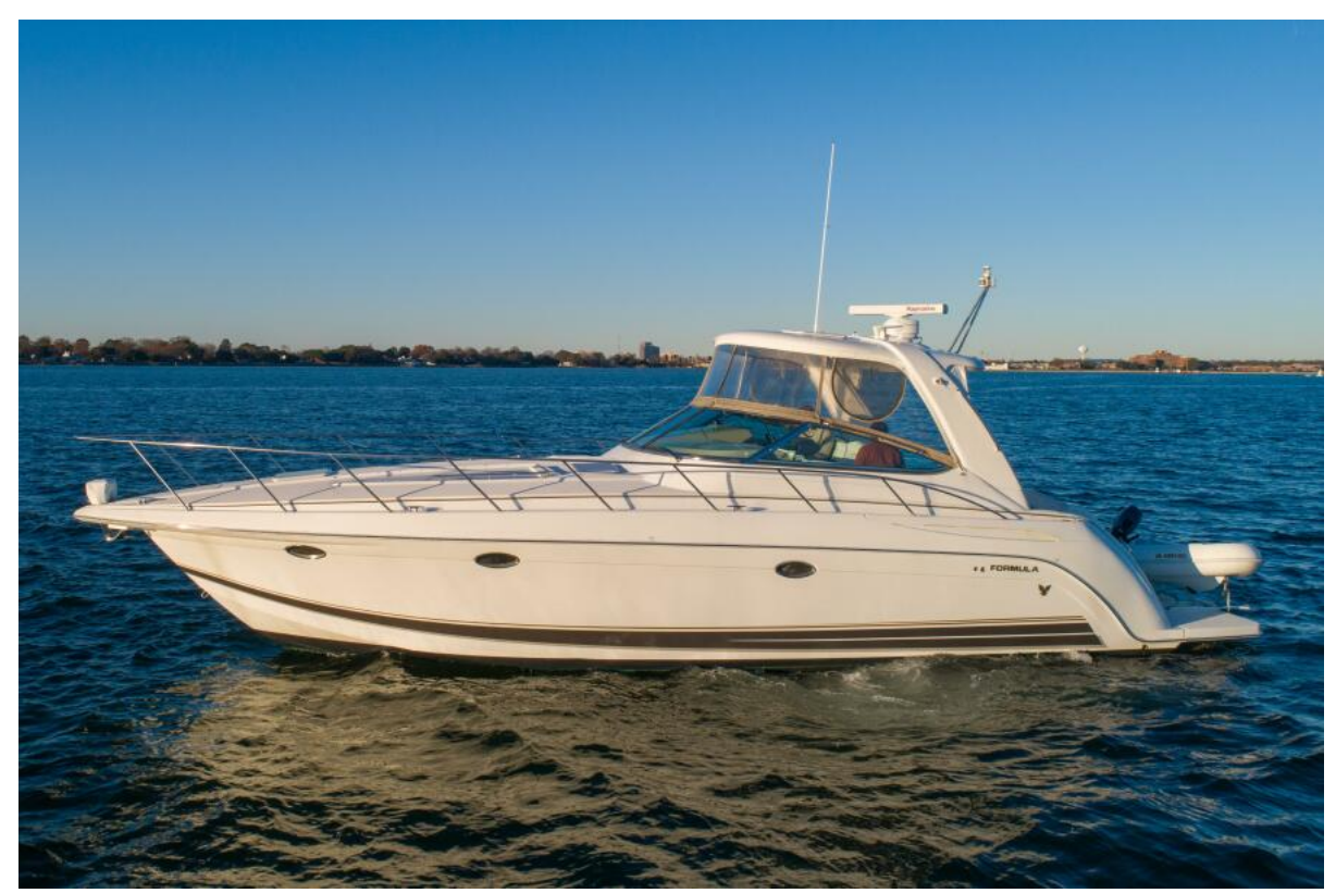
2004 Formula 40 4