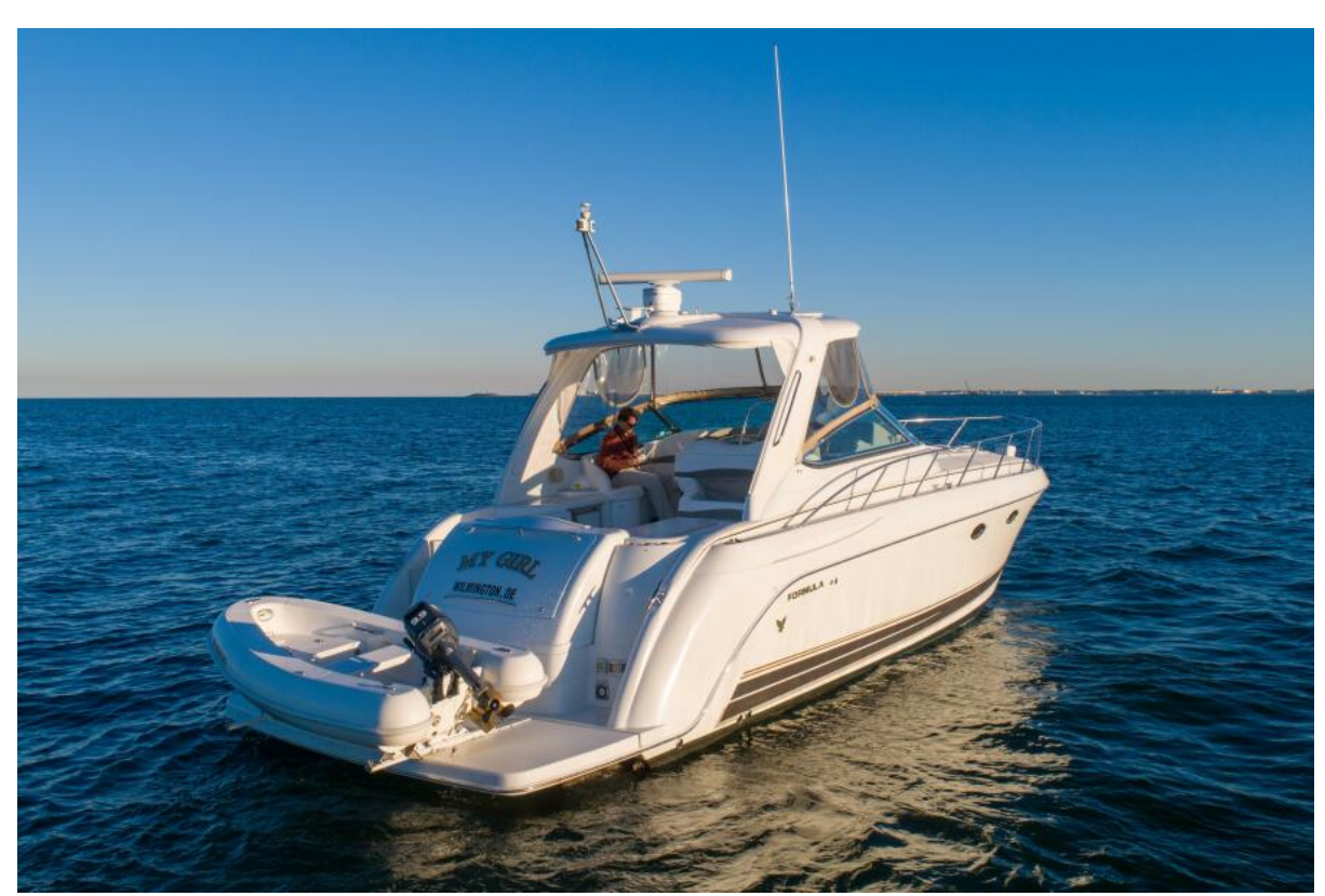
2004 Formula 40 9