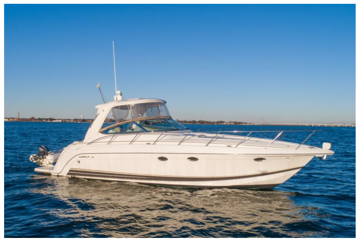
2004 Formula 40 5