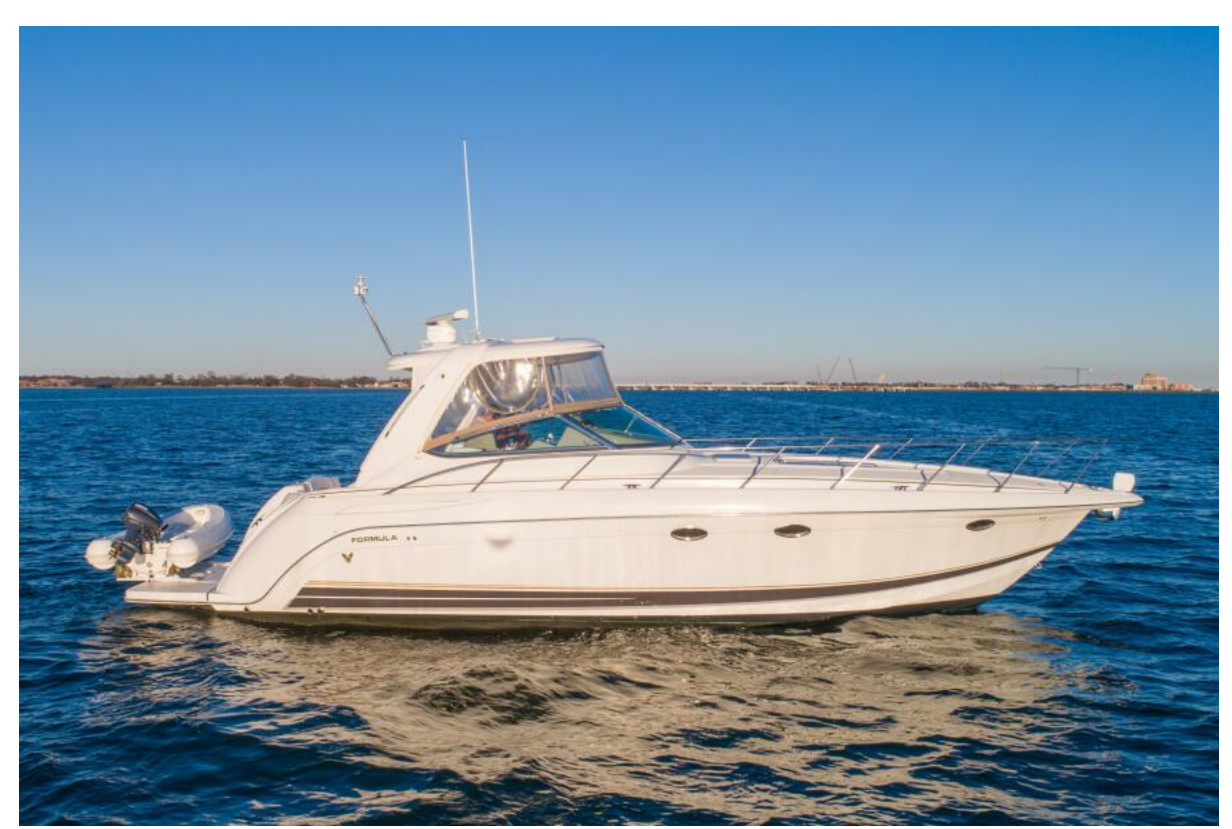
2004 Formula 40 6