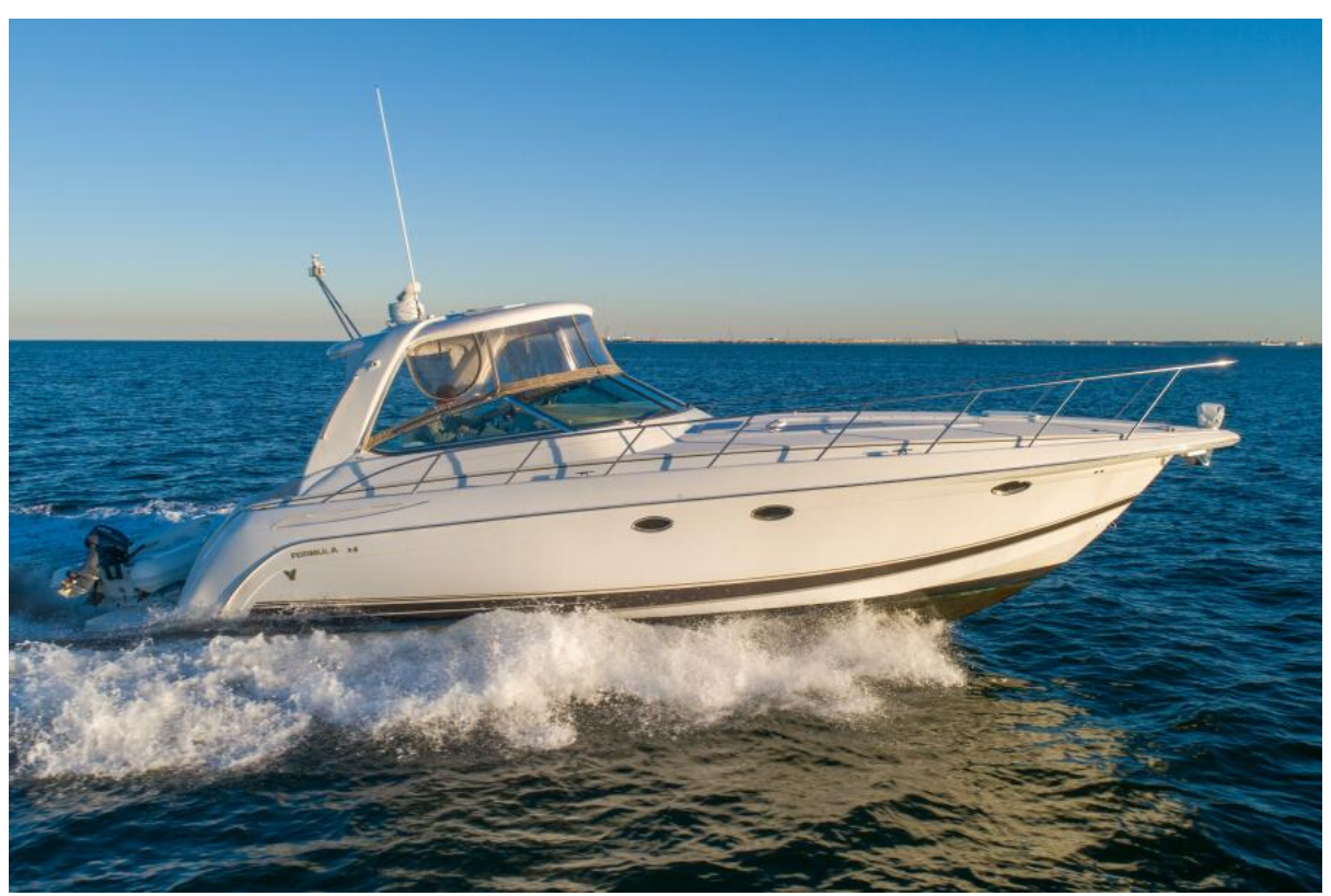
2004 Formula 40 2