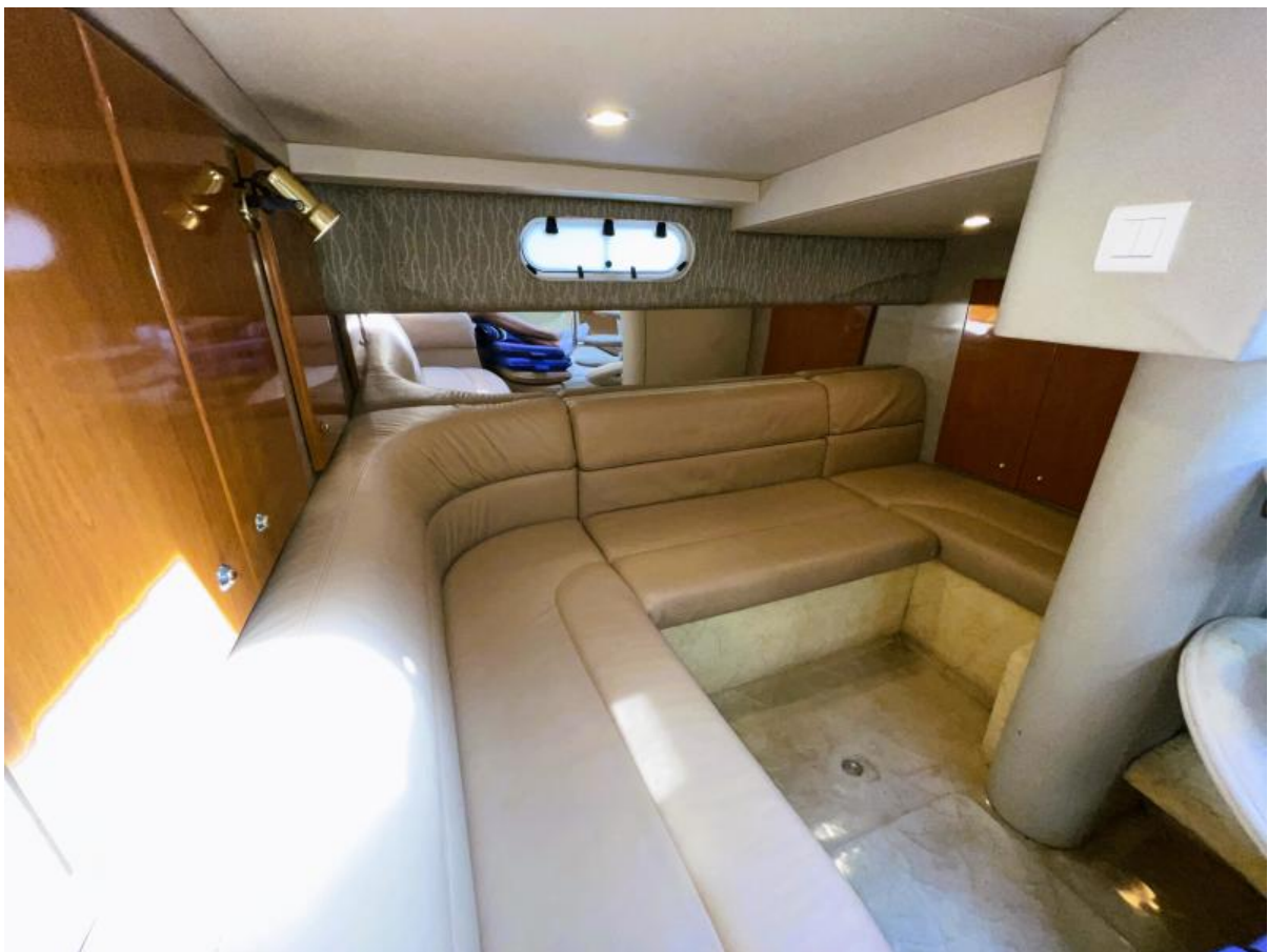
2004 Formula (9)