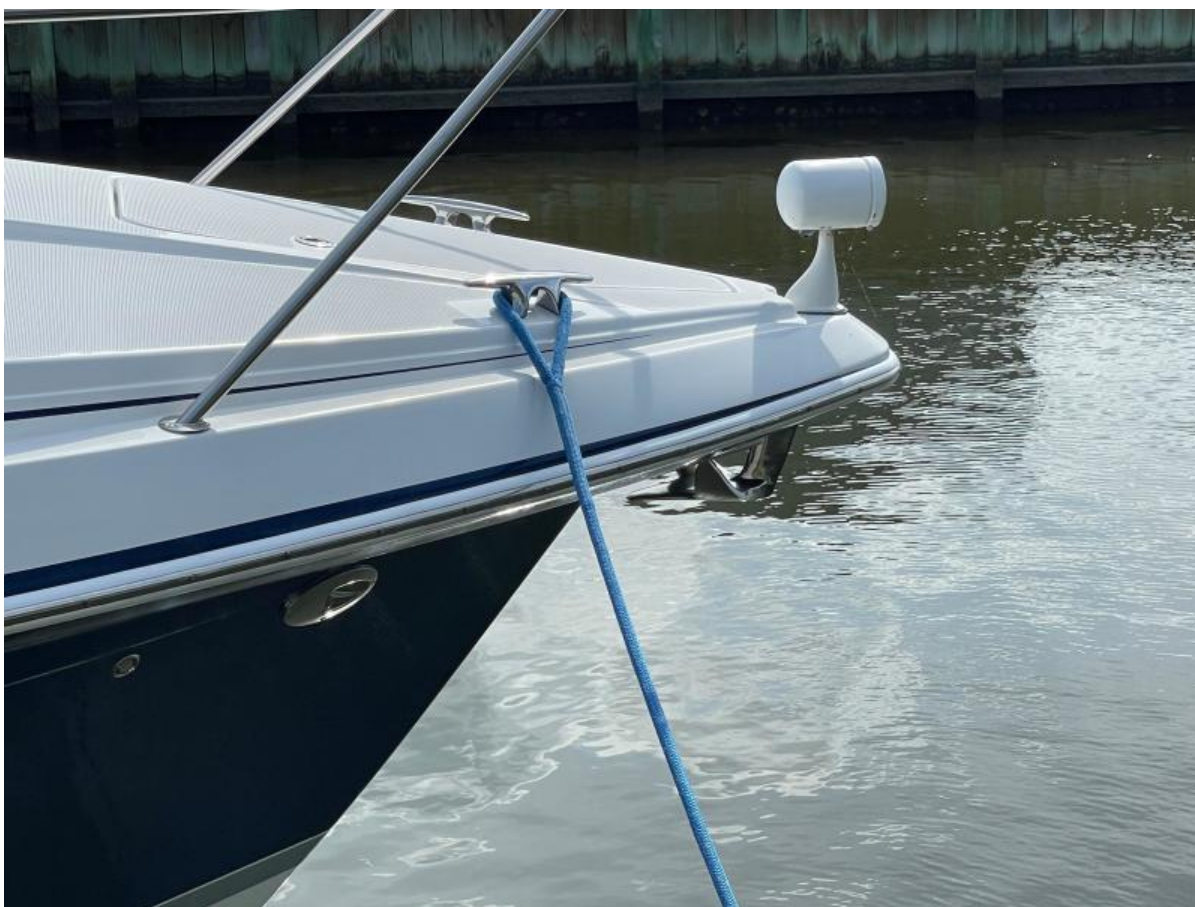
2004 Formula (16)