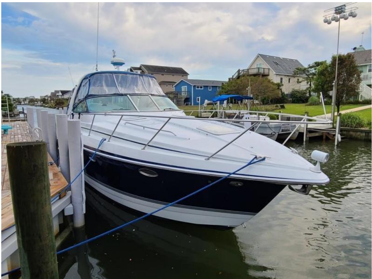
2004 Formula (1)