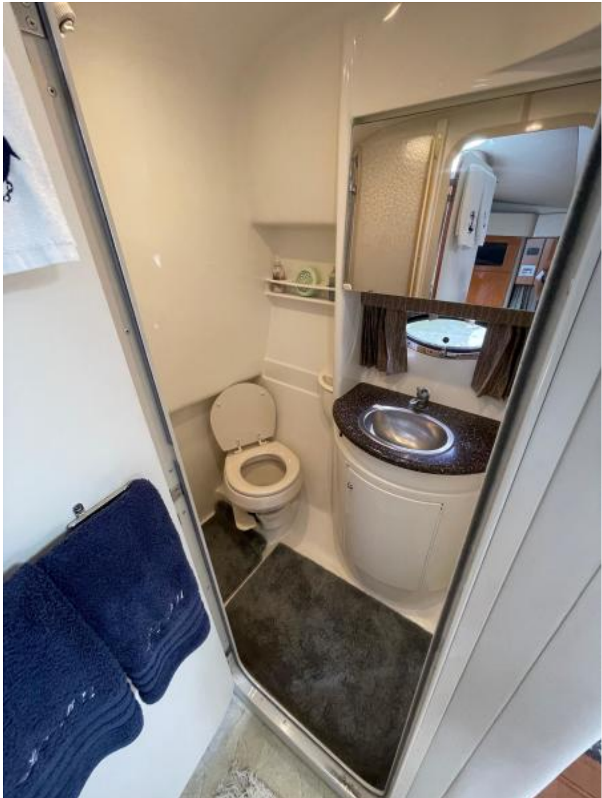
2004 Formula (10)