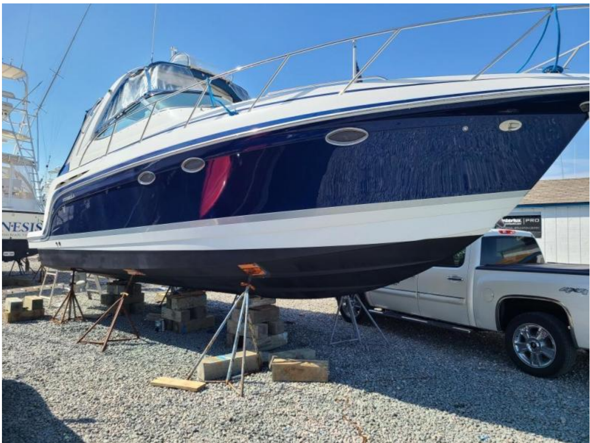
2004 Formula (3)