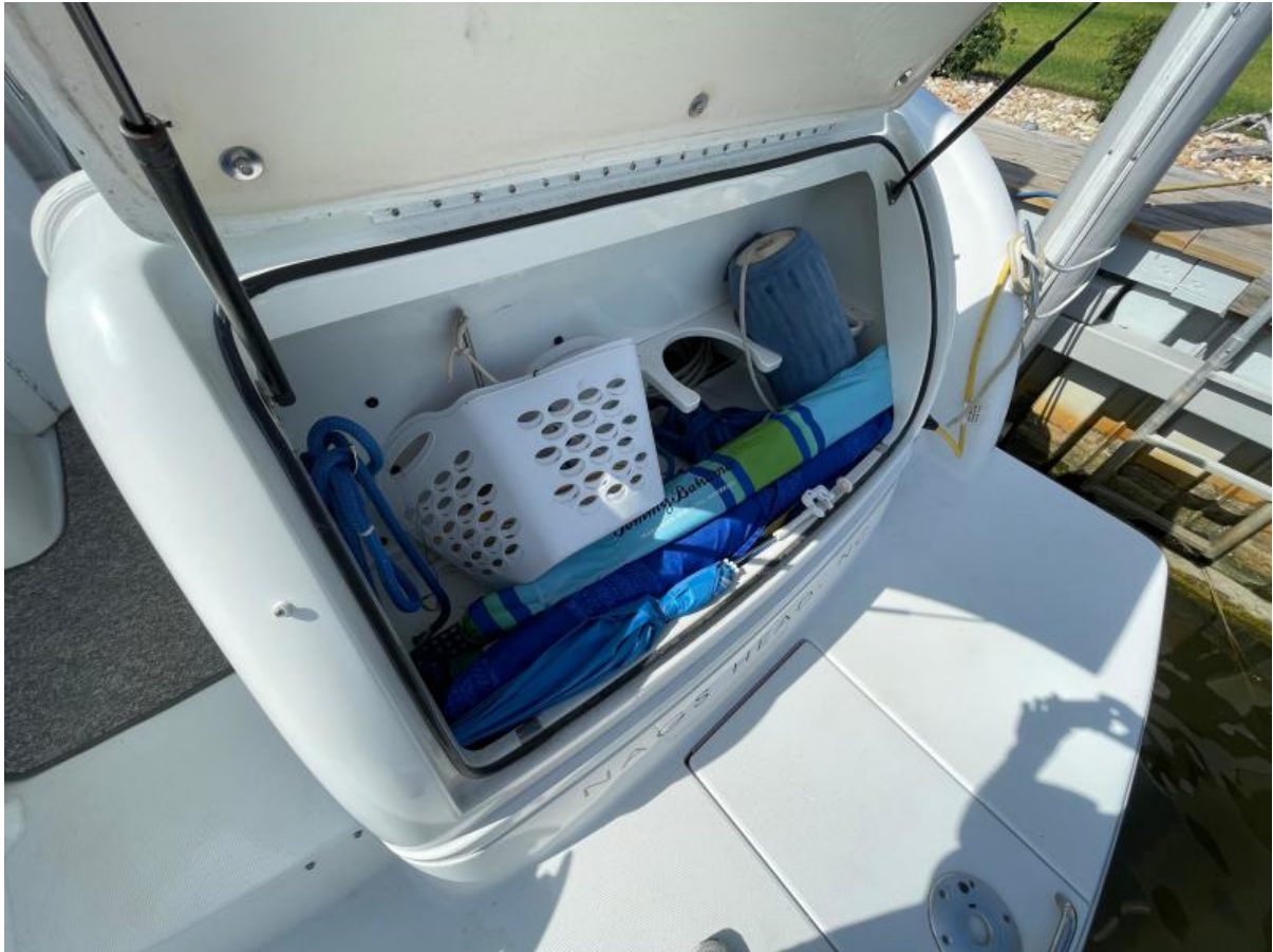
2004 Formula (11)