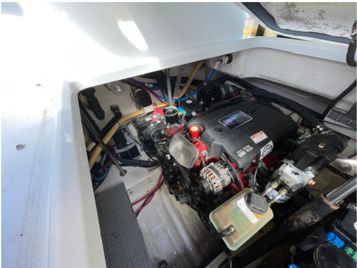
2004 Formula (14)