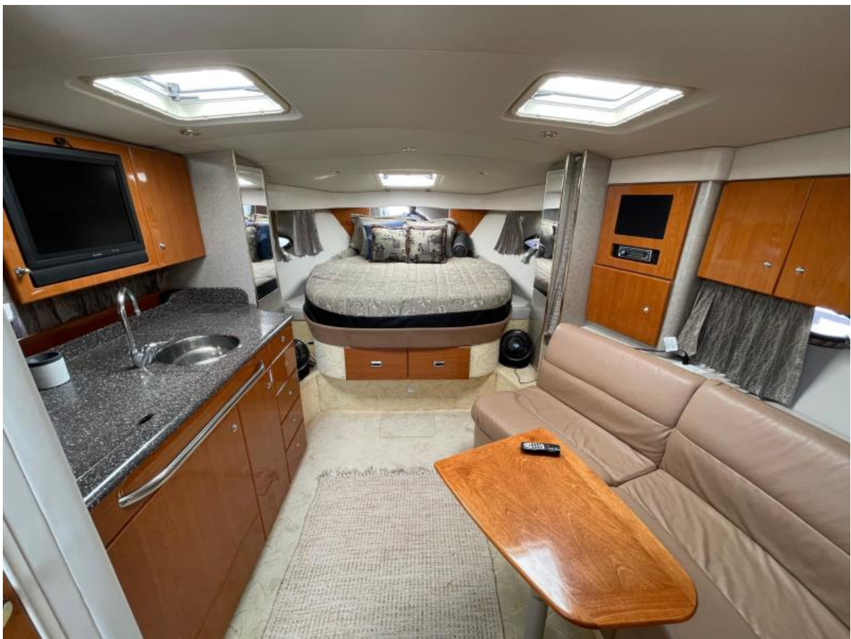
2004 Formula (7)