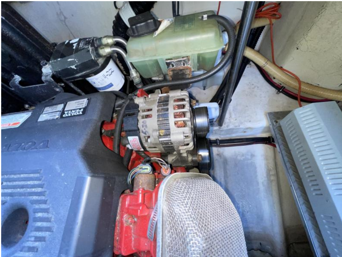
2004 Formula (15)