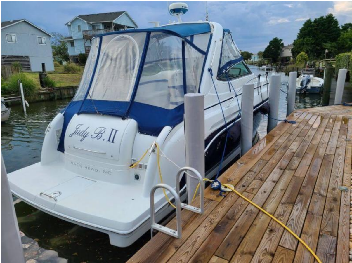
2004 Formula (2)