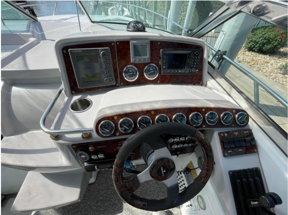
2004 Formula (6)