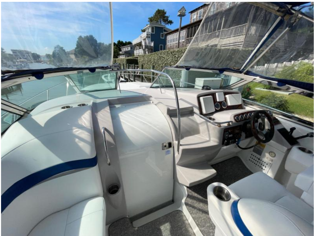
2004 Formula (5)