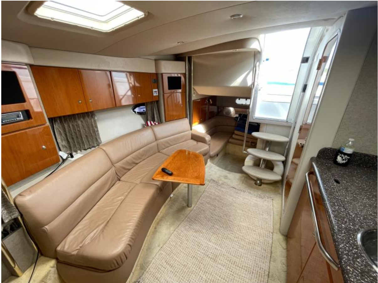
2004 Formula (8)