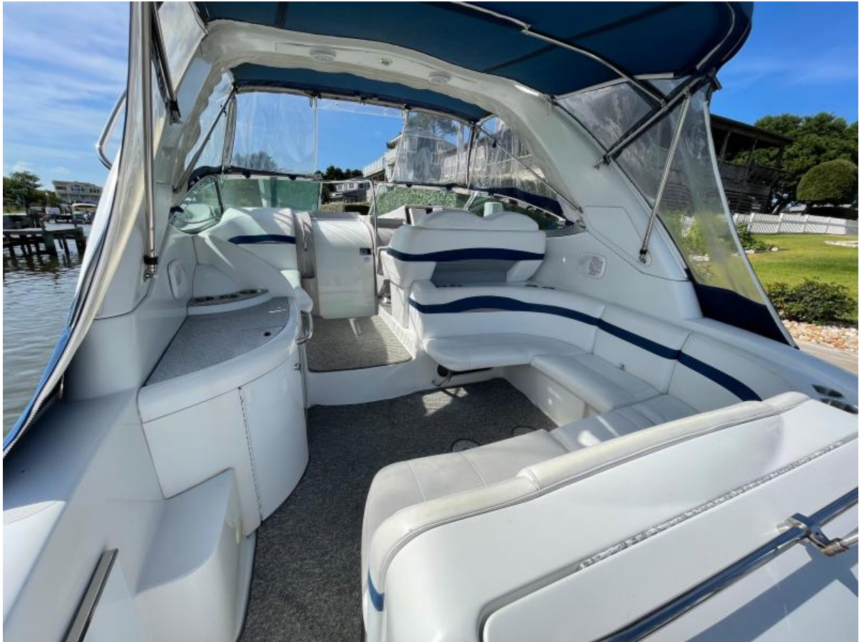
2004 Formula (4)