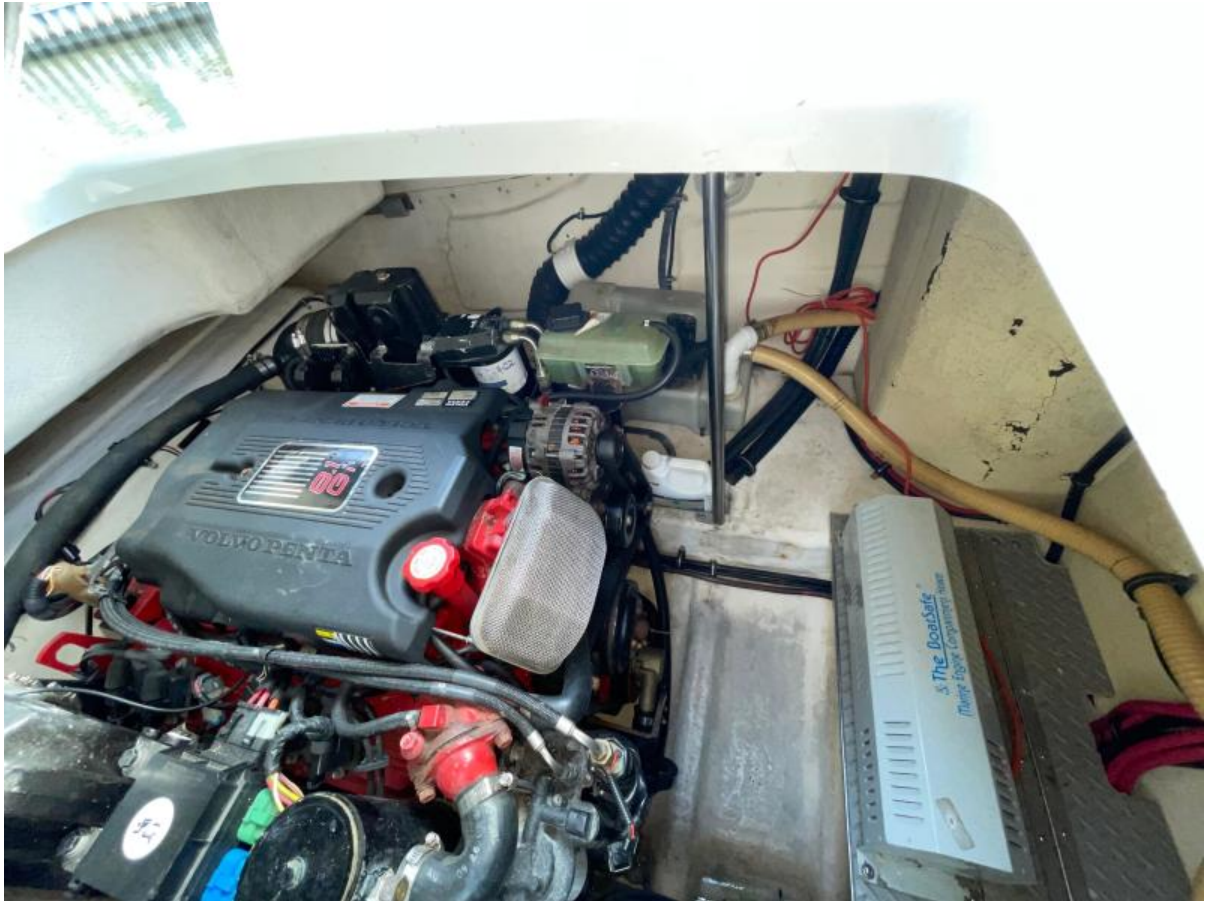
2004 Formula (13)