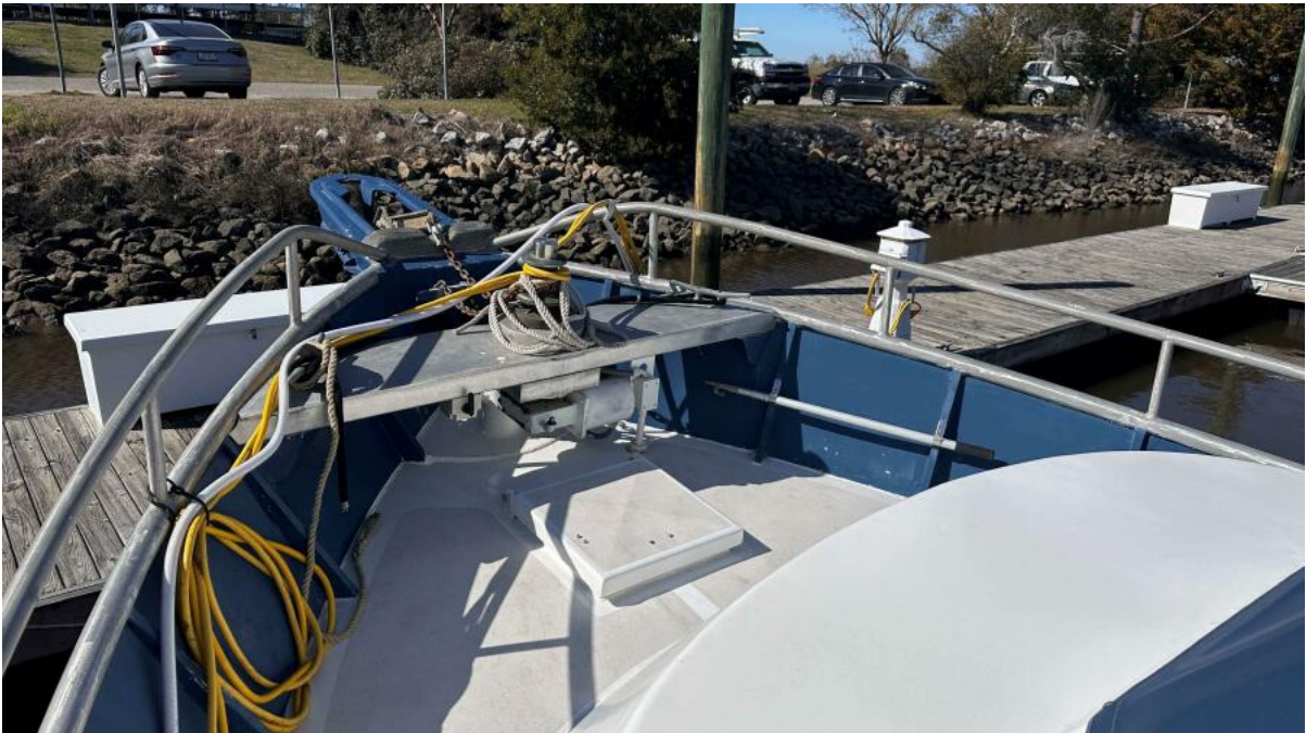
1024 Sally Lynn Foredeck