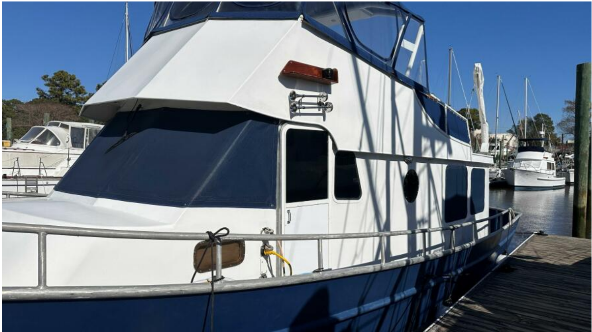
1008 Sally Lynn