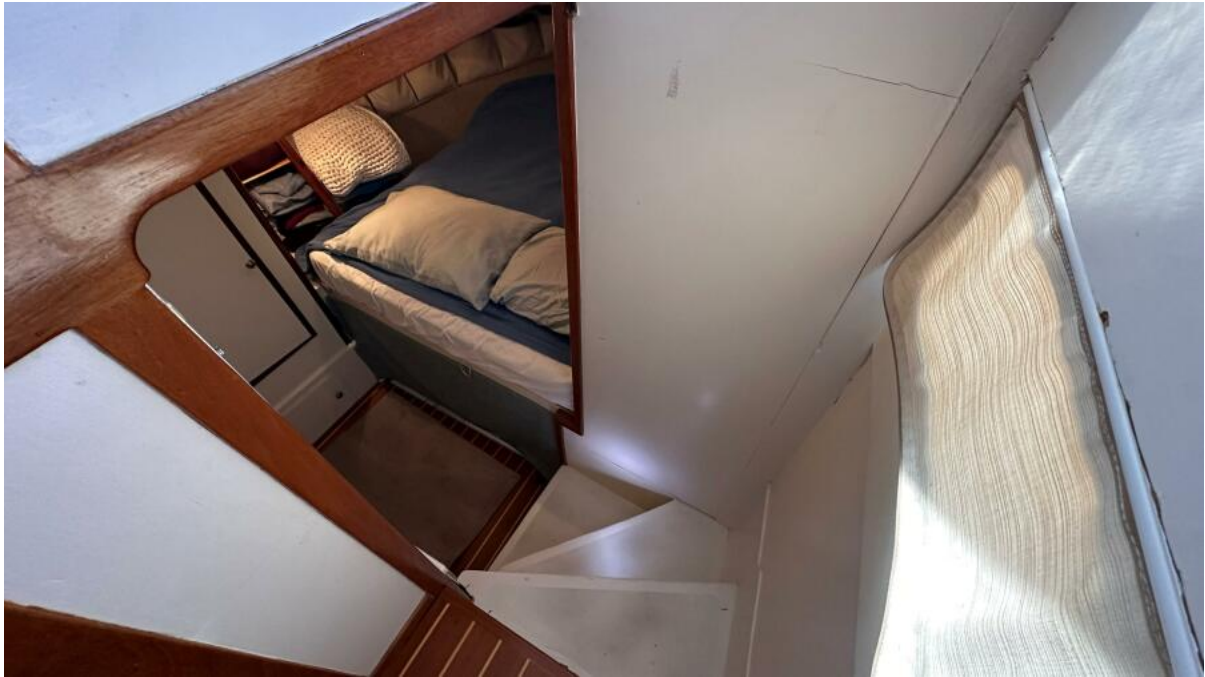
1080 Sally Lynn Foreward Cabin