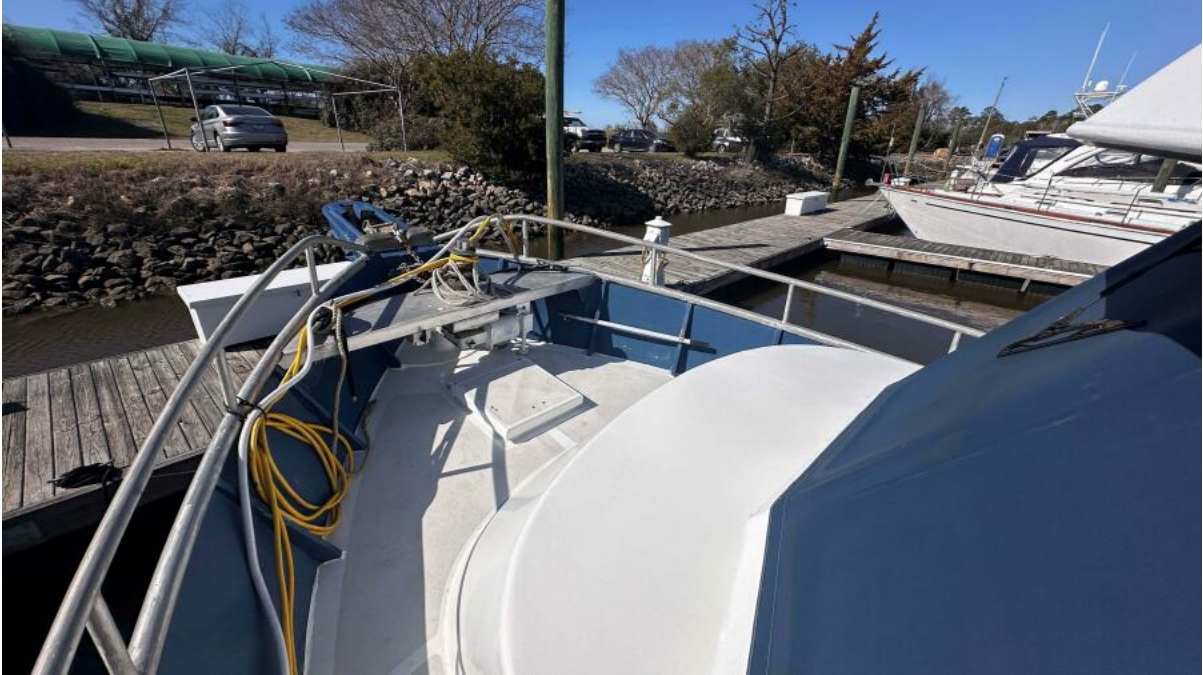
1022 Sally Lynn Foredeck