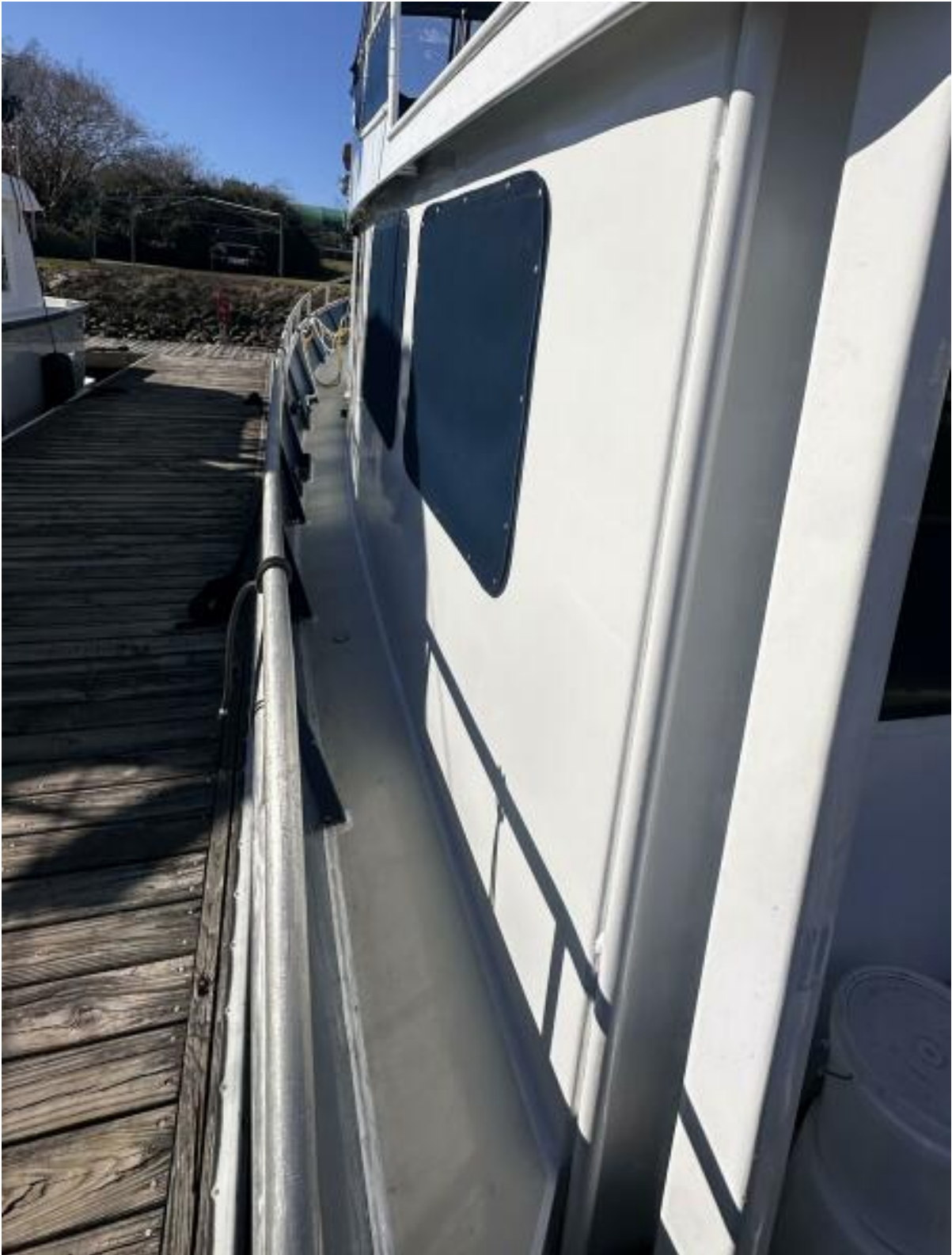
1016 Sally Lynn Sidedeck