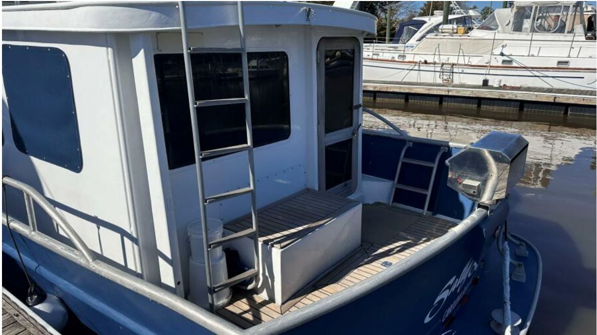
1010 Sally Lynn