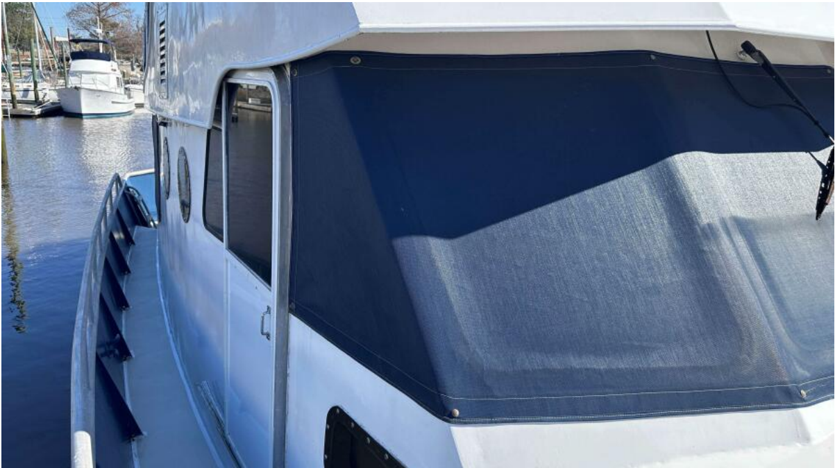
1028 Sally Lynn Sidedeck