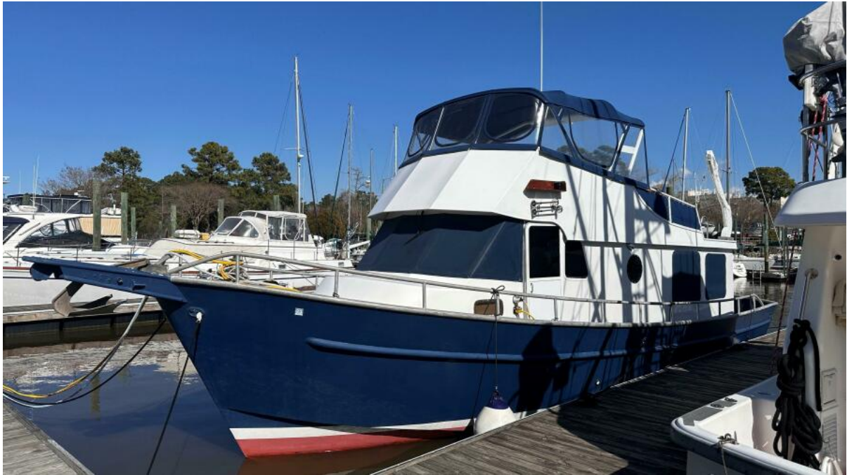
1002 Sally Lynn 1972 Island Trader 42