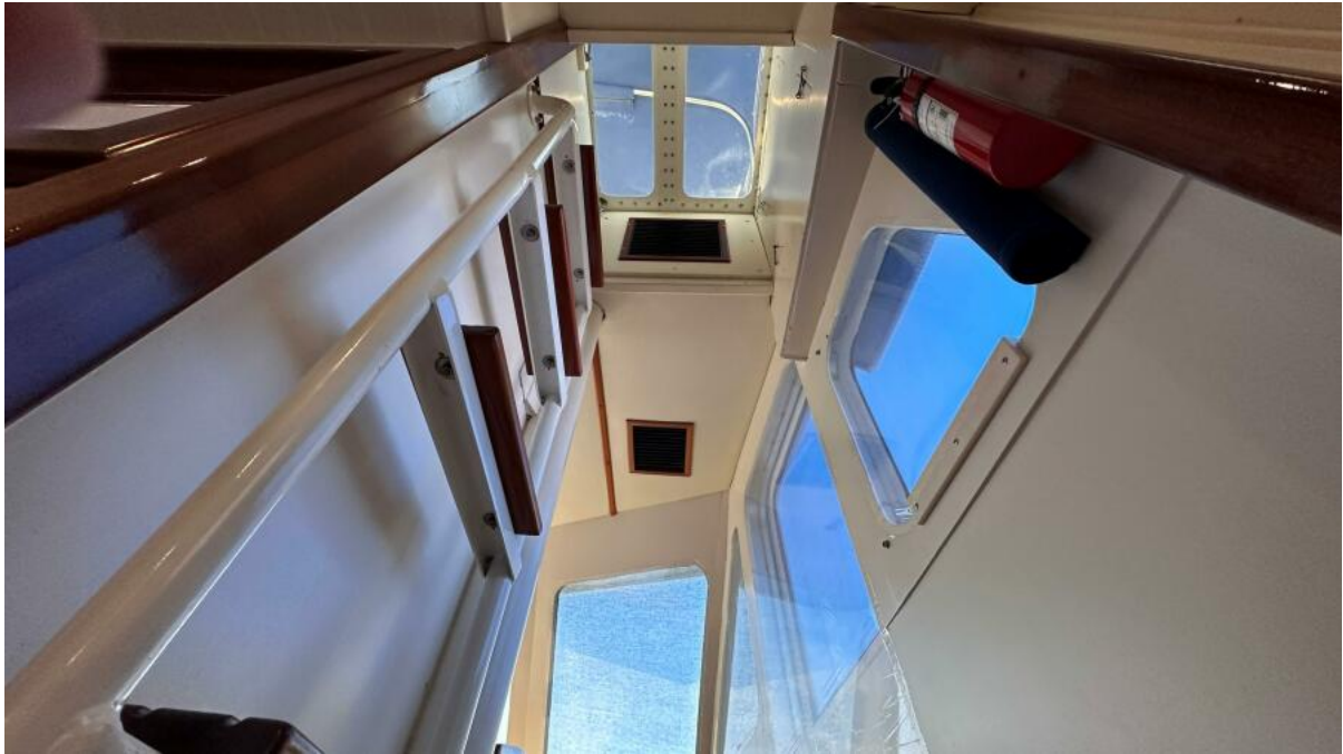
1070 Sally Lynn Companionway