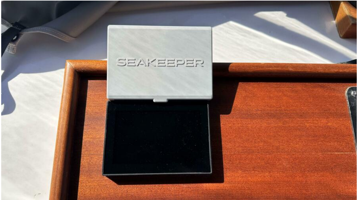
1040 Sally Lynn Upper Helm Stabilizer Controls