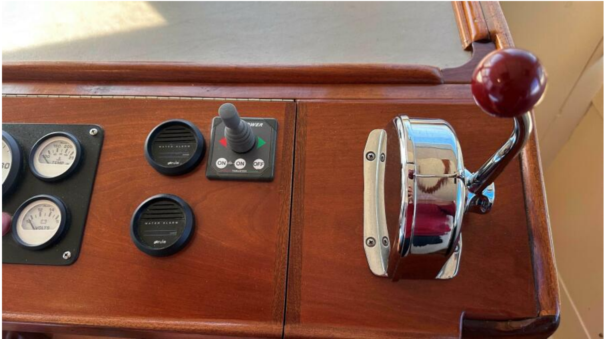
1076 Sally Lynn Lower Helm Controls