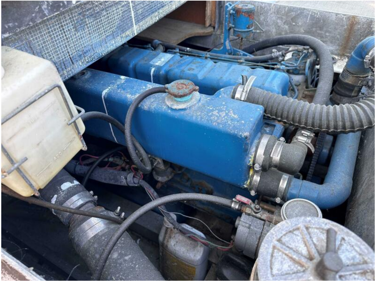
1100 Sally Lynn Engine