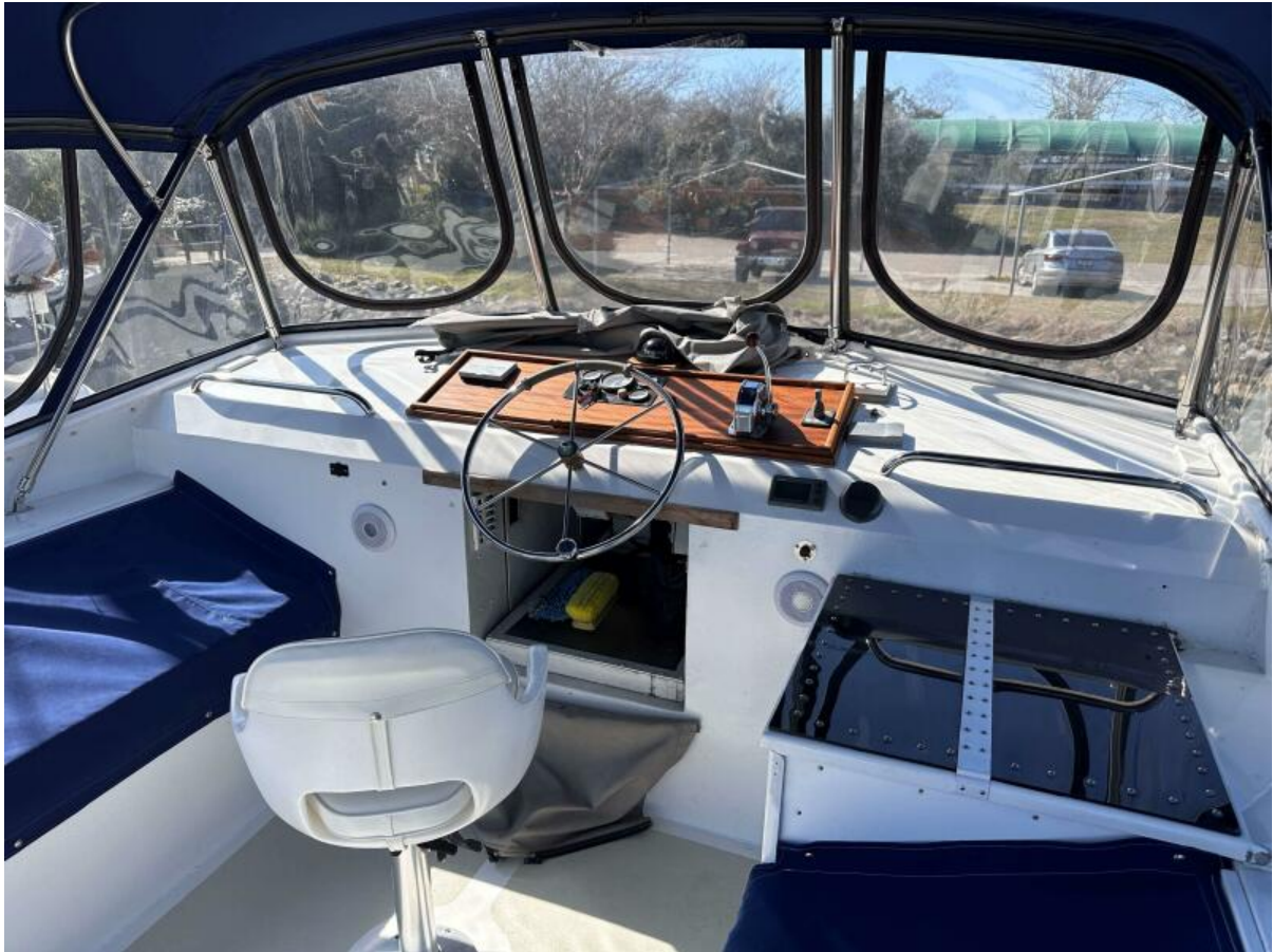
1034 Sally Lynn Upper Helm