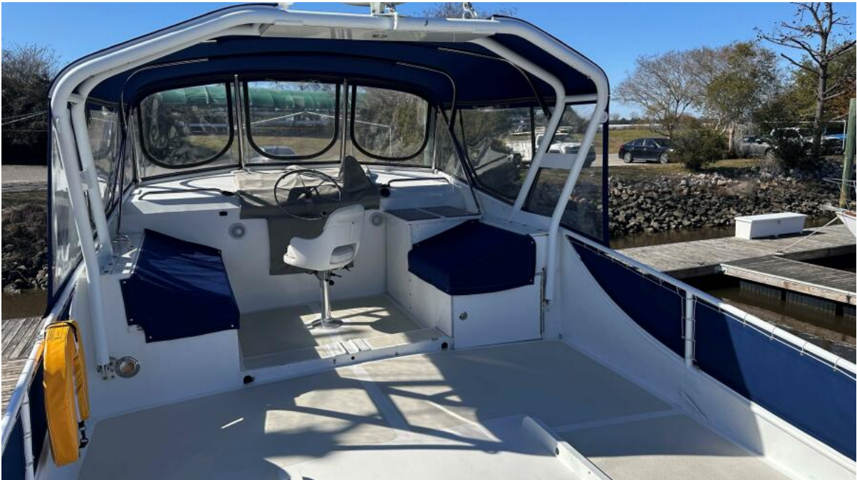
1032 Sally Lynn Flybridge