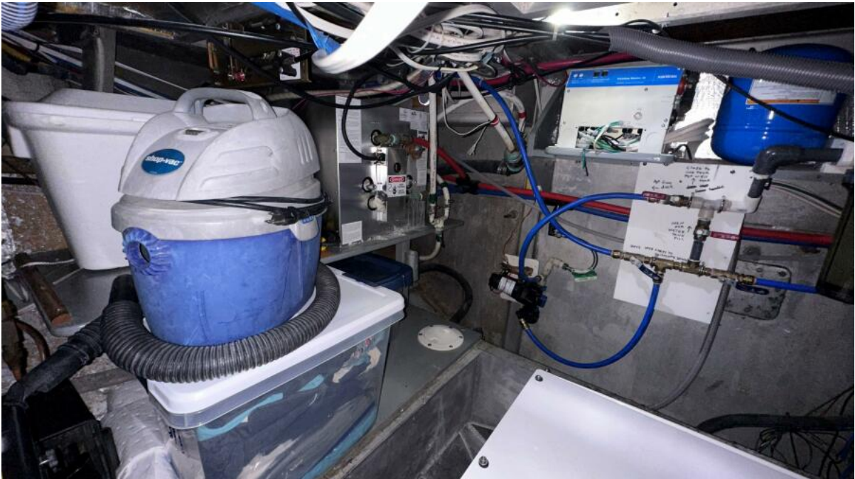
1091 Sally Lynn Mechanical Compartment