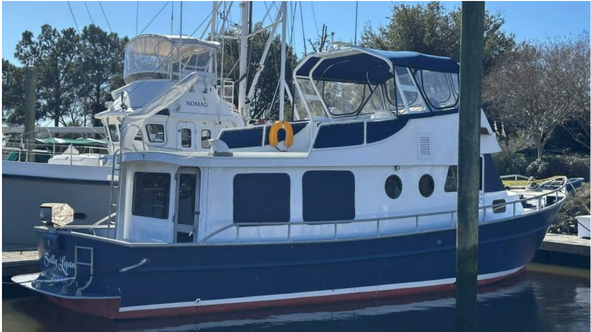
1006 Sally Lynn