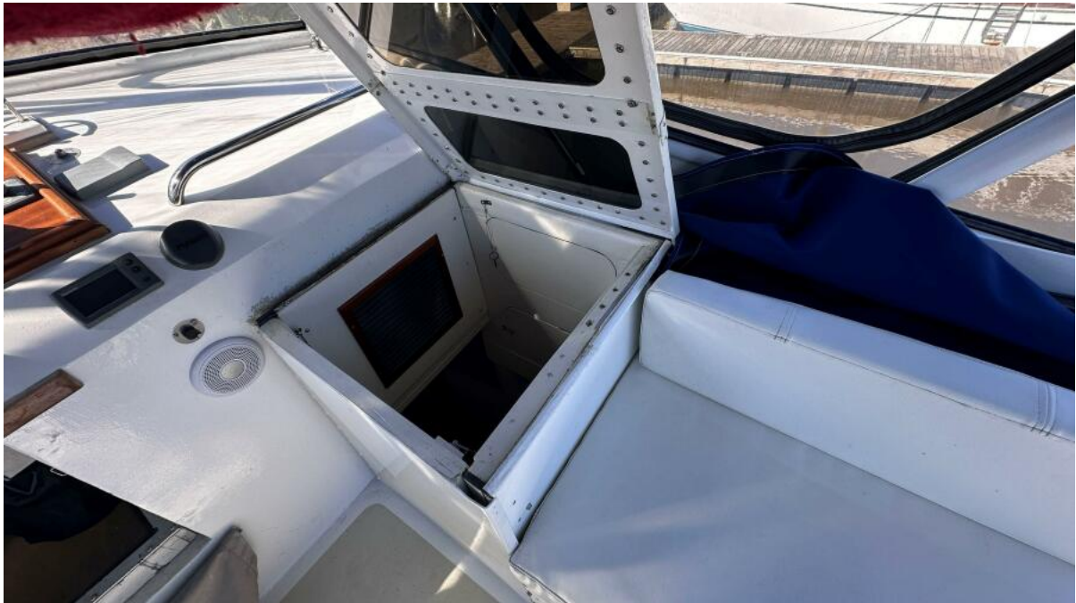
1042 Sally Lynn Companionway