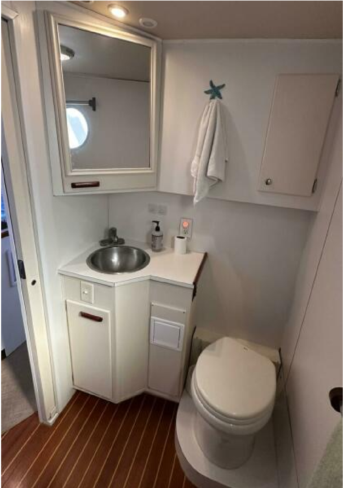
1068 Sally Lynn Head