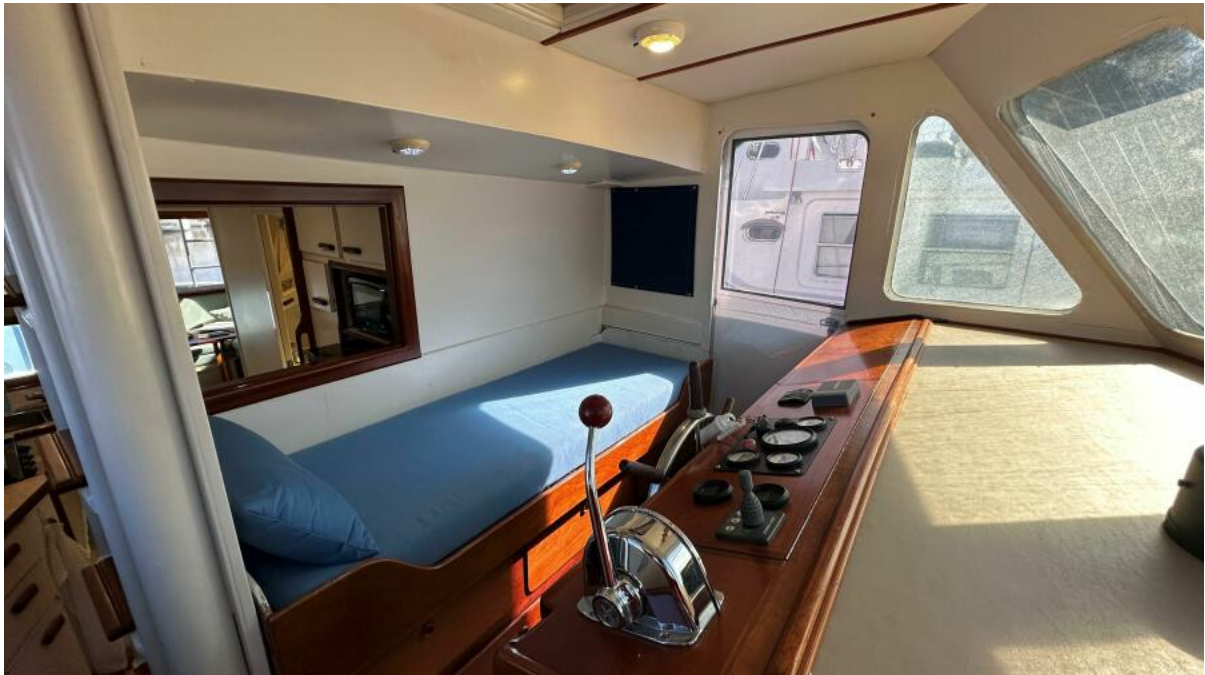
1072 Sally Lyn Pilot House