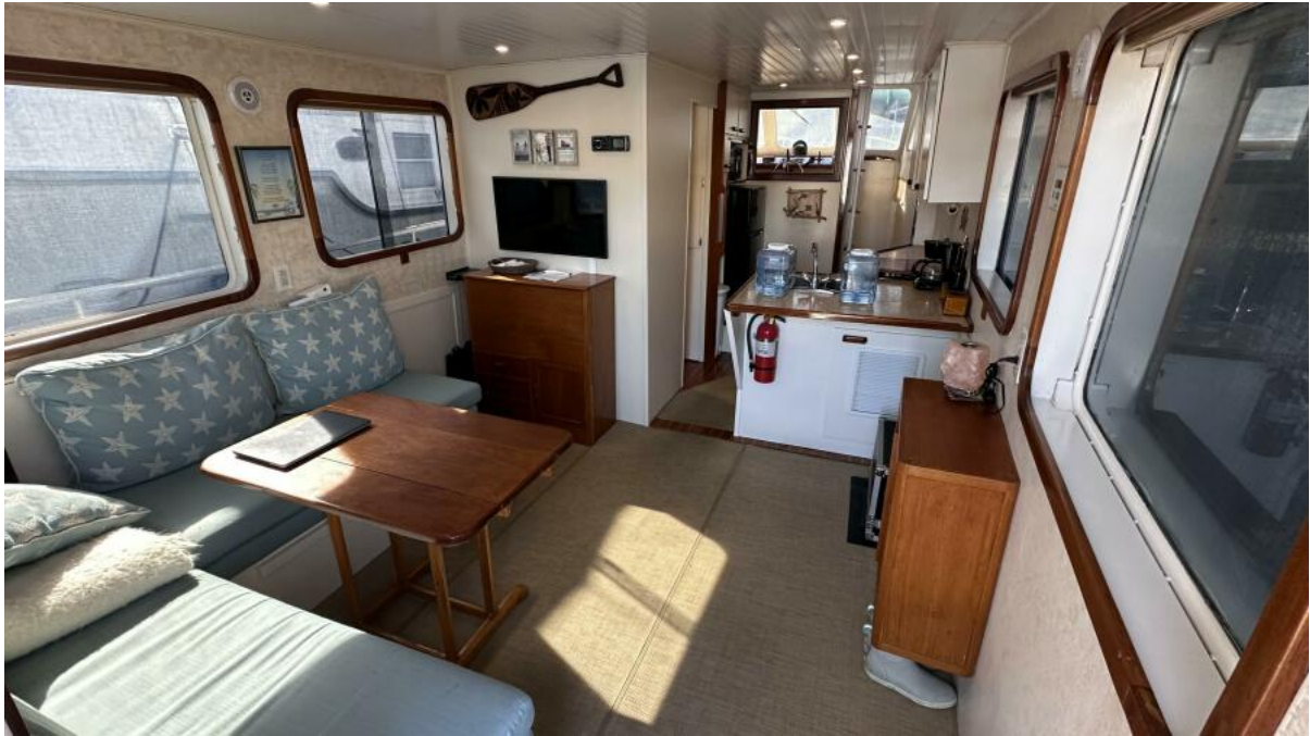
1050 Sally Lynn Salon