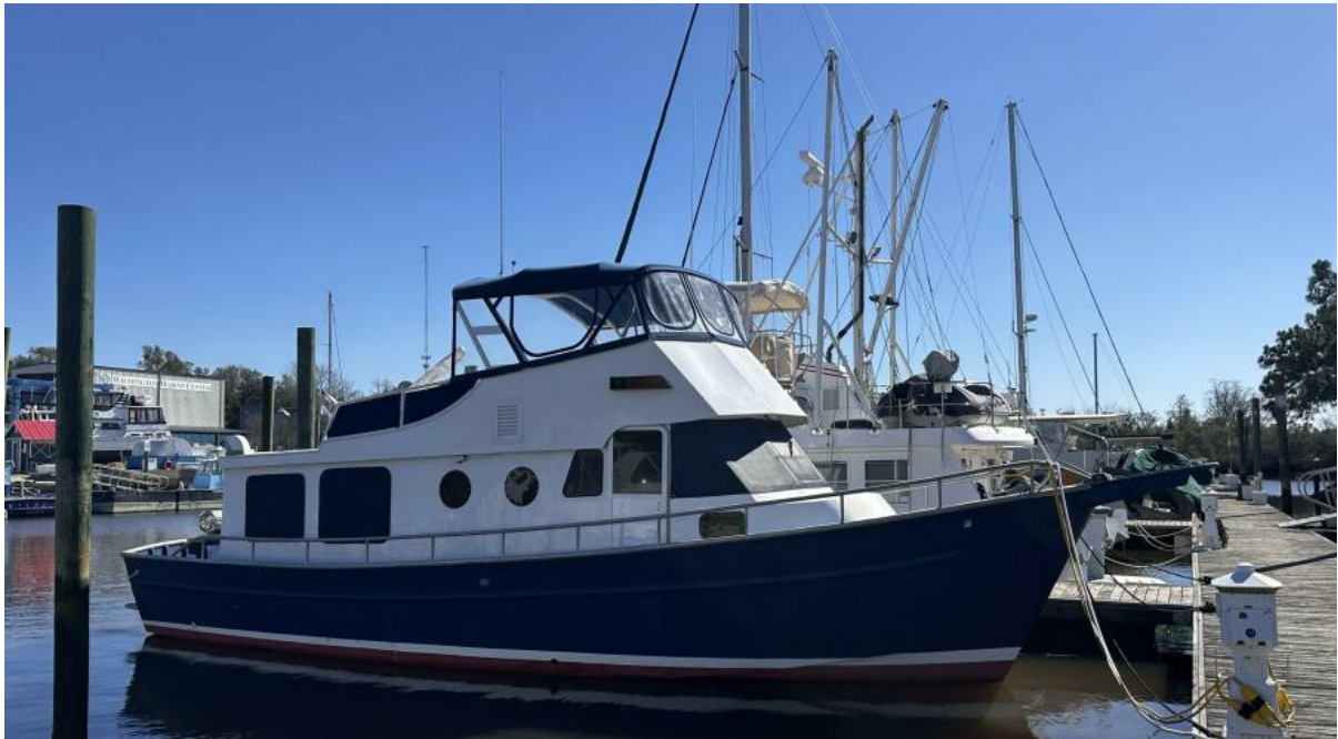
1004 Sally Lynn