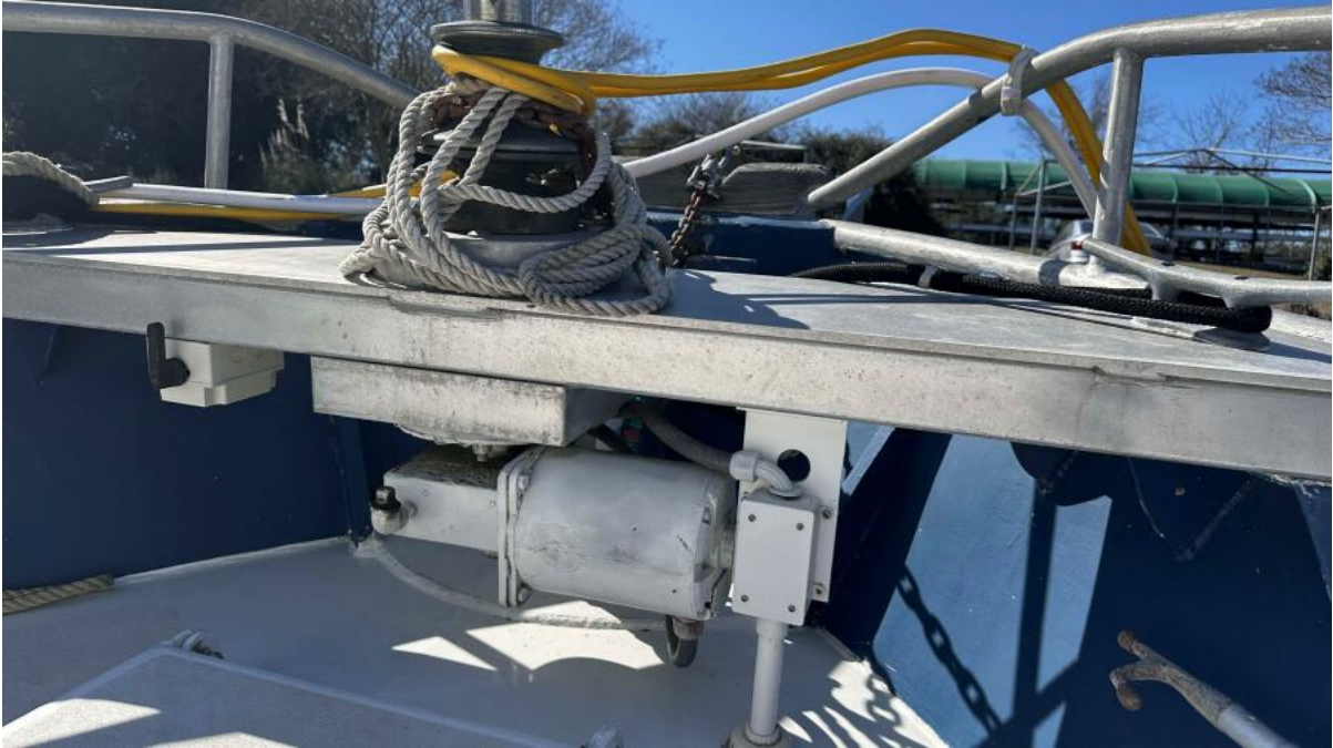
1026 Sally Lynn Windlass