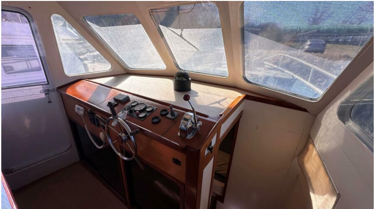
1074 Sally Lynn Lower Helm