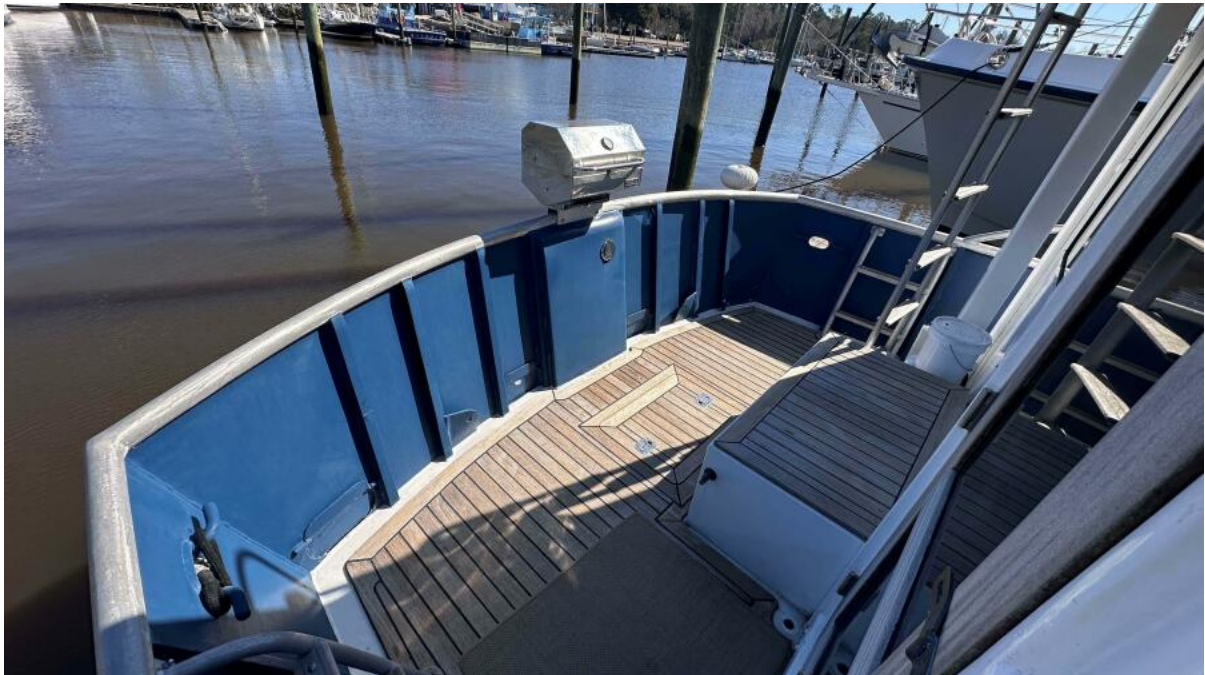
1012 Sally Lynn