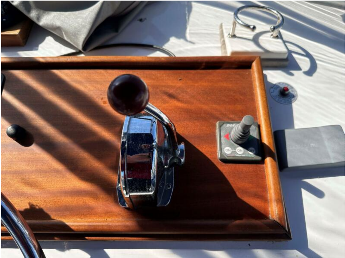
1036 Sally Lynn Upper Helm Controls