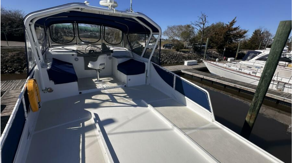
1030 Sally Lynn Sundeck