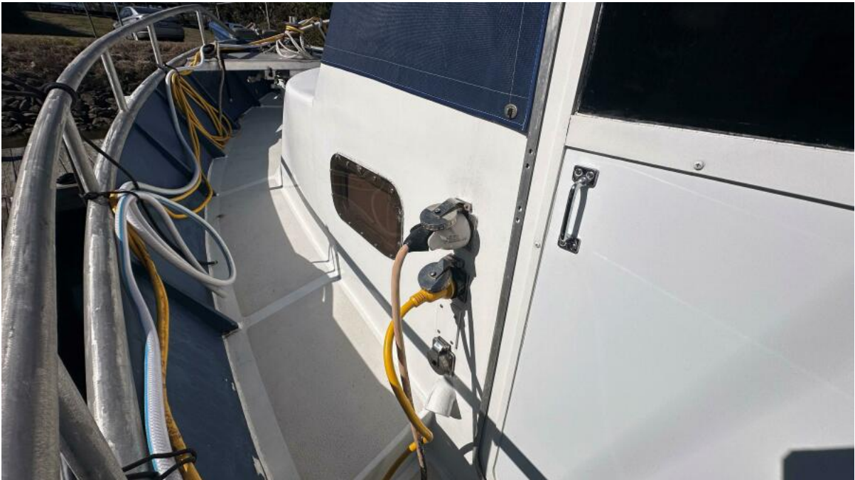
1020 Sally Lynn Sidedeck