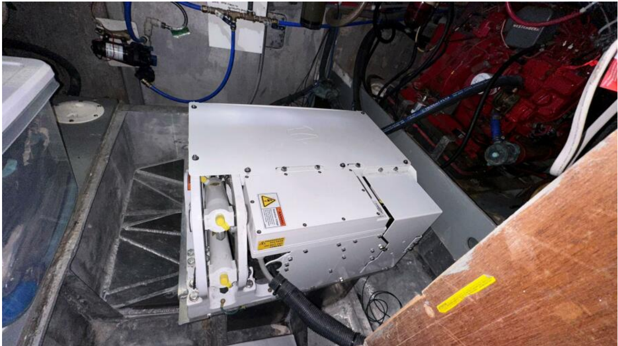
1094 Sally Lynn SeaKeeper Stabilizer