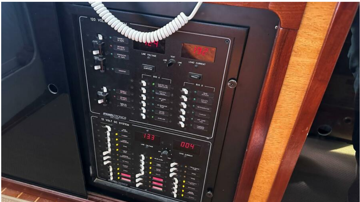
1078 Sally Lynn Electrical Panel