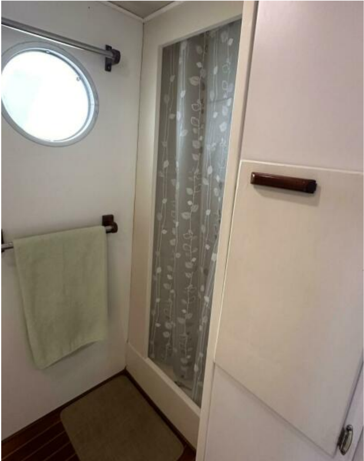
1066 Salley Lynn Shower