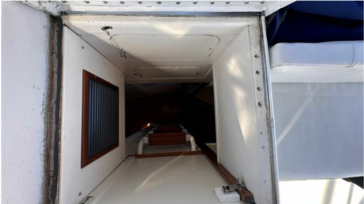
1044 Sally Lynn Companionway