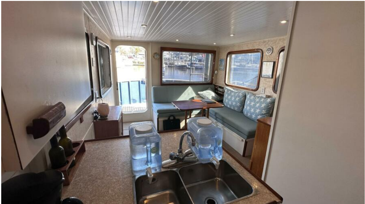
1052 Sally Lynn Salon Aft