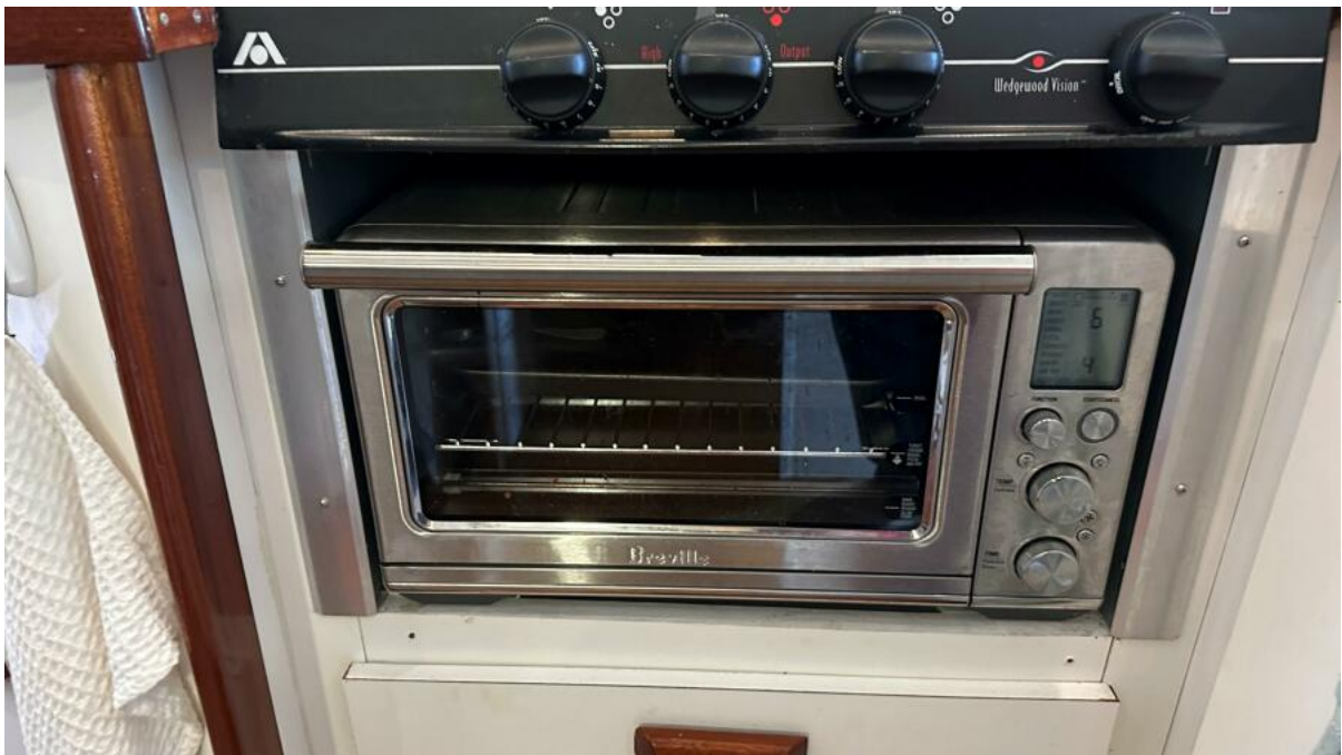
1060 Sally Lynn Smart Oven