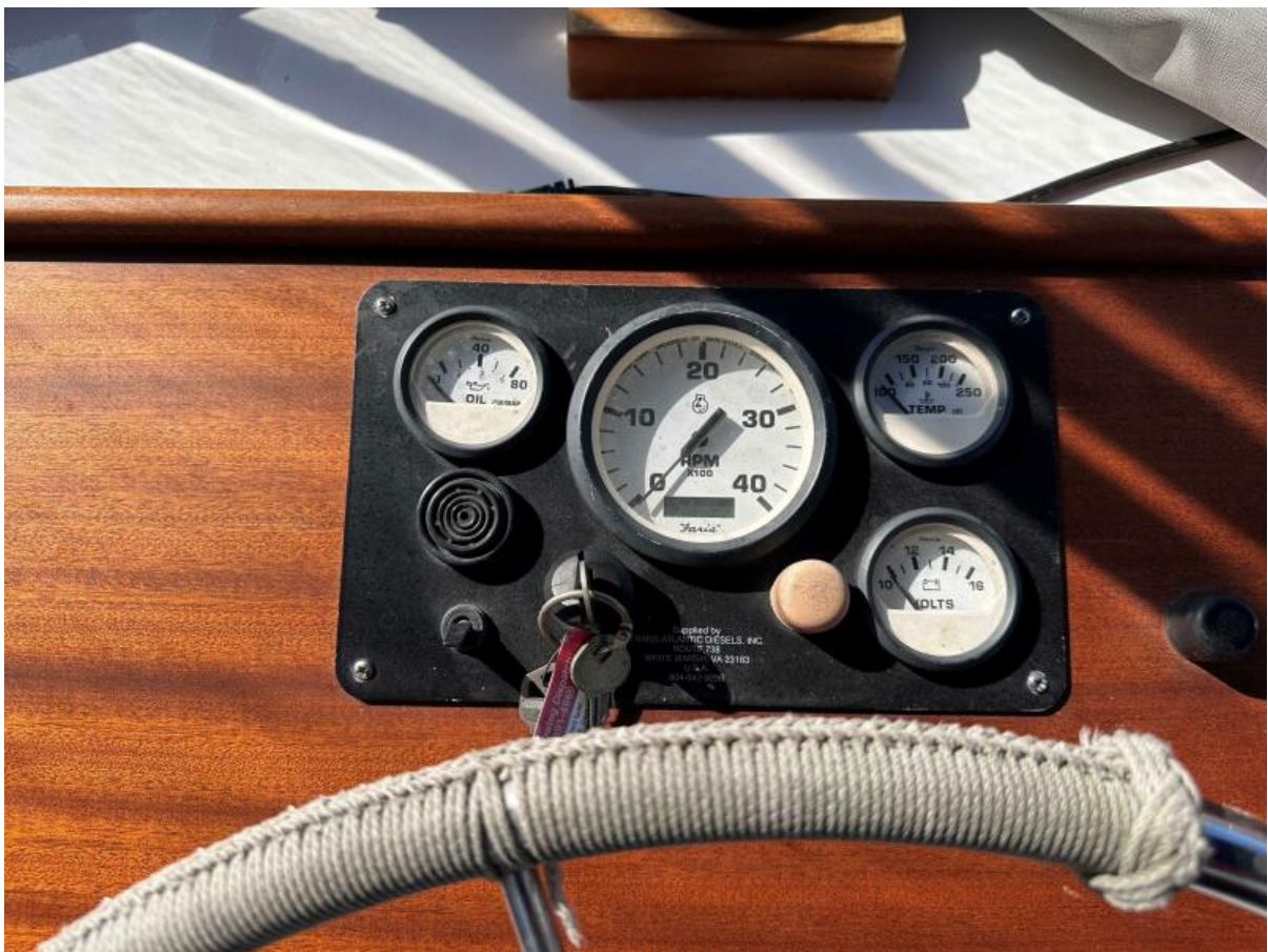
1038 Sally Lynn Upper Helm Gauges