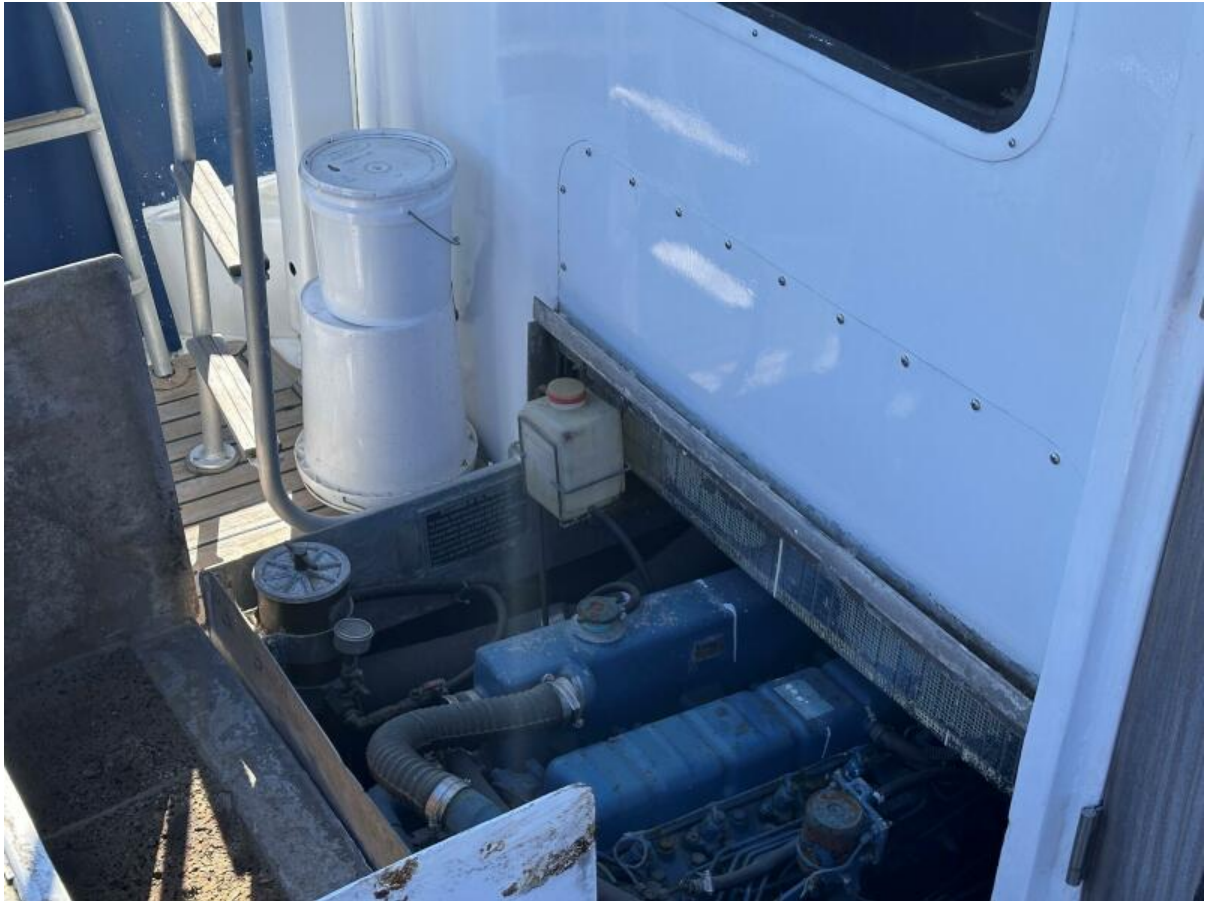
1096 Sally Lynn Engine Compartment