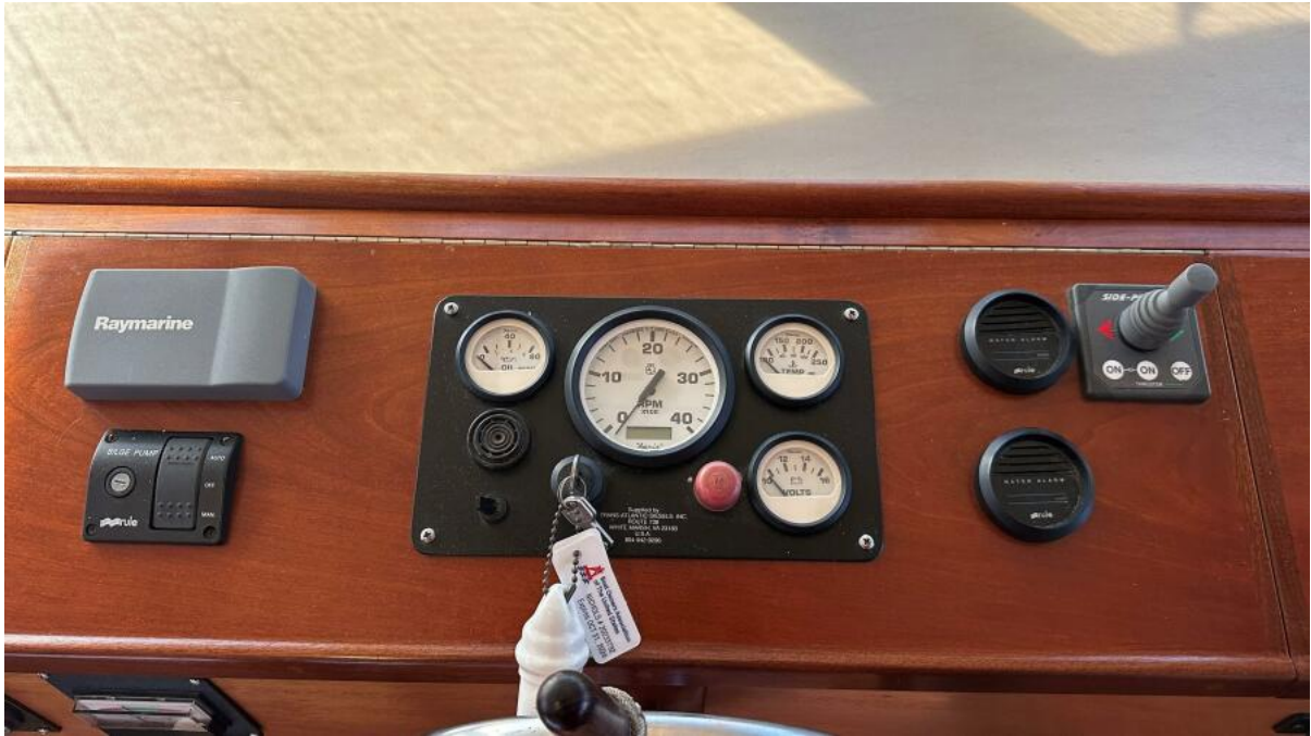
1073 Sally Lynn Lower Helm