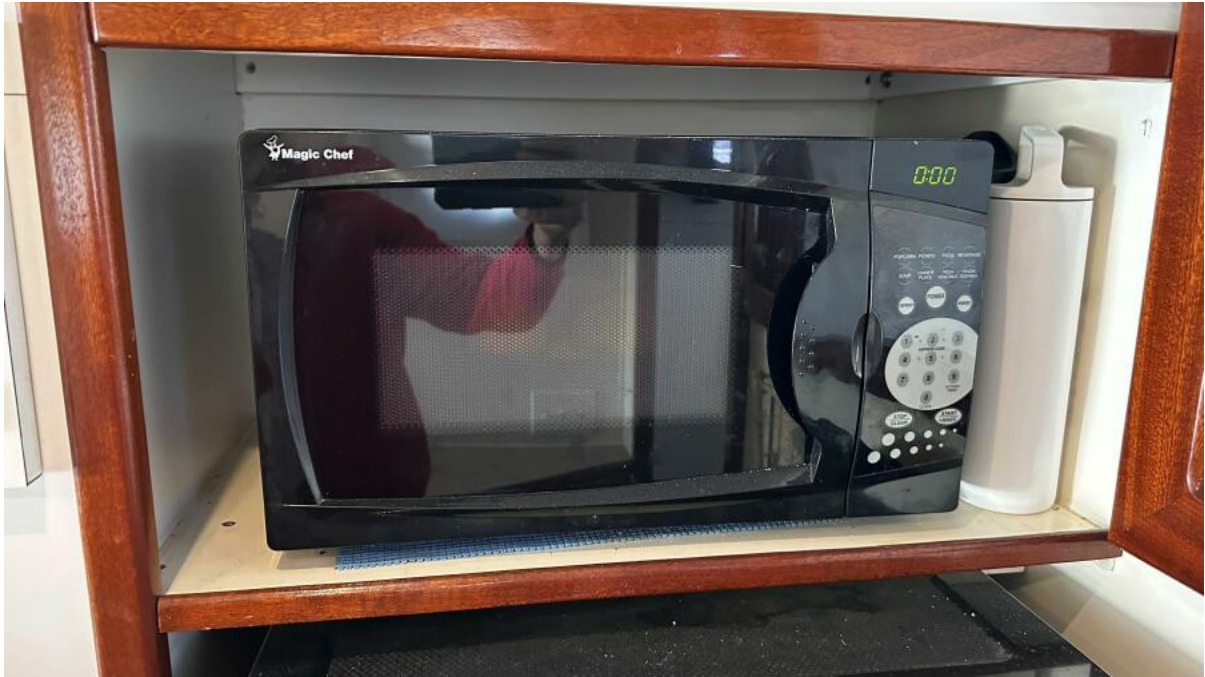
1062 Sally Lynn Microwave Oven