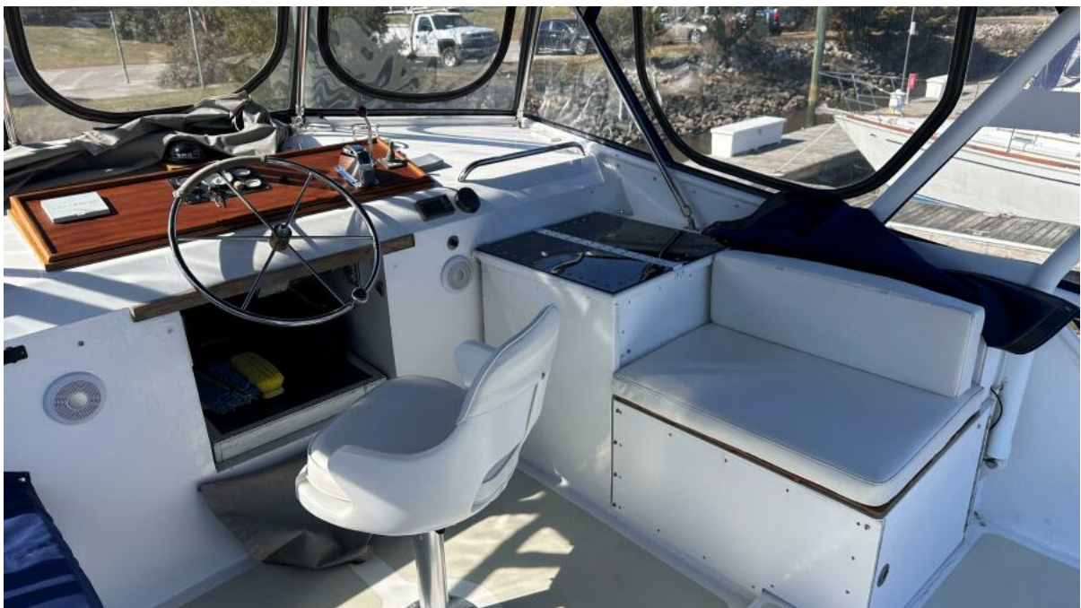
1035 Sally Lynn Flybridge