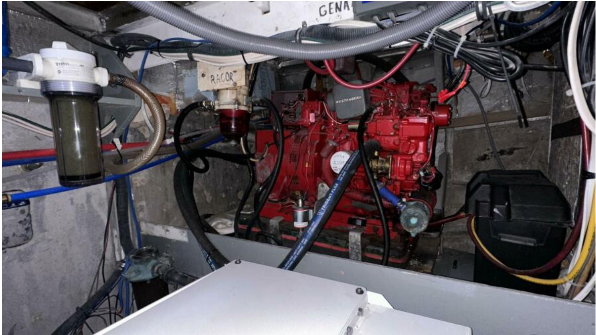
1092 Sally Lynn Generator