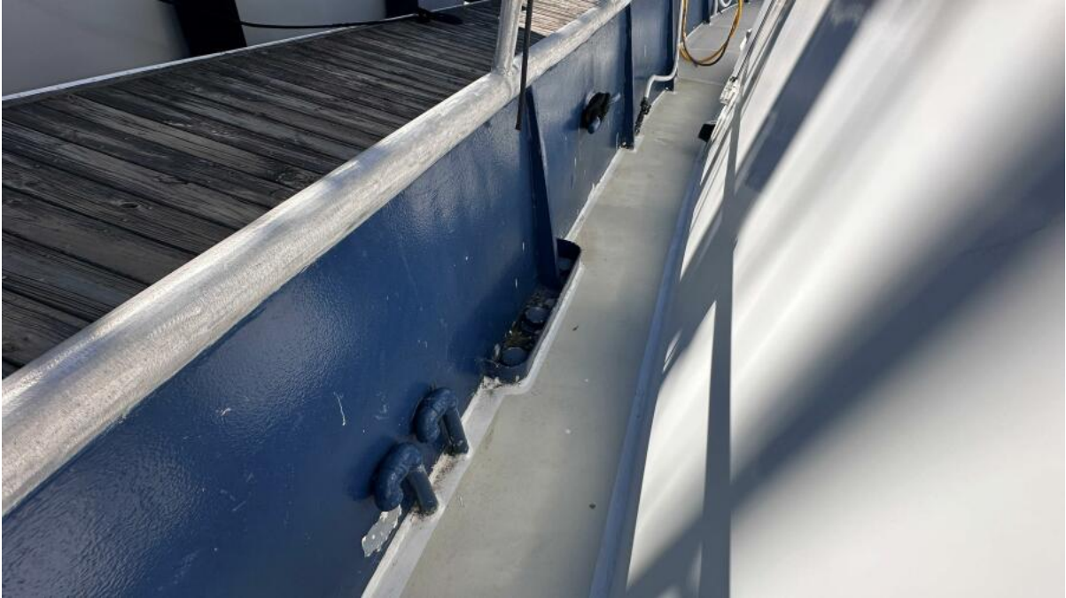
1018 Sally Lynn Sidedeck