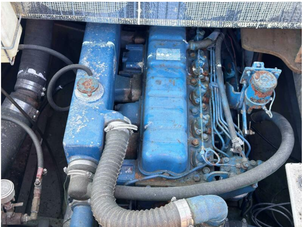
1098 Sally Lynn Engine