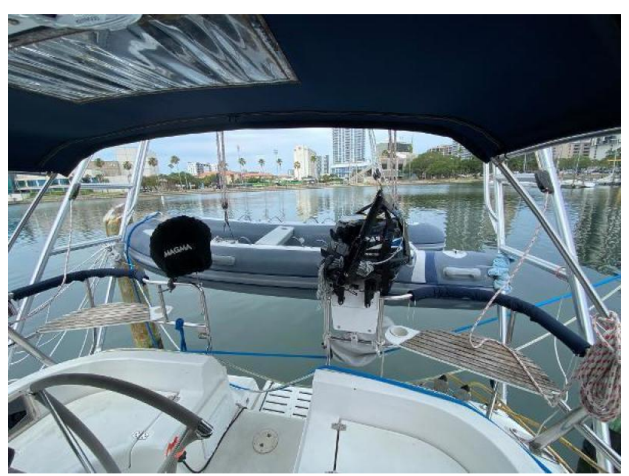
Tender not included