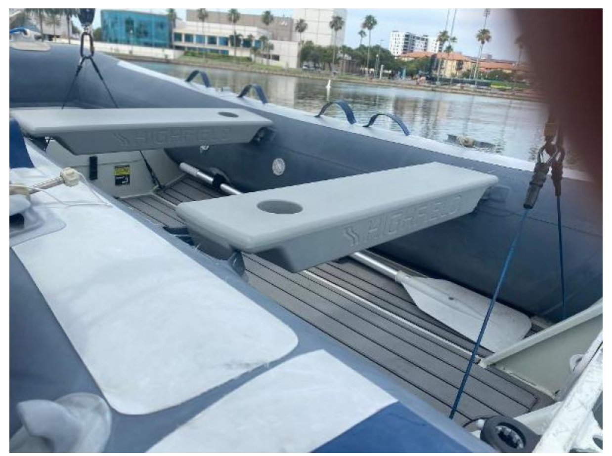
Tender not included