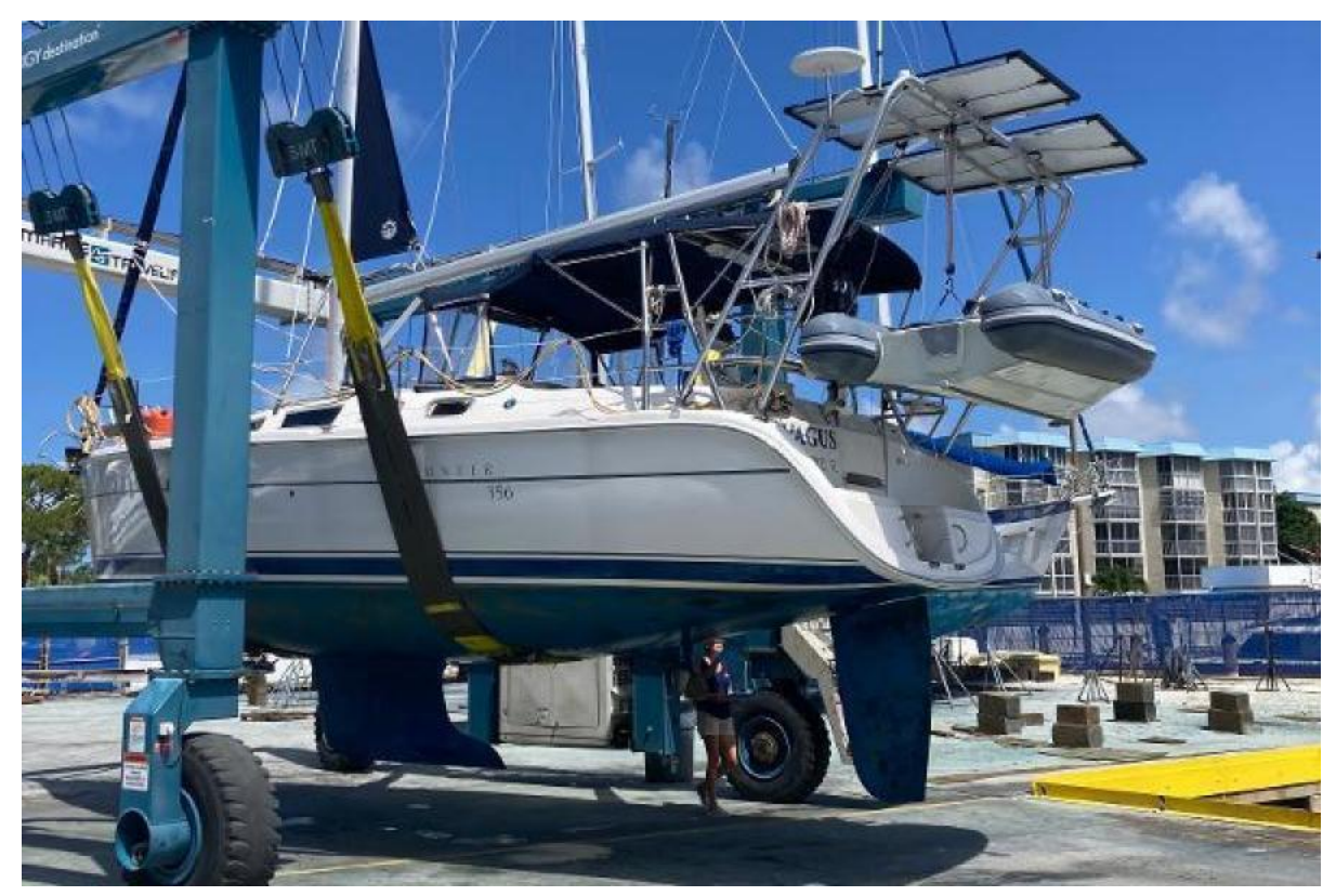
Tender not included