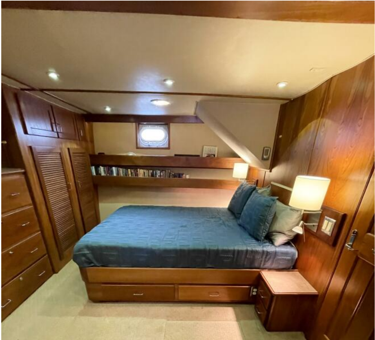
Owners suite 1