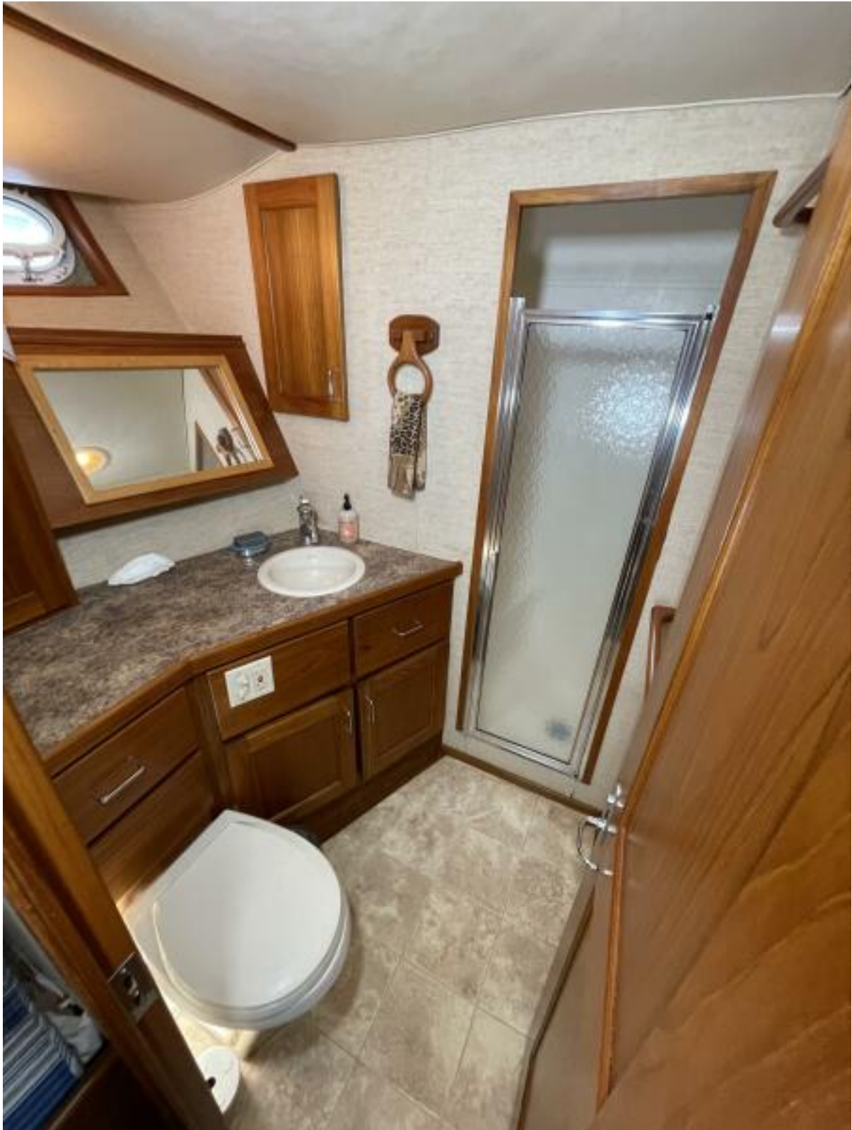
Port G strm ensuite head