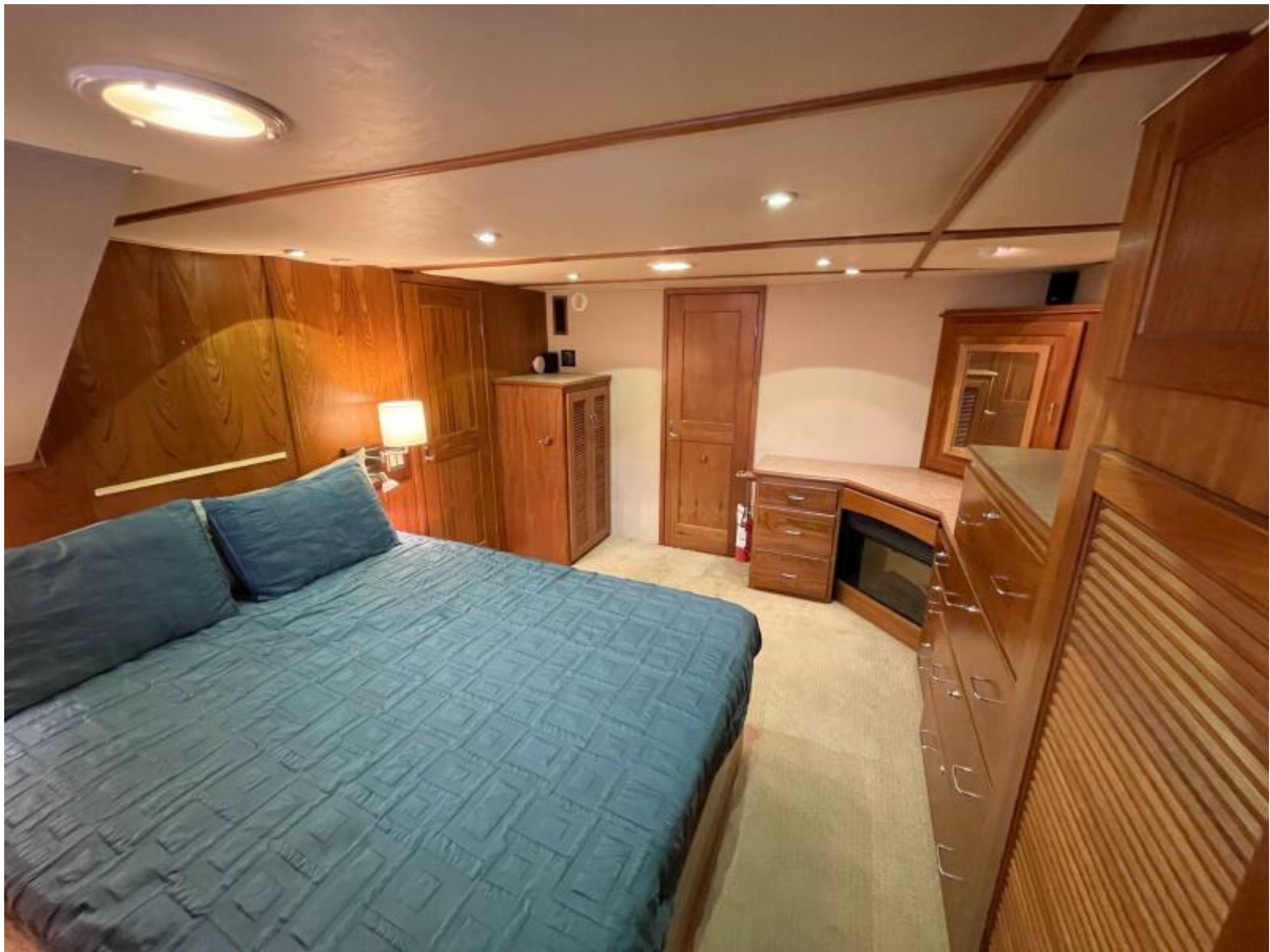
Owners suite 2