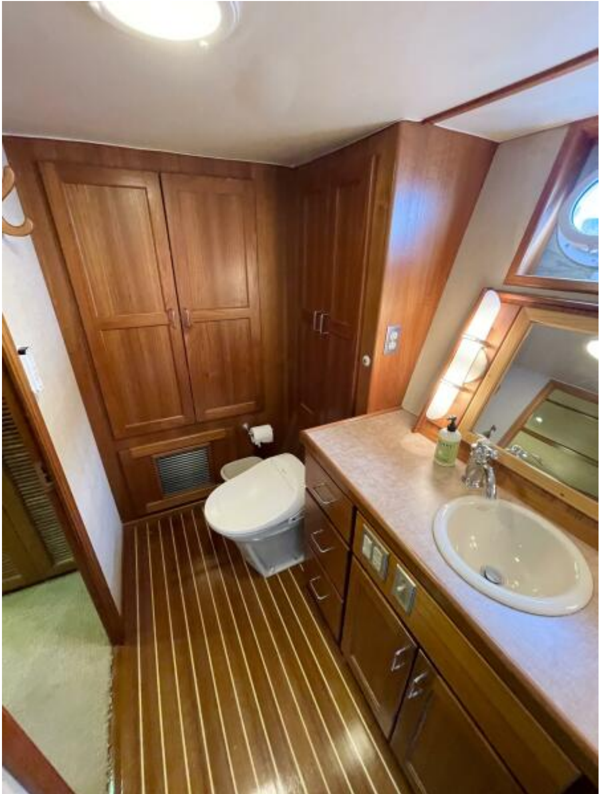
O Suite head 2