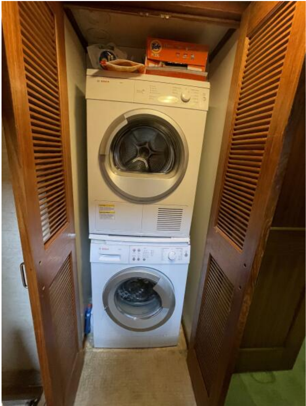
Foyer Washer Dryer