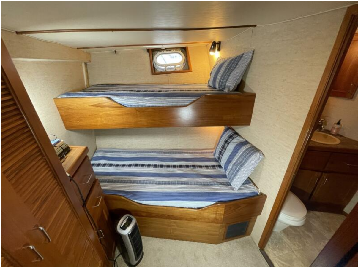
Port G Strm