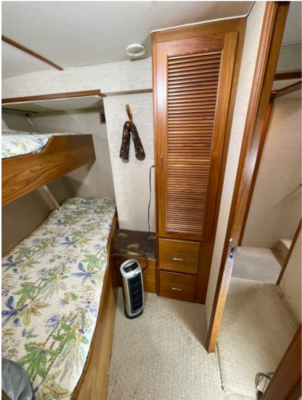
Stbd G strn 2