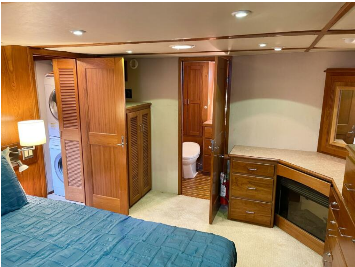
Owners suite 3