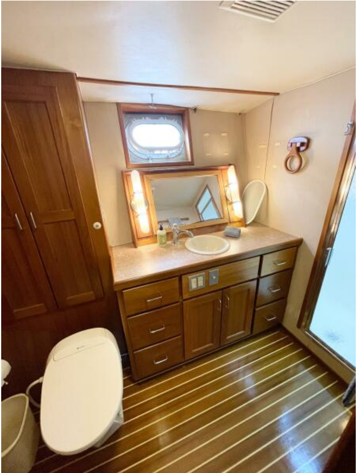
O suite head 1