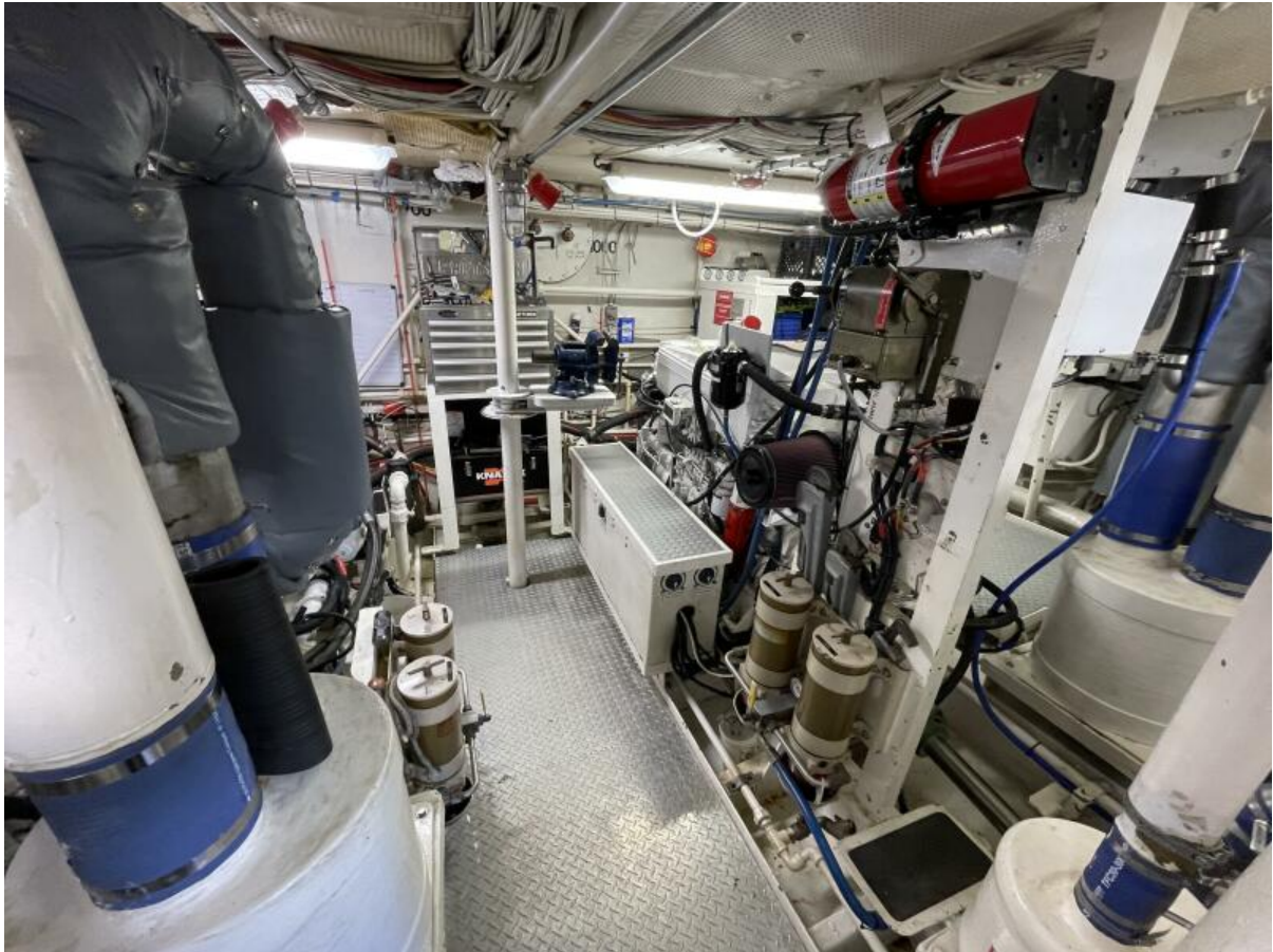
Engine room 1