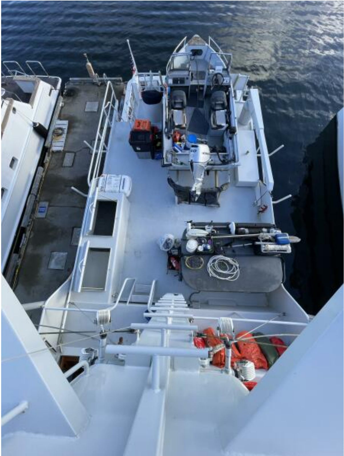
View from the Crows Nest