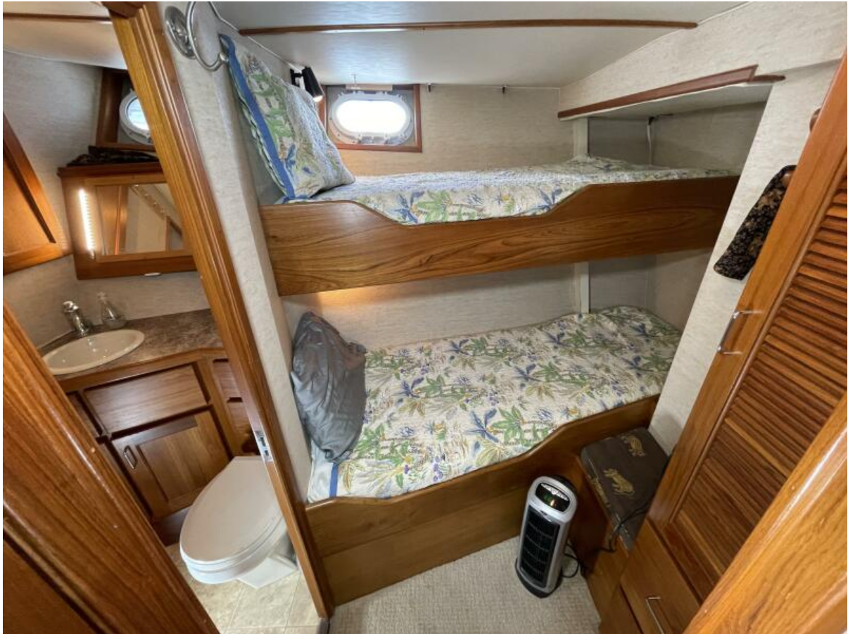
Stbd G strm 1