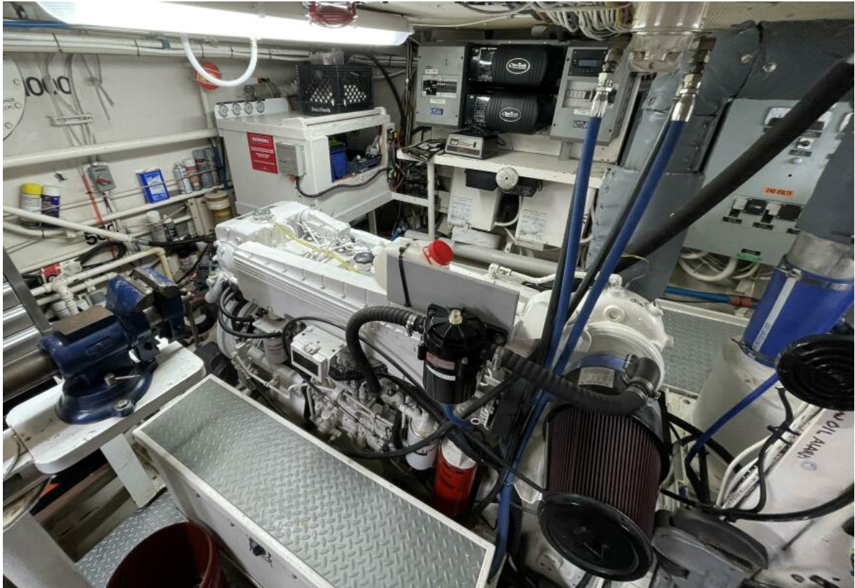
Stbd Lugger engine