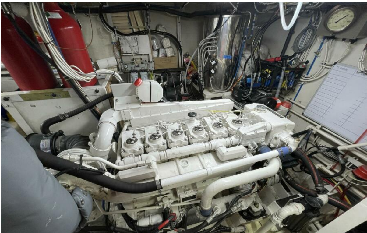
Port Lugger engine