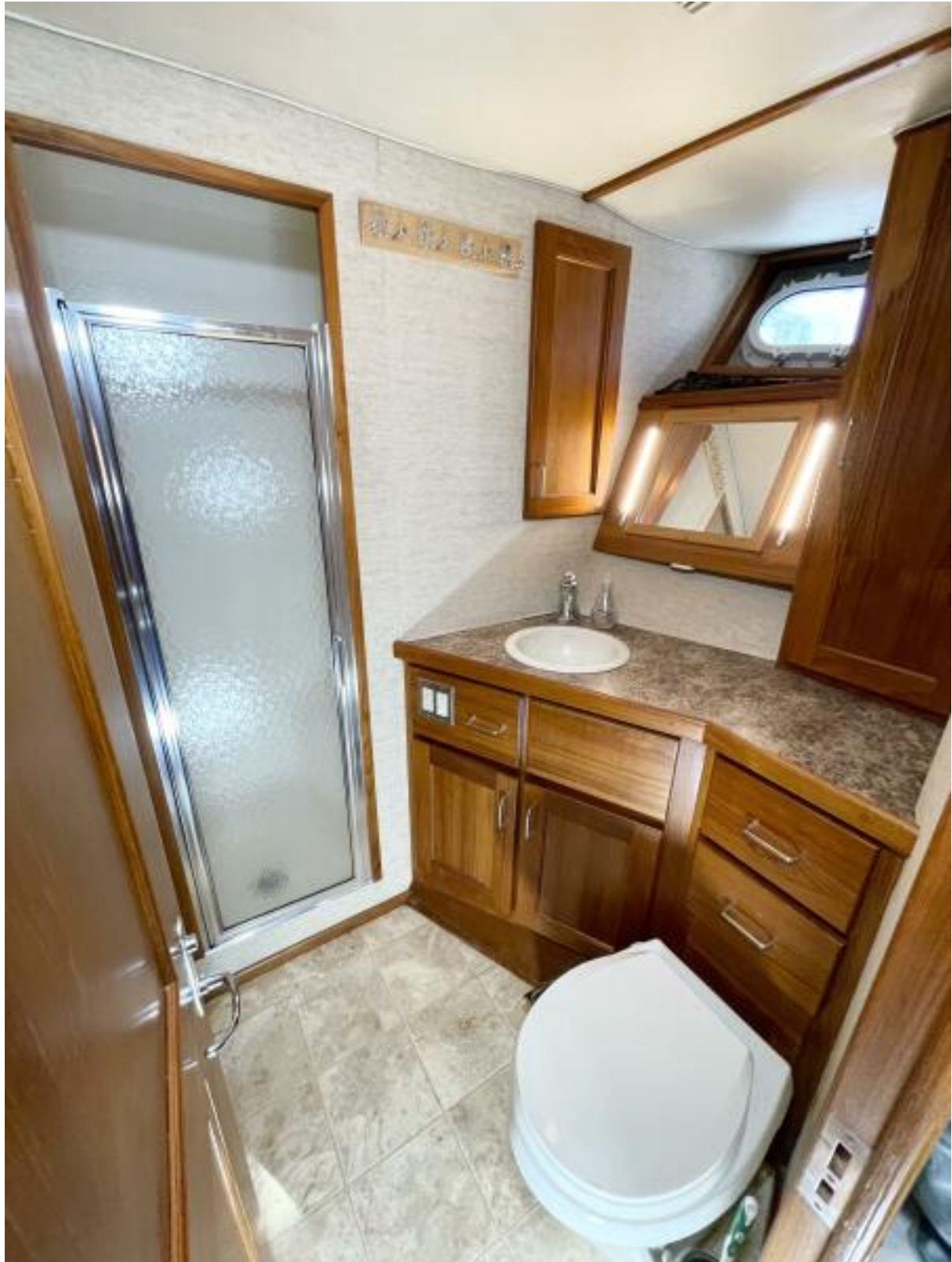
Stbd Guest head