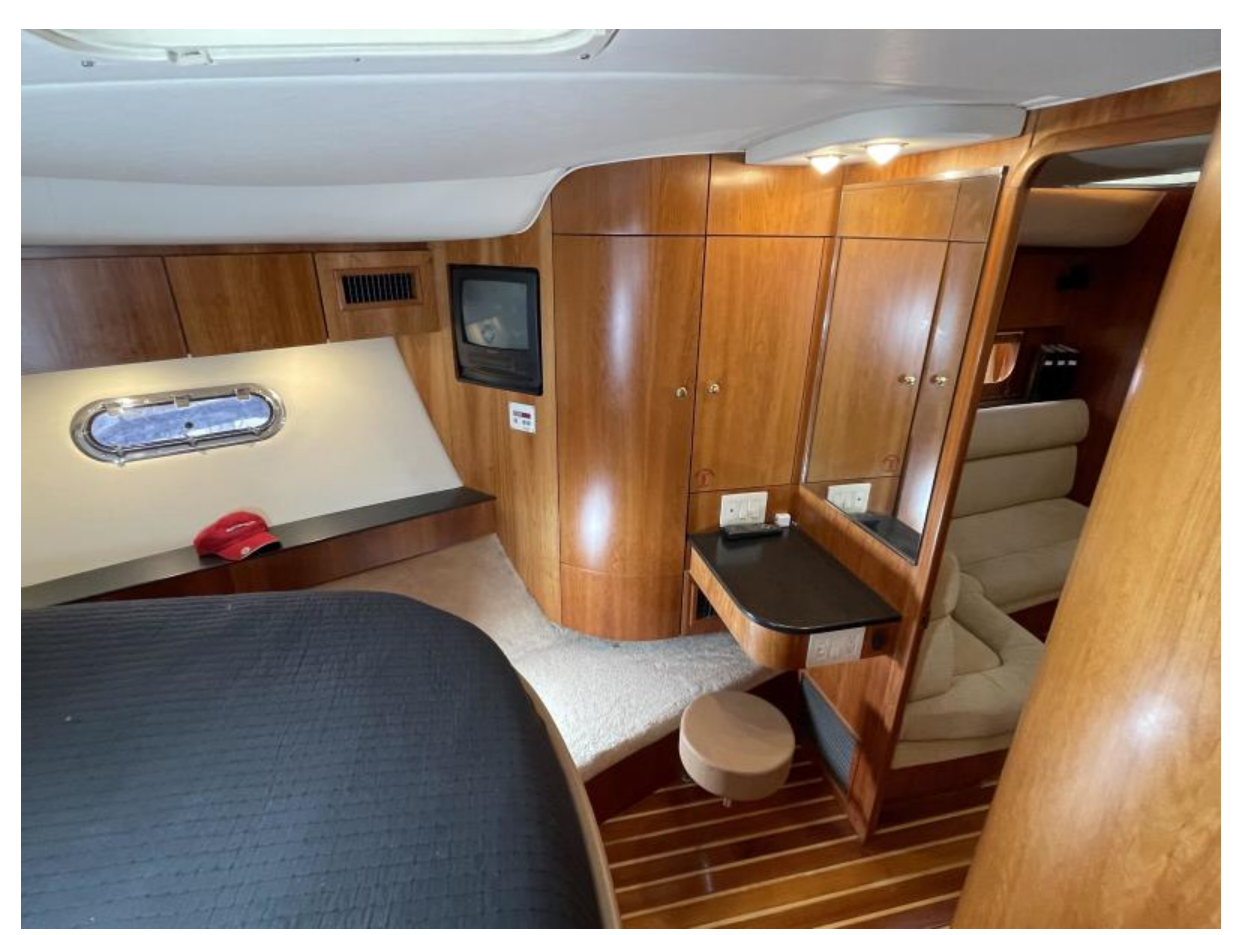
O suite 2