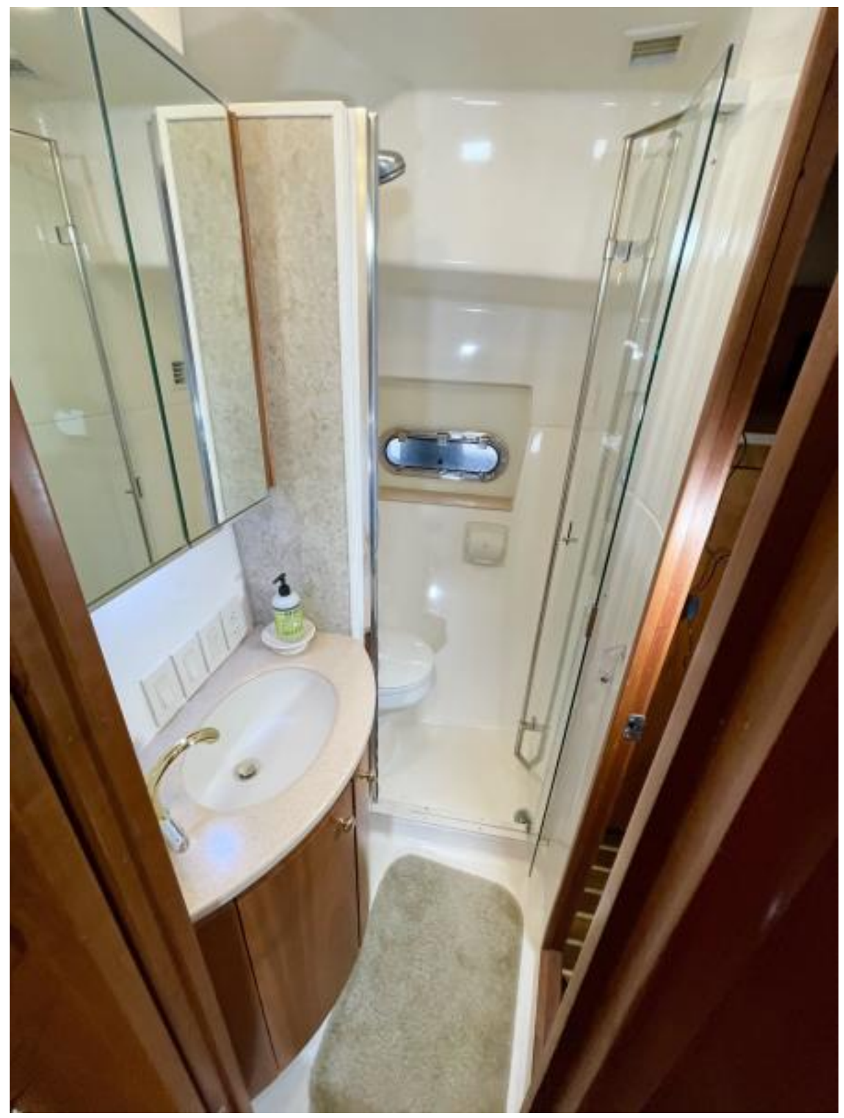
Guest head 2