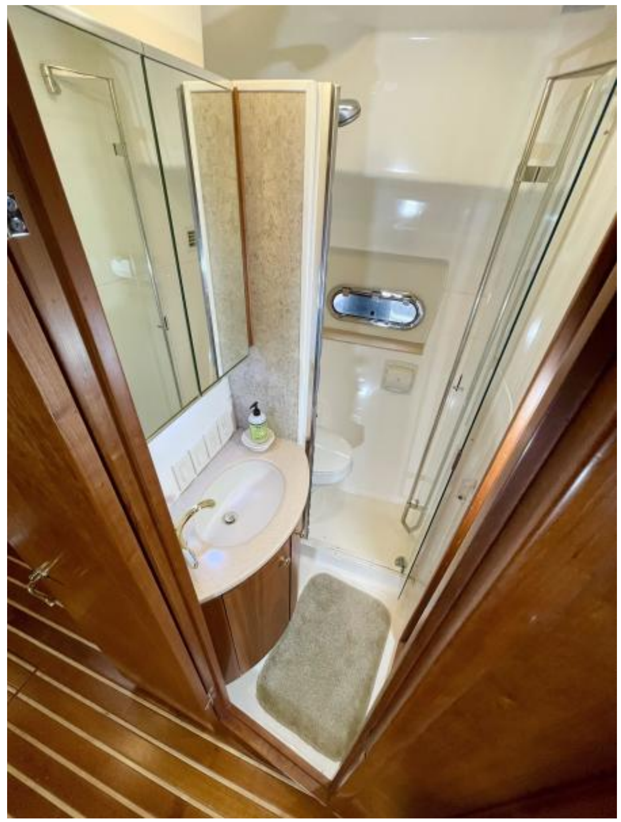
Guest head 1