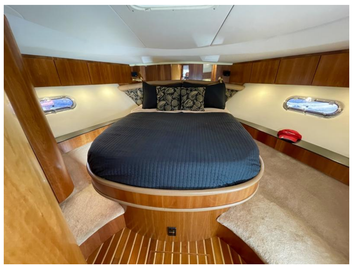
O suite 1