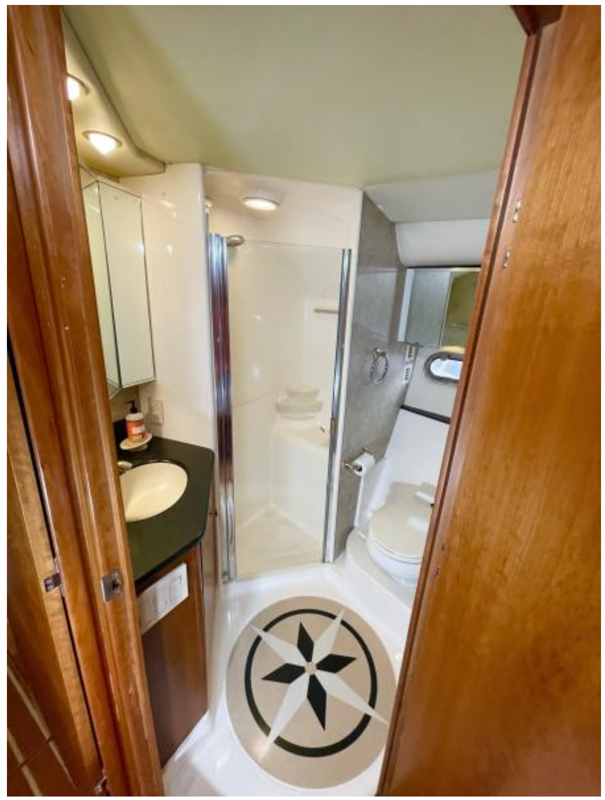
O suite head