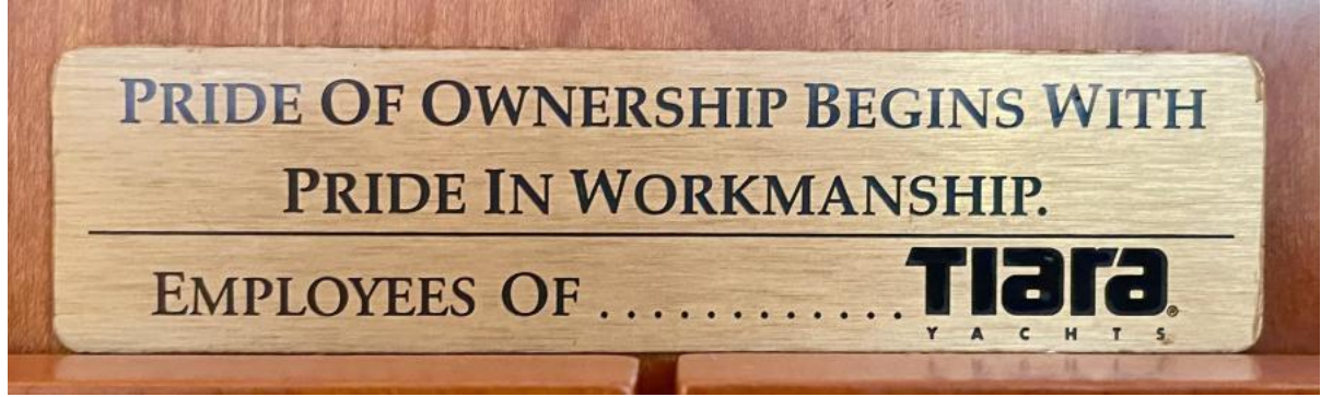
Pride of workmanship