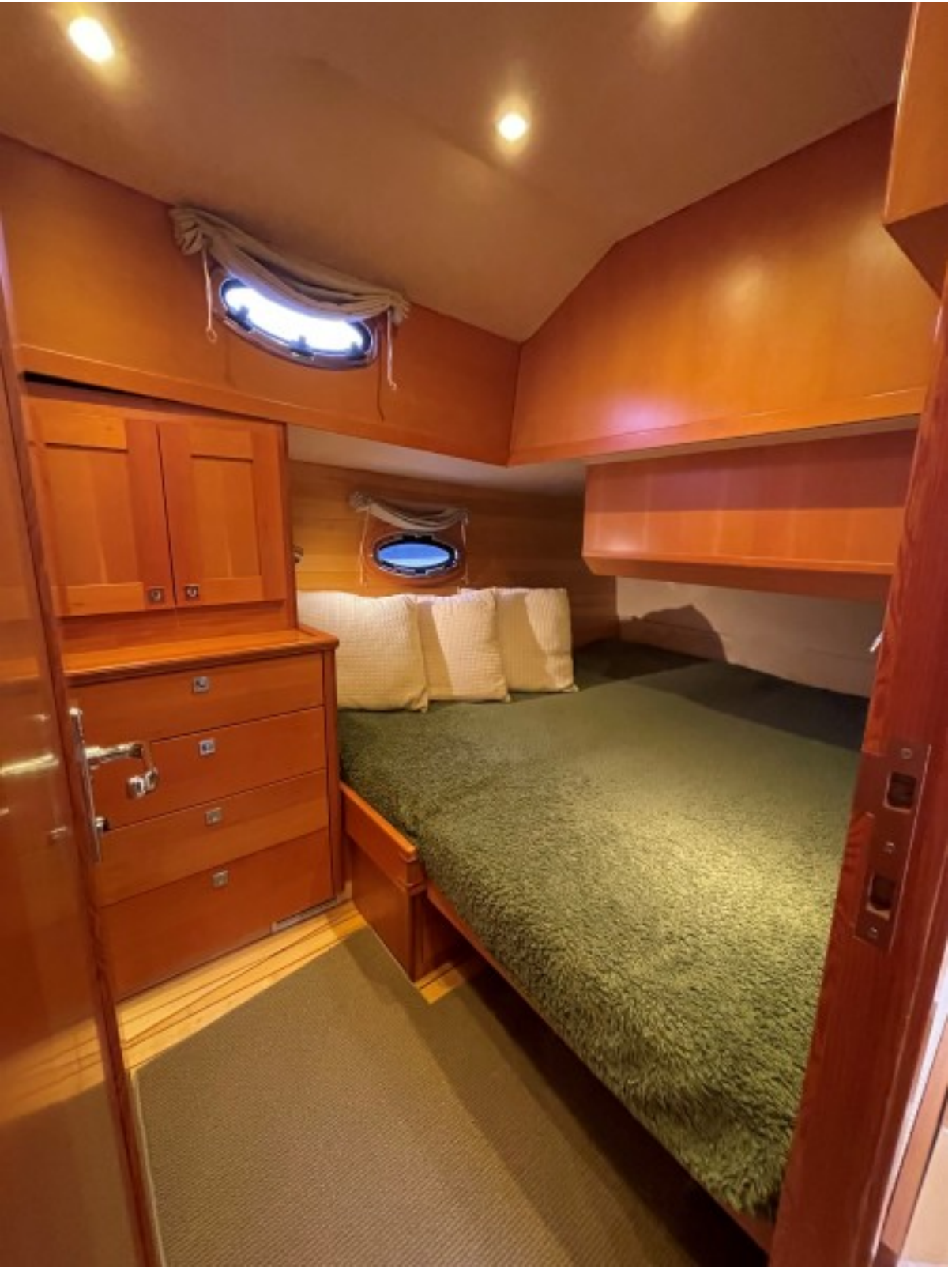
Stbd guest strm