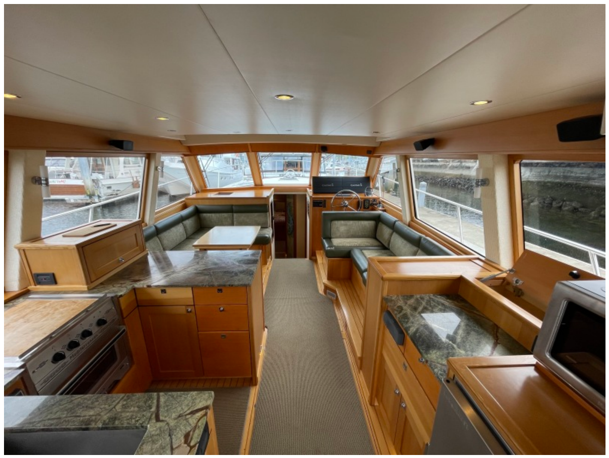
Salon looking fwd