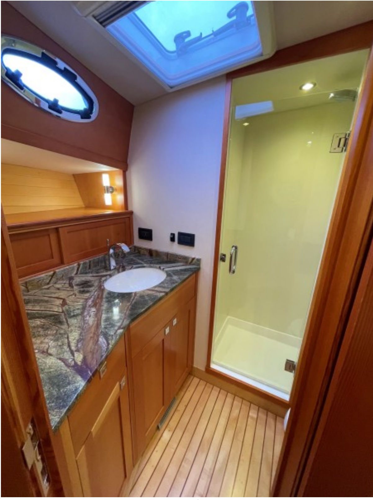
Owners suite 1