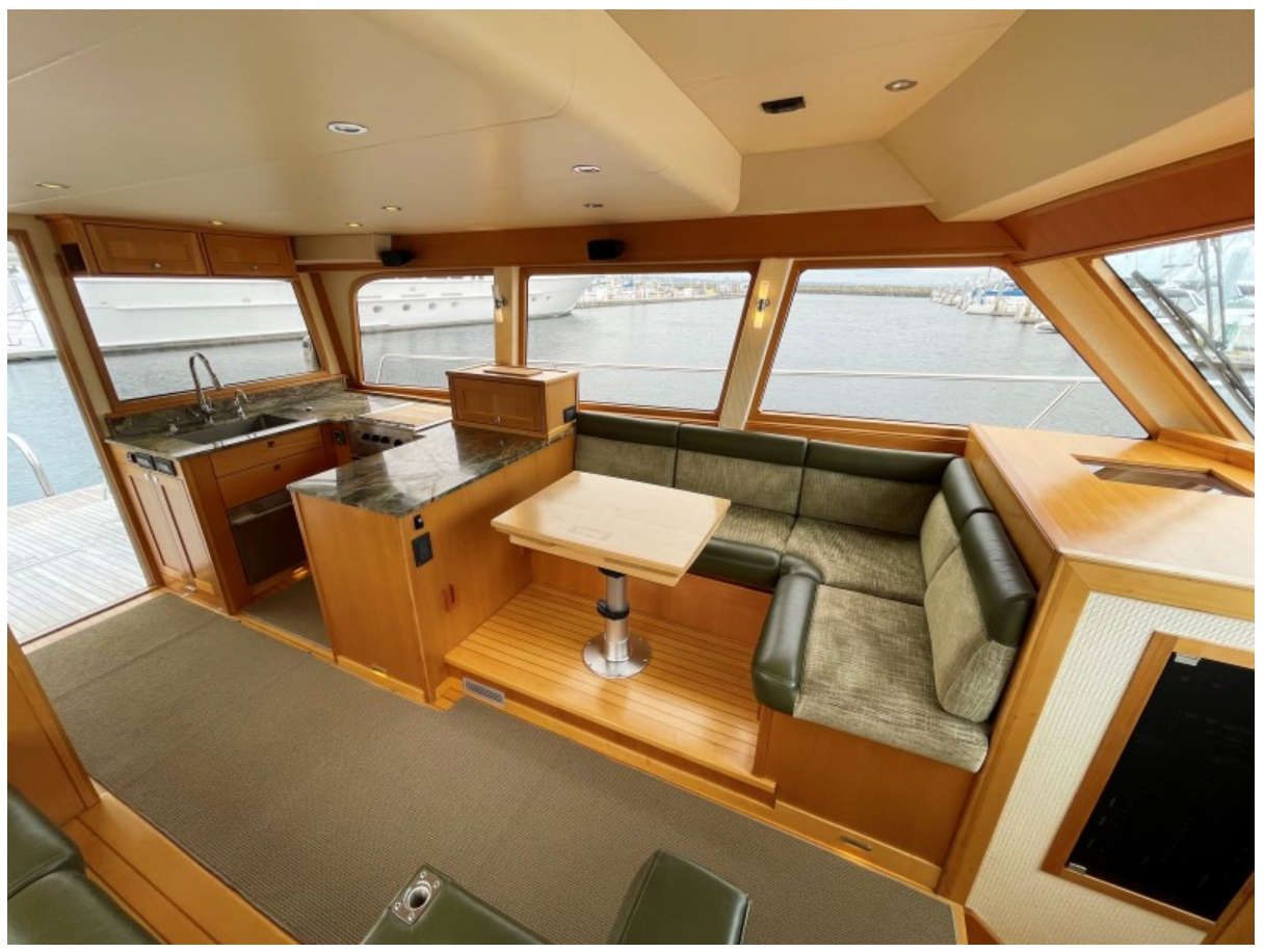
Port side salon