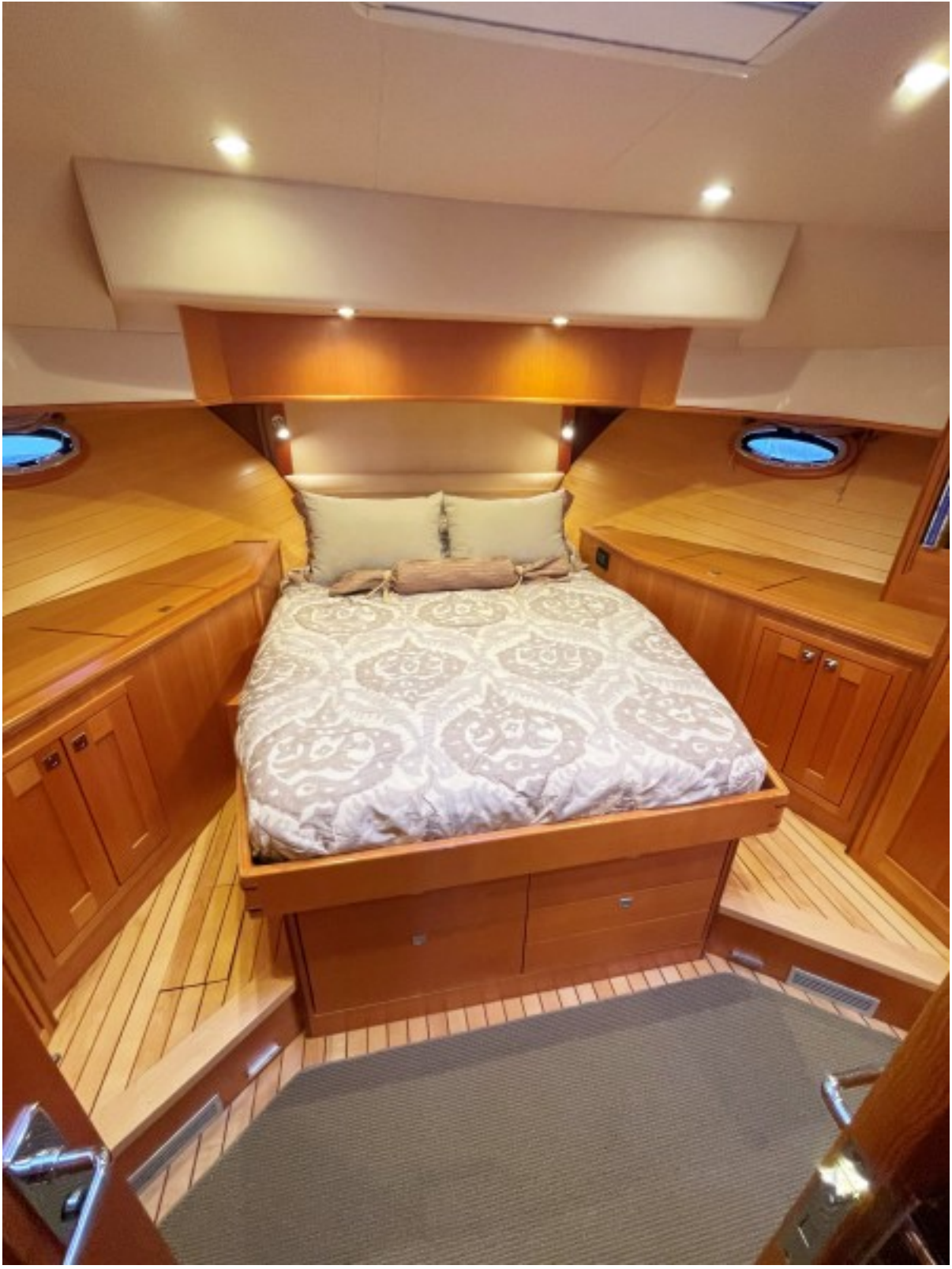
Owners suite 1