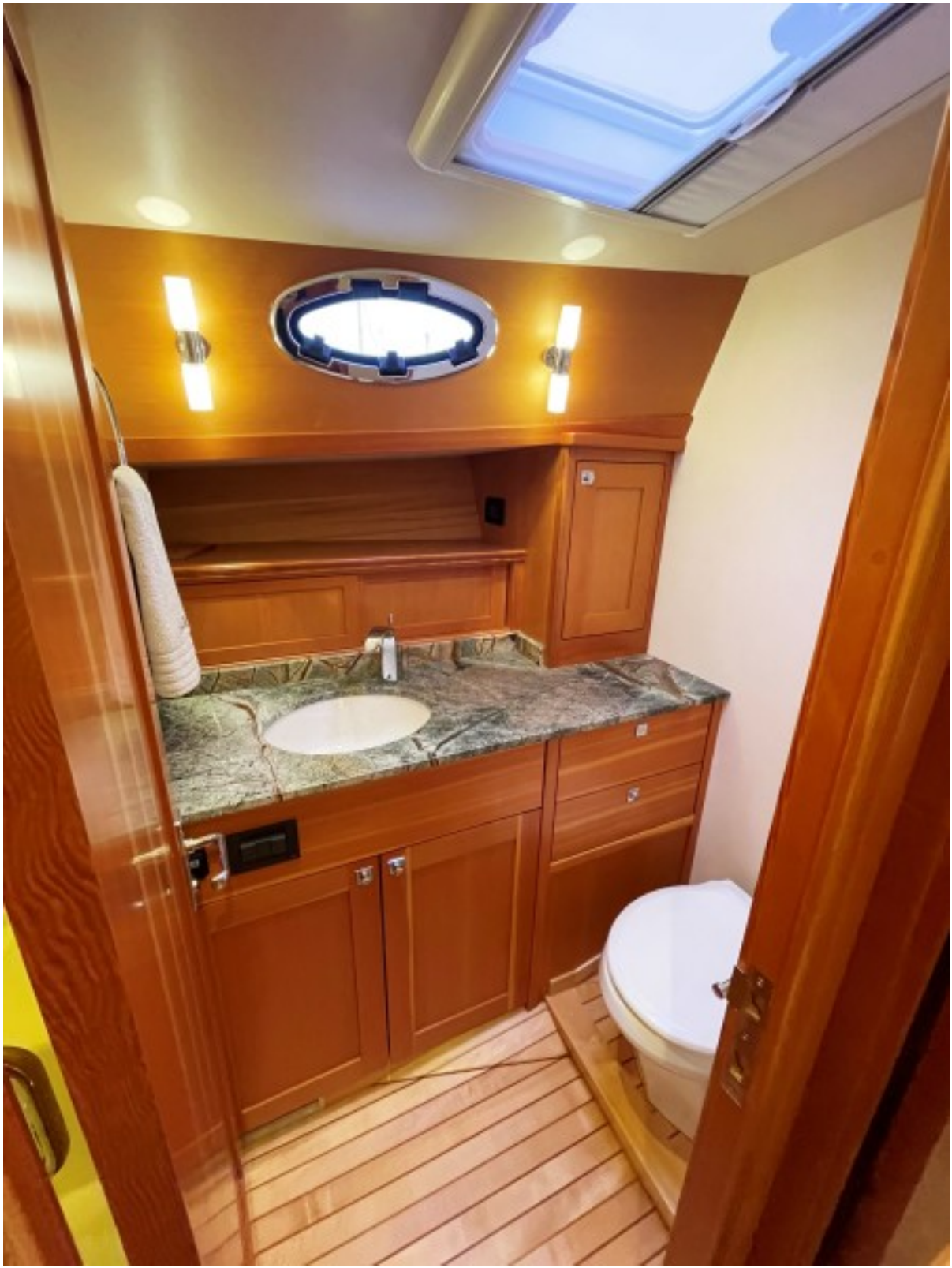
Guest head 1