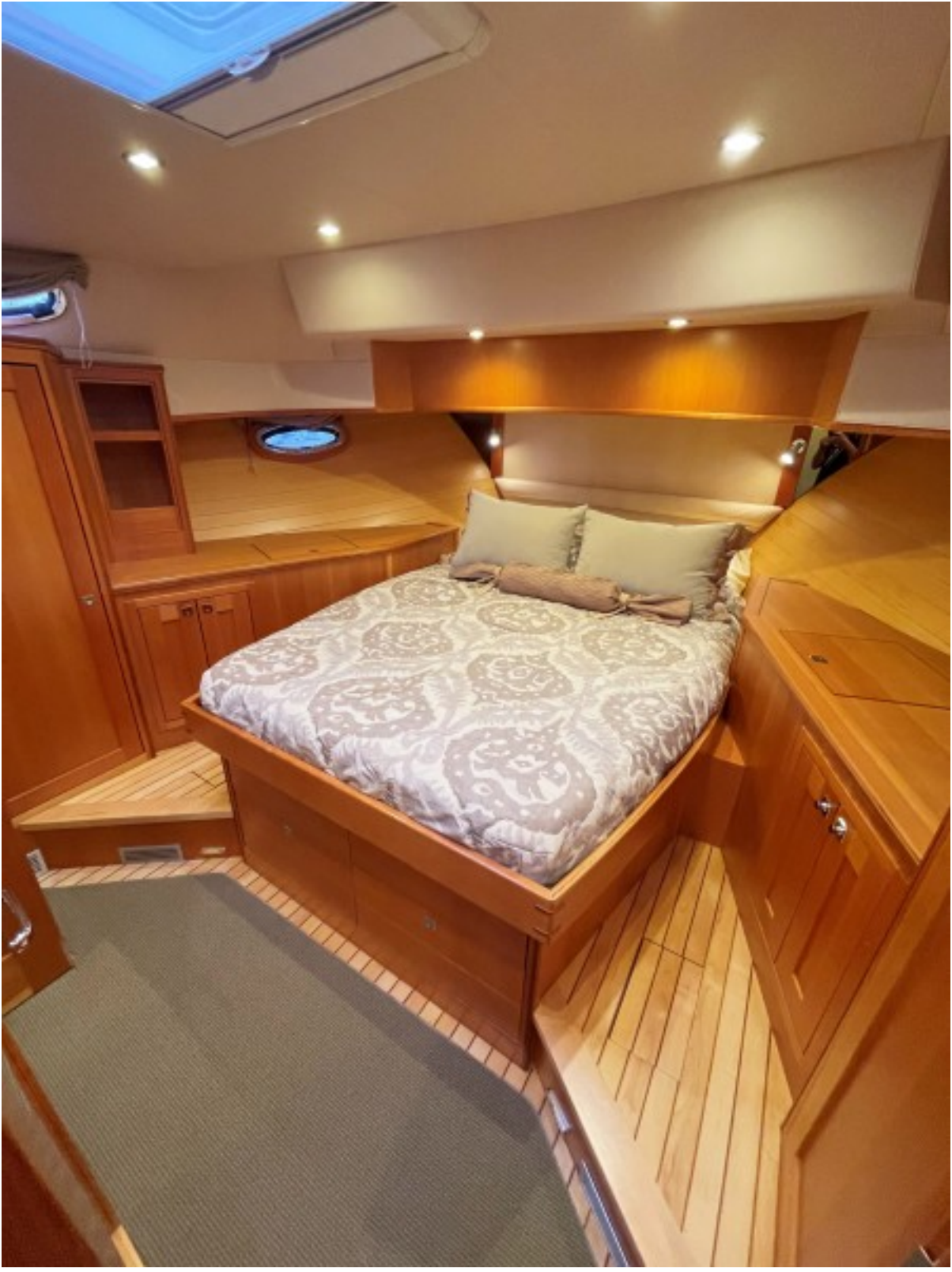
Owners suite 2