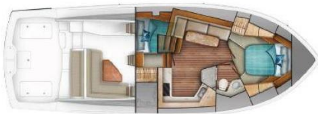
STANDARD 2 STATEROOM LAYOUT