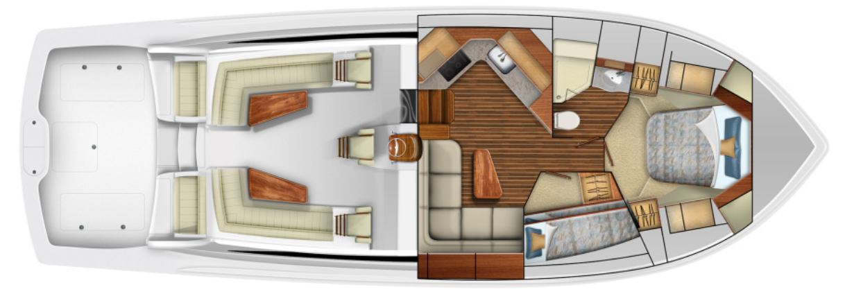
2023 Viking 48 Sport Coupe Accomodations