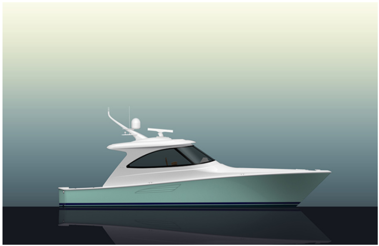
2023 Viking 48 Sport Coupe