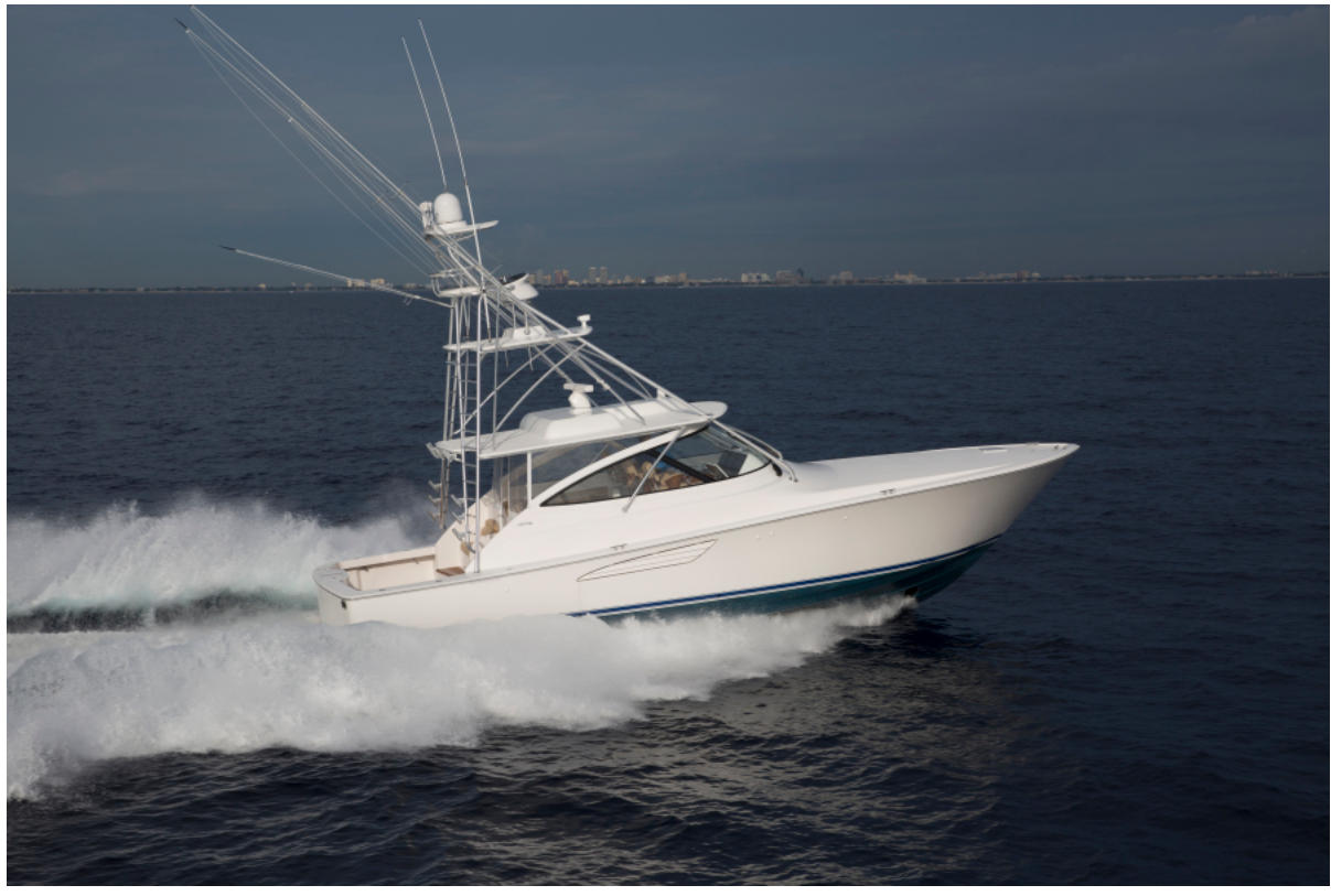
48 Viking Open